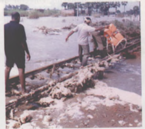
A railway track completely washed away

The data show that more than 75% of the affected communities in Tamil Nadu were patronising local co-operatives for the livelihood. In Andaman Nicobar Island, Central Tribal Co-operative patronised by more than 8000 tribal families lost civil infrastructure, liquid