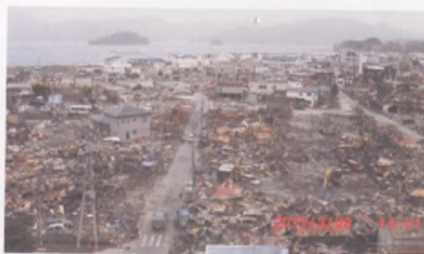
Once prosperous fishing town : when will it be when fishermen can resume normal life as before ?

“ Co-operative enterprises build a better world ”