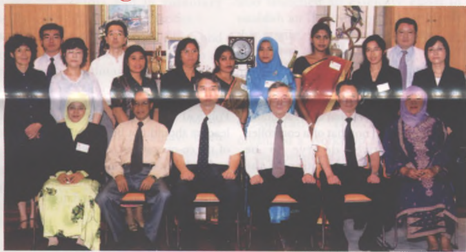
Participants of the 5th ICA/Japan Women Leaders Training Course

The International Co-operative Alliance-Asia Pacific (ICA-AP), in association with its member organisation in Japan, the Central Union of Agricultural Co-operatives of Japan (JA-Zenchu) and the Institute for the Development of Agricultural Co-operation in Asia (IDACA) organised the 5th ICA-Japan Training Course for "Strengthening Women's Agricultural Co-operatives in Rural Areas and Improvement of Farm Management and Rural Life" in Malaysia and Japan. Eight participants - two each from Indonesia, Malaysia, Philippines and Sri Lanka, attended the Training Course. The Course was organised and held by the ICA at the IDACA premises from 4th to 28th September 2005. The 10-day component of Comparative Field Study Visits was held in Malaysia from 25th August to 3rd September in collaboration with the National Co-operative Organization of Malaysia (ANGKASA). The program is funded by the Government of Japan in the Ministry of Agriculture, Forestry and Fisheries.