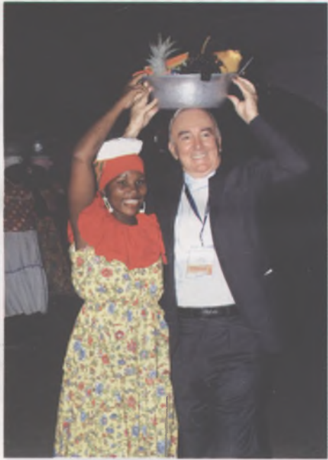
The ICA President carrying a fruit basket at the Reception

Several sectoral organizations and thematic committees also met during this period. Elections were also held to the ICA Board and a list of new ICA board members are given as follows: