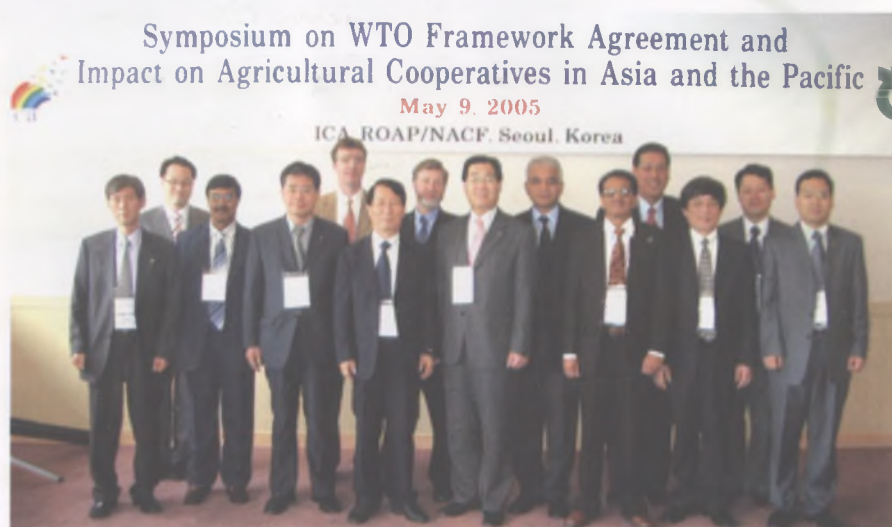
Delegates at the symposium

Both positive and negative implications for co-operatives were