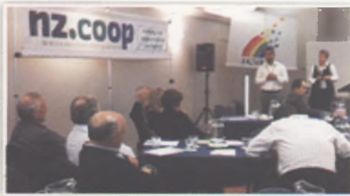
The seminar in progress

With attendees arriving from as far away as Bangkok, over 50 people from more than 20 co-ops descended on Wellington, New Zealand at the end of August for a two day seminar. Speakers came from Canada and Western Australia as well as New Zealand to talk on "The Evolving Nature of Governance and Capital in Co-operative and Mutual Business".