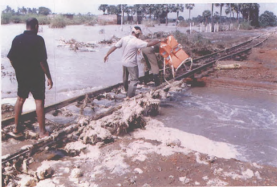
This what is left of a railway track