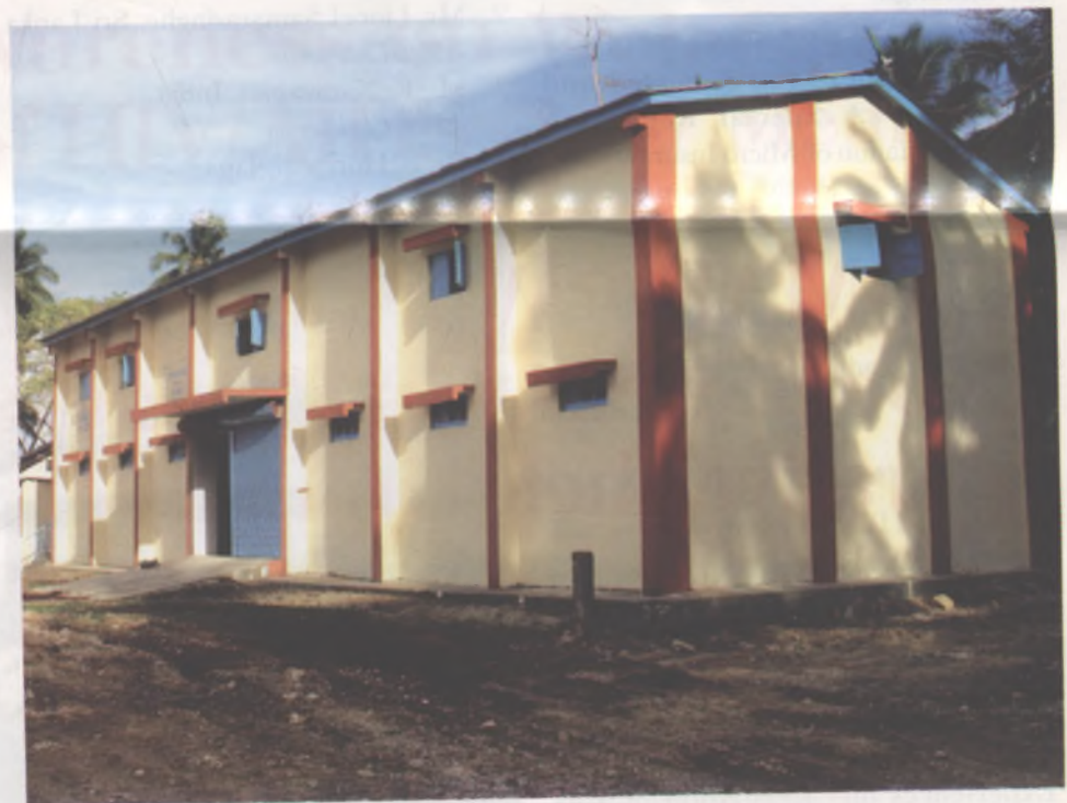
Newly built facilities in Cuddalore, India

The ICA-AP shall ever remain indebted to the international co-operative fraternity for their act of exemplary solidarity.