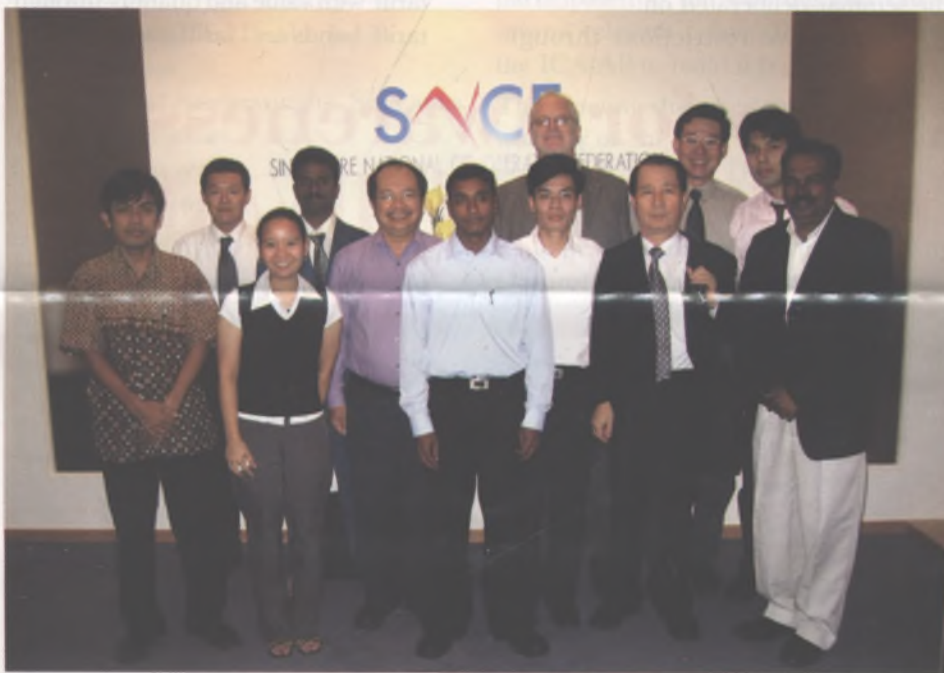
The youth delegates with the 'not-so-youth' at the Singapore meeting

The ICA Asia-Pacific held a meeting of the Youth Steering Committee in Singapore, 15-16 July, 2005. The