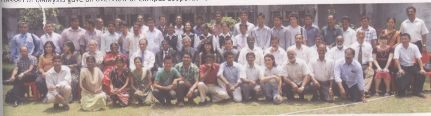
A group photo of the participants

The workshop concluded by award of certificate to the participants.