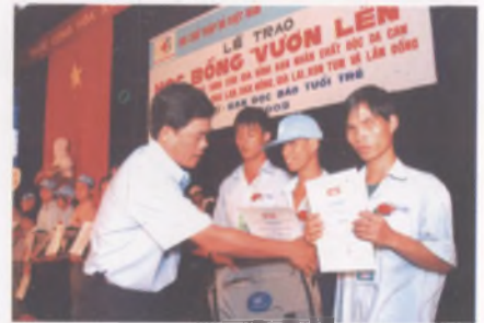
Representative of Saigon Co-op offers school bags and books for the pupils in orange-agent victim families

After the blood donation, a solemn meeting was held with the participation of more than 300 representatives from other co-operatives in other fields in HCMC and representatives of Saigon Co-op management and staff. At the meeting, the message from the Union of International Co-operatives was read. Also at the meeting, other