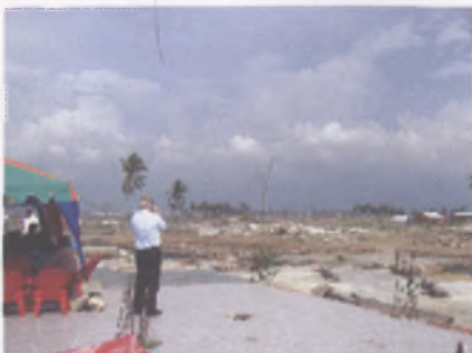
A scene from Nias