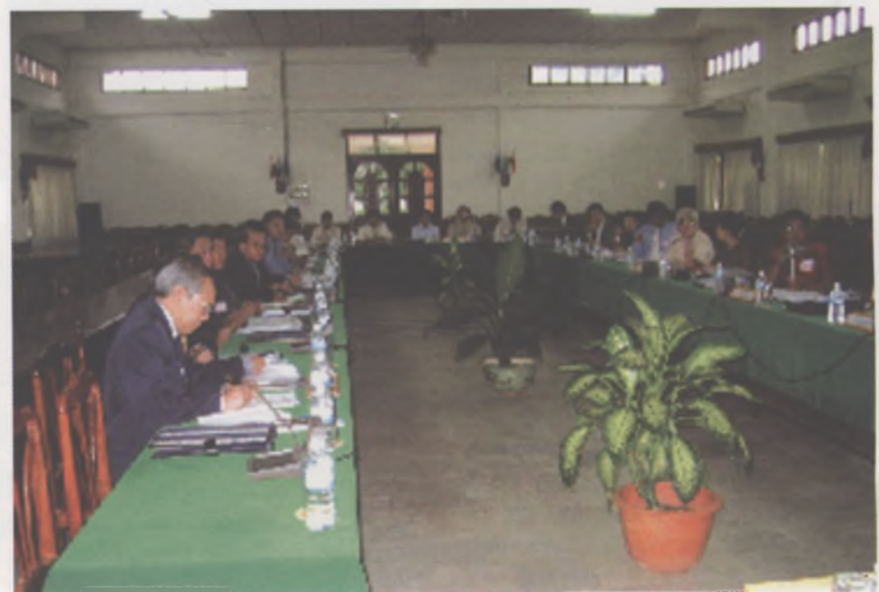
The workshop in progress