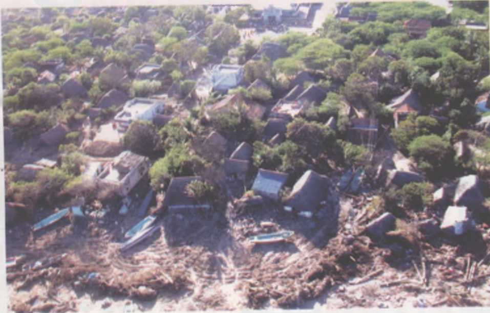
The ravaged coast in Tamil Nadu

Temporary shelters, drinking water, safe defecation and sanitation and road reconstruction were the top priorities of the Tamil Nadu State Government and it has really done wonders in terms of commutation and connectivity.