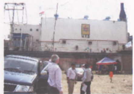
A ship washed away on the road several kilometers from sea in Aceh

The President has requested all collaborating donor agencies for their urgent support and instructed