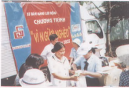
Mobile selling to remote areas is frequently organised by Saigon Co-op

Careful development of fresh and processed, ready-to-eat foods which are more and more diversified and are guaranteed of strict hygienic and absolute food safety standards for the consumer. In addition, in order to create a close bond with customers, a special program was launched for membership customers with incentives like birthday gifts, bonuses on annual total invoices, and discounts and gifts every month. Moreover, we have many customer care services such as telephone sales, and home delivery without additional costs. The Saigon Co-op chain also often organizes mobile sales units to bring essential commodities at cheap prices to drug rehabilitation centers (these centers are operated by the city at different provinces), and hospitals.