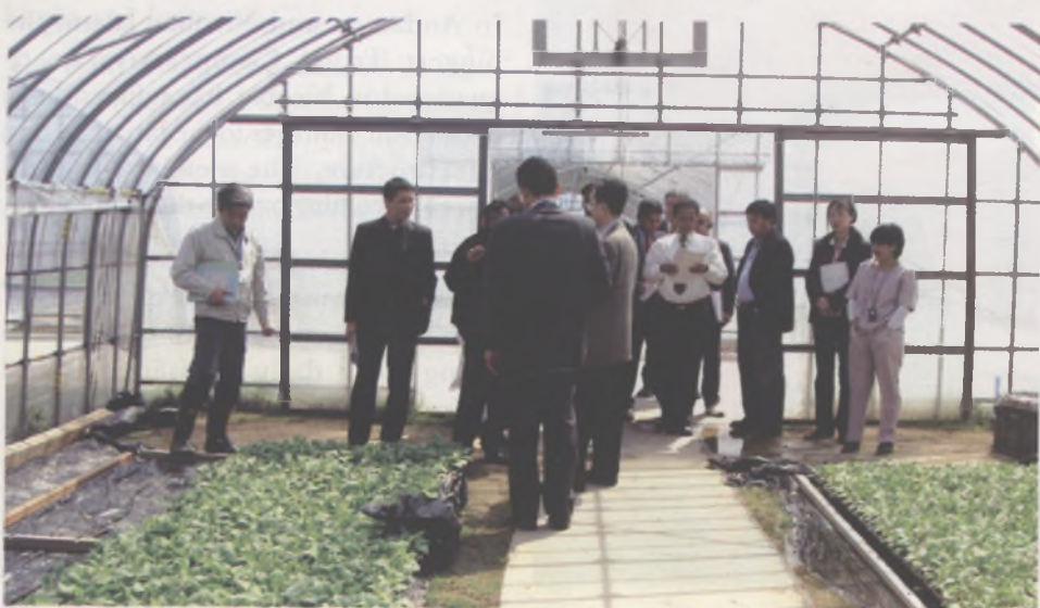
Participants in a Green House in Shimane prefecture

The Certificates of Participation from the ICA as well as from the IDACA were awarded to the participants at the end of the concluding session.