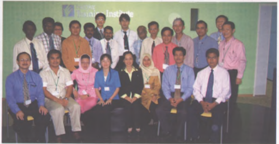
The participants of the workshop at the NTUC Fair Price

The workshop was divided into three types of sessions, class room lectures, study visits and presentations. In the classroom session, participants learned the knowledge and skill of managing consumer co-operatives. Next day, they visited NTUC Fairprice stores and its competitors and they were exposed to the severe