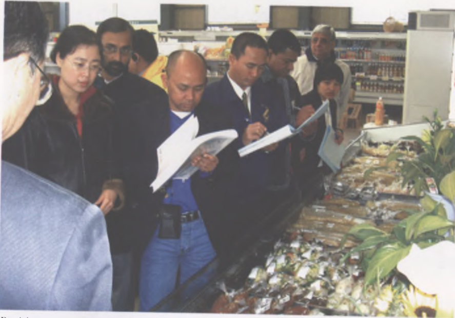
Participants at a Farmers' Direct Sale Shop in Iwate prefecture

to the participants on successful completion of the training course. He has noted the various comments and suggestions made by the participants in the evaluation report and said that these comments encouraged the staff of IDACA and himself personally and will enable the IDACA to improve this course in the future.