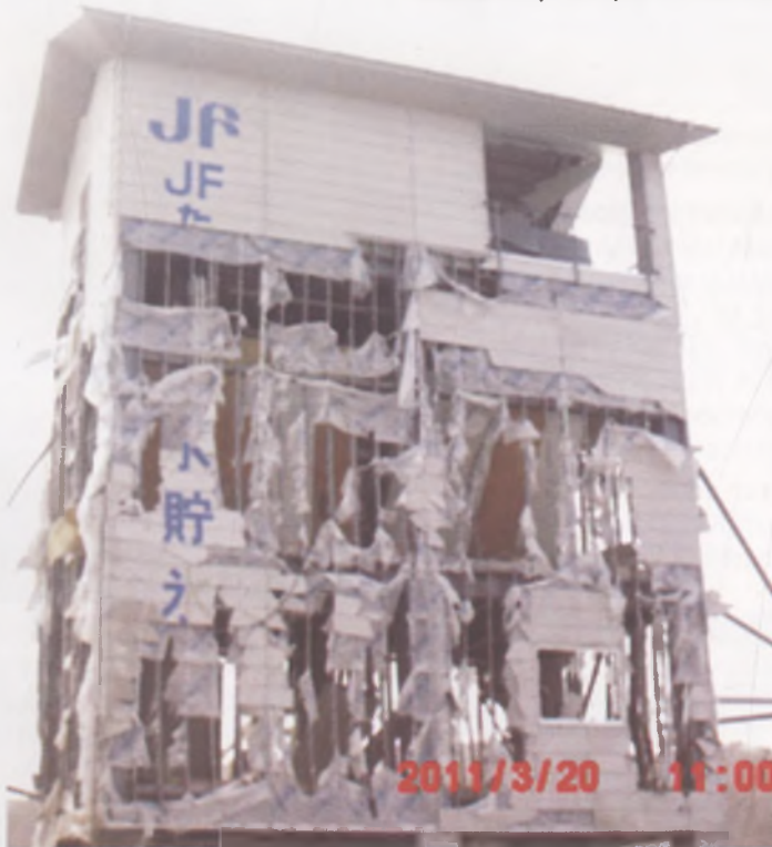
The ice-making facility of JF Taro FCA destroyed by the Tsunami

on the information on what is needed in which area.