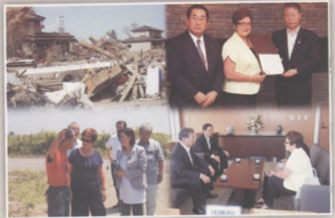
The ICA President with Co-operators