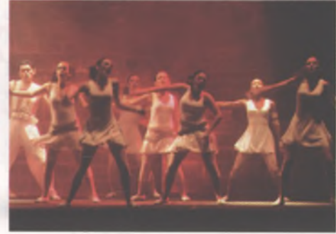
Young boys and girls performing at the welcome reception in Cartagena