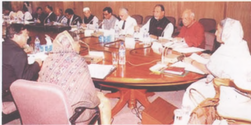
Meeting with the Prime Minister Sheikh Hasina

The cabinet took the decision at its regular weekly meeting held at the Cabinet Division with Prime Minister Sheikh Hasina in the chair.