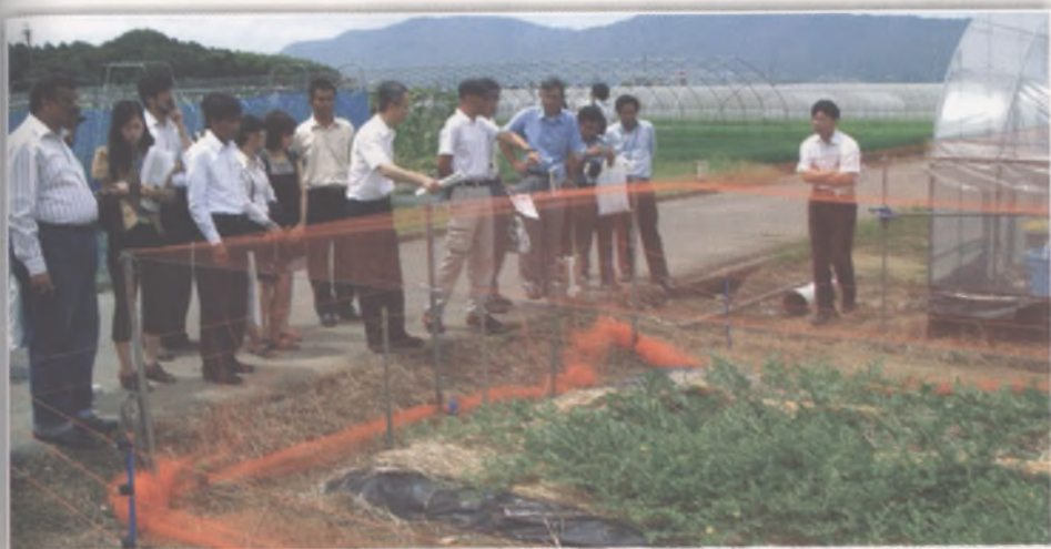
Participants at a farm

Perhaps due to poverty and large number of population, most of Asian countries focus more on increasing food production and generally less attention is paid to safety and quality of the food resulting into health and environmental problems. Uninformed/misinformed use of chemicals, pesticides and fertilizers and other farm inputs impact the quality of food and also affect the soil etc. Therefore, it has become necessary to ensure quality and safety management of farm products including meats, dairy and poultry etc. for better health of people, better value to farm products and conservation of soil and natural resources as well.