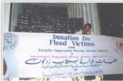
Blankets for distribution