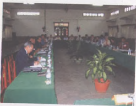
The workshop in progress