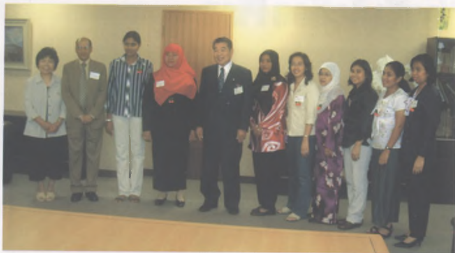
The women delegates pose for a group photo

The International Co-operative Alliance - Asia and Pacific (ICA-AP), in association with its member organisation in Japan, the Central Union of Agricultural Co-operatives of Japan (JA-Zenchu) and the Institute for the Development of Agricultural Co-operation in Asia (IDACA) organised the 5th ICA-Japan Training Course for "Strengthening Women's Agricultural Co-operatives in Rural Areas and Improvement of Farm Management and Rural Life" in Malaysia and Japan. Eight participants - two each from Indonesia, Malaysia, Philippines and Sri Lanka, attended the Training