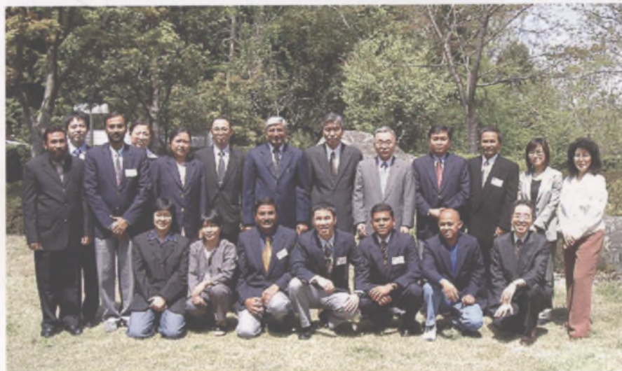
Participants of the course at the closing ceremony at IDACA, Japan.