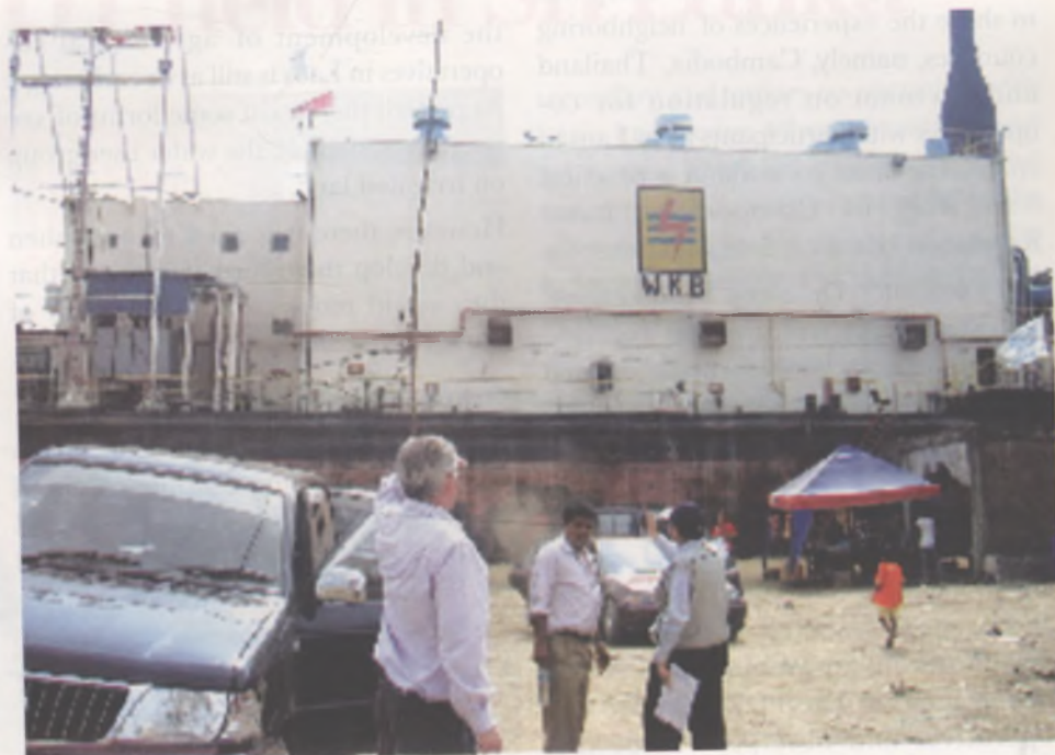
A ship washed away on the road several kilometers from sea in Aceh

urgent support and instructed the ICA officials in Geneva and in the Asia-Pacific Region to do all that is possible for the hapless tsunami victims in the region, in this hour of need.