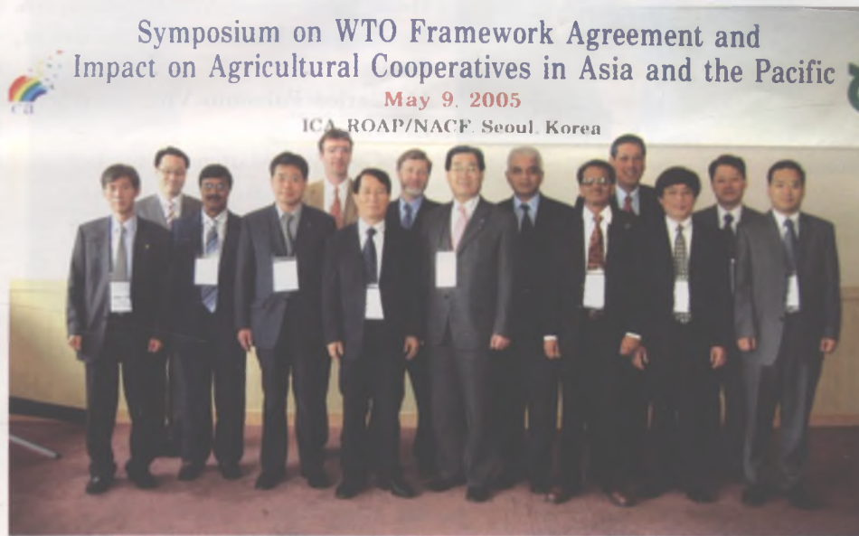
Delegates at the symposium