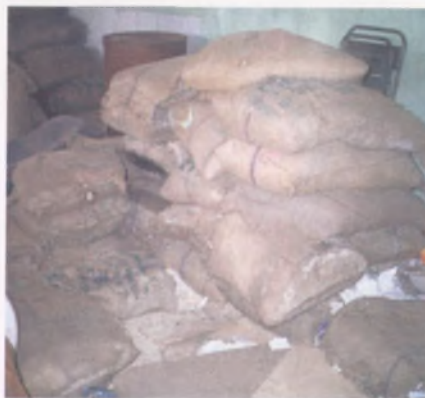
Damaged stock of a consumer co-operative in Tamil Nadu