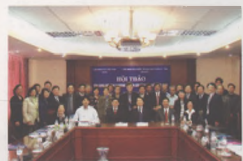
Participants of the workshop on the final day