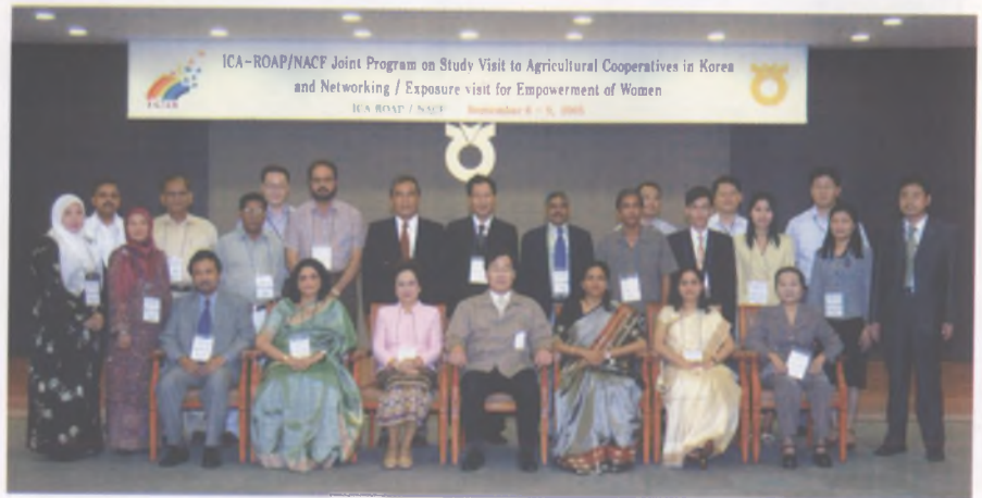
The delegates at a photo opportunity

The participants visited to Hanoramart Chain Store Division, Agriculture Co-ops including meeting with Women Association in the co-op and Kyoyang Agricultural Marketing Complex and Agricultural Co-operative College.