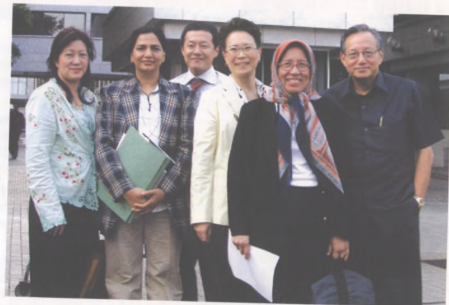
Members of the team after the meeting

it was found that all the six strategies have been dealt with but performance could not be maximized due to various reasons.