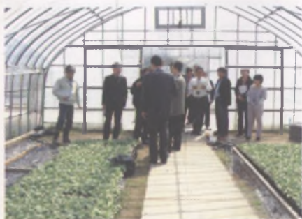
Participants in a Green House in Shimane prefecture