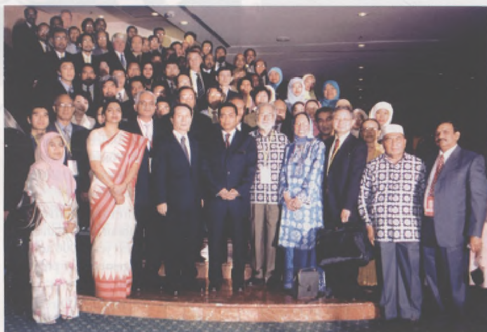
The delegates of the Dialogue

In a large number of cases, elections and general body meetings in co-operatives are not held regularly. The non-conduct of elections and general body meetings regularly has been creating apathy among members towards the management. Meeting of the General Body and Audit of the co-operatives' functioning be made mandatory by law.