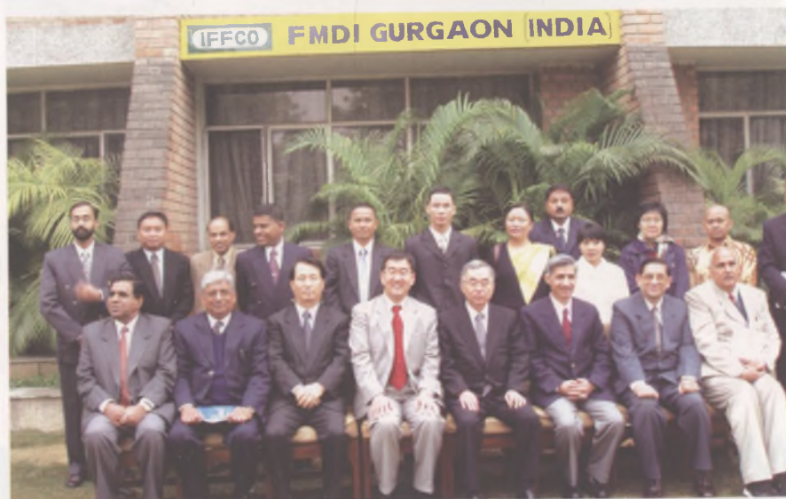
Participants of the course at a photo session