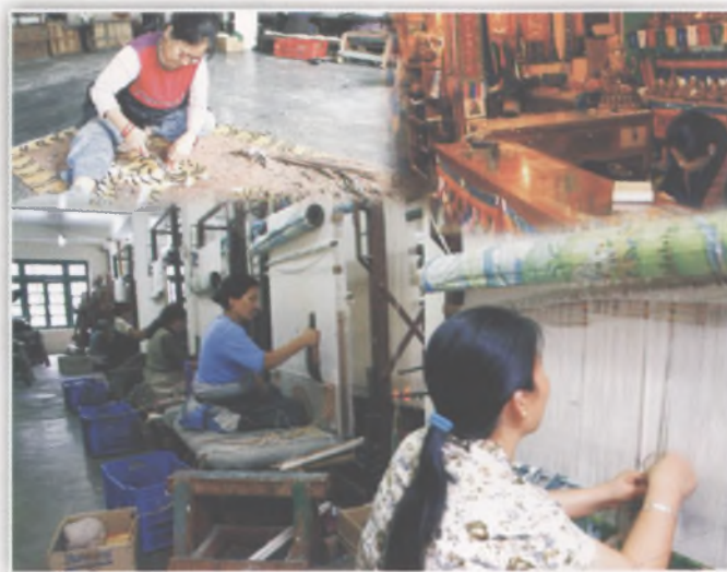
Glimpses of Co-op

The strength of the co-operatives are immense. It can not only provide the members of a co-operative security, but also makes them self-reliant. So when the members of a co-operative taste the fruits of success, the result is indeed electrifying. Not surprisingly, Tibetan Handicraft Production-cum-sale Industrial Co-operative Society is one such society which has surged ahead in the recent times imbibing the true ethos of co-operative. Located in Macleodganj in Dharamshala district of Himachal Pradesh State in India, this society has not looked back ever since it was formed in 1961. After the Indian Government provided asylum to the Tibetan refugees in the hill town of Dharamshala in early 1960s, a sustainable and responsible rehabilitation process became an imperative need of the newly formed and still settling Tibetan community. An ethical business practice was most desired by them, and it was felt that a co-operative form of an enterprise was most suited to serve the needs of the refugee population. In 1969, after eight years of working relentlessly as an informal enterprise, the handicrafts society was registered under the Co-operative Societies Provision Act of the Indian State of Himachal Pradesh. The