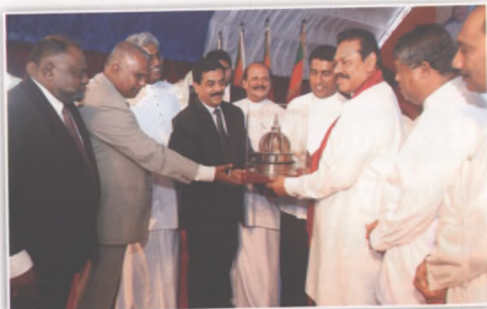
Hon'ble President with President and General Manager of NCC