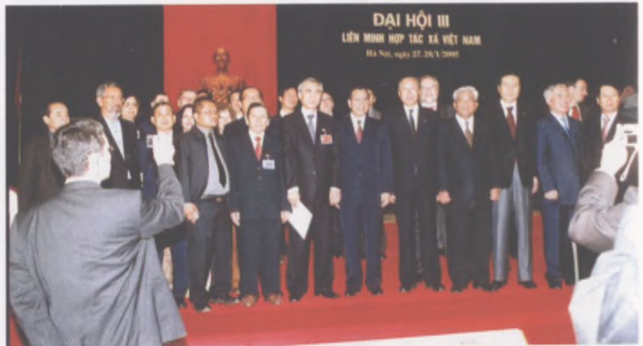
The dignitaries at the Congress

Party General Secretary Mr. Nong Duc Manh asked the Vietnam Co-operative Alliance (VCA) to focus on strengthening and renewing the collective economy and to forge a new direction in socio-economic development. The collective economy, through the system of co-operatives, has made significant contributions to the nation's economic development and social stabilization, he said, and