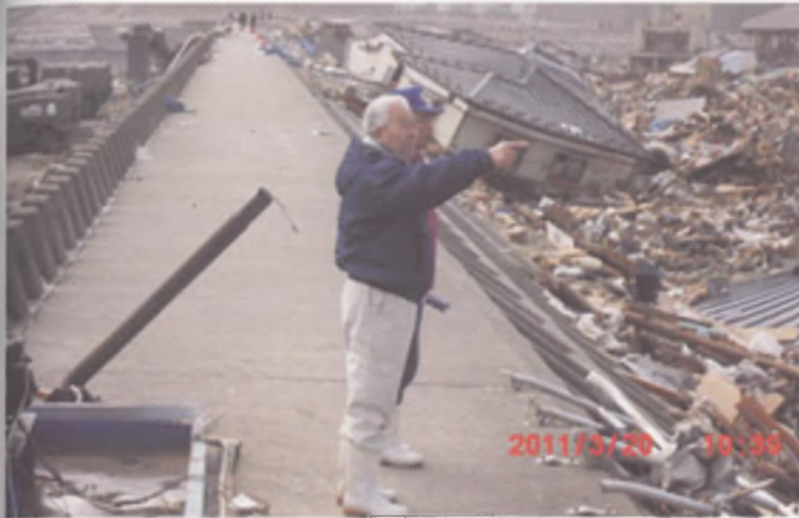
The chairman of JF Taro FCA directing recovery work