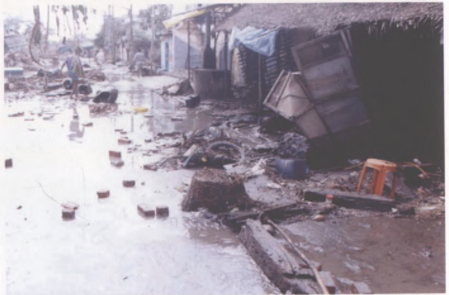
Damaged houses in Tamil Nadu, India

Temporary shelters, drinking water, safe defecation and sanitation and road reconstruction were the top priorities of the Tamil Nadu State Government and it has really done