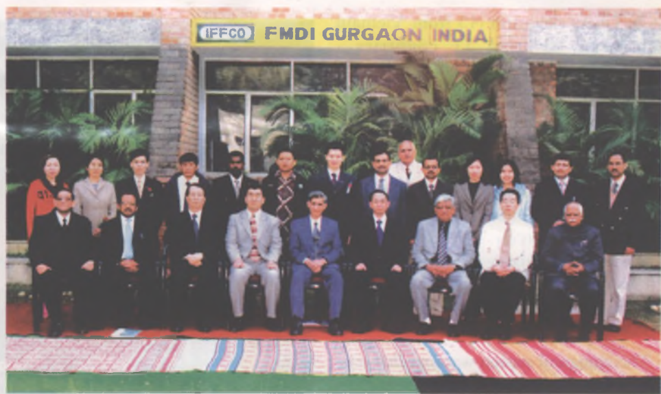
Participants with the distinguished guests at FMDI, Gurgaon, India