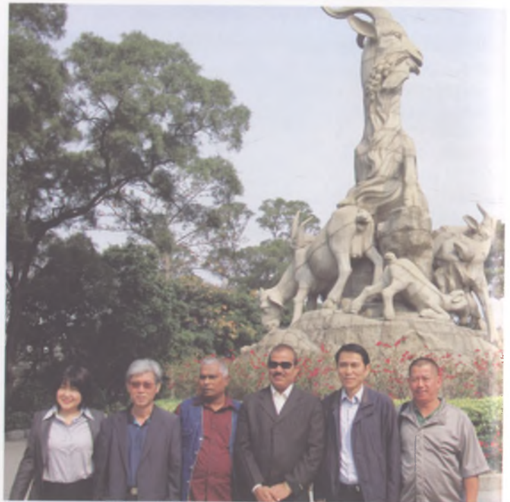
Board Members on a trip

Other matters such as proposal of ICA-Americas to amend the 7th Cooperative Principle,