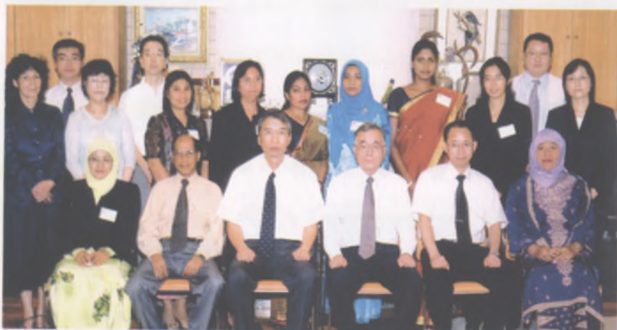
Participants of the 5th ICA/Japan Women Leaders Training Course

Course. The Course was organised and held by the ICA at the IDACA premises from 4th to 28th September 2005. The 10-day component of Comparative Field Study Visits was held in Malaysia from 25th August to 3rd September in collaboration with the National Co-operative Organization of Malaysia (ANGKASA). The program is funded by the Government of Japan in the Ministry of Agriculture, Forestry and Fisheries (MAFF).