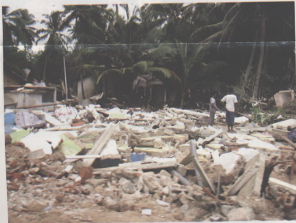
Rescue workers and people assessing the damage