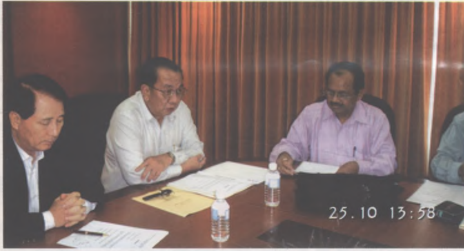
The ICA-AP, Regional Director, Chair and Vice-Chairs of HRD Committee at the meeting

The much-publicized corporate fallout of national and international corporations in many countries has created greater awareness on the need for good corporate governance in the business fraternity. This heightened awareness has led to the urgent need for good corporate governance in all economic sectors and in voluntary welfare organizations and charities.