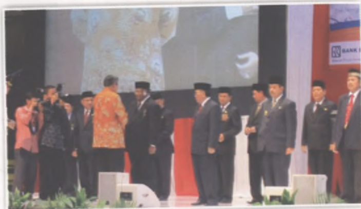
The President of Indonesia awarding excellent co-operators

In the presence of the President of Indonesia, Dr. H. Susilo Bambang Yudhoyono and his Co-operative Minister, Dr. Syarifuddin Hasan MM. MBA, the 64th National Co-operative Day Celebrations in Indonesia was held on 12 July at the