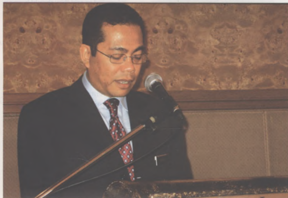
Hon. Minister of Entrepreneur and Co-operative Development Yang Berhormat Dato Mohd. Khaled bin Nordin speaking at the Dialogue.

The Co-operative - Government Dialogue was organized by ICA-AP in collaboration with national co-operative apex of Malaysia the ANGKASA from 14 to 17 November 2005 in Petaling Jaya, Malaysia.