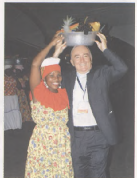
The ICA President carrying a fruit basket at the Reception

The ICA has held its General Assembly at the Hilton Hotel in Cartagena, Colombia. In its 110 year history, this is the first time that ICA held a General Assembly in Latin America.