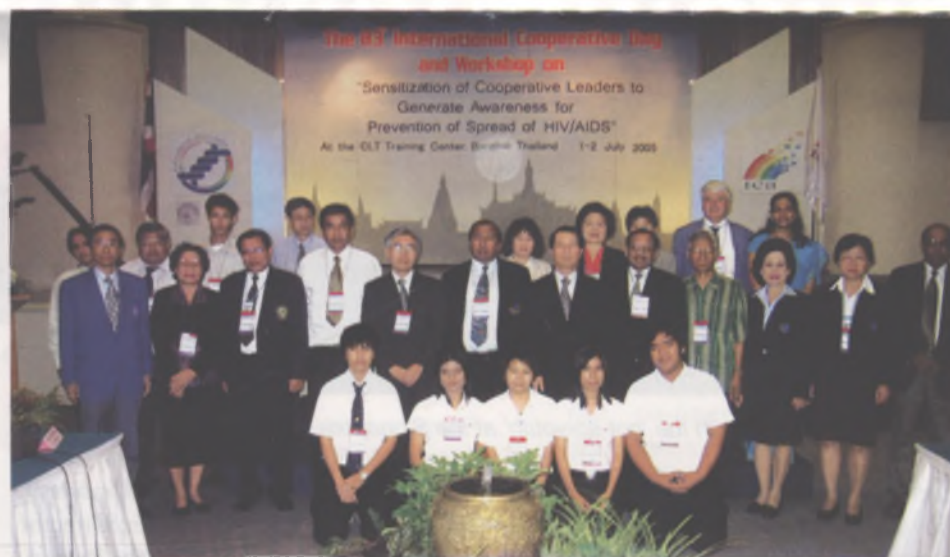
Participants at the Workshop in Thailand