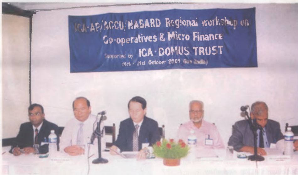
Distinguished delegates at the dias

In line with the theme of the International Day of Co-operatives "Micro Finance is our Business! Co-operating out of Poverty", this regional workshop on co-operatives and micro-