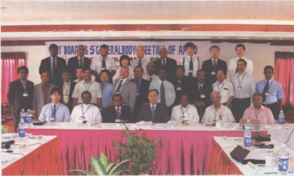
Delegates with the board members after the meeting

The 11th Board Meeting and 5th General Meeting of Asia-Pacific Health Co-operative Organization (APHCO) was held on 30th April 2005 at Tellicherry, Kerala, India. The meetings were hosted jointly by Tellicherry Co-operative Hospital and Kerala Co-operative Hospitals Federation. 31 persons from India, Japan, Malaysia, Nepal and Sri Lanka attended the meetings.