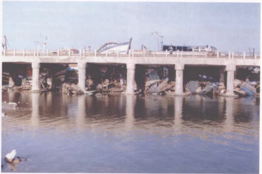
Fishing boats piled up under a bridge in Nagapattinam