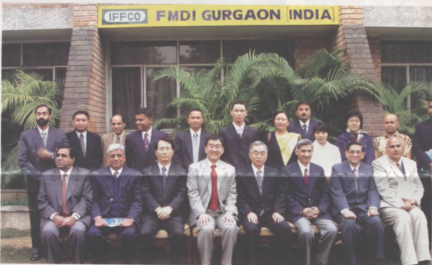
Dignitaries at a photo session at the inauguration of the course at IFFCO's Fertiliser Marketing Development Institute, Gurgaon, India