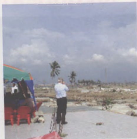
A scene from Nias

The President has requested all collaborating donor agencies for their