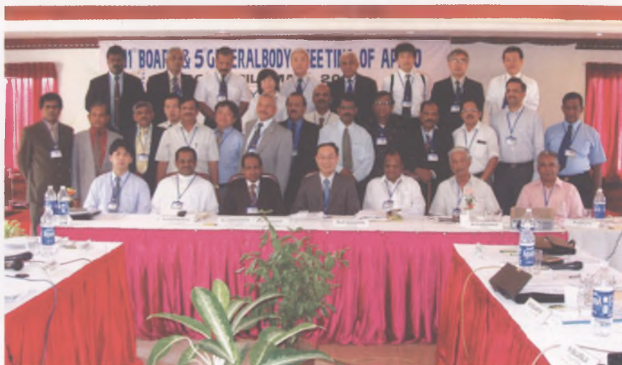
Delegates with the board members posed for a photograph after the meetings