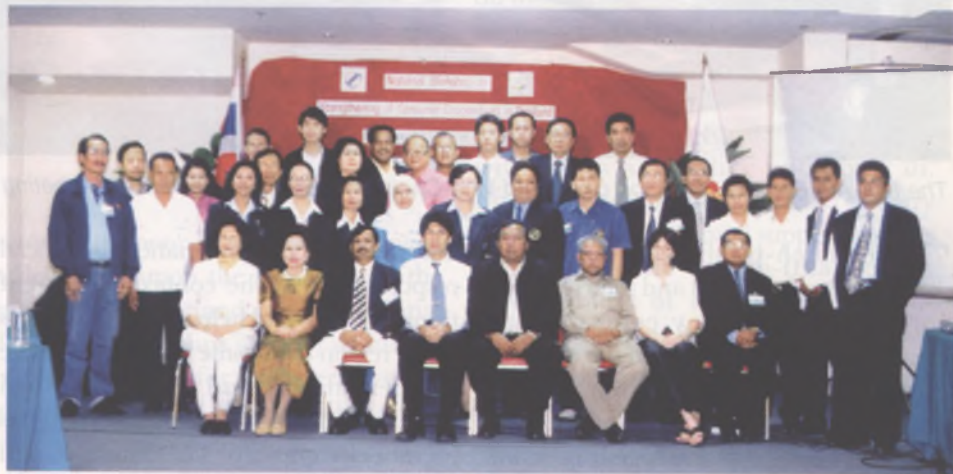
Participants of the Follow-up workshop in Bangkok

Thirty participants from all over Thailand participated at the workshop, which was organized in collaboration with the Co-operative League of Thailand (CLT).