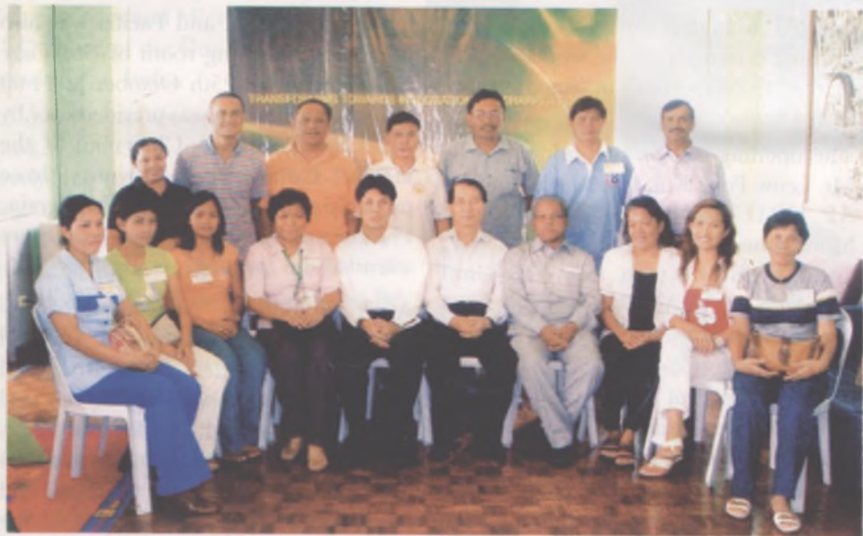
Participants of the workshop in Cebu, Philippines

A National Workshop on Strengthening of Consumer Co-operatives was organized by ICA-AP at Cebu, Philippines on 21-23 November 2005.