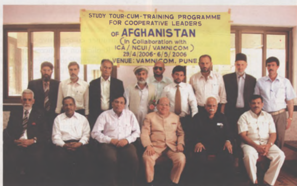
The participants with NCUI and ICA officials at VAMNICOM, Pune.

Based on these discussions, the Minister, Senior Government Officials and Co-op leaders of the Mission felt that several issues need to be addressed for revitalization of co-operatives in Afghanistan. Hence, ICA-AP decided to conduct a sensitization program for co-operative leaders and government officials in India in collaboration with National