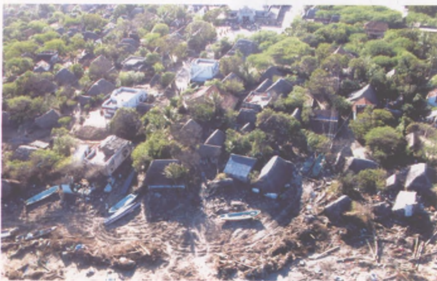
The ravaged coast in Tamil Nadu

of the affected communities in Tamil Nadu were patronising local co-operatives for the livelihood. In Andaman Nicobar Island, Central Tribal Co-operative patronised by more than 8000 tribal families lost civil infrastructure, liquid assets and records. It may take years to bring back lives of thousands to normalcy.