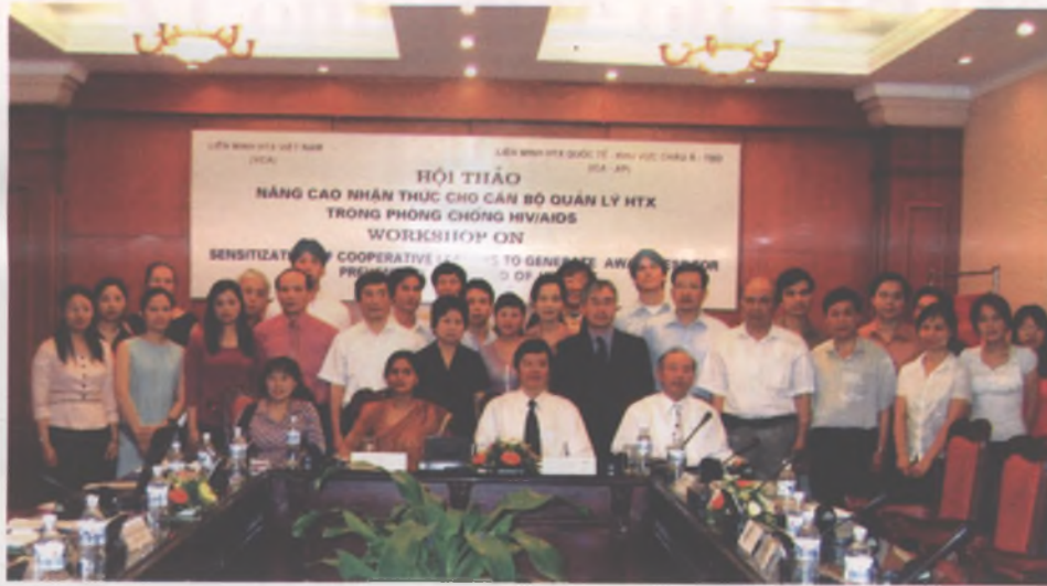
Participants at the workshop

permit VCA to become a member of National Committee of HIV/AIDS Prevention and request the Government to issue the specific programs and plans for the co-operative sector.