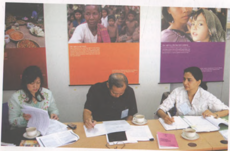
The team members working on strategies