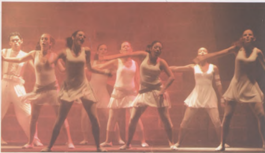
Young boys and girls performing at the welcome reception in Cartagena