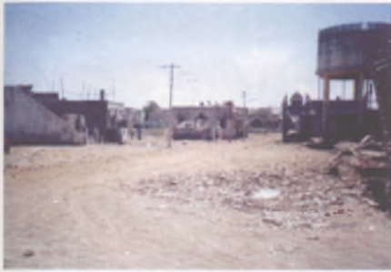
Temporary shelters provided to the victims

co-operatives in doing their daily transactions and businesses. Government has announced the concessions to be given on purchase of boats, nets, equipments at the individual level but there is no immediate plan to reconstruct the infrastructure of co-operatives.