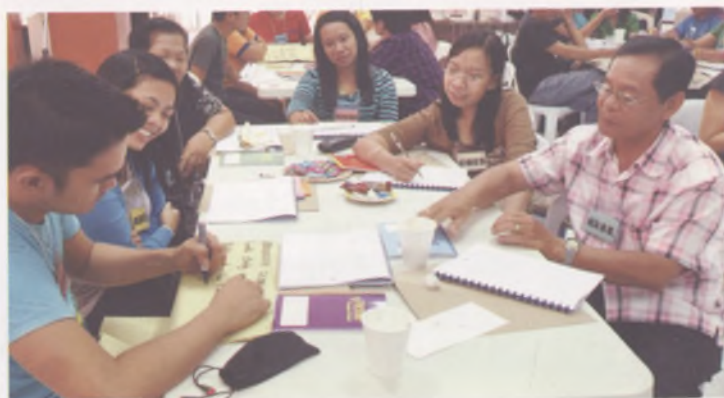
Women and men learn more about GE advocacy in AWCF project

resource center and advocacy body on gender and co-ops in Asia, with a Secretariat based in the Philippines. It is member of the Regional Women's Committee of the International Co-operative Alliance-Asia and Pacific (ICA-AP).