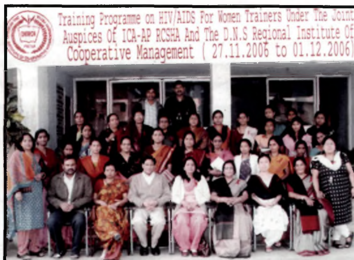
Women participants in Bihar, India