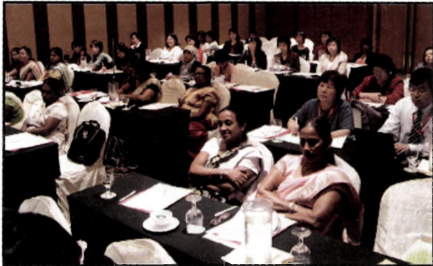
Participants at GEC

Conference. She was also invited to represent Asia Pacific region at the plenary and made presentation on activities of the committee.