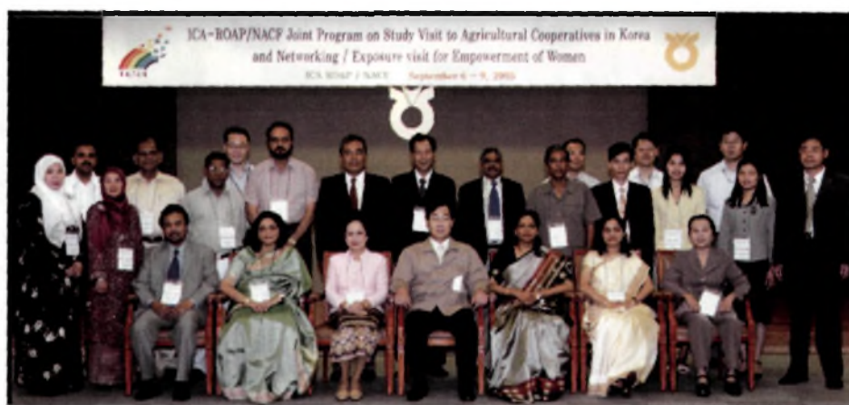
Participants of the Seminar at NACF, Korea