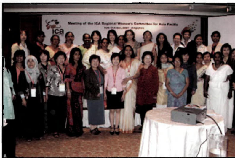
The participants at RWC meeting and Seminar in Singapore

The meeting reviewed performance and next years work plan was decided. The meeting was focused on organizing of Regional Women Forum in 2008 in Hanoi and the election of the committee.