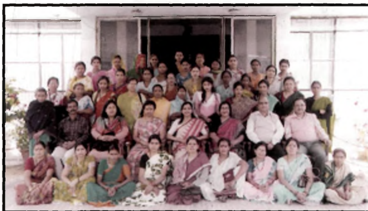
Women participants in Uttar Pradesh, India

The project developed a special training manual ‘ HIV/AIDS and Co-operatives-a training manual & guide’ keeping in view needs of co-operative members.