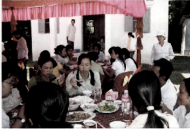
Participants in front of the ICA Supported Siem Reab Coop building during the study visit.

The Training was based on 'Trainers training manual for leadership development of women in cooperatives' developed by ICA-AP and ILO COOPNET. The topics covered during the training are: