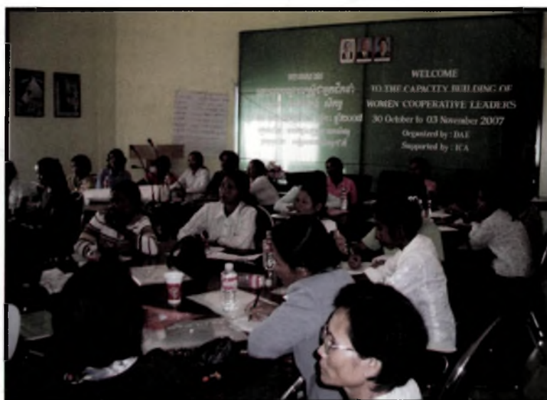
Group work during class room training

the cooperatives. The information sharing during the exposure visits to successful co-operatives, focused upon co-operative endeavour to promote women's interests. The very first programme was conducted in India in 2004.