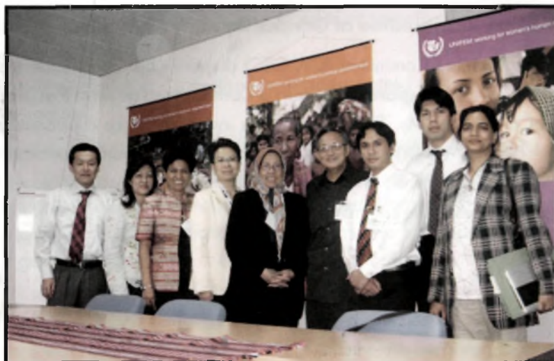
Participants of the brainstorming session at UNIFEM, Bangkok-2005