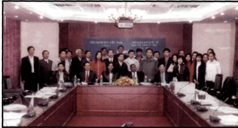
Participants of TOT in Vietnam