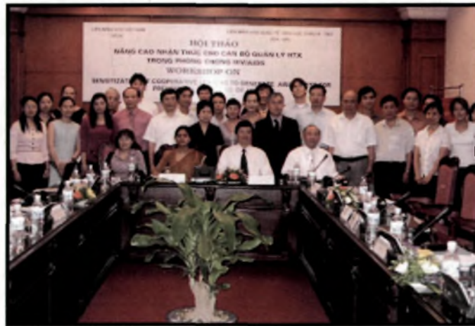
Participants at the workshop