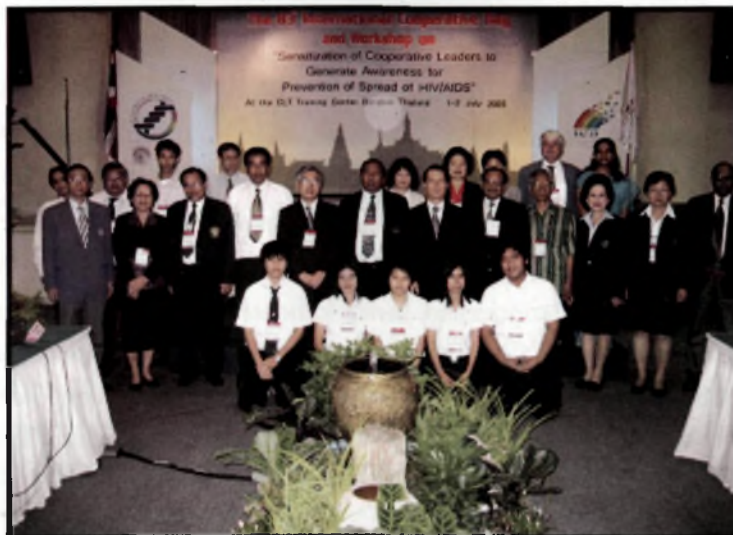
Participants of HIV/AIDS workshop in Bangkok

This workshop was designed with an aim to sensitise co-operative ministers, leaders and managers of the co-operative about the sensitivity of the issue and pronounced commitment from them to bring out required facilities for spread of preventive education to reduce risk of HIV/AIDS among the co-operators.