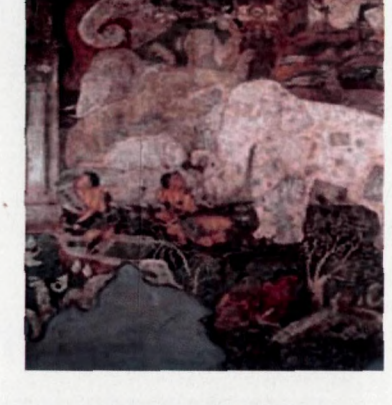
Art work inside the caves

The Ajanta Caves (75°40′ N; 20°30′ E) are situated at a distance of 107 km north of Aurangabad, the district headquarters. The caves attained the name from a nearby village named Ajanta located about 12 km. These caves were discovered by an Army Officer in the Madras Regiment of the British Army in 1819 during one of his hunting expeditions. Instantly the discovery became very famous and Ajanta attained a very important tourist destination in the world. The caves, famous for its murals, are the finest surviving examples of Indian art, particularly painting.