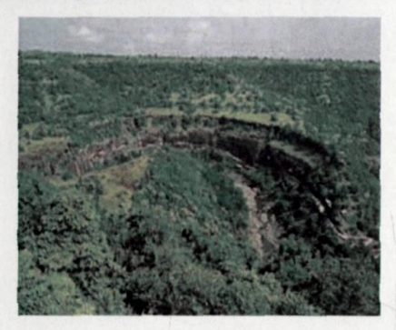
Arial View of the Ancient human community