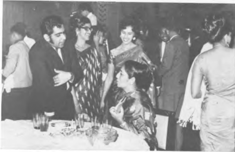
After dinner informality