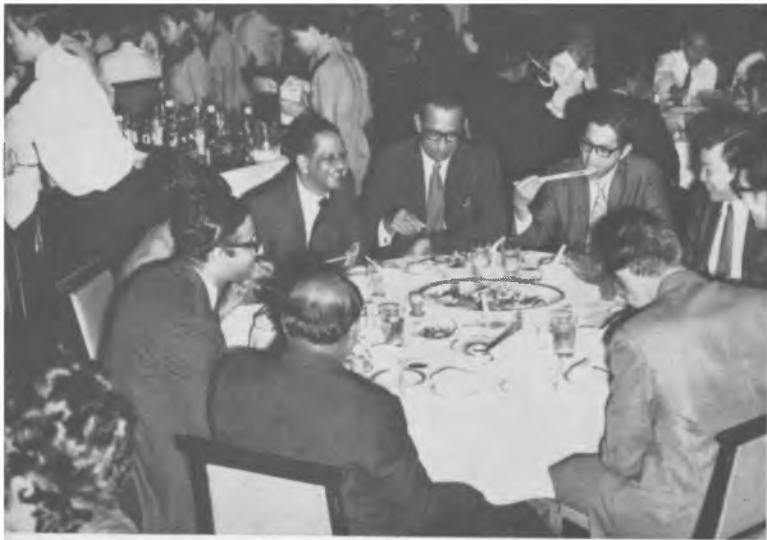
More pictures of hosts