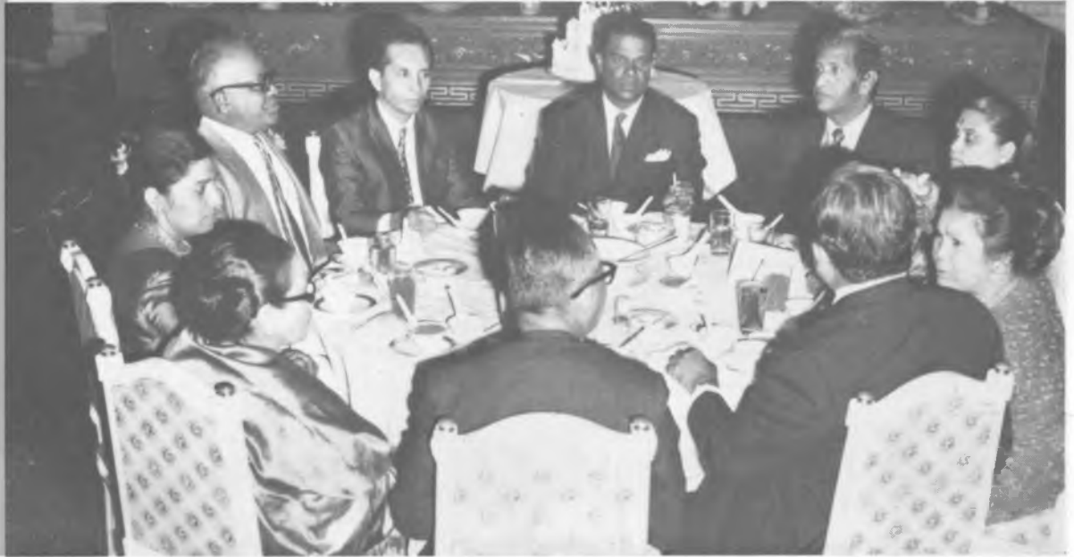
With distinguished guests