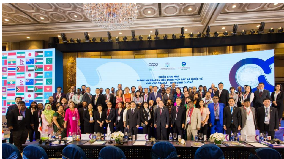
A group photo of all participants the Forum.

ICA-AP in partnership with the Vietnam Cooperative Alliance and the Institute for Organic Agricultural Economics organized the 2 nd Asia Pacific Cooperative Registrars' Forum on Creating Enabling Legal Framework and Policies to Promote Sustainable Development of Cooperatives in the 21 st Century , in Ho Chi Minh City, Vietnam. The Forum was co-funded by the ICA-EU Partnership on Cooperatives in Development (#Coops4Dev).