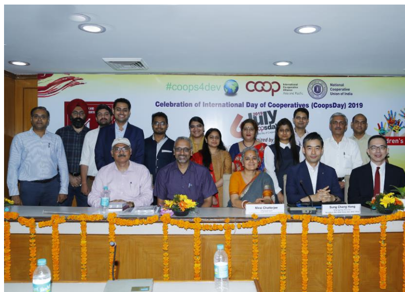
Panellists, ICA-AP and NCUI staff at the closing of the Seminar.

NCUI presented eco-friendly tokens of appreciation to the speakers in the form of house plants that used coir pith. Coir pith is a spongy material that binds the coconut fibre in the husk. It is an excellent soil conditioner and has moisture retention qualities, contributing to water conservation!