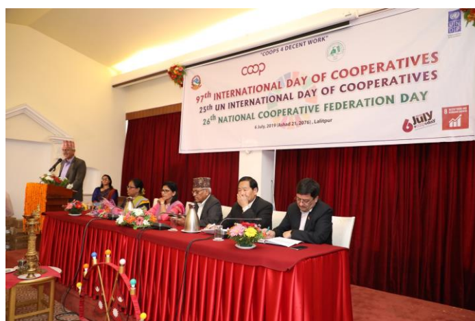
Speakers at the Seminar organized by NCF.