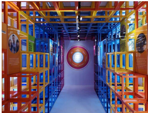
At the SNCF Bicentennial Pop-Up Art event.

The Singapore National Cooperative Federation (SNCF) celebrated Coops Day by organizing the third edition of the Bicentennial Pop-Up Art Event . The event showcased art installations on the theme of "Coming Together As One Through Art.." It featured ways in which NTUC cooperatives have impacted Singapore through the years and still continuing to improve the lives of people in Singapore, by managing the cost of living, increasing affordability and accessibility of daily necessities. The Event also included activities like ‘test your creativity,’ where visitors taking the most creative photographs at the installation received cash prizes!