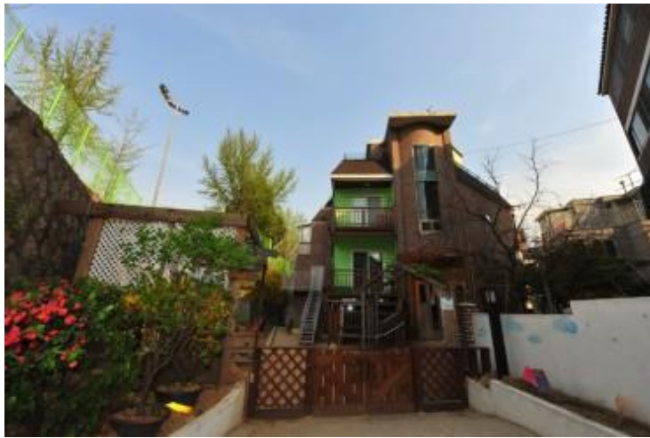
The Sungmisan cooperative in Korea.

Instead of following this top-down approach, if countries start focusing on and implementing a bottom-up approach of creating income and employment, it will create a more effective ripple effect. People-centred business models like cooperatives can be a boon in this regard. Unlike corporates, cooperatives not only think about maximizing the monetary value of shareholders, but also take into account the social wellbeing of the members and the local communities. Unlike non-profit organizations, they do not depend on external funds only, making them self-sustaining.