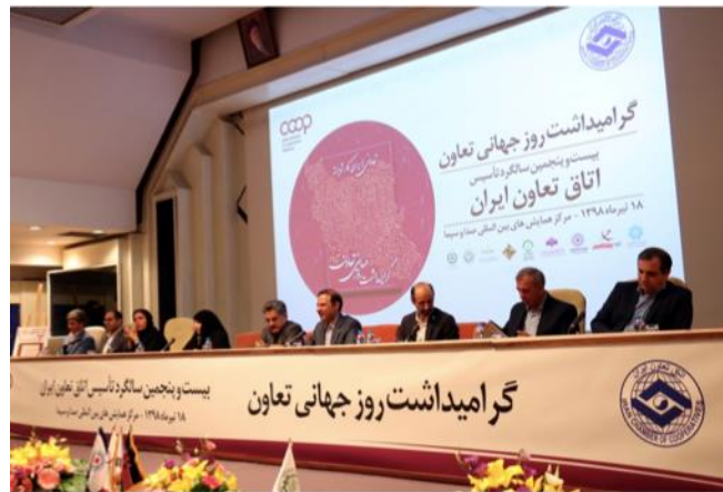
During the panel discussion on Coops for Decent Work.

launched a book titled 'Genealogy of Cooperatives in Iran.' A short video capturing the celebration can be viewed here .