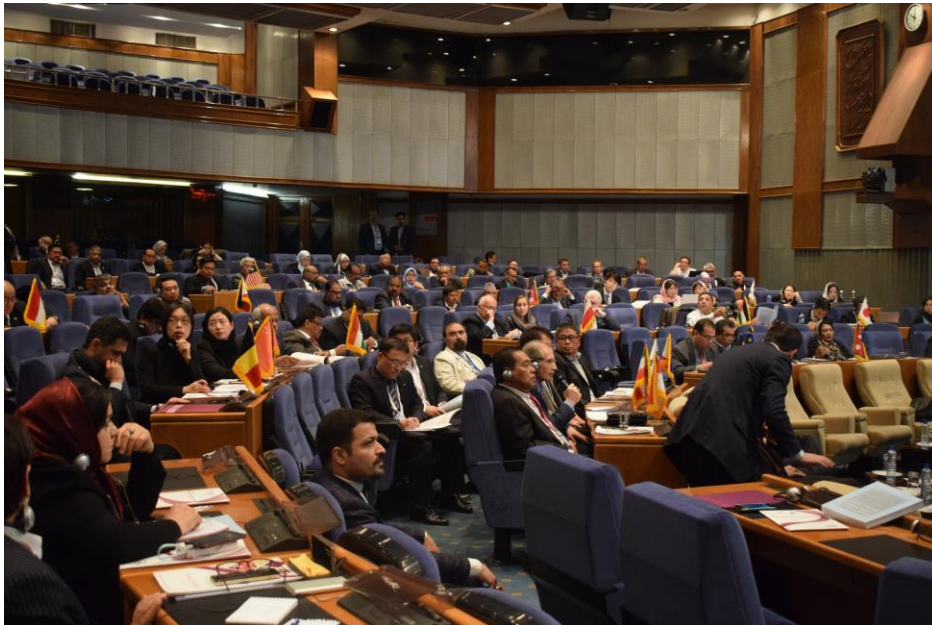
During the 13 th ICA-AP Regional Assembly.

The 13 th Regional Assembly, 10 th Co-operative Forum and related events were held from November 26-30, 2018 in Tehran, Iran. More than 300 delegates from across 18 countries attend the events. The Assembly approved/adopted several resolutions which included a declaration from the 10 th Co-operative Forum, amendment to the change in name of Campus/University Committee to ICA-AP Committee on Educational Institutions and to the rules regarding co-option of Chair of ICA-AP Women Committee to the Regional Board.