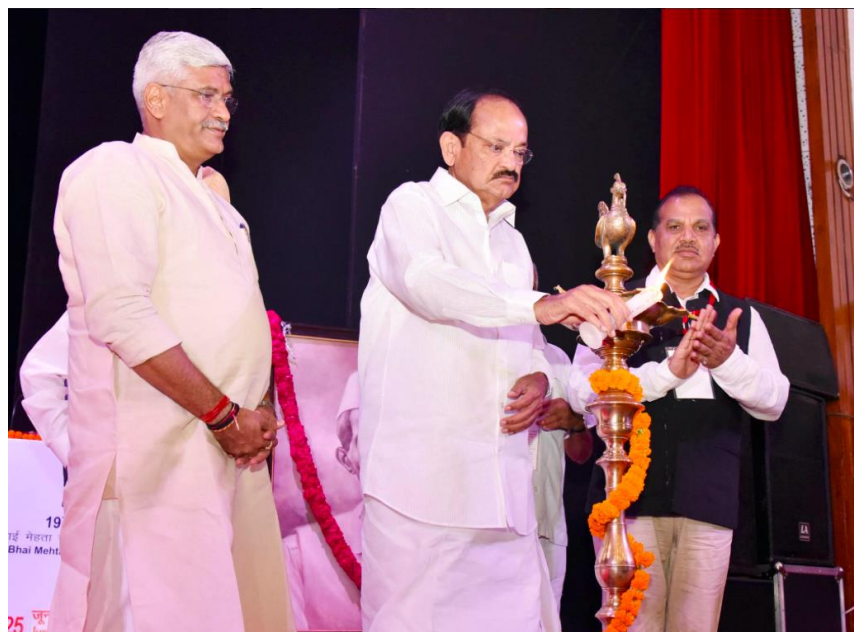
The Hon'ble Mr. M. Venkaiah Naidu (center) lights the lamp to inaugurate the Lecture.