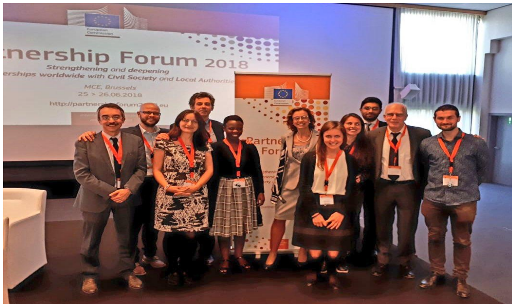
Staff members of the ICA and the European Commission after the closing ceremony of the Partnership Forum 2018.

The European Commission (E.C.) organized its second ‘Partnership Forum’ on Strengthening and Deepening (our) Partnerships Worldwide with Civil Society (CSO) and Local Authorities (LA) in Brussels, Belgium on June 25 and 26, 2018. The first Forum was organized during the summer of 2017 at Flagey, Brussels (Belgium), almost a year after a score of development actors (LAs, CSOs) including the ICA, signed the Framework Partnership Agreements with the European Union through its Commission to implement global, regional and national development programs. A reason for the interest of the E.C. in deepening its bonds with civil society, local authorities is the growing recognition for and the implementation of a ‘multi-stakeholder and inclusive approach’ in achieving the Agenda 2030 for Sustainable Development. The European Union (and in it, the Directorate General for Development Cooperation or ‘DG Devco’) is the world’s biggest donor organization affecting development programs globally with help and assistance from community led organizations, CSOs and LAs.