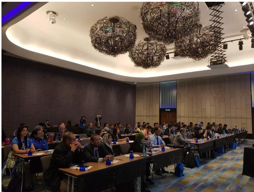
Participants listening to the proceedings of the Seminar.

The ICA-AP Malaysia Business Office (MBO), ICA Committee on Consumer Co-operation for Asia and Pacific (ICA-AP Consumer Committee), Malaysian National Co-operative Movement (ANGKASA) and Japanese Consumers' Co-operative Union (JCCU) jointly organized the Sustainable Development Goals Seminar from April 24-25, 2018 at Aloft Kuala Lumpur Sentral Hotel, Kuala Lumpur, Malaysia. The theme of the seminar, ' SDG 12: Responsible Consumption and Production ', coincides with the theme of this year's International Day of Co-operatives. The two-day event was attended by more than 100 delegates including 30 ICA member organizations, Malaysia co-operative leaders, invited guests and resource speakers.