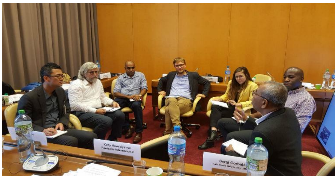
Group discussion sessions from the ILO C2C workshop.