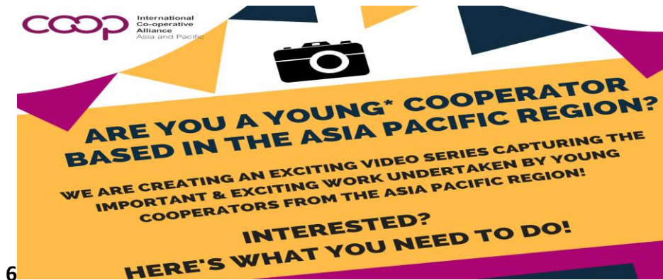
Poster for the Call for Videos.