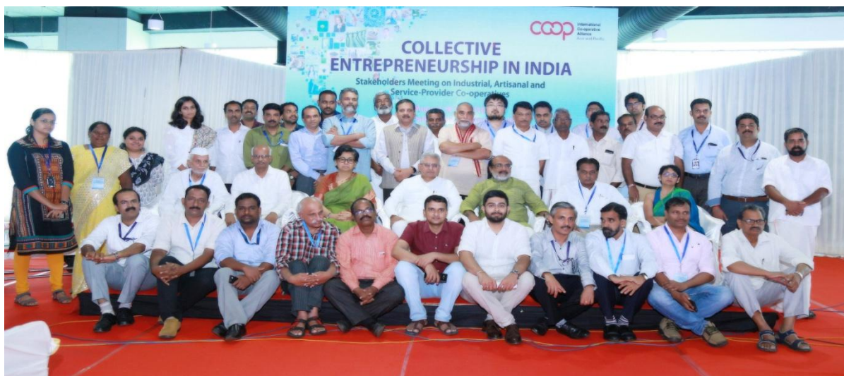
Participants at the Collective Entrepreneurship in India.

Representatives from co-operatives, academia, and development agencies participated in the two day stakeholders' meeting on collective entrepreneurship, organised at the UL Cyber Park (held by the Uralungal Labour Contract Co-operative Society Ltd. or ULCCS) on 18 and 19 August 2016. The meeting was organised by the ICA Asia and Pacific in collaboration with the National Co-operative Union of India, the National Labour Co-operative Federation (India) and CICOPA (ICA's sectoral organization on artisanal, industrial and service co-operatives) and was co-funded by the European Union under the "Co-operatives in Development – People-Centred Businesses in Action," grant to ICA. The meeting was aimed at providing a platform for sharing expert knowledge on industrial, artisanal and service-provider co-operatives in India in particular and south Asia, in general. The meeting largely focused on 'workers' co-operatives to learn about their ownership and management models as well as 'social' co-operatives and the role they can play in building a sustainable society. The meeting was attended by key stakeholders from the labour co-operative movement of India, the International Labour Organization