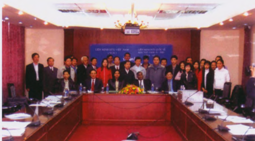
Trainers and Resource persons at the TOT workshop in Vietnam

The ILO-Coop Net and ICA-AP have developed a Training Manual for leadership development of women in co-operatives in the Asia Pacific region. The manual is being used for training of trainers of co-operatives who in turn will train the women co-operative leaders. The ICA-AP is conducting trainings for women and men trainers of primary, secondary and tertiary co-operatives whose role and task is to conduct training activities on gender sensitivity and accountability and on leadership capacity building of women in cooperatives.