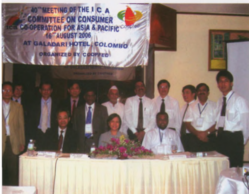
Members of the Consumer Committee

operative Union (JCCU) and practical training will be conducted in respective consumer co-operative societies.