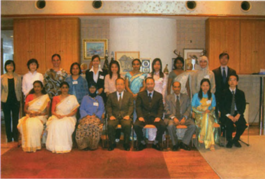
Group photo of the Course participants at IDACA, Japan

the Training Course was held in the Philippines from 24th September to 3rd October and Part-II in Japan in collaboration with the Institute for the Development of Agricultural Co-operation in Asia (IDACA), Tokyo (Japan) from 4th to 31st October 2006. The program is being funded by the Ministry of Agriculture, Forestry and Fisheries (MAFF), of the Government of Japan and implemented by ICA.