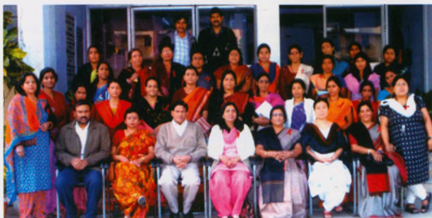
Participants of the ICS/NCUI HIV/AIDS Awareness Training Programme

Thirty women co-operative trainers, co-operative officers and lady mobilisers attended the programme and have been taught the skills for imparting correct and complete information about various aspects of HIV/AIDS. The training was designed for 5 days class room and one day study/