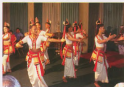
A cultural presentation at the Regional Assembly and related meetings in Colombo