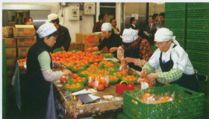
Participants at a fruit processing unit

Special topics of interest to the participants like “marketing methods for farm products by theory and case study”, “new methods for the rural development and green tourism”, “strategy for marketing of agricultural products”, etc. for future development were presented. During the study visits to agricultural co-operatives in Shizuoka Prefecture the participants were able to interact with farmer leaders and to observe their various activities as carried out by the JA’s.