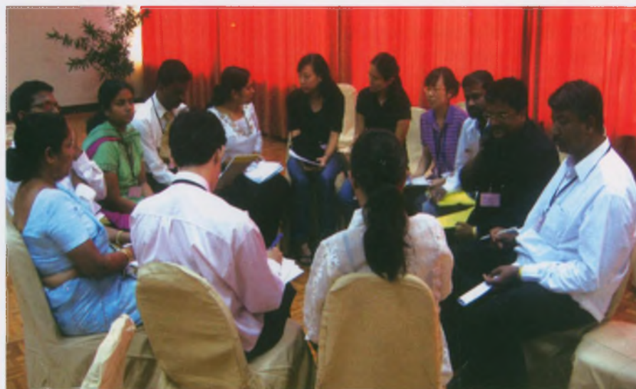
Youth Conference delegates discussing important points