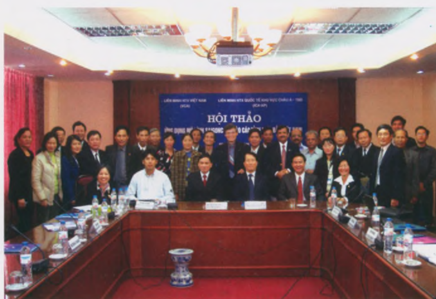
Participants of the workshop pose for a photograph