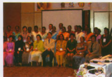
Members of the Regional Women's Committee in Colombo