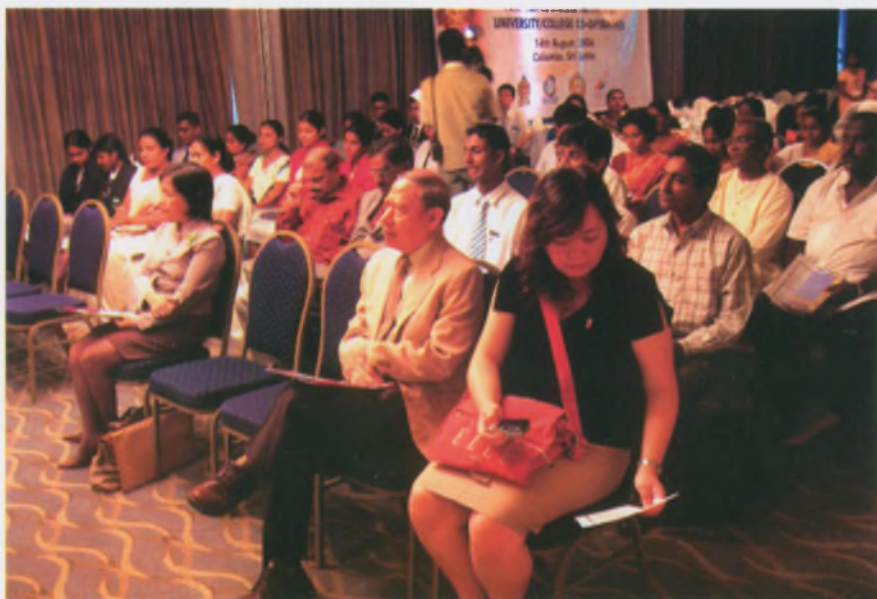
Participants of the sub-committee meeting