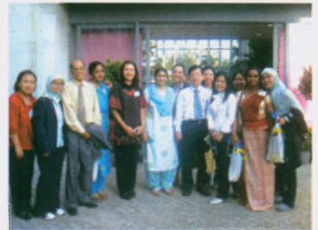
Participants during a study visit

Twelve (12) rural women leaders of agricultural co-operatives - two each from India, Indonesia, Philippines, Sri Lanka, Thailand and Vietnam attended the training course.