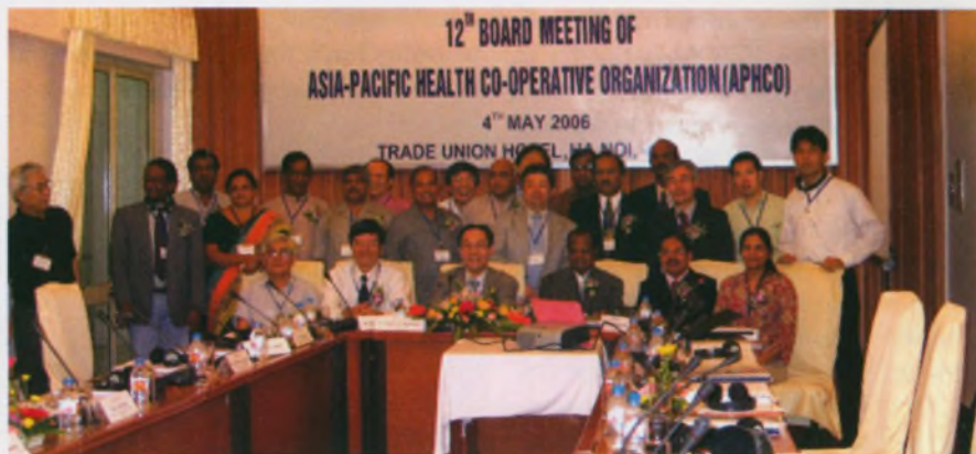
Delegates of the APHCO meeting in Vietnam