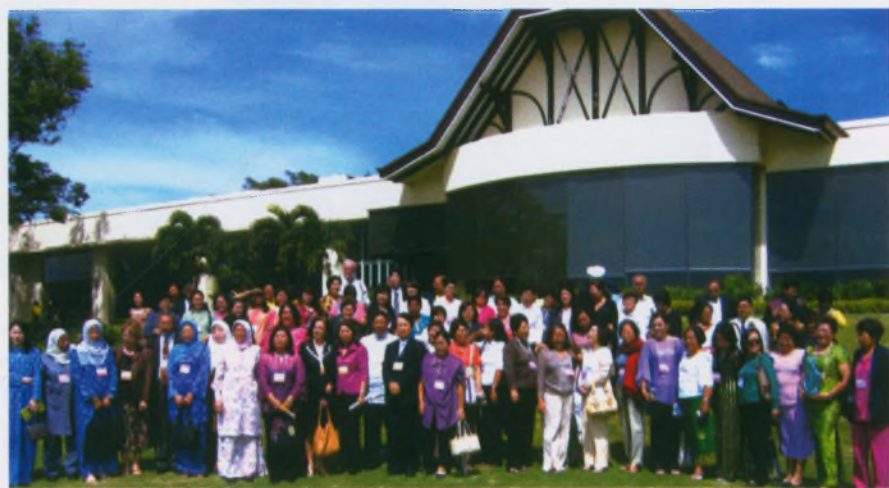
The delegates at the Tagatay Conference pose for a photograph

97, the Conference adopted the Declaration and the ensuing Platform of Action that will further define the strategies identified herein.