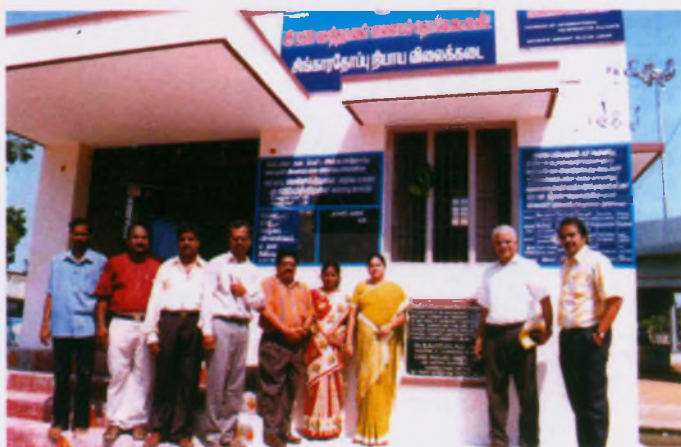
A newly constructed facility in Tamil Nadu after the Tsunami

The objective of 300,000 USD project was to empower co-ops at the primary level to fetch desired institutional financial support through capacity building intervention. 19 MPCs for their 226 branches, 63 SANASA co-ops, 24 fisheries co-ops and 20 other co-ops in Galle, Matara and Hambantota districts in Southern Sri Lanka covering almost 16,635 tsunami affected members were identified as the target beneficiaries. In Sri Lanka the interventions under the project would yield positive results in terms of repositioning the co-operatives as high priority sector with the result of capacity building training programmes.