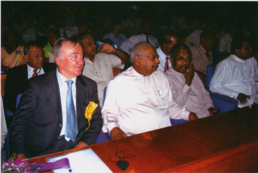
ICA President and others at the inauguration of the Regional Assembly in Colombo

The Fourth event of the ICA Regional Co-operative Forum was held at the Galadari Hotel, Colombo, Sri Lanka, on 17 August, 2006, preceded by a joint inauguration of the Forum and the 7th ICA Regional Assembly in the evening of 16 August 2006 by H.E. Najeeb Abdul Majeed, Minister for Co-operatives and Co-operative Development, Sri Lanka, on behalf of H.E. Mahinda Rajapaksha, who could not participate due to some urgent engagements.