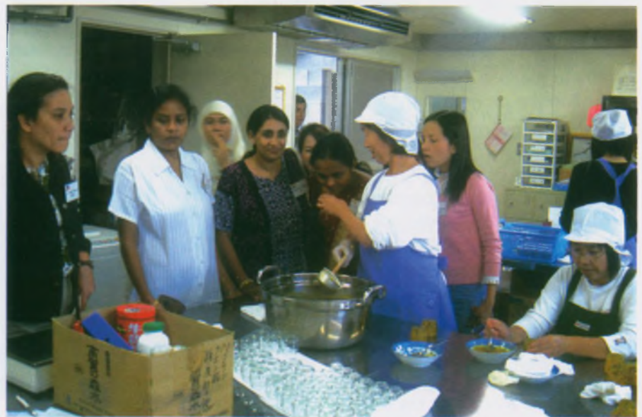
Participants at Study Visit to prefectures

Under this Project, the 1st Training Course on "Promoting Sustainable Enterprises for Rural Women" was held in the Philippines and Japan. Part-I of