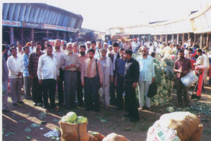
Participants visited a coop vegetable market