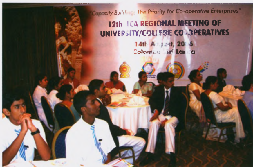
Participants at the University/Campus Sub-committee meeting

The 3rd ICA Regional Youth Conference was held at Bandaranayake Memorial International Conference Hall, Colombo, Sri Lanka, 15th August 2006.