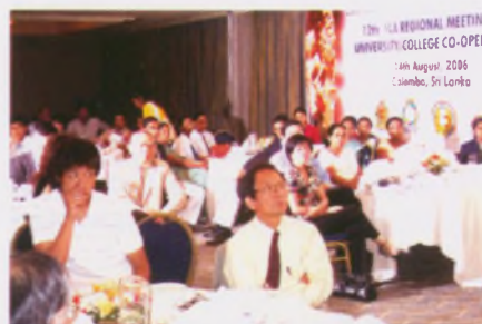
Members at rapt attention at the Consumer Sub-committee meeting