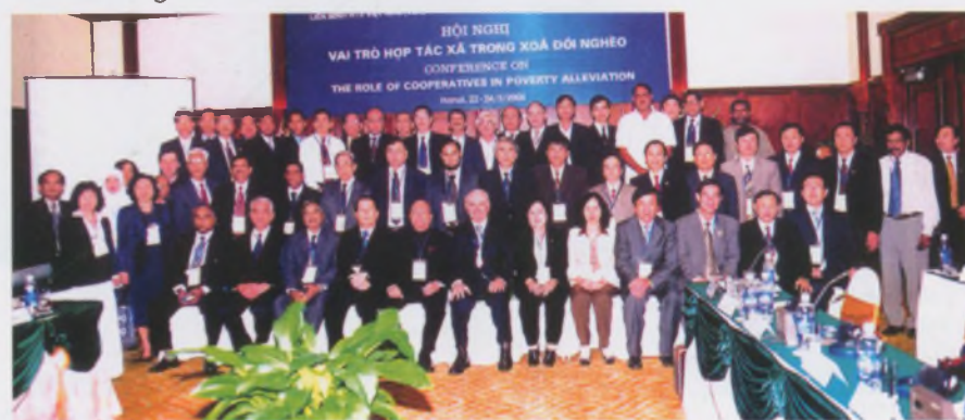
Participants of the Conference

options to deal with poverty reduction through co-operatives - Feasibility Analysis Lacking.