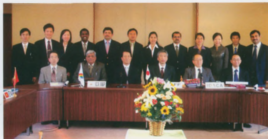
Participants at the closing ceremony IDACA, Tokyo, Japan

At the end of the Training Course, a total of 291 managers of agricultural co-operatives from 16 Asian countries had attended the training programmes and prepared a total of 288 project proposals on topical subjects.