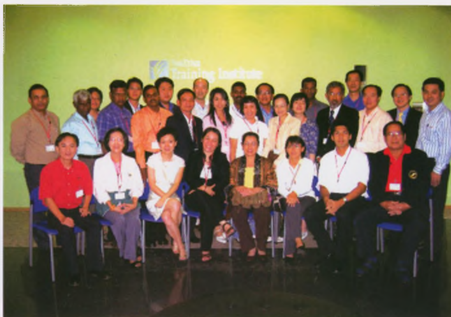
Participants of the Training Programme in Singapore

In addition, the program aimed at developing necessary skills of the participants to enable them to adopt such systems and practice them back at home.