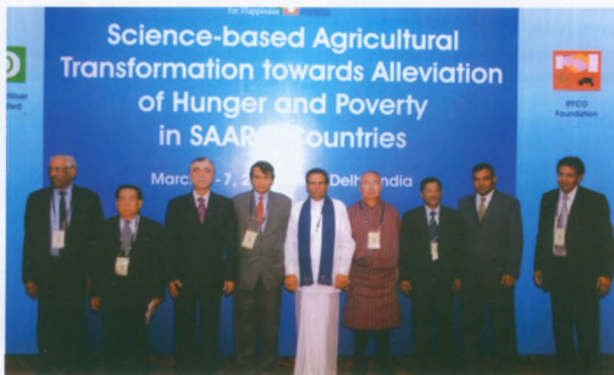
Hon'ble Ministers of SAARC countries at the opening of the Conference

An international Conference "Science-based Agricultural Transformation towards Alleviation of Hunger and Poverty in SAARC Countries" was successfully organized jointly by the Ministry of Agriculture and Co-operation, the Indian Council of Agricultural Research (ICAR), IFFCO (Indian Farmers Fertiliser Co-operative Limited) and IFFCO Foundation during March 5 to 7, 2008 at New Delhi. Hon'ble Minister of Agriculture, Shri Sharad Pawar inaugurated the Conference and Dr. M.S.Swaminathan delivered the Presidential Address. The Conference was attended by eminent policy makers, agriculture scientists, opinion leaders and farmers from the eight south Asian countries, besides Hon'ble Minister/Secretary of Agriculture from Afghanistan, India, Sri Lanka and Bhutan. The Conference aimed at analyzing the regional agrarian situation, encompassing food insecurity and poverty, generation, sharing and use of new knowledge and technologies, including biotechnology and Information and Communication Technology and sustainable