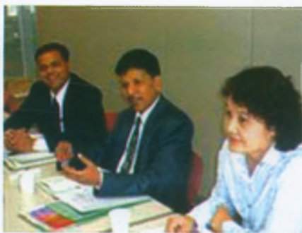
The Training programme in progress

The ICA Training program for Managers of Consumer Co-ops were held since 2001. Twenty-four managers who work for consumer cooperatives applied for the program in Japan. The three training courses have been carried out successfully out of which 9 from 5 countries were selected.