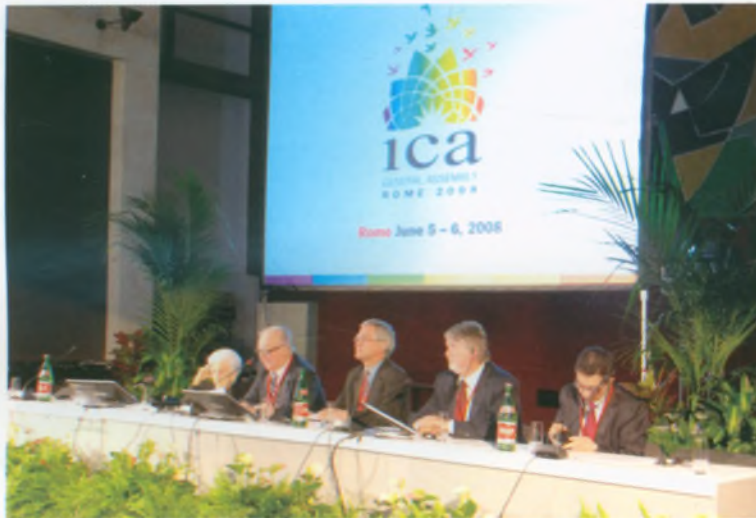
Delegates at the Extraordinary General Assembly 2008, Rome