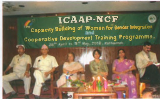
Organizers of the Training Programme in Nepal

These training workshops were organized with the objective of raising awareness of women and men leaders and members of cooperatives on gender issues, on the manifestations of gender bias (against women) in cooperatives, and on the effects of gender discrimination on the personal and interpersonal growth of its leaders and members as well as on the organizational development of cooperatives. It also aimed on building up the capacity of current and potential women leaders of cooperatives by equipping them with knowledge and skills on nature of co-operatives, effective and gender responsive leadership, co-operative enterprise management, coping with challenges and personal development.