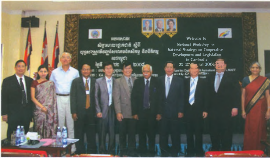
Participants of the workshop pose for a group photo

The workshop was organized on 21-22 August, 2008 by the Department of Agricultural Extension (DAE), Ministry of Agriculture, Forestry and Fisheries (MAFF) and supported by ICA-AP, AGRITERRA and Singapore National Cooperative Federation (SNCF). The important aspect of this workshop was that it was organized as a part of ICA-AP project interventions for promoting and strengthening a sustainable model of agricultural cooperatives for last three years in Cambodia.