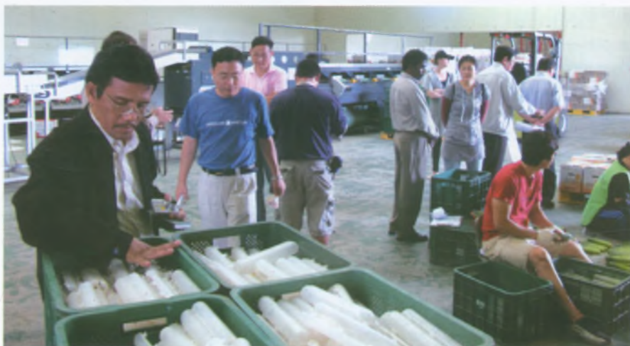
Participants of the workshop at a study visit in Seoul, Korea.