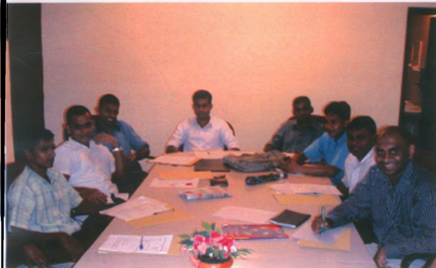
The ICA/IFFCO/NCC preparatory meeting in progress

The ICA-AP/IFFCO/NCC together have started a Pilot Project on Empowerment of Youth and Women through Cooperatives in Sri Lanka for the duration of 1 Year from October 2008 to September 2009.