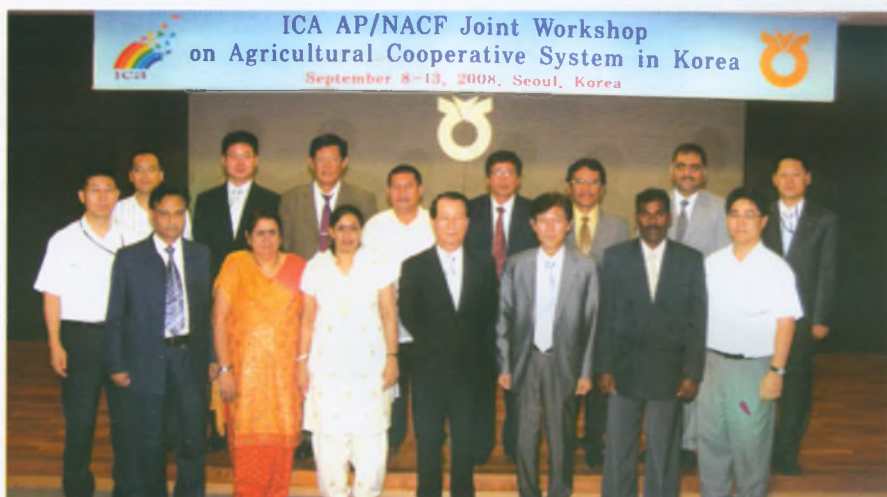
Participants of the workshop at a photo op in Seoul, Korea.

A Joint Workshop on Agricultural Cooperatives in Korea was organized by the ICA-AP in collaboration with National Agricultural Cooperative Federation (NACF) from 8-13 September 2008 in Seoul, Korea.