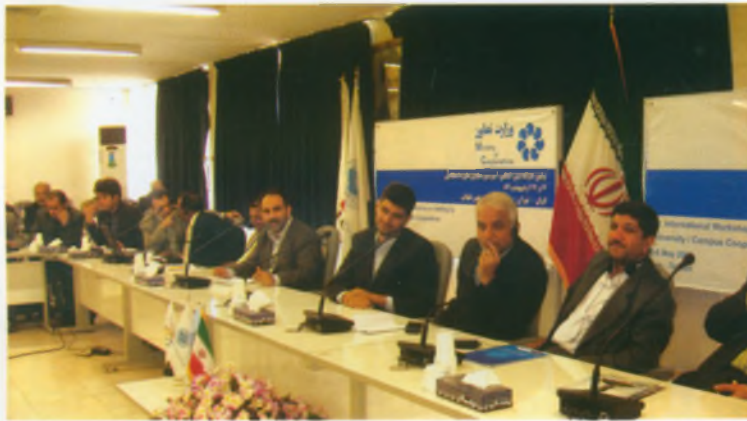
A view of the Workshop on University/College Co-operatives, Iran

The workshop was attended by almost 90 participants.