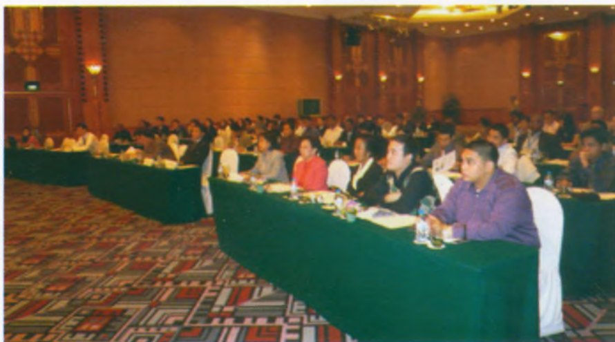
A view of delegates at the Youth Conference

A Youth Conference was held at Melia Hotel, Hanoi on 1st December, 2008, in conjunction with the Regional Assembly.