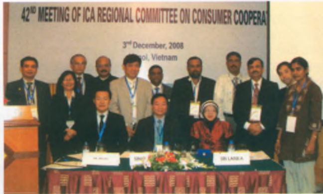
Delegates at the Consumer Committee meeting