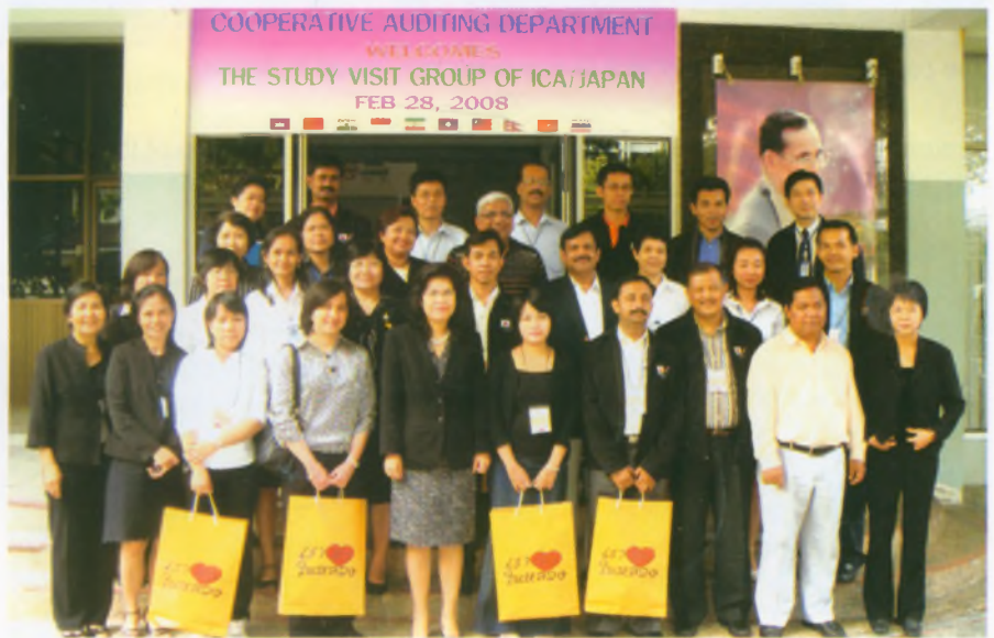
The participants posed for a photo at the Co-operative Audit Department, Bangkok