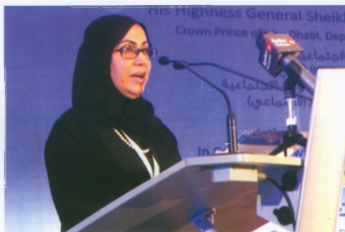
Ms. Mariam Al Roumi, Hon'ble Minister of Social Affairs, Government of UAE speaking at the Government Co-op Dialogue