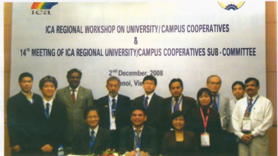
Delegates of the University/Campus Cooperatives Committee meeting