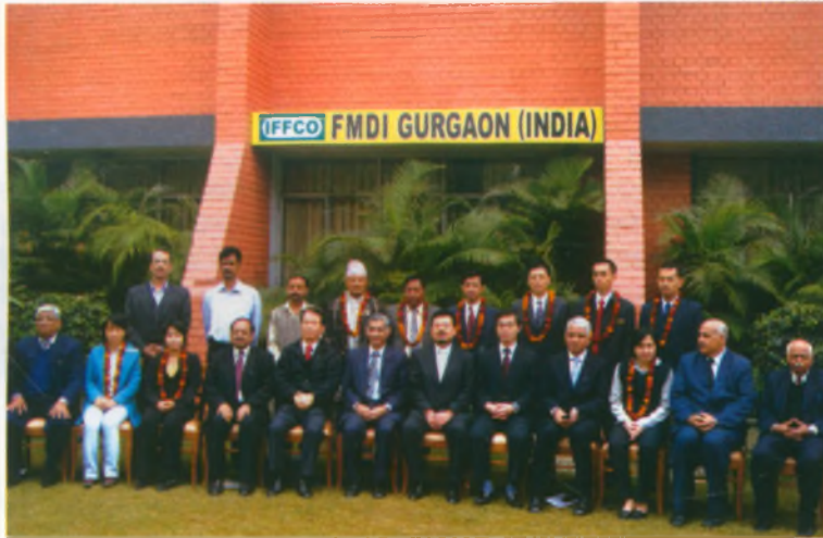
Participants of Training Course at the FMDI, Gurgaon, India