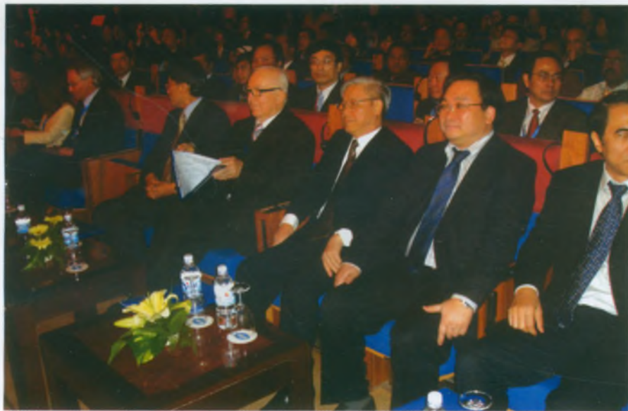
Delegates at the joint inauguration of the Regional Assembly and Coop. Forum

The joint opening of ICA Asia Pacific Regional Assembly and Coop Forum was done by H.E. Mr Nguyen Phu Trong, Hon'ble Chairman of the National Assembly of the Socialist Republic of Vietnam on 3rd December 2008 at My Dinh National Convention Centre, Hanoi in Vietnam.