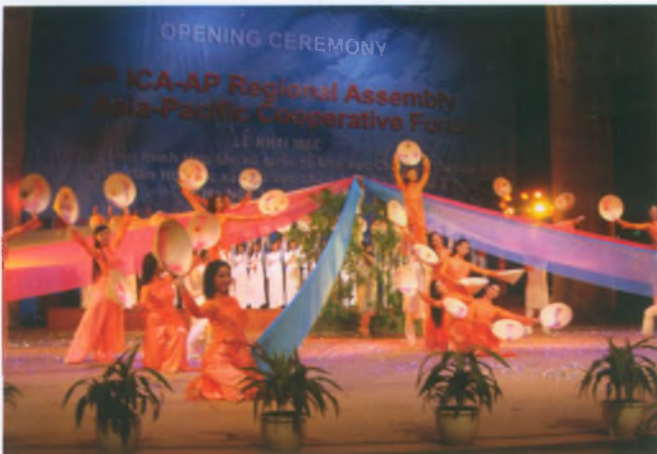
A cultural show presented at the Regional Assembly

The proposal of All China Federation of Supply and Marketing Co-operatives (ACFSMC) to host the next meeting of ICA-AP Regional Assembly in China in 2010 was accepted by the house.