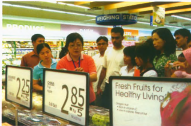
Delegates visit a FairPrice Co-op supermarket

display and pricing. On the last day of the workshop, the participants shared action plans for achieving their own target after the workshop.