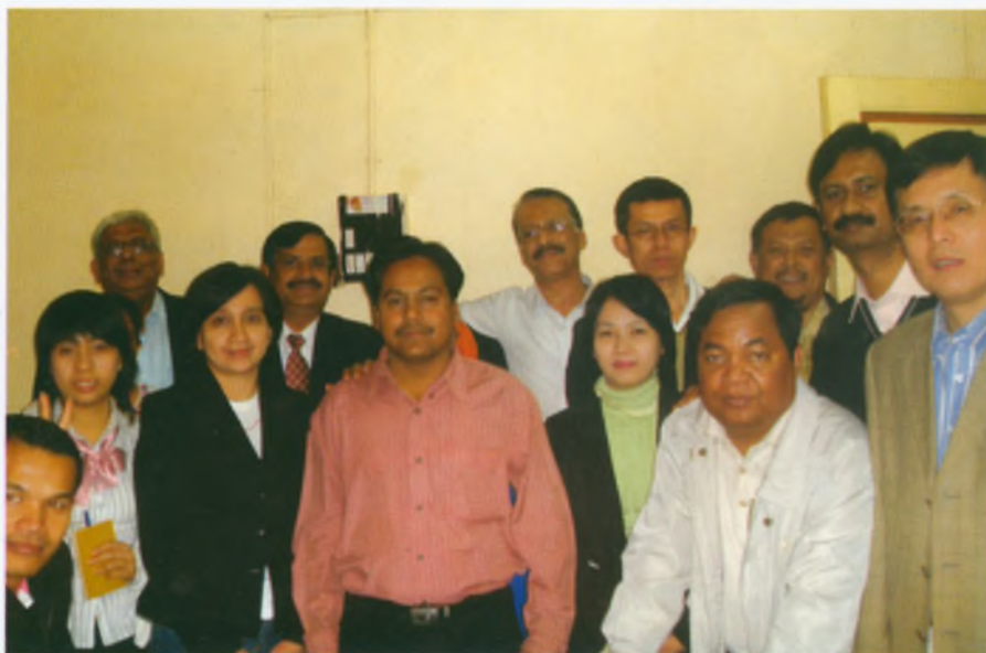
The participants during their visit to a primary dairy co-op in Anand.