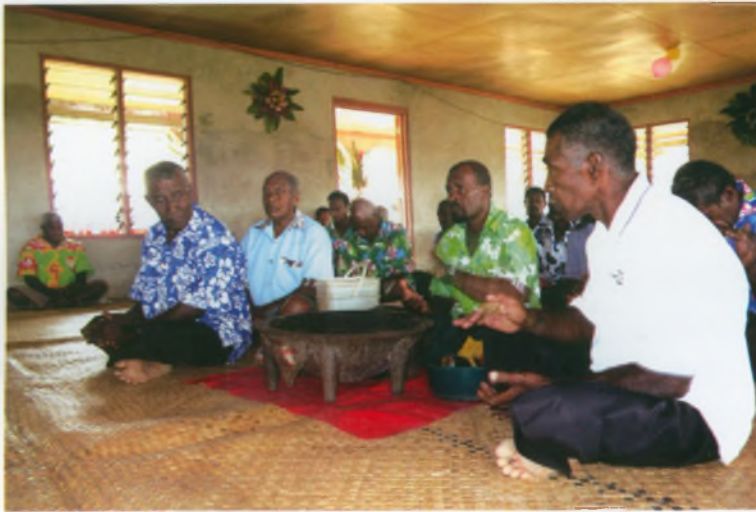
ICA Conference on Co-operative Development in South Pacific