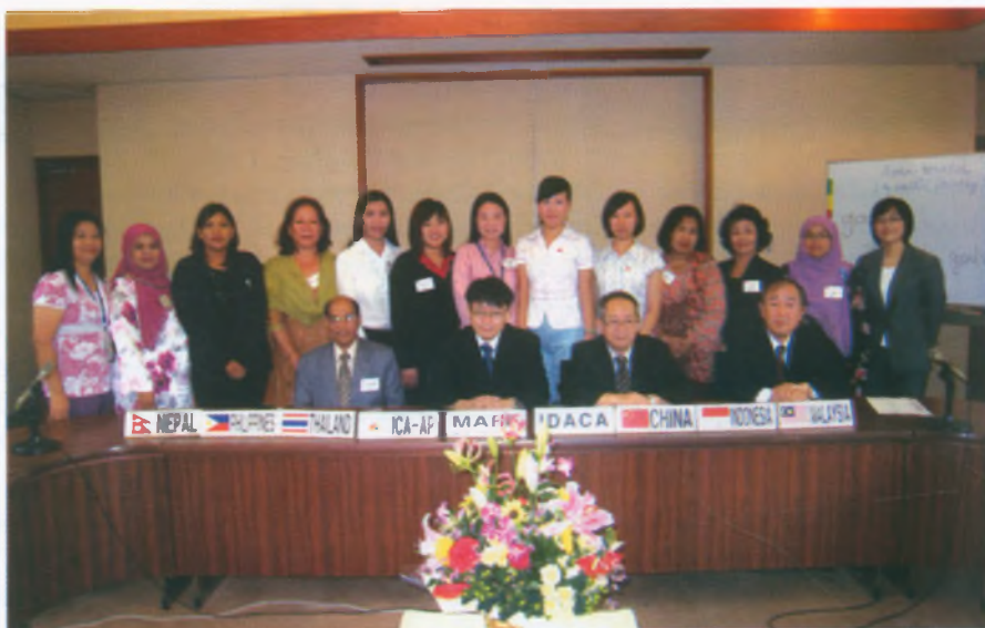
Women participants of the course at IDACA, Japan

Lecture-cum-practical field study visits assignments were combined to impart necessary knowledge to the