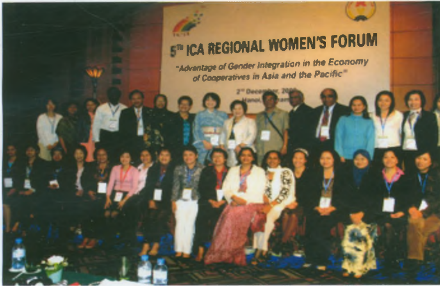
Delegates at the Women's Forum

The 5th Cooperative Regional Women Forum was held on 2nd December 2008 at Melia Hotel, Hanoi, Vietnam.