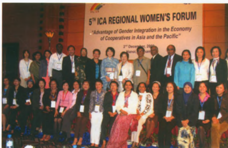
Delegates at the Regional Women's Forum