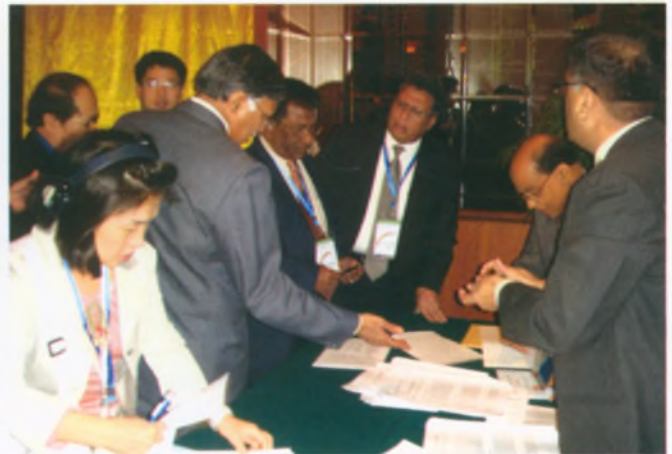
Members casting their vote to elect new Members of the Regional Board in Hanoi