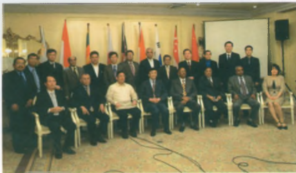
Standing committee members at the meeting in Philippines