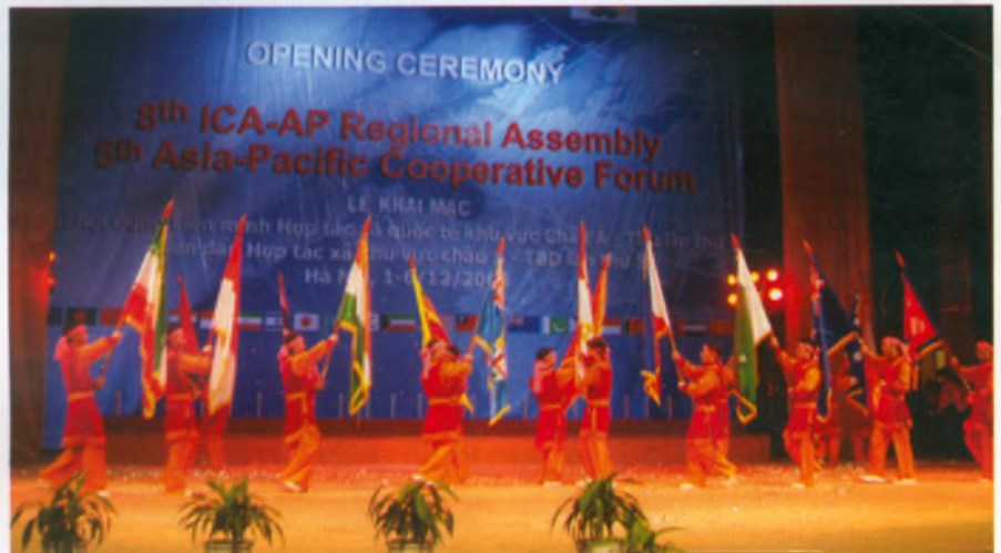
A cultural presentation at the Opening of the Regional Assembly

Research and University/Campus Cooperatives.