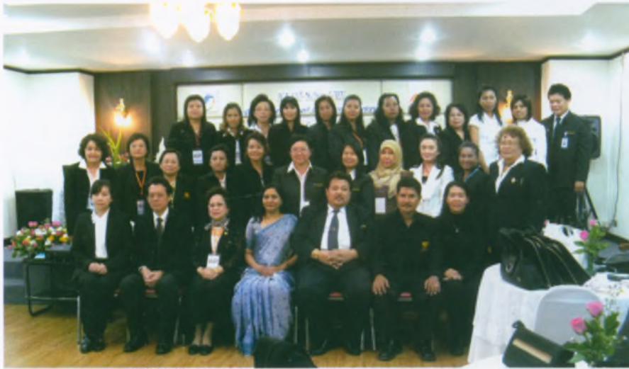
Participants of the National Trainers Training Programme at Bangkok

The ICA AP-CLT National Trainers Training Programme for “Management Capacity Building of Women for Gender Integration and Co-operative Development” was held from 7-11 January 2008 at CLT Training Centre in Bangkok.