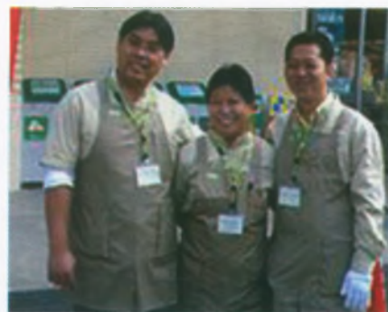
A group of trainees at the consumer coop store in Japan.