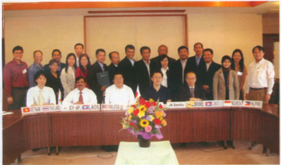
Participants of the Marketing Course at IDACA, Japan

The IDACA had developed a training curriculum, which included classroom lectures on various aspects, handled by the IDACA faculty members and specially-invited guest lecturers, organised field study visits and arranged direct communication with farmers and leaders of