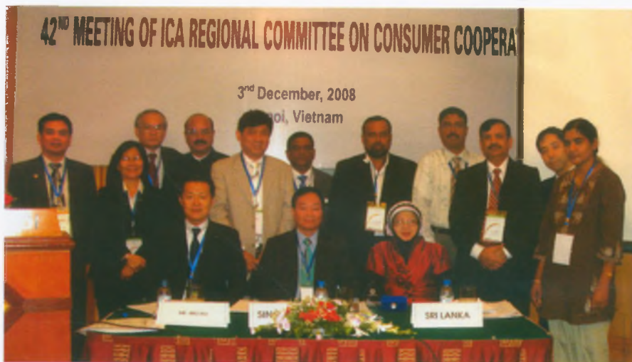
Delegates at the Consumer Committee meeting.