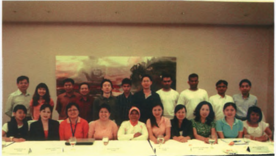
Participants of the Regional workshop at a photo op.