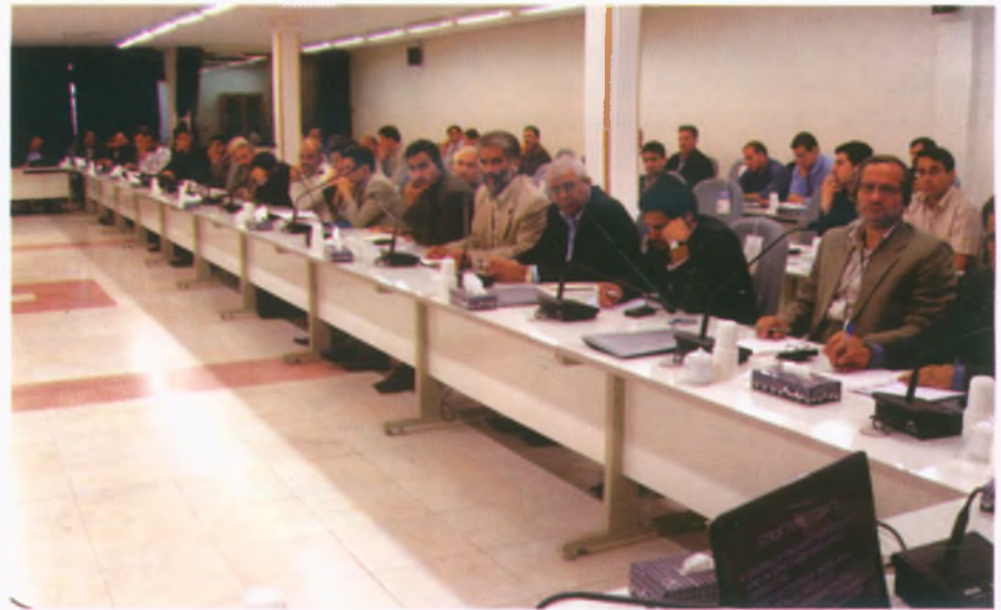
Delegates at the workshop in progress

A report from the National Federation of University Co-operative Associations of Japan was also