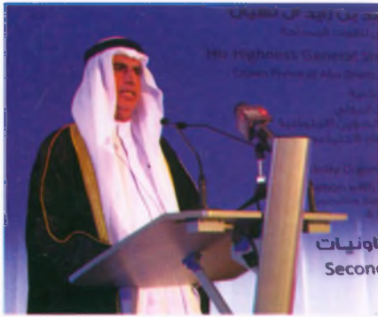
The Secretary General of GCC speaking at the Dialogue