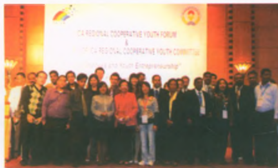
Delegates at the Regional Youth Conference