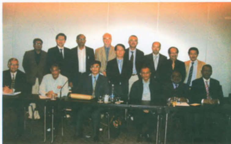
ICA-AP Board members at the special meeting of Standing Committee

The New ICA Membership subscription formula was adopted with a thumping majority at the Extraordinary General Assembly of ICA in Rome, Italy on 5th June 2008