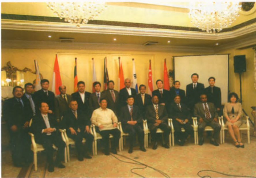
Standing Committee members at the meeting in Philippines

He further said that the new ICA Subscription Formula would be applicable from January 2009 onwards. The year 2008 would be a transition period.