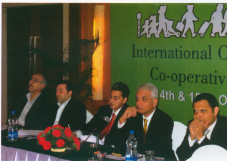
Panelists at the concluding session of the Conference

countries namely Iran, Italy, Japan, Korea, Malaysia, Maldives, Norway, Sri Lanka and UK.