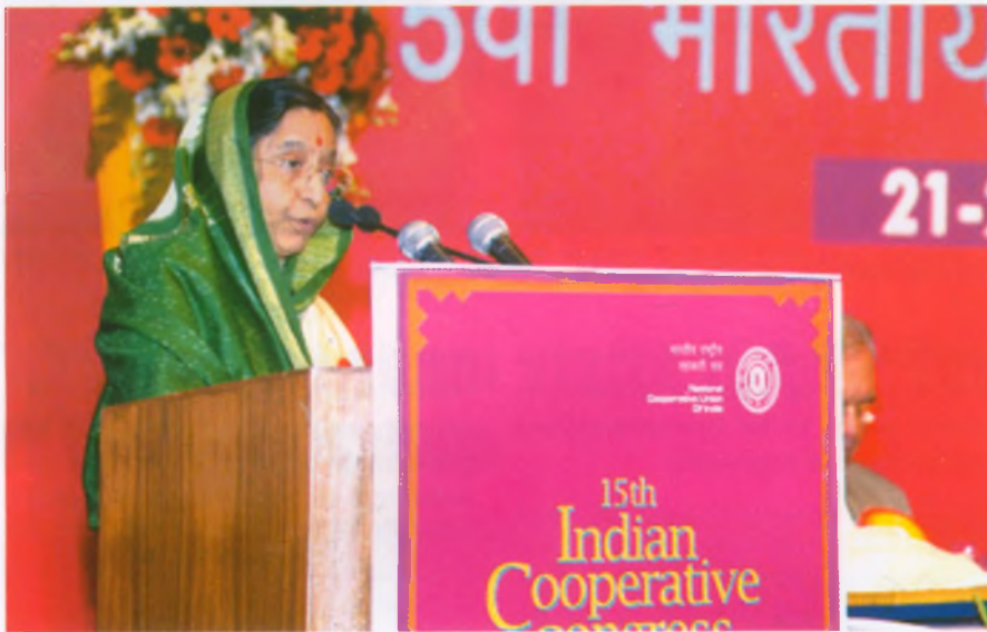
H.E. Smt. Pratibha Devi Patil, President of India inaugurating the 15th Co-operative Congress.

On the occasion of Valedictory Function of 15th Indian Co-operative Congress organised by National Co-operative Union of India, Narendra Modi, Chief Minister, Gujarat said that globalisation does not pose a threat but presents a good opportunity for Co-operatives to show their strength. "The Co-operatives should work with the real spirit like Gujarat where Co-operative movement is flourishing", he said. Modi further emphasised on the need for Co-operatives to come up in the field of water management because of their participatory character. In this respect, he announced that Government of Gujarat has decided to give rights to Co-operatives to manage and distribute the water of Sardar