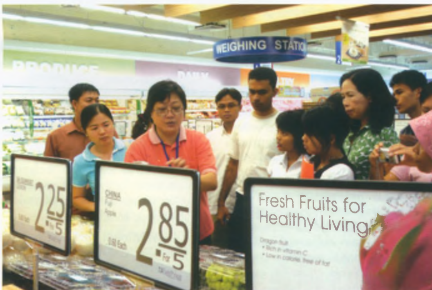
Delegates visit a FairPrice Co-op supermarket.

Some participants mentioned about improvement in customer service, brand-image management and inventory management, while they also pledged to create "hot spots" at their stores.