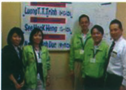
Some of the trainees of Japan consumer coop training programme.