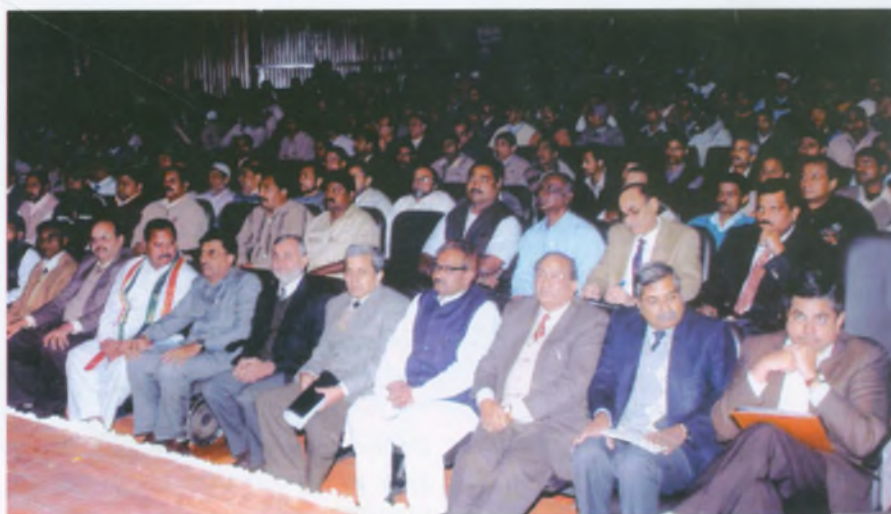
A view of the Conference delegates in attendance