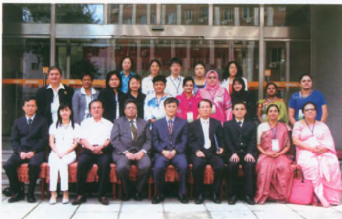
Women delegates and others pose for a group photo in Beijing

by All China Federation of Supply and Marketing co-operatives.