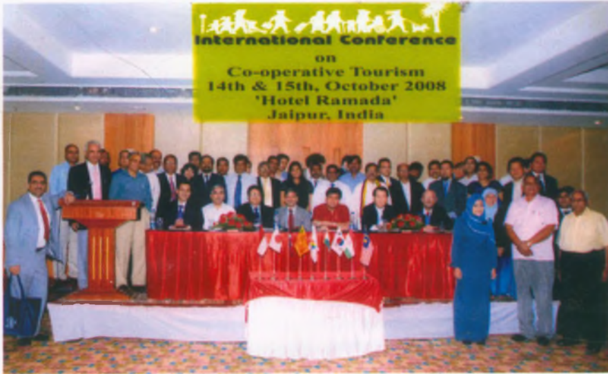
A view of delegates at the International Tourism Conference at Jaipur, India

An International Conference on Co-operative Tourism was jointly organized by ICA Asia Pacific & RICEM, Jaipur on the 14th & 15th of October 2008 at Hotel Ramada, Jaipur. The event was mainly sponsored by IFFCO. The theme of the Conference was "Friendly Tourism through Co-operatives" .