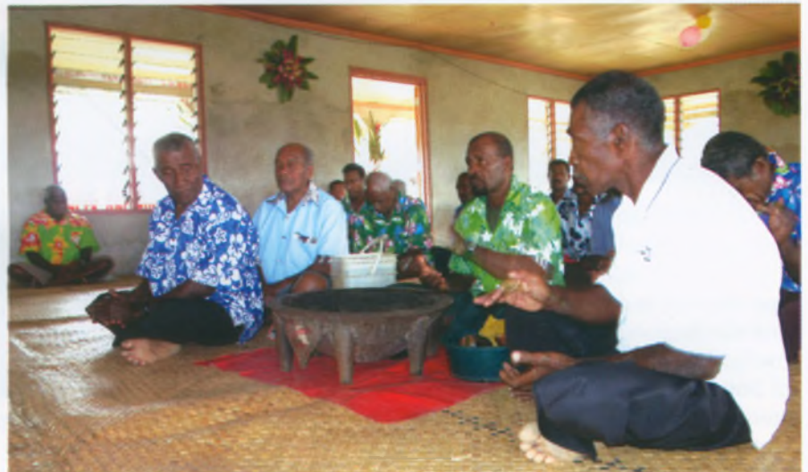
An Yaqona ceremony in progress. The participants of the Regional Conference visited the Lavia Co-operative where the ceremony took place.