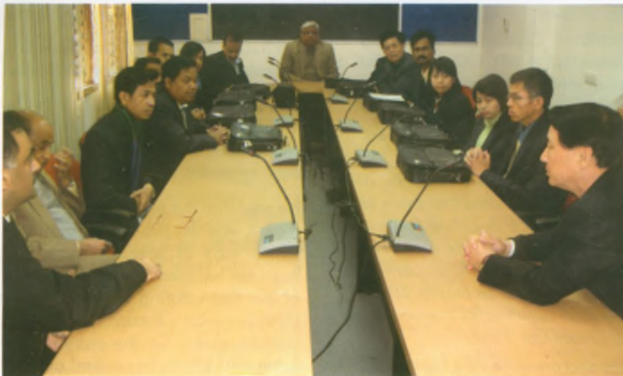
Participants of the training course at the ICA-AP office in New Delhi