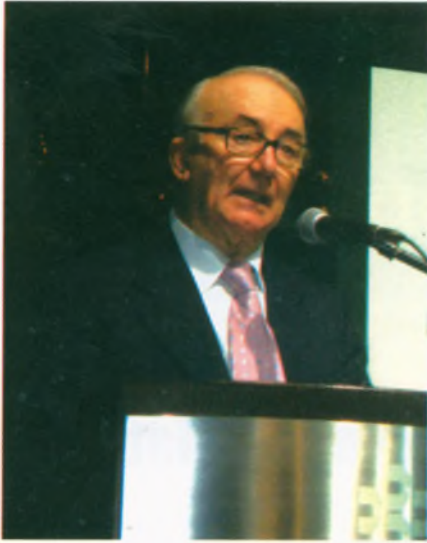
ICA President addressing the Conference

which was attended by the Secretaries to the Governments and the Chief Executives of the ICA Member Organizations.