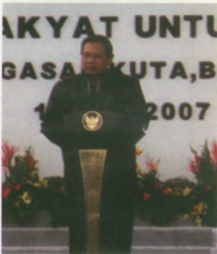
His Excellency, Susilo Bambang Yudhoyono, President of Republic of Indonesia delivering the inaugural speech.