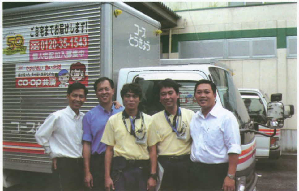
The trainee managers at the Han group delivery point of Coop Tokyo.

of each training program was about two weeks. Participants were selected after having met the requirements of the interview conducted by the ICA-AP secretary to the Consumer Committee. After arriving in Japan, trainees were given orientation at JCCU in Tokyo for four days before proceeding to the training centers for the actual program.