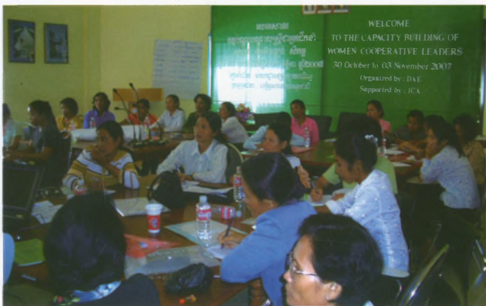
Delegates of the training program at work

In the last part of the training, the participants visited to the Barkong Angkor agricultural co-operative in Siem Reab Province. A half day interactive session was held where the chairperson, directors and other members of the co-opera-