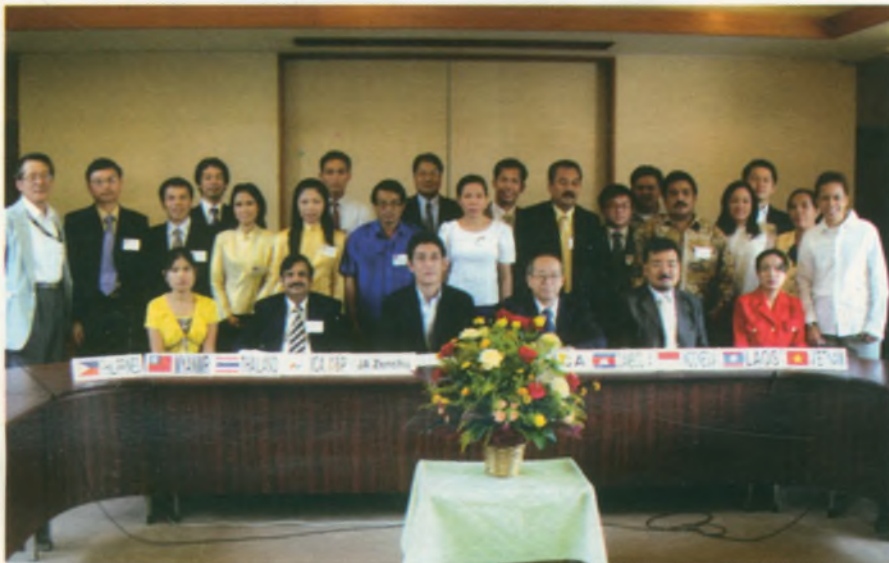
Participants of the Marketing Course at IDACA.