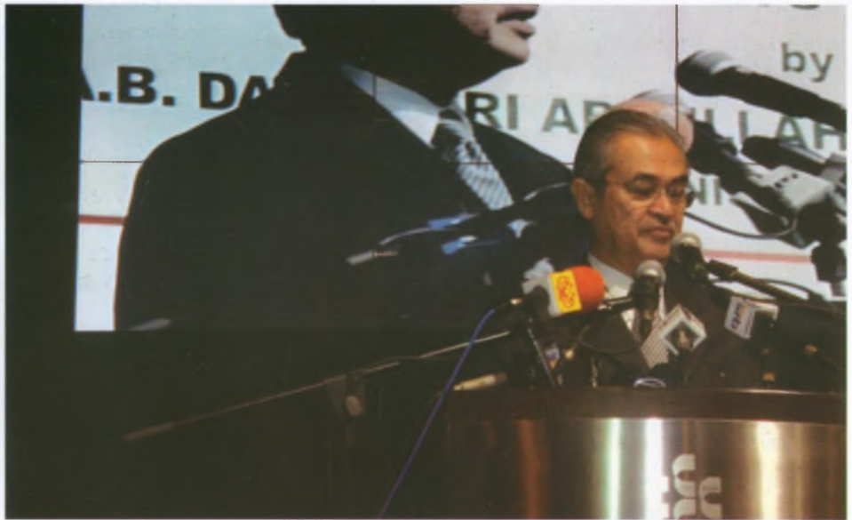
Mr. Abdullah Badawi, Prime Minister of Malaysia, speaking at the Ministers’ Conference

Although inclusive growth was seen as panacea for all economic evils, but the possible ways of integrating it within the system were seen like an unrealizable dream if cooperatives were not allowed to perform and position in the social economy. The need to clearly demonstrate the cooperative advantages by quoting real examples was projected high so as to bring up a list of indicators to benchmark its effectiveness. The Conference deliberated on the following merits of demand driven global economy