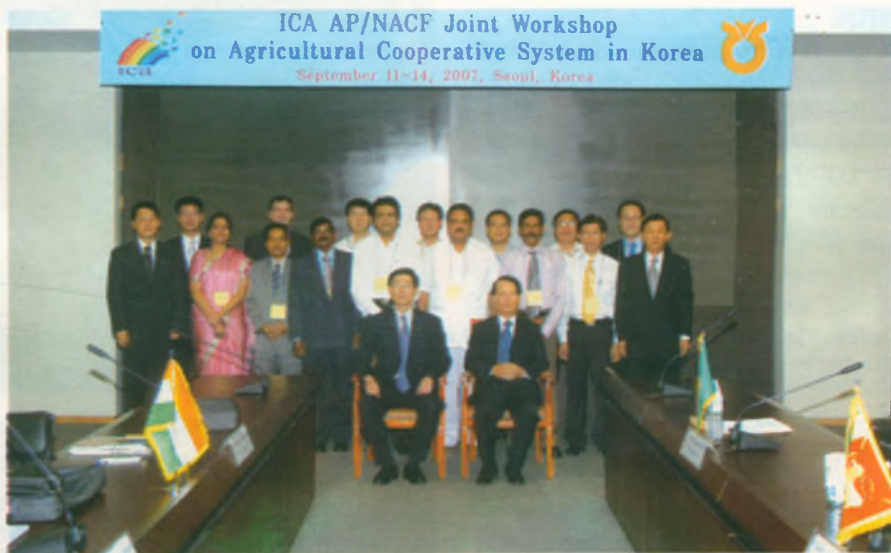
Participants of the Workshop at NACF, Korea

The ICA-AP has organised a Study Tour to Agricultural Co-operatives in the Republic of Korea, 10-15 September, 2007, in collaboration with the National Agricultural Co-operative Federation (NACF).