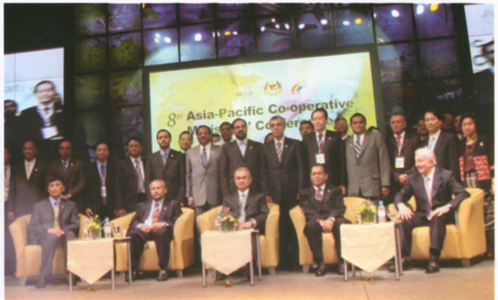
Delegates at a group photo in Kuala Lumpur

The consultation process conceived the idea of Co-operative Ministers' Conference first held in Sydney from 8 to 11 February 1990 on "Co-operative Government Collaborative Strategies for the Development of Co-operatives during