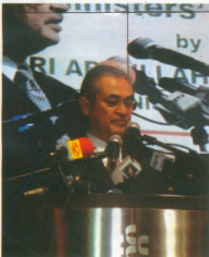
Malaysian PM speaking at the Conference

The pre-conference consultation to endorse the framework of the conference and draft the contents of the Draft Declaration for the consideration of the participating Ministers was held on 11 March 2007