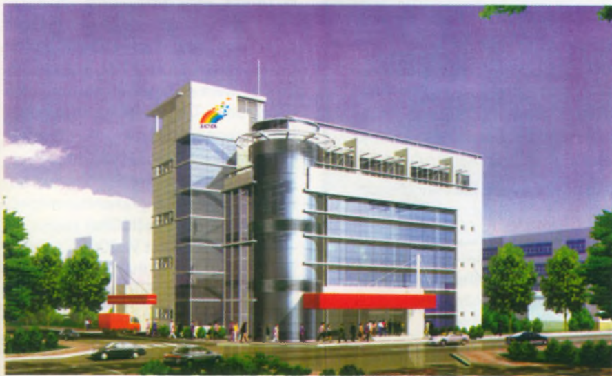
A model of the proposed new building of ICA-AP at Noida, India.

The ICA Asia-Pacific Regional Office recently acquired a plot of land in NOIDA, India, which was specially allotted to it by the Indian government authorities.