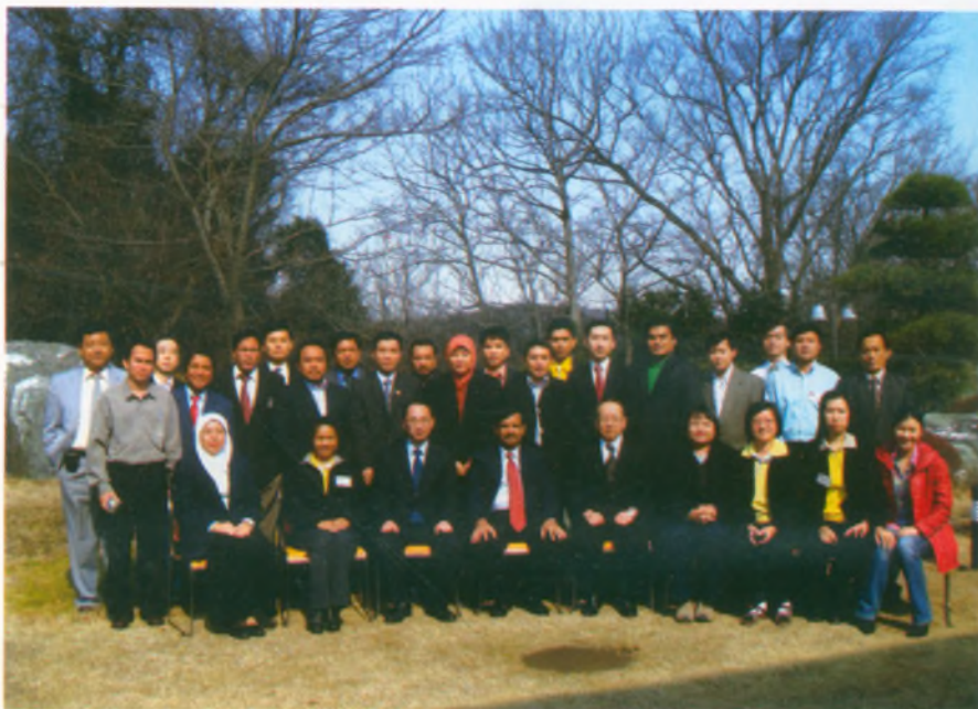
Participants of the 2nd Training Course on Marketing at IDACA, Japan

The field study visits were arranged to agricultural co-operatives in Shizuoka Prefecture of Japan. In Shizuoka Prefecture, it included the JA Shizuoka Prefectural Union; JA Shizuoka Prefectural Economic Federation and its facilities; JA Mikabi and its facilities; JA Shizuoka-shi and observation of Farmers’ Market run by it. In addition, the participants visited the headquarters of MAFF, ASEAN Rural Community Plaza in Tokyo and JA Zennoh Distribution Center, including a A-Co-op Store run