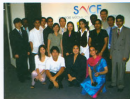
Participants at the ITE Co-operative

The delegates undertook a study visit to ITE Co-operative and Telecom Credit Co-operative. The Committee had its official meeting on 3rd February, 2007 wherein apart from elections, it held serious discussions about convening the Global Youth Conference in Singapore during