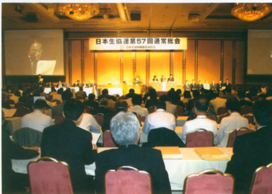
The JCCU Annual General Assembly in progress.