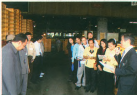
Participants of the marketing course at a field study visit.

The training course was designed in such a way that the participants, after returning to their respective countries, are able to help organise and strengthen the marketing activities of their respective primary co-operatives and other similar groups and make use