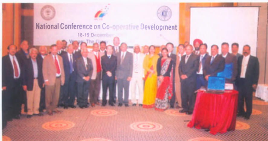
Distinguished delegates and co-operative leaders at the National Conference

The ICA in Asia-Pacific and ICA Domus Trust, in collaboration with the National Co-operative Union of India and the National Co-operative Development Corporation, organised a National Conference on Co-operative Development in India from 18-19 December, 2007, at the Grand Hotel, Vasant Kunj, New Delhi.