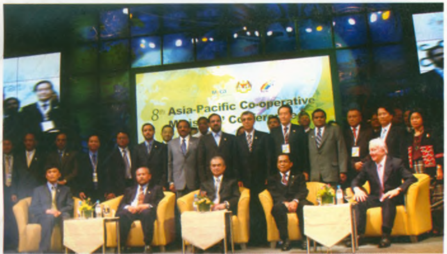
Co-operative Ministers and others with the ICA President at the Conference