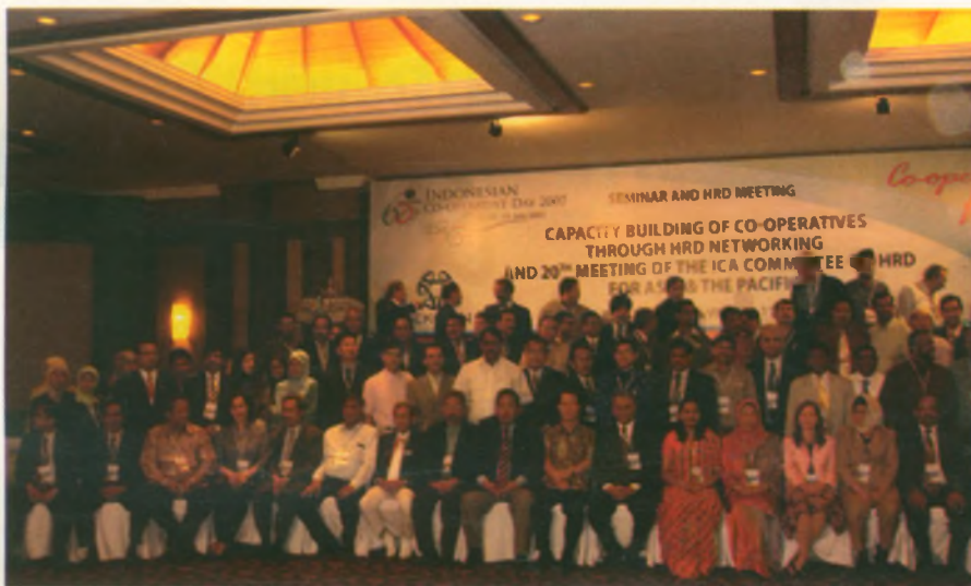
Distinguished delegates and co-operative leaders.