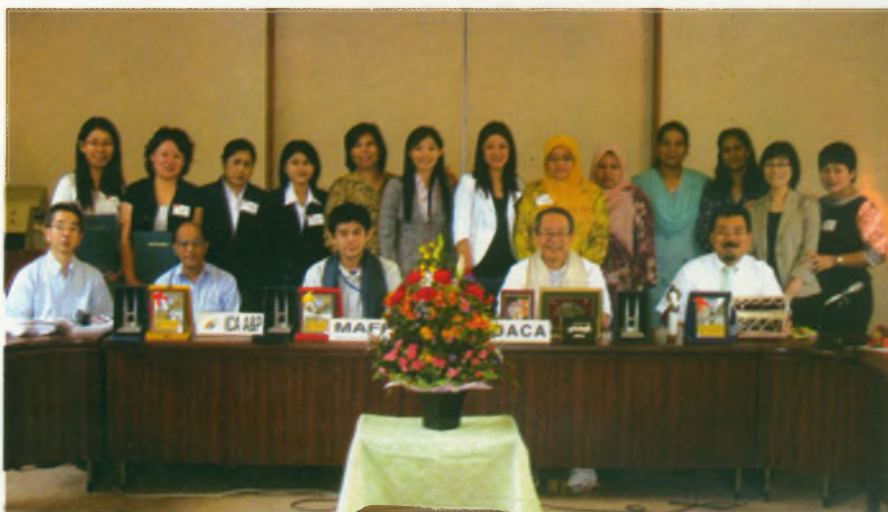
Rural women course participants with representatives of IDACA and MAFF.

The International Co-operative Alliance-Asia and Pacific [ICA-AP] in collaboration with the JA-ZENCHU [Central Union of Agricultural Co-operatives of Japan] and the Institute for the Development of Agricultural Co-operation in Asia [IDACA] held the 2nd Training Course on “Promotion of Sustainable Enterprises for Rural Women” from 13th July to 18th August 2007 in the Philippines and Japan.