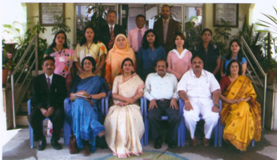
Women delegates of the networking programme

The ICA-AP organised an exposure and networking programme for women co-operators on 11-15 December 2007 at Pune, India.