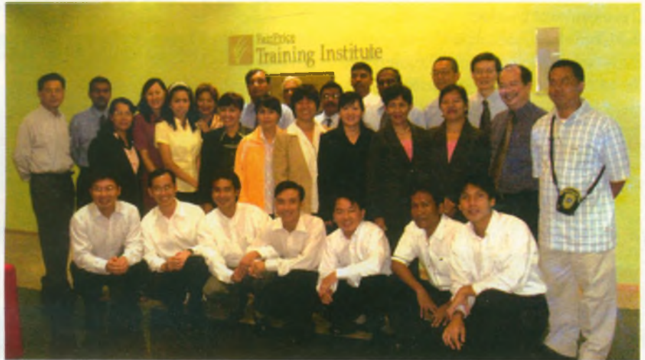
Participants of the Workshop at the NTUC Fairprice Institute in Singapore

The main lectures cover four important areas of store management, "Store Management", "Visual Merchandizing", "Basic Category Management", "Staff Training and