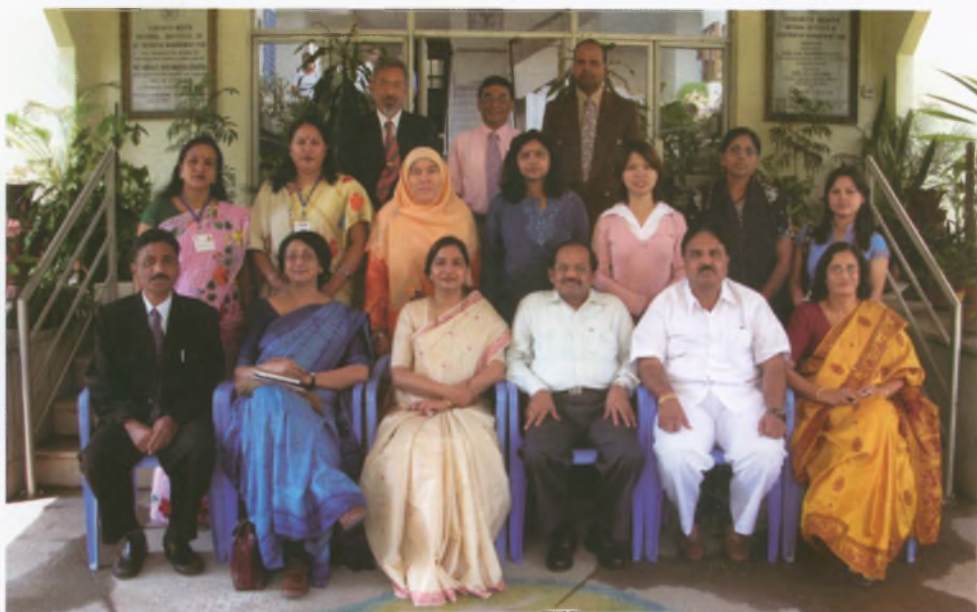
Delegates at the Networking programme posed for a photo

The programme was divided into 3 parts. On the first day, there was the inaugural session and classroom interaction combined with information on best practices in the participants' own countries. A study visit to Lijjat Papad factory was organized on the second day. Though this factory is not registered under the Co-operative Act, the organizing is functioning on co-operative pattern – collective effect