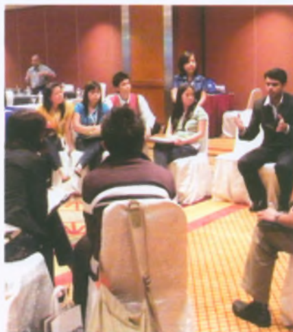
Group discussion amongst the delegates at the Youth Conference

More than 150 delegates from Italy, Japan, Indonesia, Philippines, United States, Sri Lanka, Russian Federation, Korea, Thailand, Vietnam, Pakistan, Singapore, Romania, Nepal, Myanmar, India, Canada and Colombia participated at the event. The youth delegates discussed on the issues pertaining to Youth participation in co-operative activities globally and they have also came up with interesting