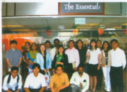
Participants at SNCF office