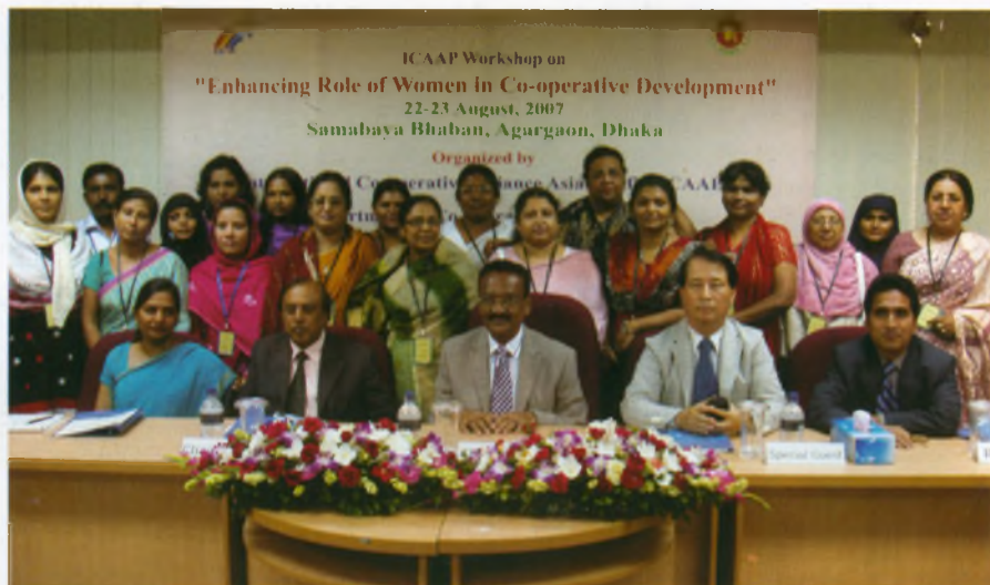
Women Co-operative leaders at a group photo

The workshop discussed issues like Understanding Co-operative Movement in Bangladesh and ICA, Gender Integration and Women Empowerment, HIV/AIDS Awareness and Co-operatives.