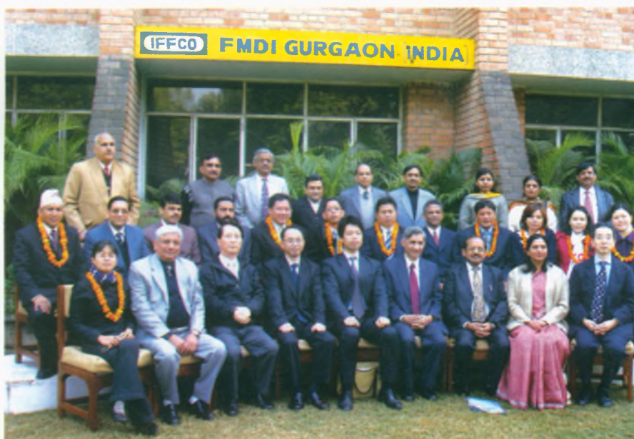
The participants of the 1st Training Course at FMDI, India

There were 12 participants, from Cambodia, China, India, Indonesia, Laos, Myanmar, Nepal, Philippines, Sri Lanka, Thailand and Vietnam. The participants proceeded to the Institute of Rural Management [IRMA] on 25th January, and they attended the IRMA