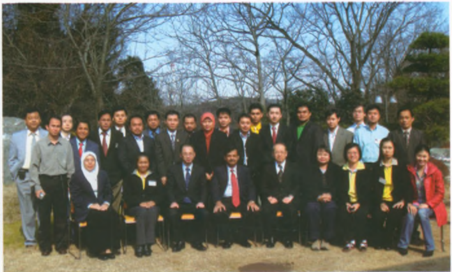
Participants of the training project for Capacity Building for Marketing at IDACA.

The training course was designed in such a way that the participants, after returning to their respective countries,