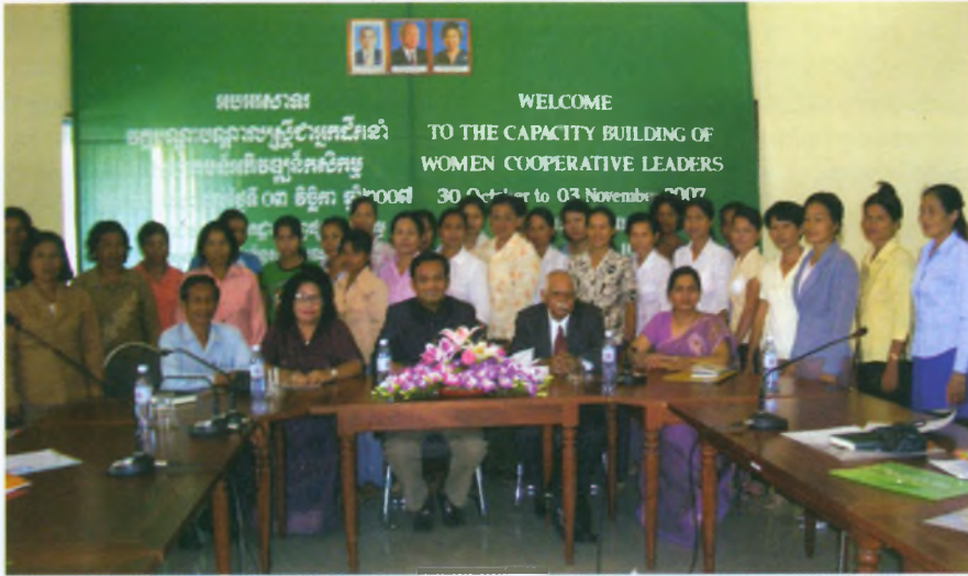
The delegates of the ICA-AP capacity building programme in Cambodia.

The ICA is implementing a project on the promotion of sustainable model of Agricultural Co-operatives in Cambodia in collaboration with AGRITERRA.