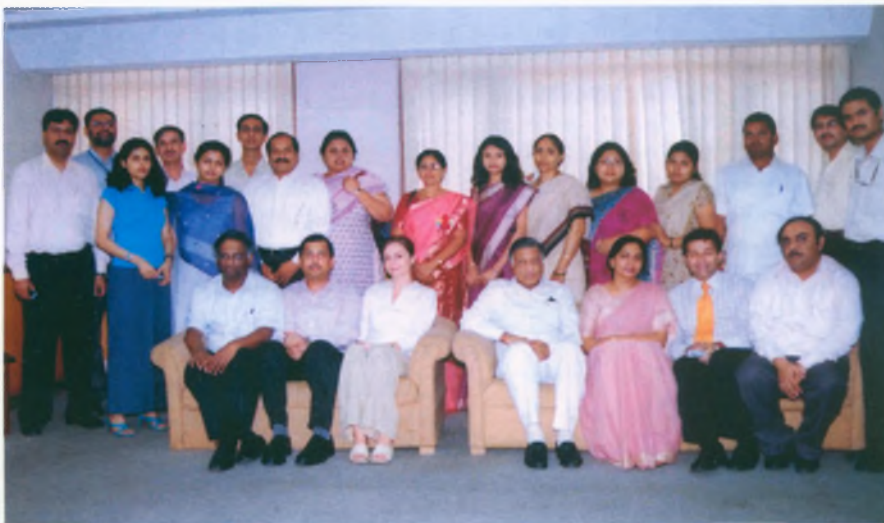
The participants posed for a photograph.

The main training for 110 men and 110 women co-operatives completed in December, 2006. Thereafter, 4 follow up/refresher training, one in each state, was held in February-March, 2007.