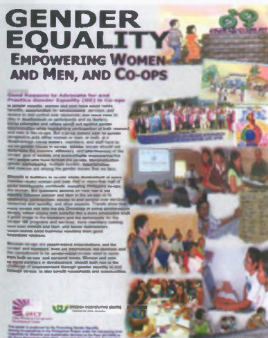
AWCF poster on gender equality in co-ops

The Asian Women in Co-operative Development Forum (AWCF) is continuing to implement the activities of the "Promoting Gender Equality Among Co-operatives in the Philippines Project" that is supported from 2010-2012 by the Swedish Co-operative Centre (SCC), with fund support from the Swedish International Development Co-operation Agency (SIDA). AWCF is a regional