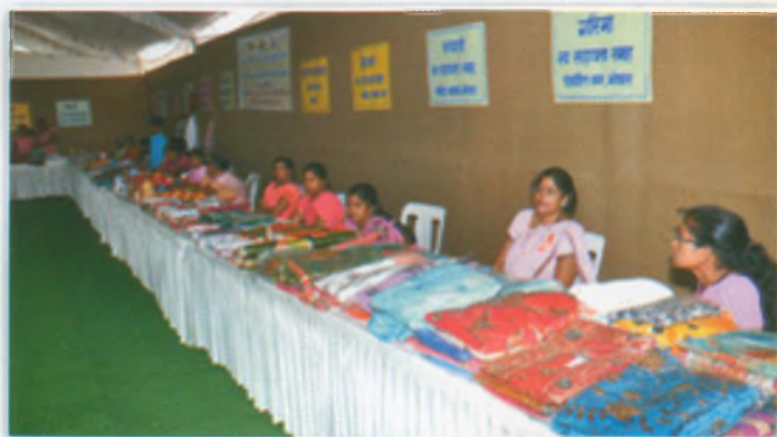
Members of SHGs seen with their products

On this occasion, the Minister said that the women segment of the society needs to be motivated to join the main stream of economic development. He also expressed that Self Help Groups play important role in managing efficient social services in rural areas and urban co-operative banks may play vital role in dispensing of micro credit in urban and rural areas as well.