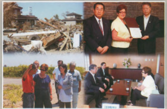
The ICA President with Co-operators