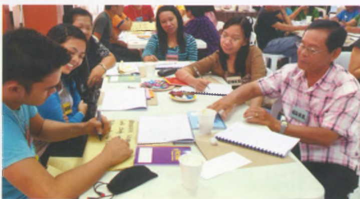
Women and men learn more about GE advocacy in AWCF project

The Project is under SCC's Philippine country programme "Advancing Civic Capacities for Effective and Sustainable Services to the Poor" (ACCESS to the Poor Programme). In this Programme, AWCF joins four Philippine national organizations in the implementation. In addition, 15 co-ops located nationwide in the Philippines are also the partners in AWCF's gender equality (GE) Project for the SCC Programme.