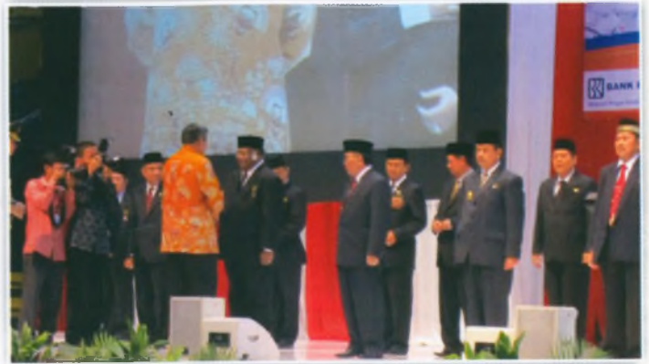
The President of Indonesia awarding excellent co-operators

In the presence of the President of Indonesia, Dr. H. Susilo Bambang Yudhoyono and his Co-operative Minister, Dr. Syarifuddin Hasan MM. MBA, the 64th National Co-operative Day Celebrations in Indonesia was held on 12 July at the