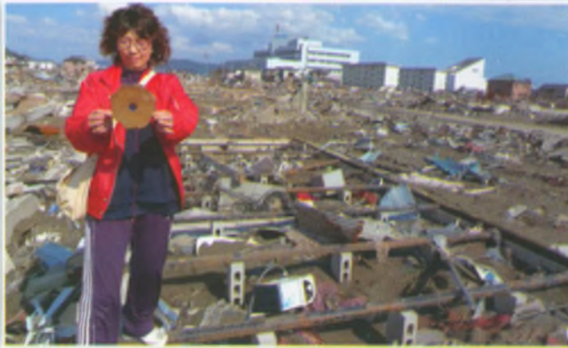
Bihoro Hall in Ishinomaki City

On May 21st, 42 members gathered at a general meeting of Tohoku region representatives in Sendai, exchanging their experiences and plans for the future. For example, the members in Noda Village (Iwate Prefecture) have