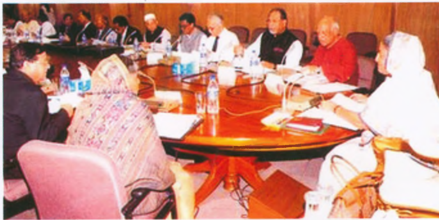
Meeting with the Prime Minister Sheikh Hasina