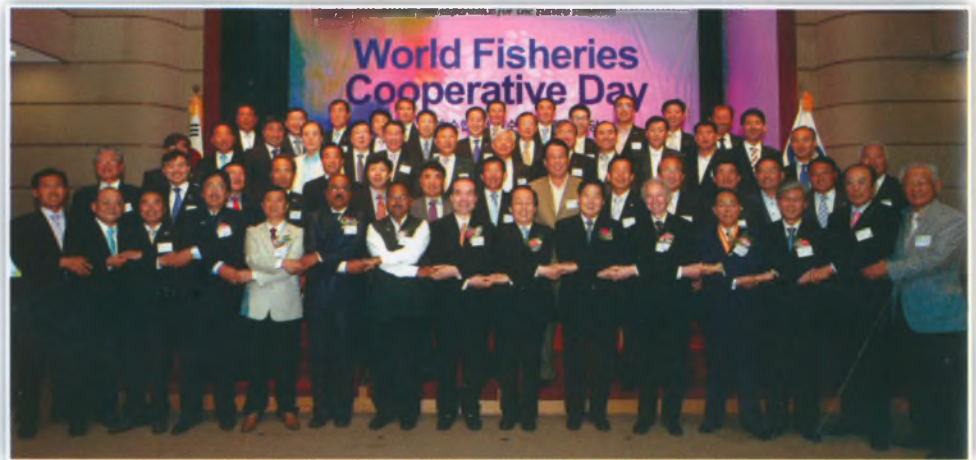
The participant with Charles Gould, ICA-DG & Dr. CHOI

The first World Fisheries Co-operative Day was commemorated by International Fisheries Co-operative Organisation (ICFO) and Korea National Federation of Fisheries Co-operatives (KNFC) on 16 June, 2011 in Seoul, Korea with 258 participants including ICA Director-General, ICFO representatives, minister of ministry of food, agriculture, forestry and fisheries, a national assembly member, government officials, experts of co-operative and presidents of member fisheries cooperatives in Korea, etc.