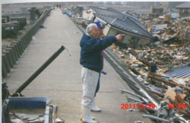
The chairman of JF Taro FCA directing recovery work