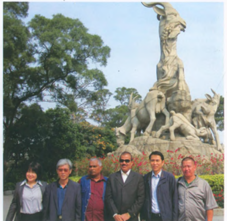
Board Members on a trip

Other matters such as proposal of ICA-Americas to amend the 7th Cooperative Principle,