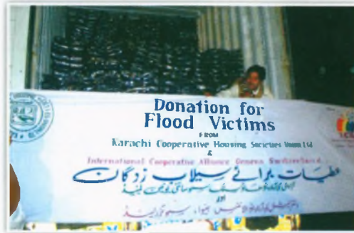
Blankets for distribution