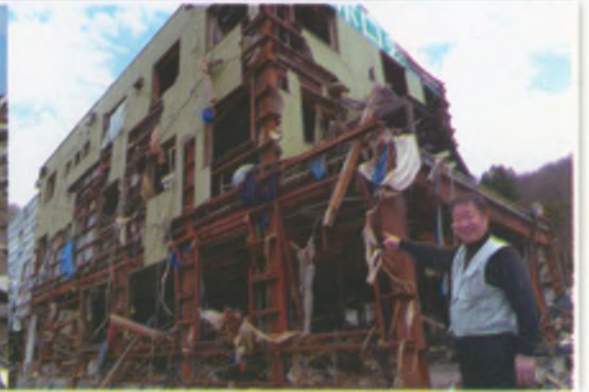
This is where Onagawa Office used to stand

been offered home care jobs at temporary houses, while other members in Fukushima feel needs to create jobs for those who became unemployed due to the earthquake.