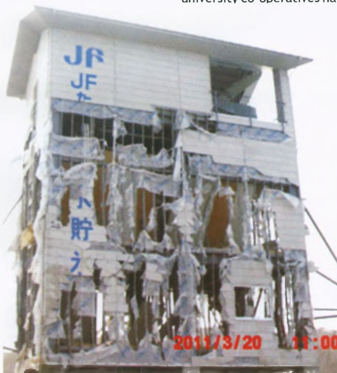
The ice-making facility of JF Taro FCA destroyed by the Tsunami

on the information on what is needed in which area.