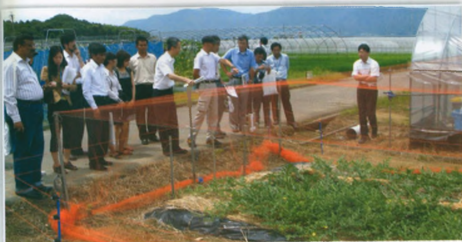
Participants at a farm

Perhaps due to poverty and large number of population, most of Asian countries focus more on increasing food production and generally less attention is paid to safety and quality of the food resulting into health and environmental problems. Uninformed/misinformed use of chemicals, pesticides and fertilizers and other farm inputs impact the quality of food and also affect the soil etc. Therefore, it has become necessary to ensure quality and safety management of farm products including meats, dairy and poultry etc. for better health of people, better value to farm products and conservation of soil and natural resources as well.