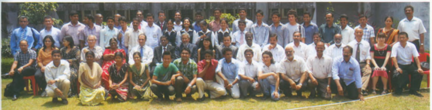
A group photo of the participants

The workshop concluded by award of certificate to the participants.