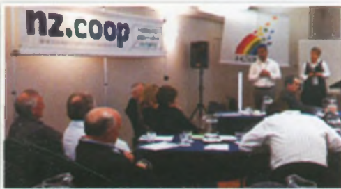
The seminar in progress

With attendees arriving from as far away as Bangkok, over 50 people from more than 20 co-ops descended on Wellington, New Zealand at the end of August for a two day seminar. Speakers came from Canada and Western Australia as well as New Zealand to talk on "The Evolving Nature of Governance and Capital in Co-operative and Mutual Business".