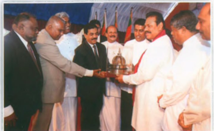
Hon'ble President with President and General Manager of NCC