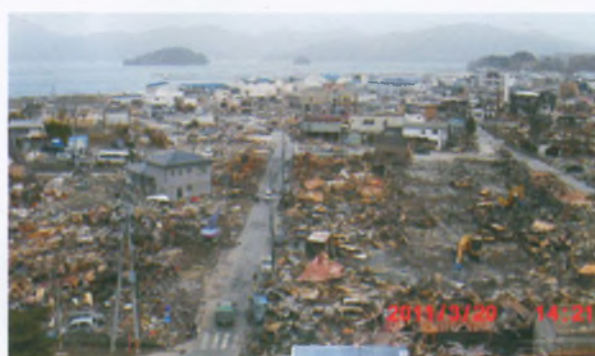
Once prosperous fishing town : when will it be when fishermen can resume normal life as before ?