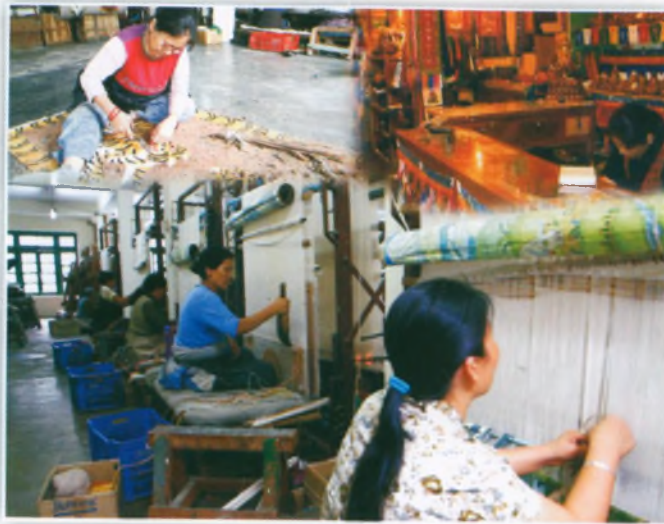
Glimpses of Co-op

The strength of the co-operatives are immense. It can not only provide the members of a co-operative security, but also makes them self-reliant. So when the members of a co-operative taste the fruits of success, the result is indeed electrifying. Not surprisingly, Tibetan Handicraft Production-cum-sale Industrial Co-operative Society is one such society which has surged ahead in the recent times imbibing the true ethos of co-operative. Located in Macleodganj in Dharamshala district of Himachal Pradesh State in India, this society has not looked back ever since it was formed in 1961. After the Indian Government provided asylum to the Tibetan refugees in the hill town of Dharamshala in early 1960s, a sustainable and responsible rehabilitation process became an imperative need of the newly formed and still settling Tibetan community. An ethical business practice was most desired by them, and it was felt that a co-operative form of an enterprise was most suited to serve the needs of the refugee population. In 1969, after eight years of working relentlessly as an informal enterprise, the handicrafts society was registered under the Co-operative Societies Provision Act of the Indian State of Himachal Pradesh. The