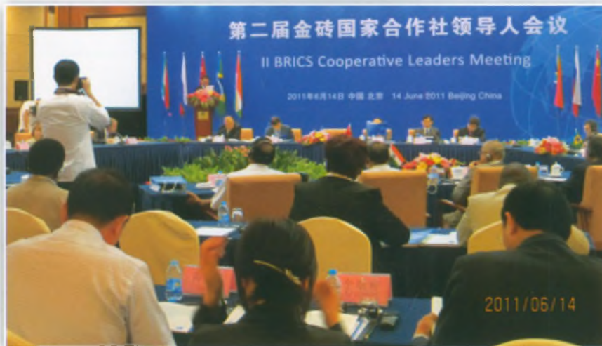
The Meeting in progress