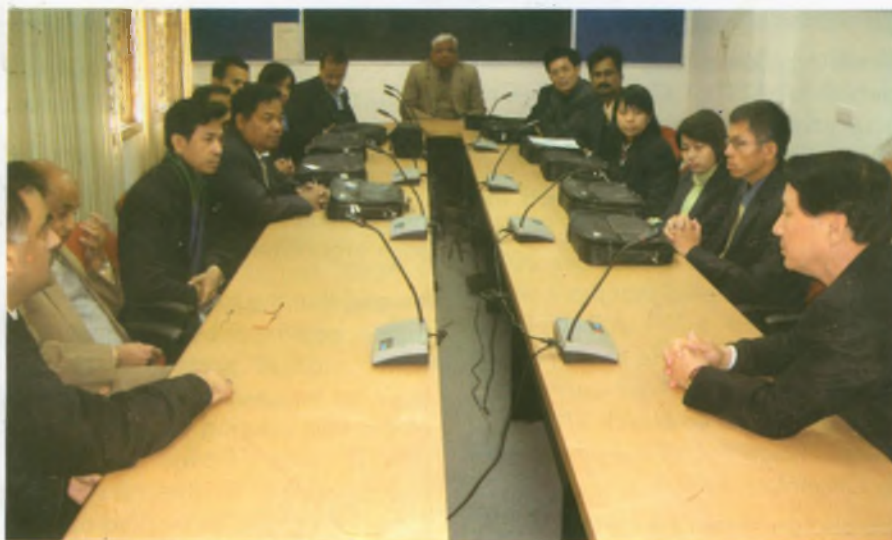
Participants of the training course at the ICA-AP office in New Delhi