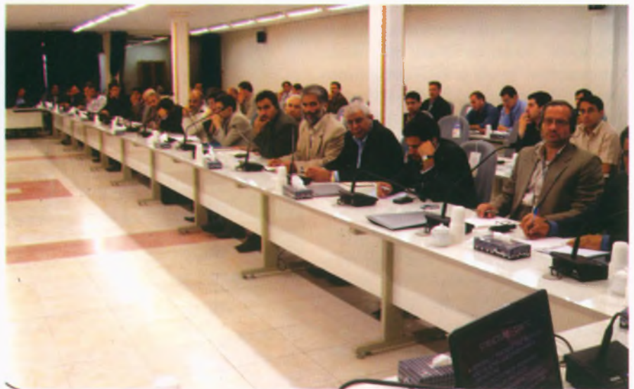
Delegates at the workshop in progress

A report from the National Federation of University Co-operative Associations of Japan was also