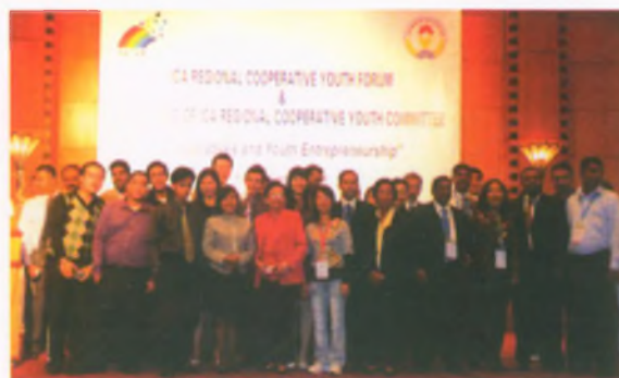
Delegates at the Regional Youth Conference