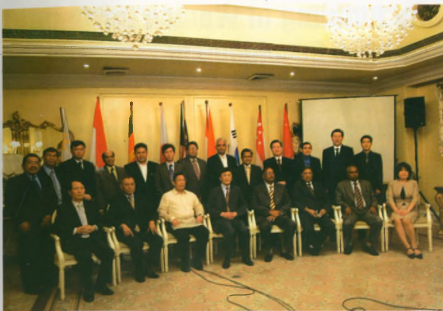
Standing Committee members at the meeting in Philippines

He further said that the new ICA Subscription Formula would be applicable from January 2009 onwards. The year 2008 would be a transition period.