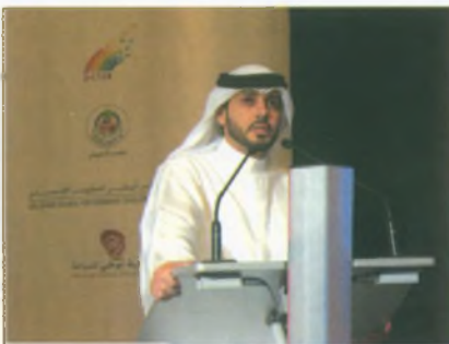
Mr. Abdulla Alsuwaidi, Dy. Minister, Social Affairs, Govt. of UAE summing up the recommendation