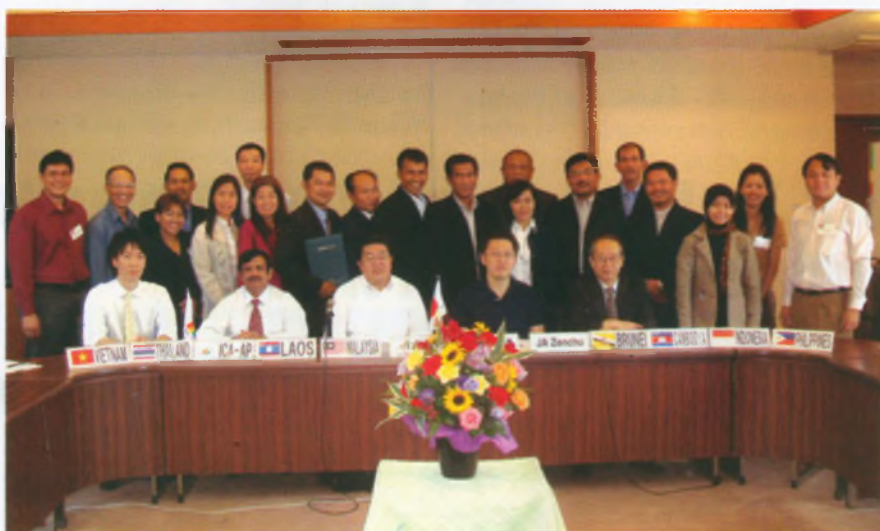
Participants of the Marketing Course at IDACA, Japan

The IDACA had developed a training curriculum, which included classroom lectures on various aspects, handled by the IDACA faculty members and specially-invited guest lecturers, organised field study visits and arranged direct communication with farmers and leaders of