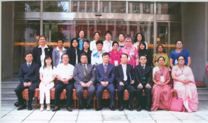
Women delegates and others posed for a group photo in Beijing

The ICA-AP Seminar on "Enhancing Women's Role in Co-operative Business" was held in Beijing, China from 23-25 September, 2008. The programme was hosted by All China Federation of Supply and Marketing co-operatives. A total of 15 persons, 12 cooperative leaders (11 women and 1 man) from 5 countries namely-India, Nepal, Vietnam, Philippines and Malaysia and 3 women co-operators from China attended the programme.