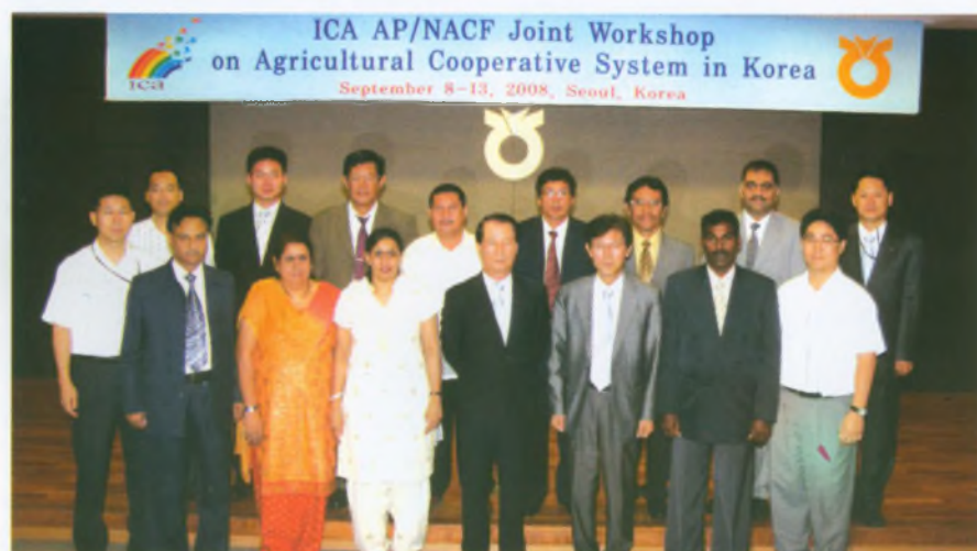
Participants of the workshop at a photo op in Seoul, Korea.

system (Agri-marketing, Banking) and role of cooperatives in the Korean economy.