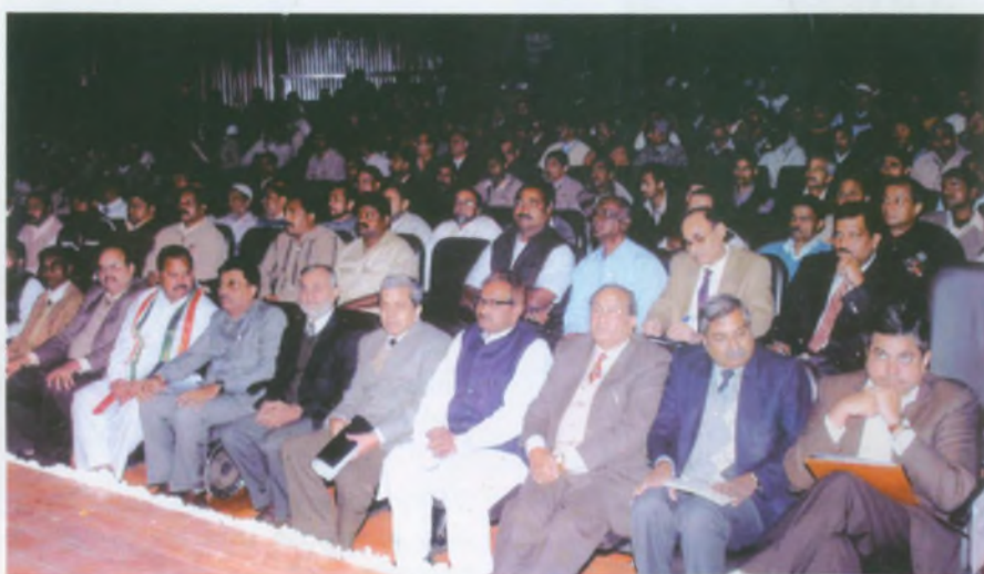
A view of the Conference delegates in attendance