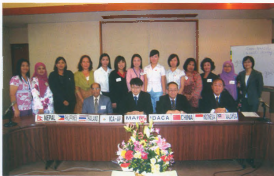
Women participants of the course at IDACA, Japan

Lecture-cum-practical field study visits assignments were combined to impart necessary knowledge to the