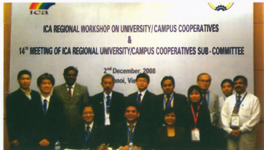
Delegates of the University/Campus Cooperatives Committee meeting