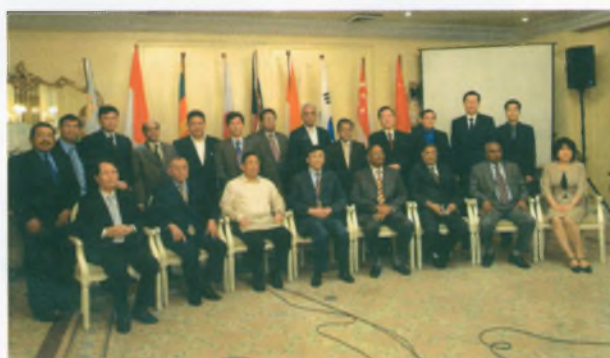
Standing committee members at the meeting in Philippines