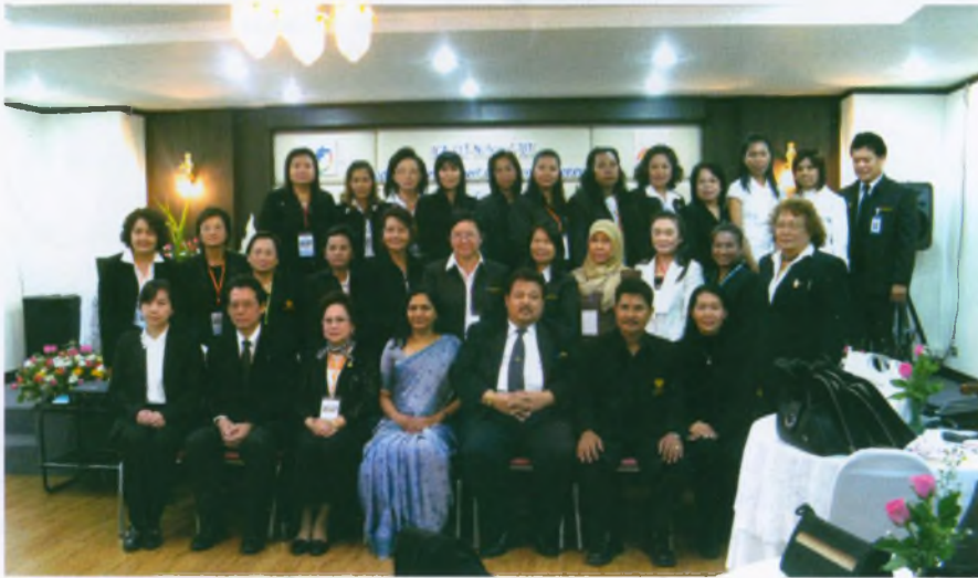
Participants of the National Trainers Training Programme at Bangkok

The ICA AP-CLT National Trainers Training Programme for "Management Capacity Building of Women for Gender Integration and Co-operative Development" was held from 7-11 January 2008 at CLT Training Centre in Bangkok.