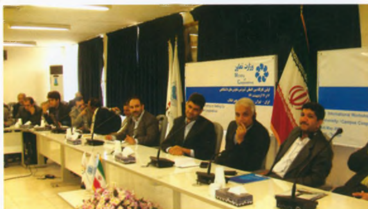
A view of the Workshop on University/College Co-operatives, Iran

The workshop was attended by almost 90 participants.