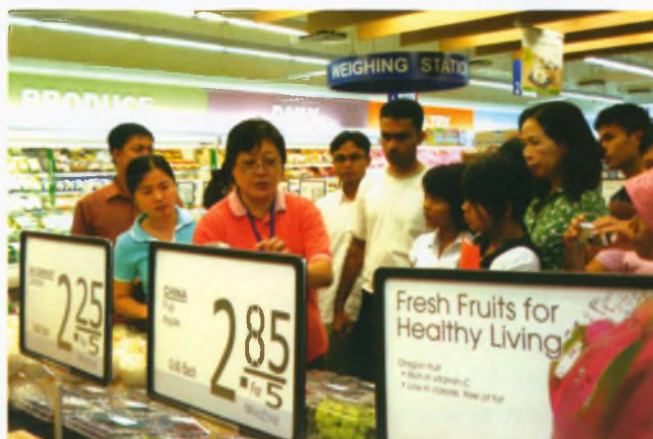
Delegates visit a FairPrice Co-op supermarket

The participants visited a hypermarket and two supermarkets of NTUC FairPrice and its competitors' stores on the second day. They learnt about practical techniques for store operation such as merchandise assortment,