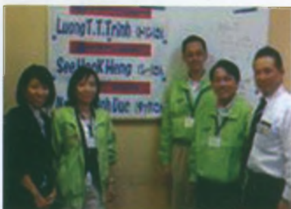
Some of the trainees of Japan consumer co-op training programme.