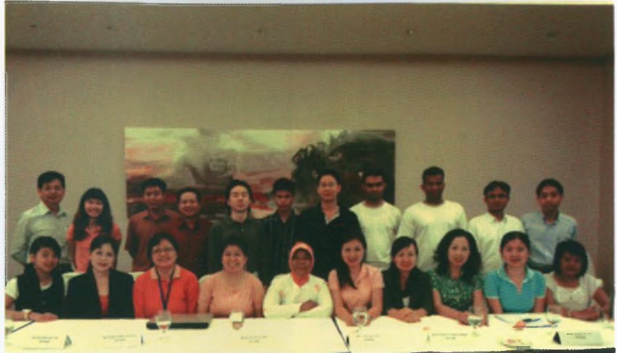
Participants of the Regional workshop at a photo op.