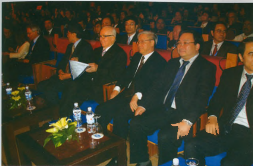
Delegates at the joint inauguration of the Regional Assembly and Coop. Forum

The joint opening of ICA Asia Pacific Regional Assembly and Coop Forum was done by H.E. Mr Nguyen Phu Trong, Hon'ble Chairman of the National Assembly of the Socialist Republic of Vietnam on 3rd December 2008 at My Dinh National Convention Centre, Hanoi in Vietnam.