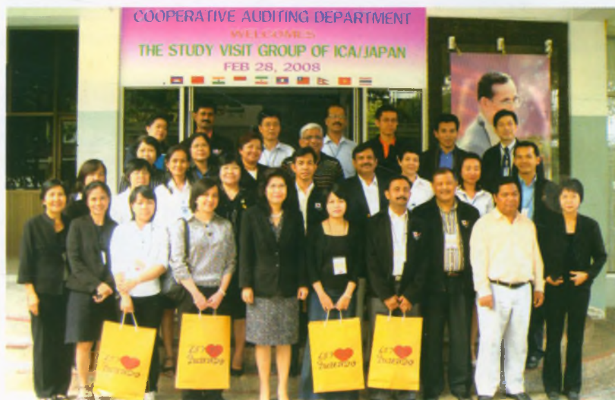
The participants posed for a photo at the Co-operative Audit Department, Bangkok