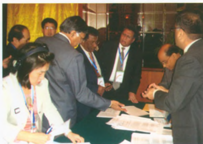
Members casting their vote to elect new Members of the Regional Board in Hanoi