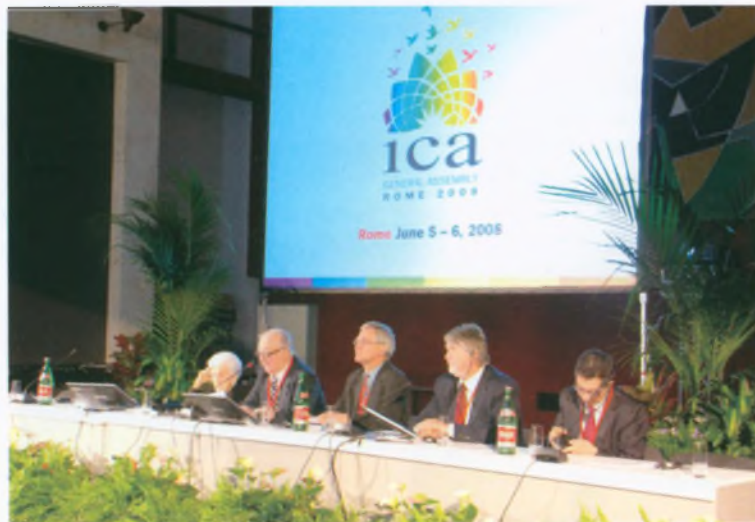
Delegates at the Extraordinary General Assembly 2008, Rome

members of the ICA Asia Pacific Standing Committee and said that the new system in long run would definitely increase the membership base of ICA and eventually make co-operatives appreciate about the merits of active user members in the development of co-operatives.