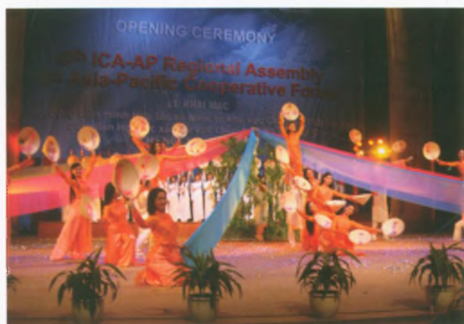
A cultural show presented at the Regional Assembly

in China in 2010 was accepted by the house.