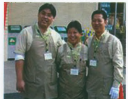
A group of trainees at the consumer co-op store in Japan.