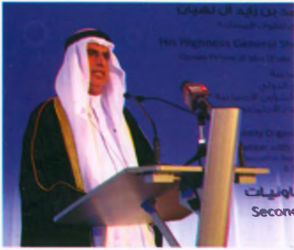
The Secretary General of GCC speaking at the Dialogue