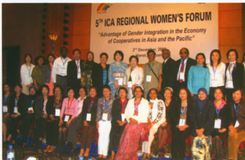
Delegates at the Regional Women's Forum