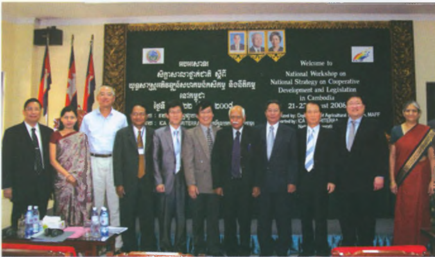
Participants of the workshop pose for a group photo

The workshop was organized on 21-22 August, 2008 by the Department of Agricultural Extension (DAE), Ministry of Agriculture, Forestry and Fisheries (MAFF) and supported by ICA-AP, AGRITERRA and Singapore National Cooperative Federation (SNCF). The important aspect of this workshop was that it was organized as a part of ICA-AP project interventions for promoting and strengthening a sustainable model of agricultural cooperatives for last three years in Cambodia.