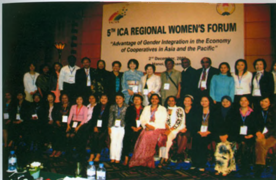
Delegates at the Women's Forum

The 5th Cooperative Regional Women Forum was held on 2nd December 2008 at Melia Hotel, Hanoi, Vietnam.