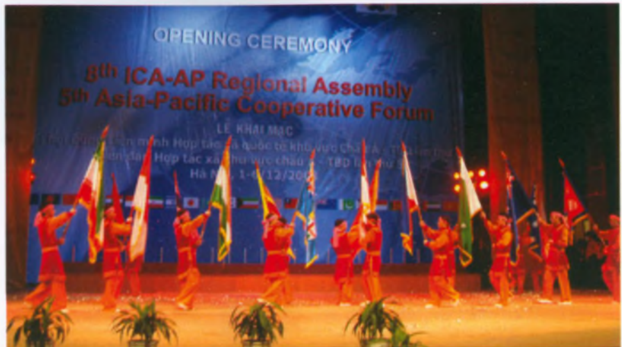
A cultural presentation at the Opening of the Regional Assembly

The minutes of the last meeting held in Colombo, Sri Lanka on 18th August 2006 were confirmed. According to the new rules of ICA approved by the Special General Assembly at Rome on 6th June 2007, ICA-AP also revised its rules. The Regional Assembly unanimously approved the new rules of ICA-AP. The Regional Assembly also approved the constitution of the ICA-AP Committees on Cooperative