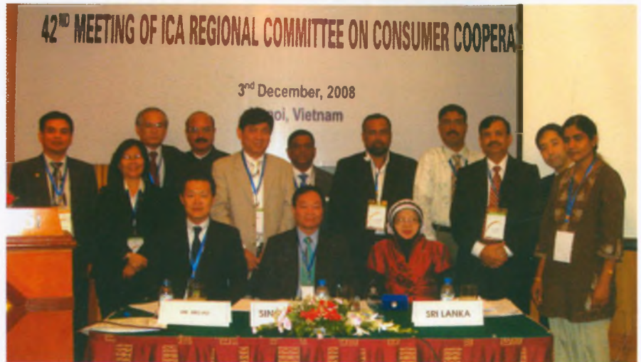
Delegates at the Consumer Committee meeting.