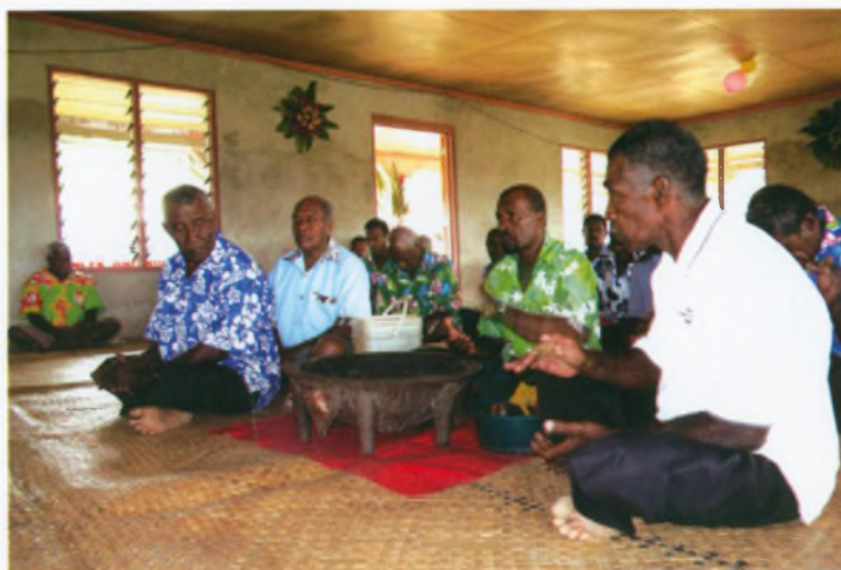
ICA Conference on Co-operative Development in South Pacific