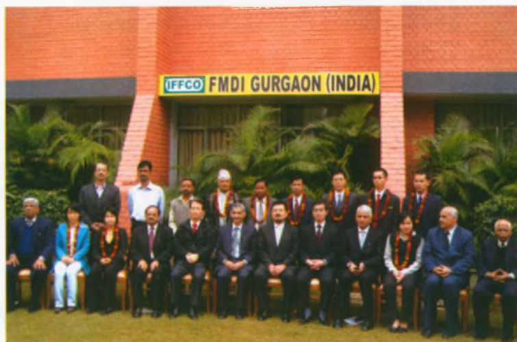
Participants of Training Course at the FMDI, Gurgaon, India