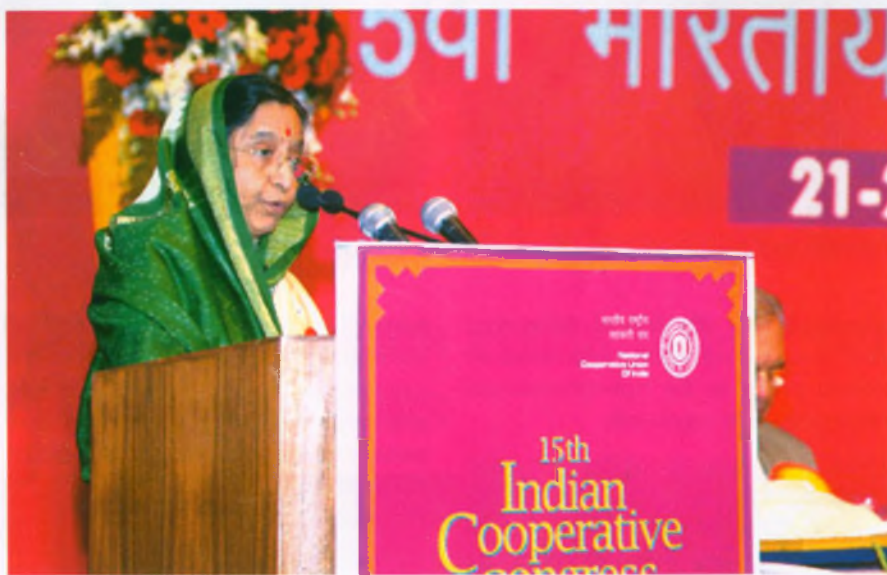
H.E. Smt. Pratibha Devi Patil, President of India inaugurating the 15th Co-operative Congress.

On the occasion of Valedictory Function of 15th Indian Co-operative Congress organised by National Co-operative Union of India, Narendra Modi, Chief Minister, Gujarat said that globalisation does not pose a threat but presents a good opportunity for Co-operatives to show their strength. "The Co-operatives should work with the real spirit like Gujarat where Co-operative movement is flourishing", he said. Modi further emphasised on the need for Co-operatives to come up in the field of water management because of their participatory character. In this respect, he announced that Government of Gujarat has decided to give rights to Co-operatives to manage and distribute the water of Sardar