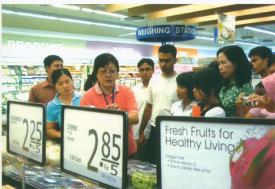
Delegates visit a FairPrice Co-op supermarket.

Some participants mentioned about improvement in customer service, brand-image management and inventory management, while they also pledged to create "hot spots" at their stores.