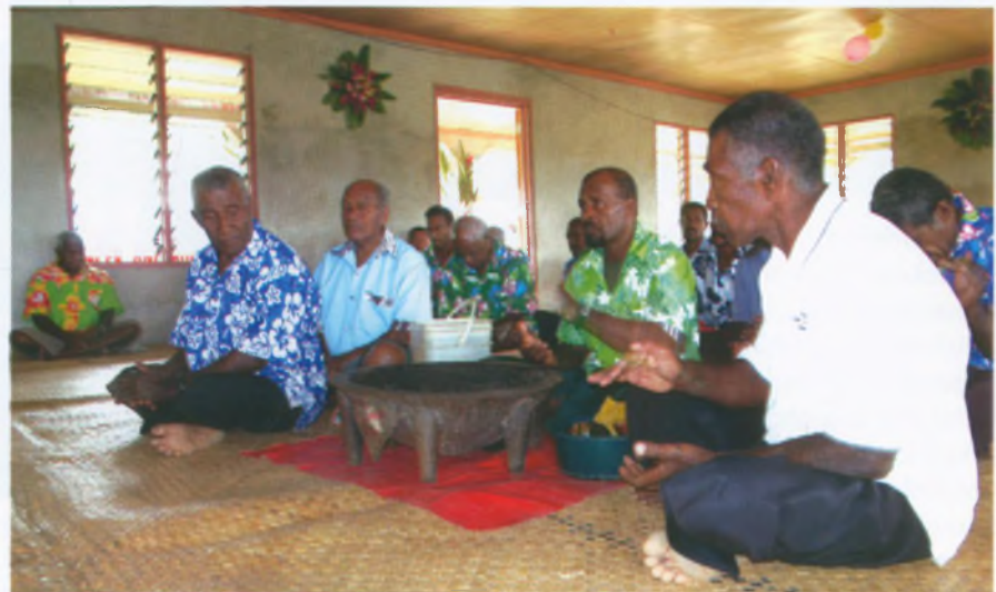
An Yaqona ceremony in progress. The participants of the Regional Conference visited the Lavia Co-operative where the ceremony took place.