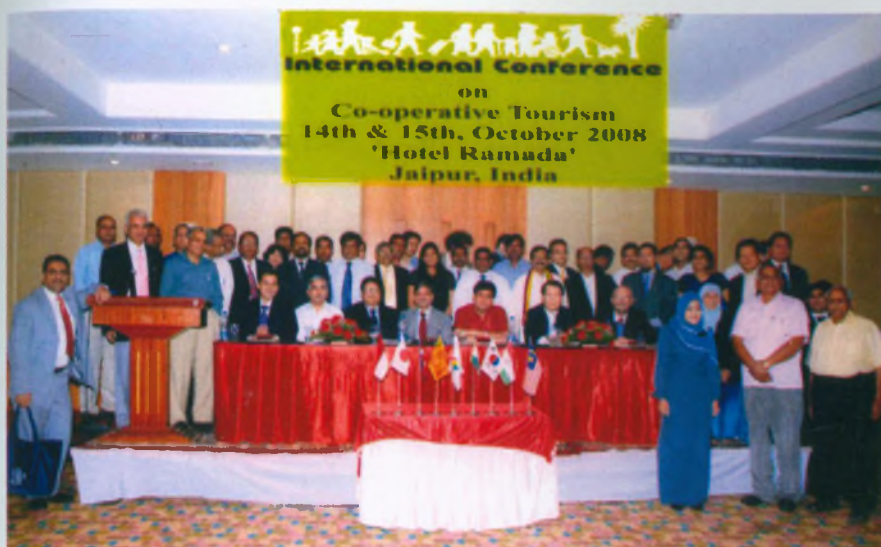
A view of delegates at the International Tourism Conference at Jaipur, India

An International Conference on Co-operative Tourism was jointly organized by ICA Asia Pacific & RICEM, Jaipur on the 14th & 15th of October 2008 at Hotel Ramada, Jaipur. The event was mainly sponsored by IFFCO. The theme of the Conference was "Friendly Tourism through Co-operatives".