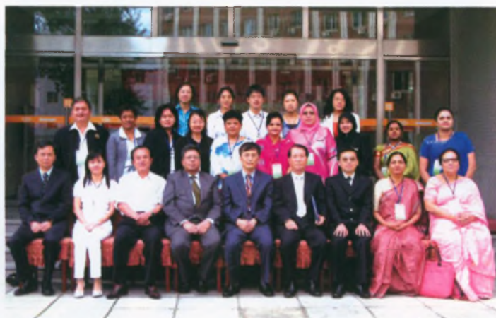
Women delegates and others pose for a group photo in Beijing

by All China Federation of Supply and Marketing co-operatives.