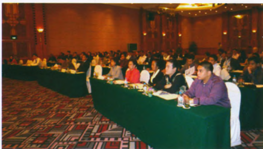
A view of delegates at the Youth Conference

A Youth Conference was held at Melia Hotel, Hanoi on 1st December, 2008, in conjunction with the Regional Assembly.