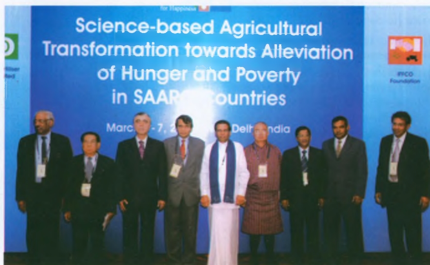
Hon'ble Ministers of SAARC countries at the opening of the Conference

An international Conference "Science-based Agricultural Transformation towards Alleviation of Hunger and Poverty in SAARC Countries" was successfully organized jointly by the Ministry of Agriculture and Co-operation, the Indian Council of Agricultural Research (ICAR), IFFCO (Indian Farmers Fertiliser Co-operative Limited) and IFFCO Foundation during March 5 to 7, 2008 at New Delhi. Hon'ble Minister of Agriculture, Shri Sharad Pawar inaugurated the Conference and Dr. M.S.Swaminathan delivered the Presidential Address. The Conference was attended by eminent policy makers, agriculture scientists, opinion leaders and farmers from the eight south Asian countries, besides Hon'ble Minister/Secretary of Agriculture from Afghanistan, India, Sri Lanka and Bhutan. The Conference aimed at analyzing the regional agrarian situation, encompassing food insecurity and poverty, generation, sharing and use of new knowledge and technologies, including biotechnology and Information and Communication Technology and sustainable