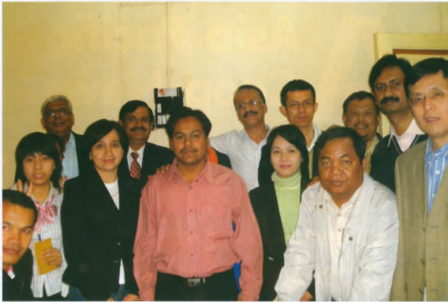
The participants during their visit to a primary dairy co-op in Anand.