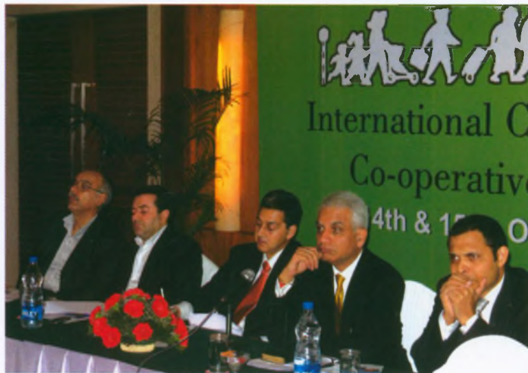
Panelists at the concluding session of the Conference

countries namely Iran, Italy, Japan, Korea, Malaysia, Maldives, Norway, Sri Lanka and UK.