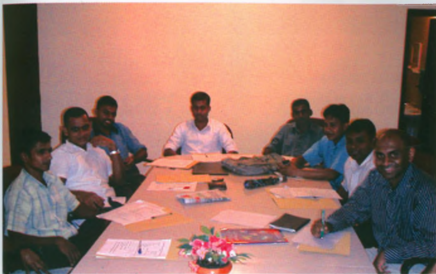
The ICA/IFFCO/NCC preparatory meeting in progress

The ICA-AP/IFFCO/NCC together have started a Pilot Project on Empowerment of Youth and Women through Cooperatives in Sri Lanka for the duration of 1 Year from October 2008 to September 2009.