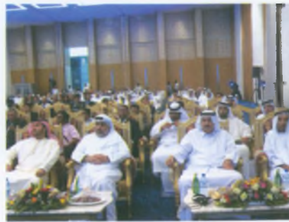
A view of the dignitaries at the inauguration of the Dialogue