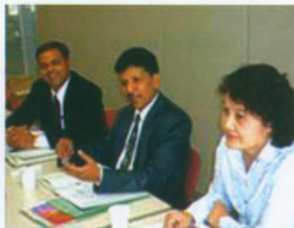
The Training programme in progress

The ICA Training program for Managers of Consumer Co-ops were held since 2001. Twenty-four managers who work for consumer co-operatives applied for the program in Japan. The three training courses have been carried out successfully out of which 9 from 5 countries were selected.