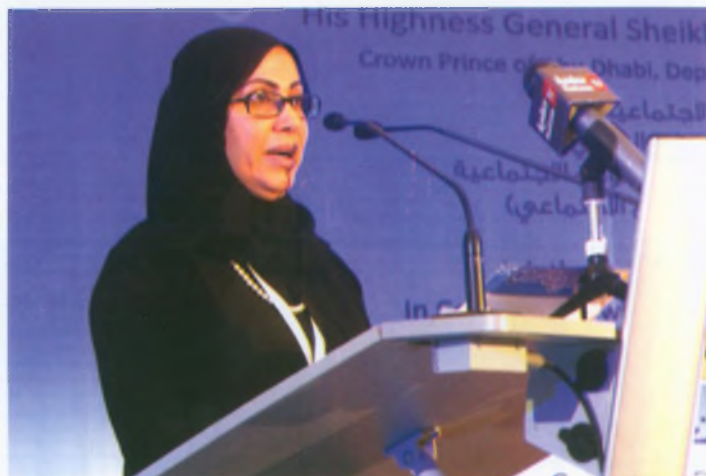
Ms. Mariam Al Roumi, Hon'ble Minister of Social Affairs, Government of UAE speaking at the Government Co-op Dialogue