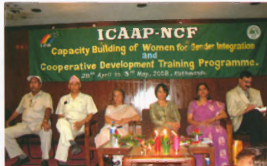
Organizers of the Training Programme in Nepal

of co-operatives, effective and gender responsive leadership, co-operative enterprise management, coping with challenges and personal development.