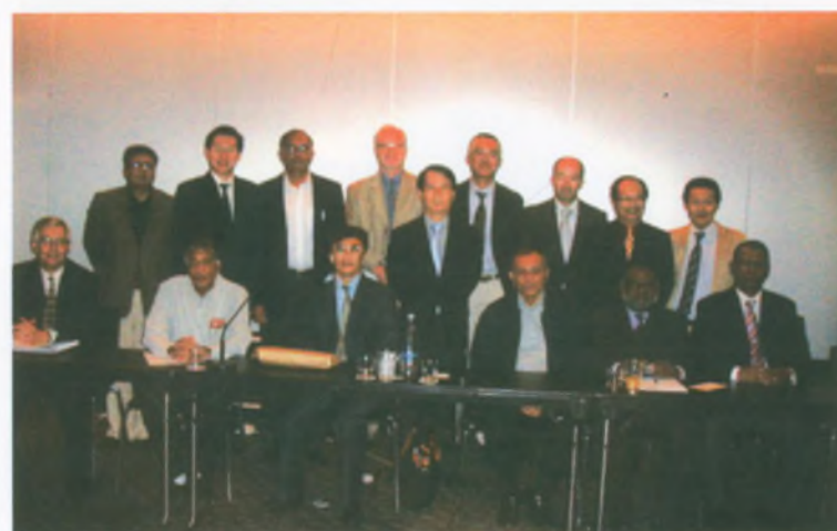
ICA-AP Board members at the special meeting of Standing Committee

The New ICA Membership subscription formula was adopted with a thumping majority at the Extraordinary General Assembly of ICA in Rome, Italy on 5th June 2008