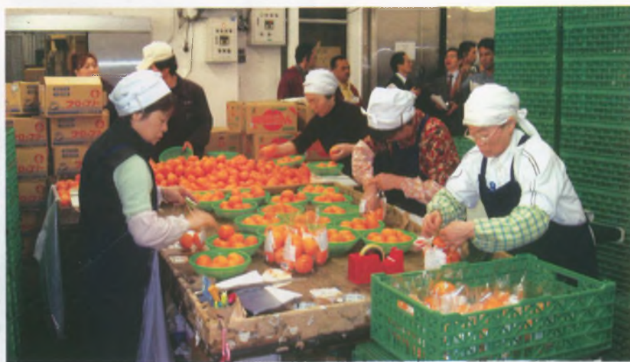
Participants at a fruit processing unit

Special topics of interest to the participants like “marketing methods for farm products by theory and case study”, “new methods for the rural development and green tourism”, “strategy for marketing of agricultural products”, etc. for future development were presented. During the study visits to agricultural co-operatives in Shizuoka Prefecture the participants were able to interact with farmer leaders and to observe their various activities as carried out by the JA’s.