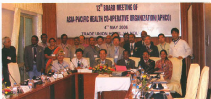
Delegates of the APHCO meeting in Vietnam