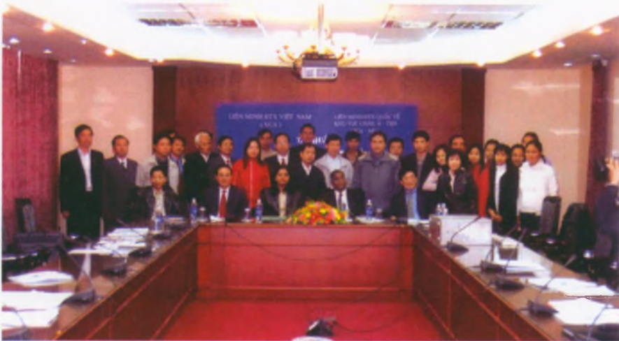
Trainers and Resource persons at the TOT workshop in Vietnam

The ILO-Coop Net and ICA-AP have developed a Training Manual for leadership development of women in co-operatives in the Asia Pacific region. The manual is being used for training of trainers of co-operatives who in turn will train the women co-operative leaders. The ICA-AP is conducting trainings for women and men trainers of primary, secondary and tertiary co-operatives whose role and task is to conduct training activities on gender sensitivity and accountability and on leadership capacity building of women in cooperatives.