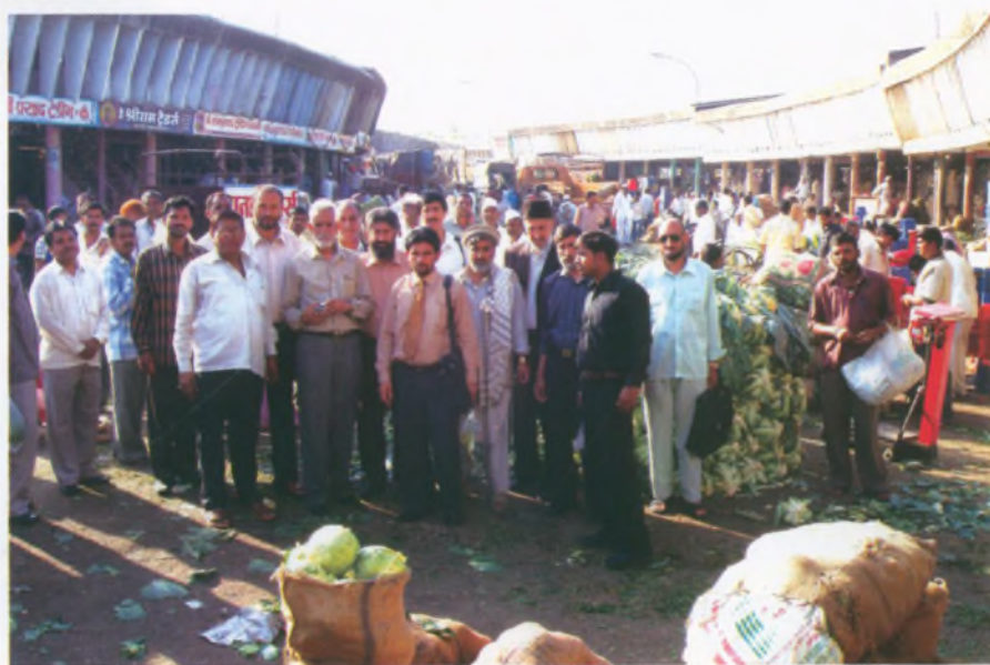
Participants visited a coop vegetable market

persons (8 government officials from the Ministry of Agriculture, Food and Animal Husbandry, Government of Afghanistan) and 2 co-op leaders attended the programme. Local costs