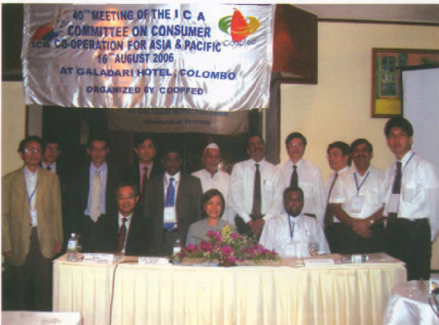
Members of the Consumer Committee

operative Union (JCCU) and practical training will be conducted in respective consumer co-operative societies.