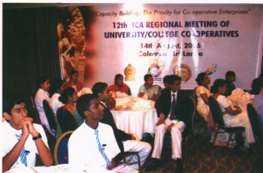
Participants at the University/Campus Sub-committee meeting

The 3rd ICA Regional Youth Conference was held at Bandaranayake Memorial International Conference Hall, Colombo, Sri Lanka, 15th August 2006.