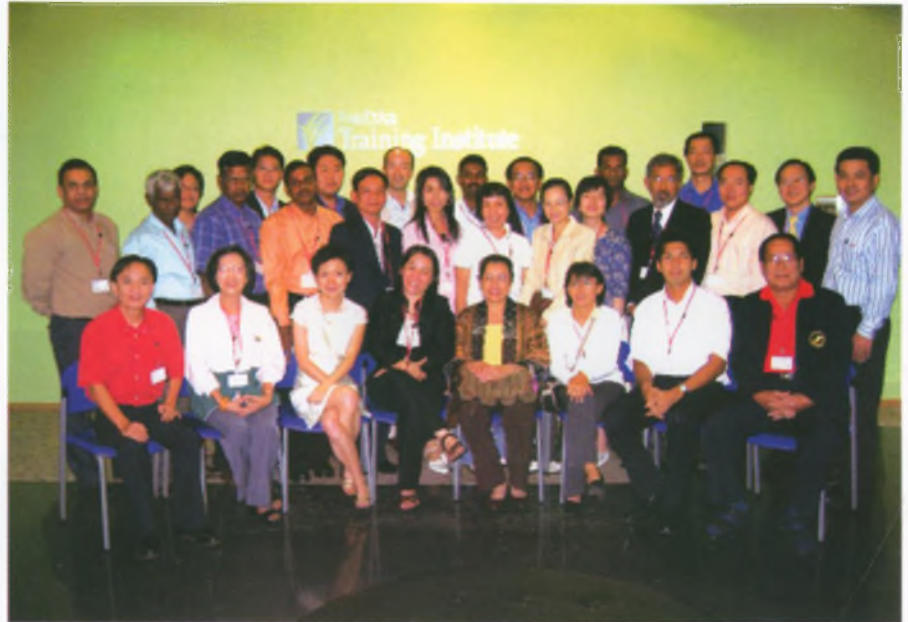
Participants of the Training Programme in Singapore

Besides, the program aimed at developing necessary skills of the participants to enable them to adopt such systems and practice them back at home.