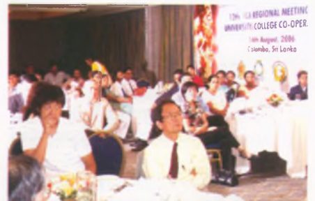
Members at rapt attention at the Consumer Sub-committee meeting