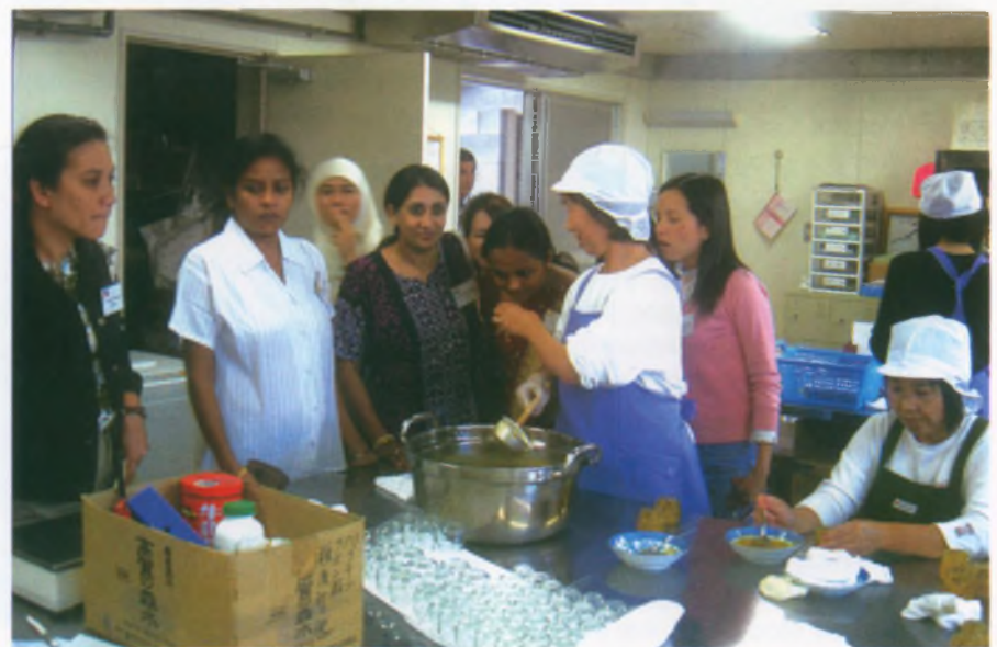
Participants at Study Visit to prefectures