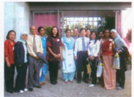
Participants during a study visit

Under this Project, the 1st Training Course on "Promoting Sustainable Enterprises for Rural Women" was held in the Philippines and Japan. Part-I of