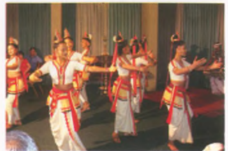
A cultural presentation at the Regional Assembly and related meetings in Colombo