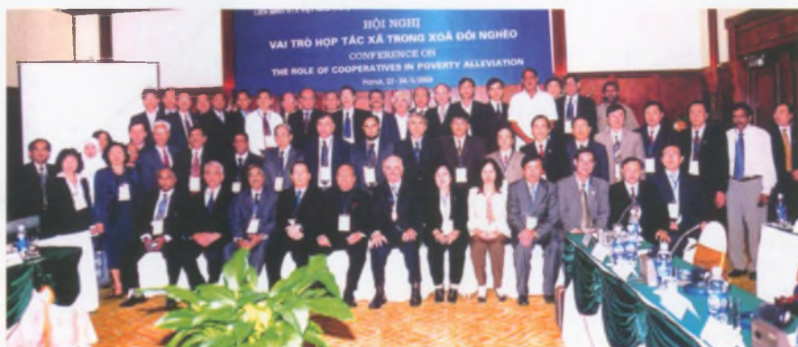
Participants of the Conference