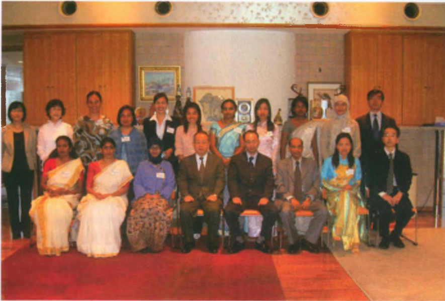
Group photo of the Course participants at IDACA, Japan

the Training Course was held in the Philippines from 24th September to 3rd October and Part-II in Japan in collaboration with the Institute for the Development of Agricultural Co-operation in Asia (IDACA), Tokyo (Japan) from 4th to 31st October 2006. The program is being funded by the Ministry of Agriculture, Forestry and Fisheries (MAFF), of the Government of Japan and implemented by ICA.