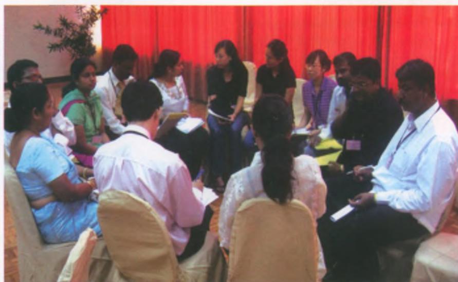
Youth Conference delegates discussing important points