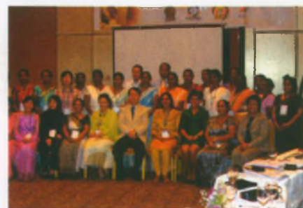
Members of the Regional Women's Committee in Colombo