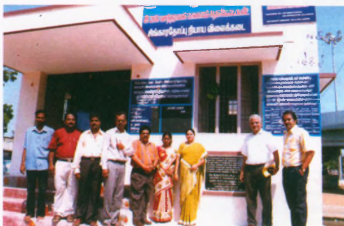
A newly constructed facility in Tamil Nadu after the Tsunami

The objective of 300,000 USD project was to empower co-ops at the primary level to fetch desired institutional financial support through capacity building intervention. 19 MPCs for their 226 branches, 63 SANASA co-ops, 24 fisheries co-ops and 20 other co-ops in Galle, Matara and Hambantota districts in Southern Sri Lanka covering almost 16,635 tsunami affected members were identified as the target beneficiaries. In Sri Lanka the interventions under the project would yield positive results in terms of repositioning the co-operatives as high priority sector with the result of capacity building training programmes.