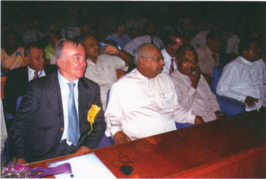
ICA President and others at the inauguration of the Regional Assembly in Colombo