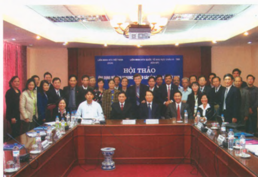
Participants of the workshop pose for a photograph