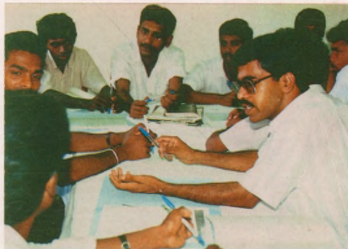
A youth group having discussions at the CMPP Seminar for youth conducted at Galle, Sri Lanka.

The Adviser, HRD engaged in providing consultancy services this year too, but mainly to SCC and the other projects within