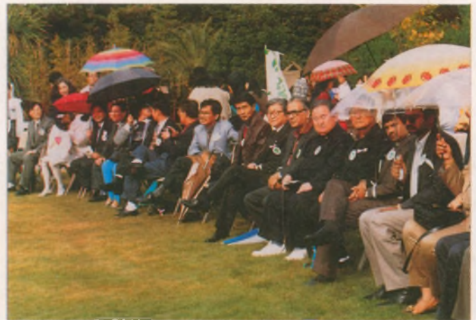
A view of the cultural programmes of Asian consumer cooperative leaders in Nagoya, Japan.