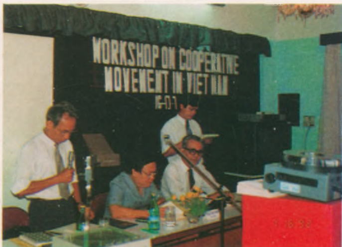
A session of the workshop on Cooperative Movement in Vietnam held at the conclusion of the Study Mission to Vietnam undertaken by the ICA ROAP in collaboration with SCC, CCA, SDID, CIDB, in Vietnam.