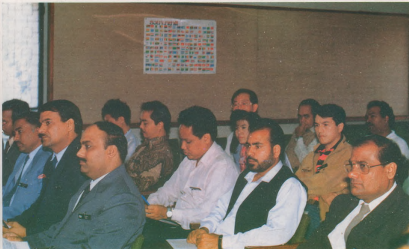
A section of the participants attending the 7th Training Course.

The six-months training programme is spread over four countries viz. India, Thailand, Japan and the Republic of Korea. After the first part of the programme in India for two months, the participants will take part in the ten days study visits programme to agricultural cooperatives in Thailand. Thereafter they return to their respective countries for forty-five days to prepare cooperative development projects in consultation with the concerned cooperative organisations in their respective countries. These Projects will be appraised in Tokyo during the 2nd Part of the Training Course to be conducted at the Institute for the Development of Agricultural