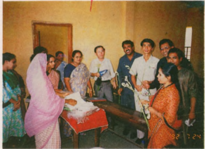
Members of a women's cooperative learning flower making in Bangladesh.