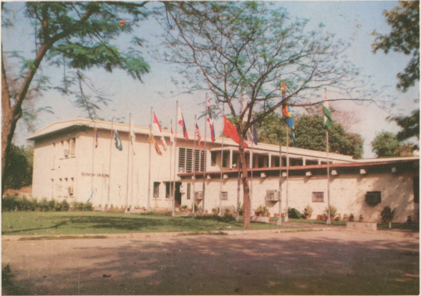
Full view of the 'Bonow House' from where the ICA Regional Office for Asia and the Pacific operates.