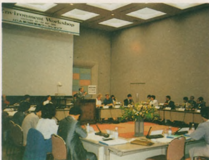
A view of the Environment Workshop in session in Yokohama, Japan.