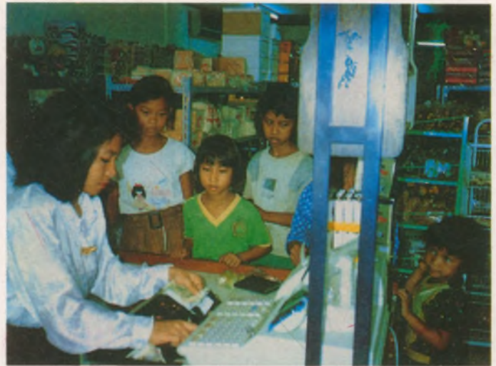
A view of a Cooperative Store in Jakarta, Indonesia.