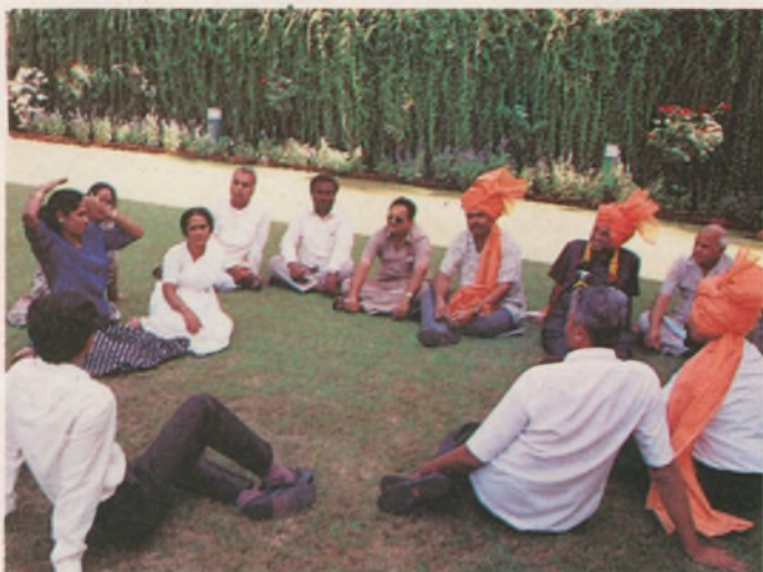
The HRD Committee members who went on study visits relax, in full Maharashtrian headgear at the lawns of a cooperative spinning mill in Kolhapur.