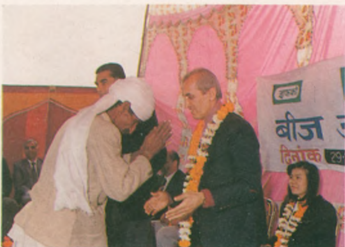
Participants of the 7th Training course being greeted by villagers during a study visit programme in India.