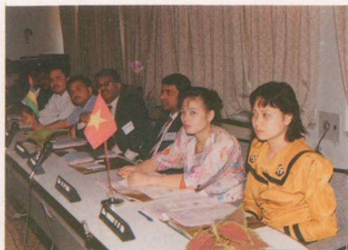
A view of the participants attending the seminar on Integrated Cooperative Development through Agro-Processing.