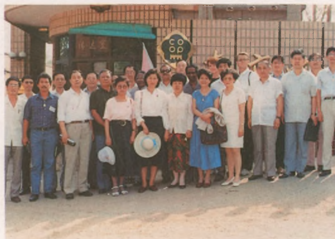
Participants of the ICA/ACFSMC regional seminar on Agro-Processing held in Nanjing, China.