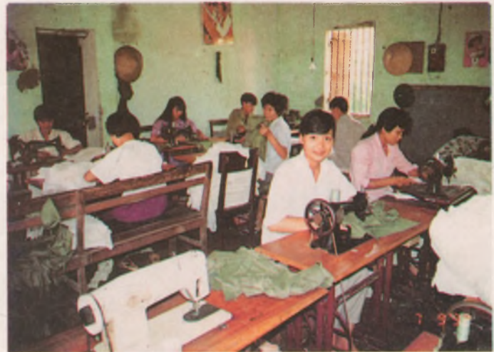
Learning to stitch, a cooperative group near Hanoi, Vietnam.