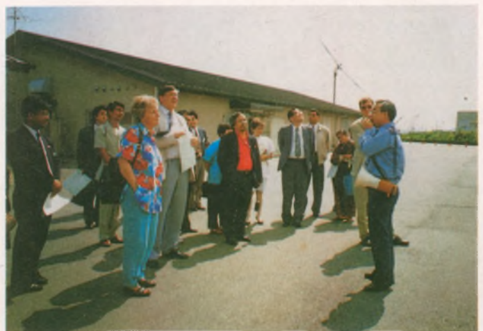
Participants of the Environment Workshop organised by the ICA Consumer Committee at an energy park in Kobe, Japan.