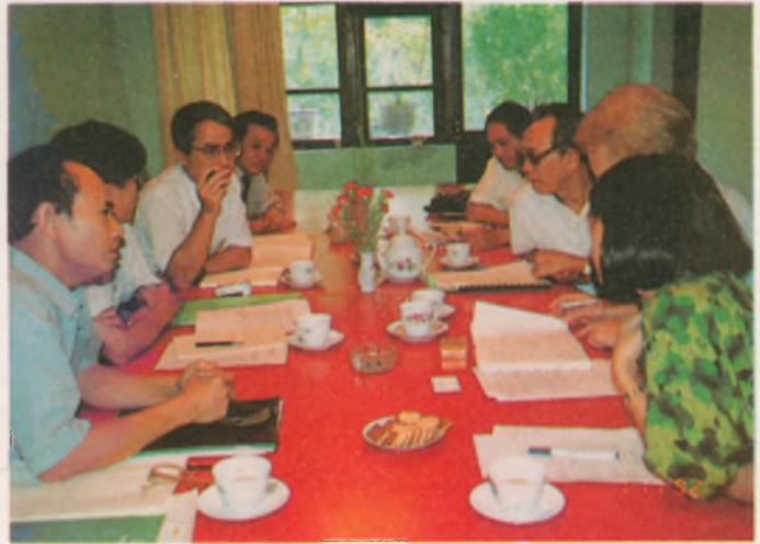
A discussion during the workshop on Cooperative Development in Vietnam.

The Project is highly appreciative of the continuing financial support offered by the Swedish Co-operative Centre, being the main source and CCA and JCCU who joined during the year. Singapore, though the smallest country, continues to support through its SINCOTAP programme. The member countries, specially the members of the HRD committee readily provided local costs for many activities. The administrative support by the Regional Director and ICA, Geneva has been most encouraging. Famous cooperators, readers and children communicated with us and encouraged our activities much more than before. We remember with gratitude.