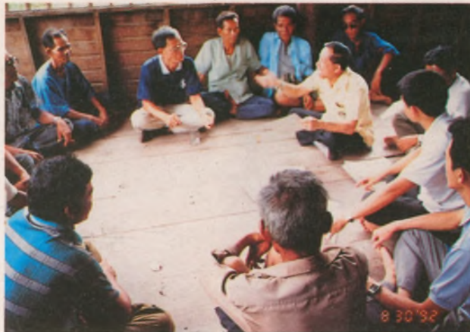
A group of men try to find solutions for their problems at the village seminar, Korat, Thailand.

The project concentrated on introducing technology in two areas: improved training systems and human resource information systems. The only activity on technology training system was with the Vaikunth Mehta Institute of Cooperative Management, Pune, India, who was prepared to bear the capital cost. In accordance with the project plan prepared by the ICA ROAP in 1991, VAMNICOM acquired computer network and provided a training in computer basis locally. In 1992, we helped in acquiring software and training in DTP.