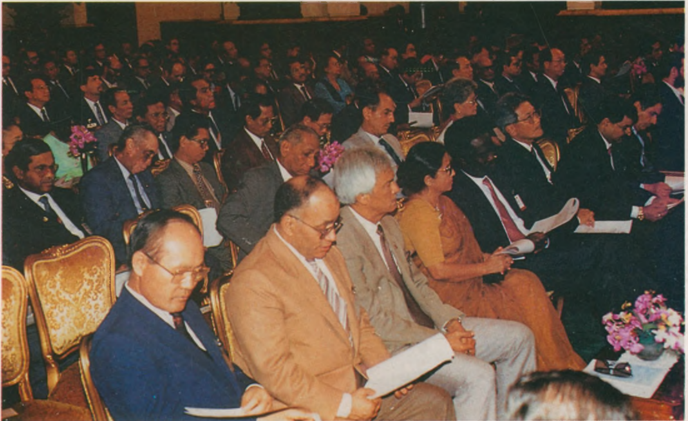
A section of the participants at the inaugural session of the Cooperative Ministers Conference.