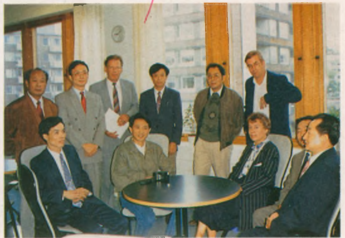
Chinese Study Mission on Hotel Management in Finland.

A five-member CUP (Cooperative Union of the Philippines) mission visited Shanghai, China, during 2-10 June as continuation of waste resource recycling project. The CUP mission observed processing units of waste resource recycling in Shanghai and had further discussions on technology transfer of waste rubber recycling. The letter of intent on this regard was signed between SFSCMC (Shanghai Federation of Supply and Marketing Cooperatives) and CUP mission and SFSCMC will extend all support to CUP for the successful implementation of the rubber waste recycling project with the coordination of ICA ROAP.