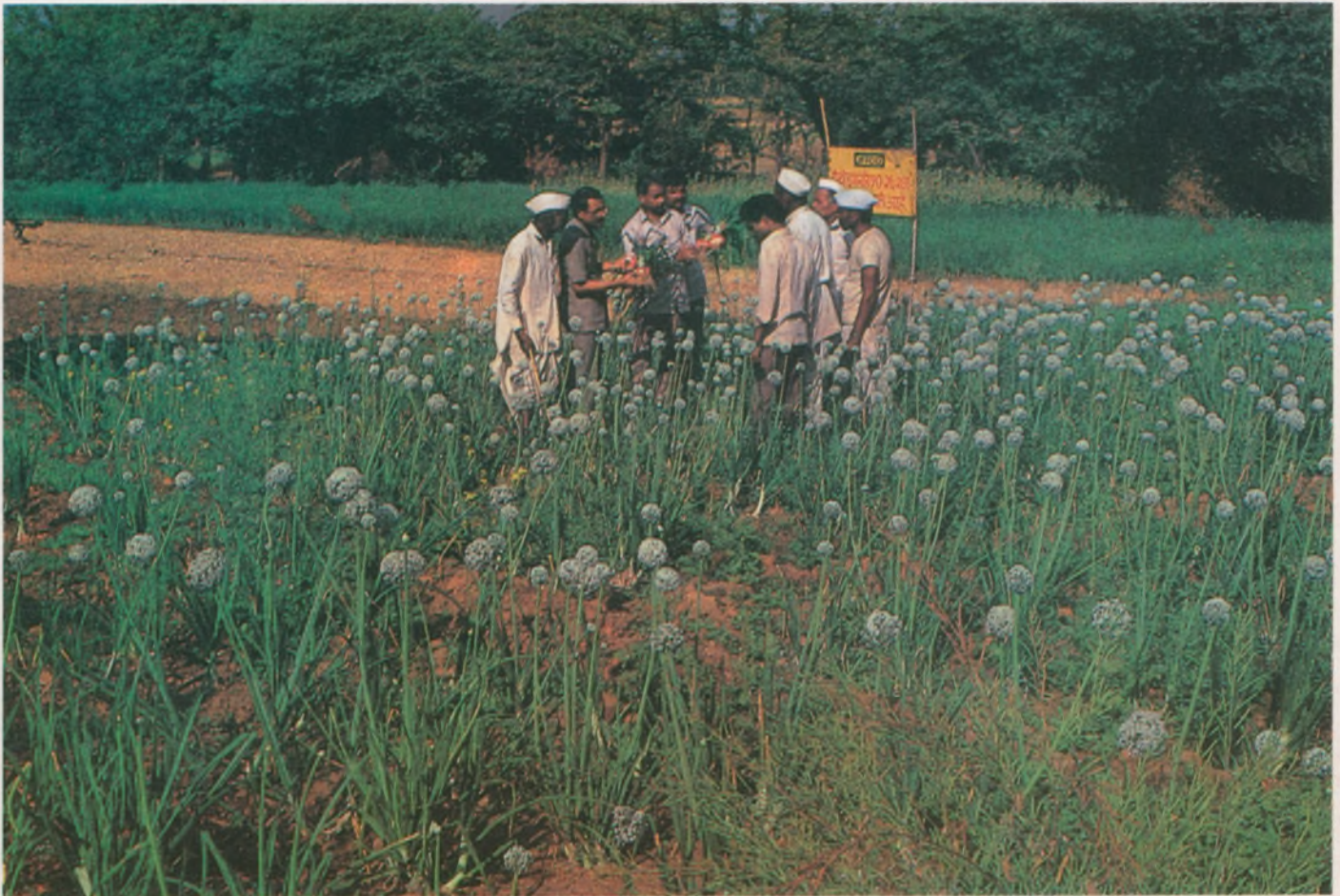
A view of the onion farm in Maharashtra, India. Fertiliser application is done on such farms under the IFFCO's Farm Extension Programme.

UZBEK REPUBLICAN UNION OF CONSUMER SOCIETIES 700115 45, Uzbekistansky Prospect, Tashkent Tele. :