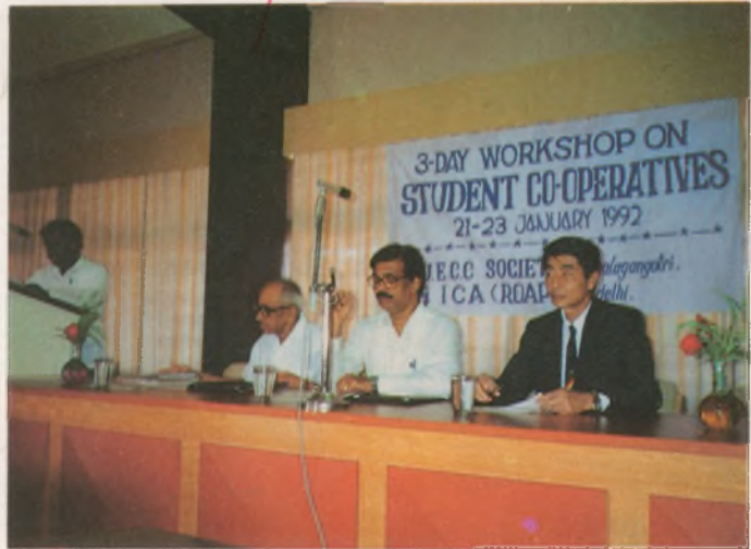
Student Cooperative Workshop held in Mangalore, India.

A two-day self-financed workshop on "Management of