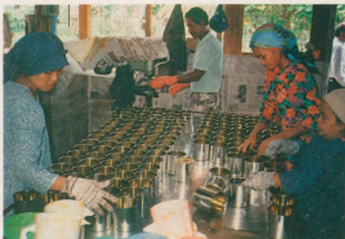
Women workers at the fruit canning factory of a cooperative in Malaysia.