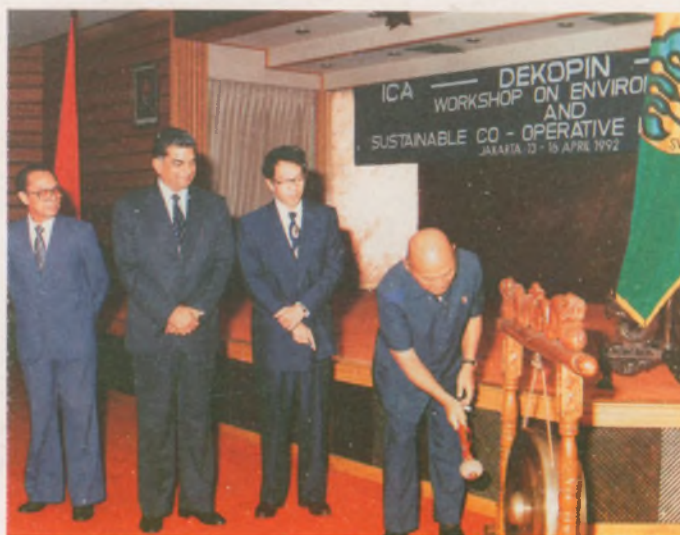
Mr. Bustanil Arifin, Minister for Cooperatives, Indonesia, inaugurating the Environment Workshop.

In accordance with the agreement reached between the ICA ROAP and the CCA and with the financial support from the CCA, an in-depth regional study on the subject was carried out covering India, Indonesia, Japan, Philippines and Thailand with a view to document and study the environmental problems faced by cooperatives and their possible solutions. The study was carried out with the help of national consultants who produced their comprehensive national situation papers based on a centrally-developed questionnaire and on-site observations, interviews and making use of the available documents. The national situation papers were thoroughly discussed and analyzed at a regional workshop held at Jakarta during 13-20 April 1992 attended by 15 participants. Based on the discussions held at the workshop, the regional