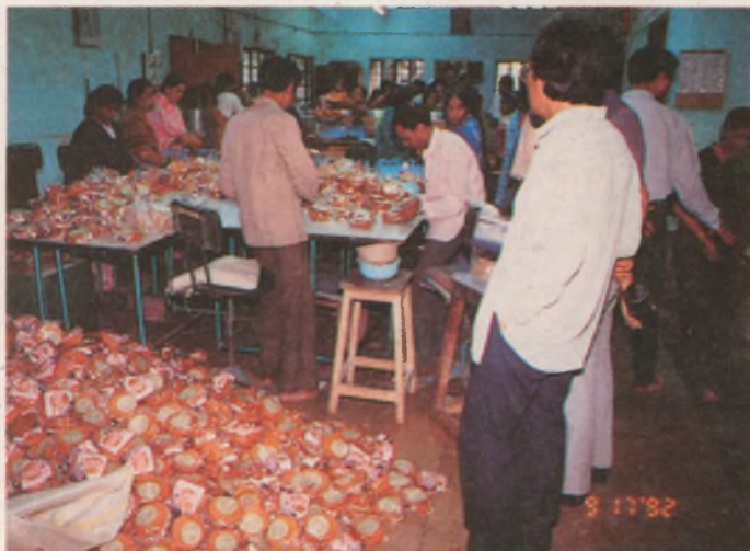
The members of the HRD Committee visited a cooperative 'papad' making project in Maharashtra, India.