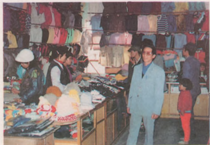
A view of the Saigon cooperative shop.