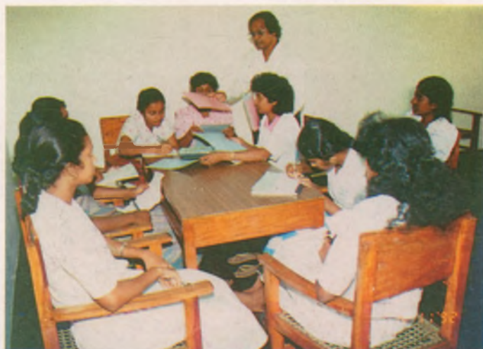
Another youth group (girls) having discussions.