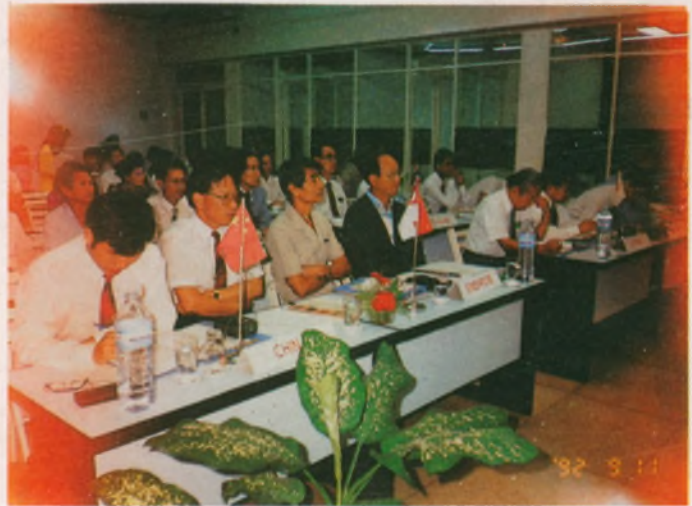
A view of the participants of the CTI and Consumer Committee meeting in Vietnam.

"..... But this is not to say that people working through cooperatives cannot help to make the future, for indeed this is the central purpose of the Cooperative Movement: to help make a different and a better kind of world. The history of the future has not been written, and Cooperators must be determined to have a hand in writing it. In short, Cooperators can be active participants in the planning, and indeed creators, of the future, if they only have a mind and a will for it".