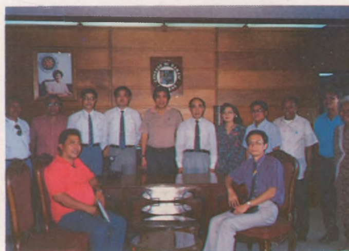
Chinese Mission on Waste Resource Recycling in the Philippines.