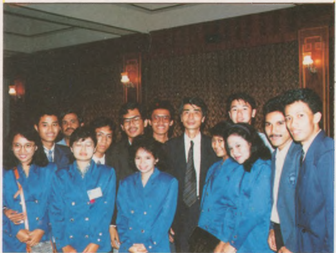
Members of the Organising Committee of the regional seminar on University Cooperatives in Indonesia.

"The true problem is not the preservation of cooperative institutions, as they have been or as they are, but the application of essential cooperative principles in appropriate forms for contemporary circumstances. The challenge is not only material, but intellectual. The history of movements, as of nations and civilisations, is the story of their success or failure to rise to the challenges which confront them as generations and centuries roll by".