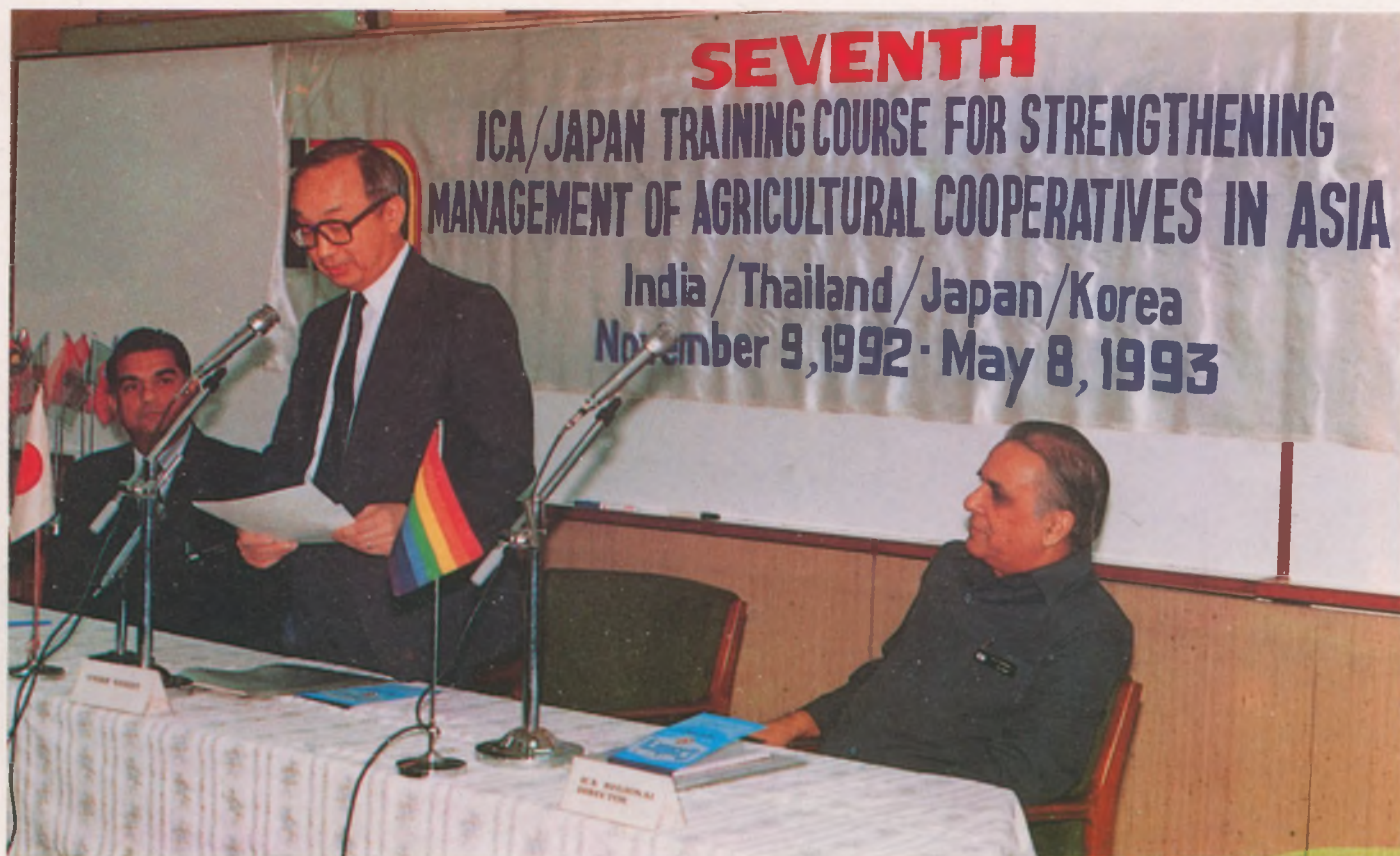
His Excellency Shunji Kobayashi, Ambassador of Japan in India seen Inaugurating the 7th ICA/Japan Training Course at Bonow House.

The Seventh Training Course commenced in New Delhi on 9th November 1992 with 15 participants from eleven countries.