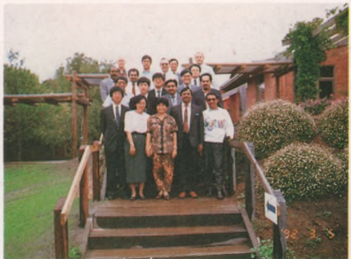
Participants of the ICA Regional Seminar on Agricultural Cooperatives at Geelong, Australia.