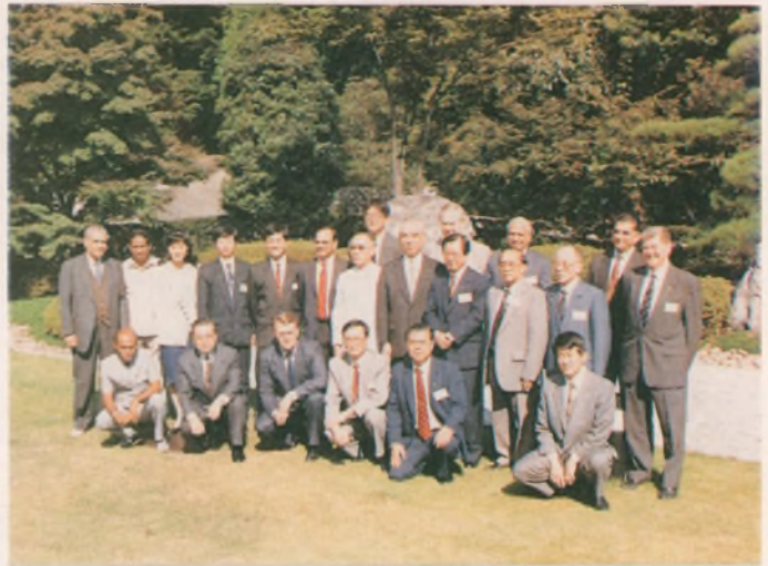
26th Meeting of the ICA Committee on Agriculture for Asia and the Pacific. Committee Members at the IDACA premises.

The meeting in Tokyo was held at the invitation of the Japanese Consumers Cooperative Union (JCCU).