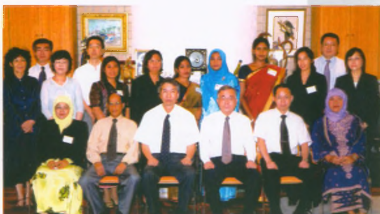
The Women leaders posed for a photo with the Japanese hosts

participants also held group discussions and prepared brief reports on the experiences gained by them. An end-of-the-Course Evaluation session was also held.