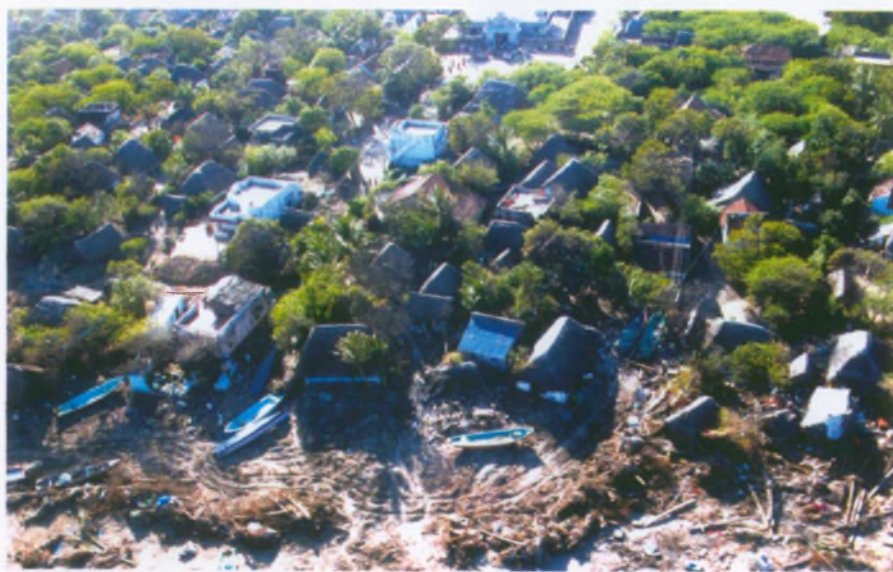
The ravaged coast in Tamil Nadu

of the affected communities in Tamil Nadu were patronising local co-operatives for the livelihood. In Andaman Nicobar Island, Central Tribal Co-operative patronised by more than 8000 tribal families lost civil infrastructure, liquid assets and records. It may take years to bring back lives of thousands to normalcy.