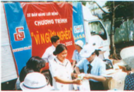
Mobile selling to remote areas is frequently organised by Saigon Co-op

Careful development of fresh and processed, ready-to-eat foods which are more and more diversified and are guaranteed of strict hygienic and absolute food safety standards for the consumer. In addition, in order to create a close bond with customers, a special program was launched for membership customers with incentives like birthday gifts, bonuses on annual total invoices, and discounts and gifts every month. Moreover, we have many customer care services such as telephone sales, and home delivery without additional costs. The Saigon Co-op chain also often organizes mobile sales units to bring essential commodities at cheap prices to drug rehabilitation centers (these centers are operated by the city at different provinces), and hospitals.