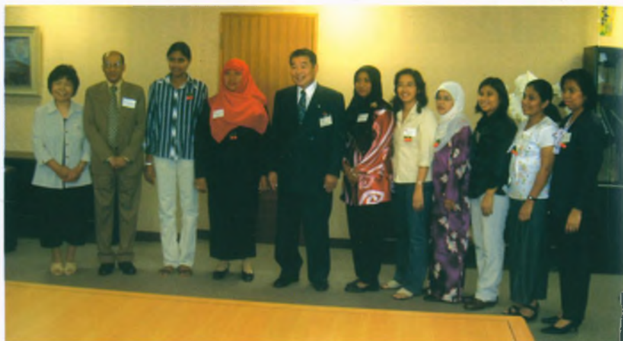
The women delegates pose for a group photo

The International Co-operative Alliance - Asia and Pacific (ICA-AP), in association with its member organisation in Japan, the Central Union of Agricultural Co-operatives of Japan (JA-Zenchu) and the Institute for the Development of Agricultural Co-operation in Asia (IDACA) organised the 5th ICA-Japan Training Course for "Strengthening Women's Agricultural Co-operatives in Rural Areas and Improvement of Farm Management and Rural Life" in Malaysia and Japan. Eight participants - two each from Indonesia, Malaysia, Philippines and Sri Lanka, attended the Training