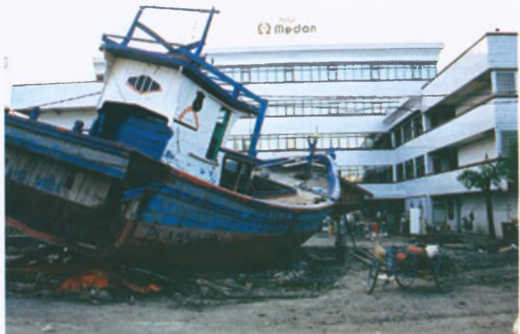
A boat on the middle of the road washed well away from the coast in Banda Aceh, Indonesia