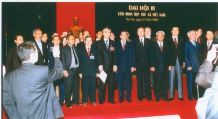
The dignitaries at the Congress

Party General Secretary Mr. Nong Duc Manh asked the Vietnam Co-operative Alliance (VCA) to focus on strengthening and renewing the collective economy and to forge a new direction in socio-economic development. The collective economy, through the system of co-operatives, has made significant contributions to the nation's economic development and social stabilization, he said, and