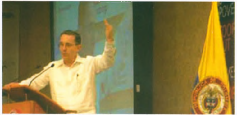
President of Colombia addressing the General Assembly of ICA in Cartagena

The representation of Youth on the ICA Board, more than just a space for participation, it is a space for young people to act inside the cooperative movement. Being here implies organizing our work, defining the motives that lead us to be here and draw the course of action to make our dreams come true.