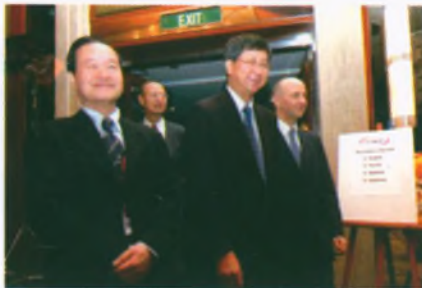
The Co-operative Insurance leaders at the ICMIF Conference