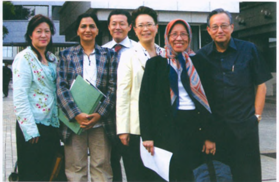
Members of the team after the meeting

it was found that all the six strategies have been dealt with but performance could not be maximized due to various reasons.