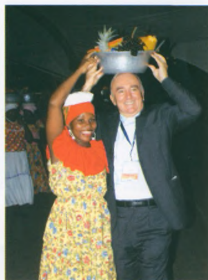
The ICA President carrying a fruit basket at the Reception

The ICA has held its General Assembly at the Hilton Hotel in Cartagena, Colombia. In its 110 year history, this is the first time that ICA held a General Assembly in Latin America.