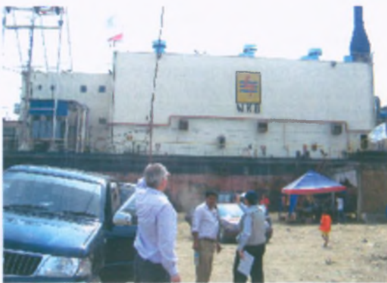
A large ship washed on the road