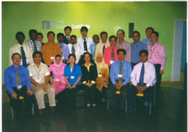
The Trainees at NTUC Fairprice Co-operative

The next day, they visited NTUC Fairprice stores and its competitors and they were exposed to the severe competition in the retail market. On the final day, they drew up action plans for their stores to overcome weaknesses and made presentations on 'What are you going to implement in your organization?'.