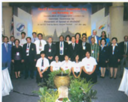
Participants at the workshop

According to the plan to cover the countries with high HIV prevalence first, a workshop for sensitisation of co-operative leaders to generate awareness for Prevention of Spread of HIV/AIDS has been held on 1-2 July 2005 in Bangkok, Thailand in collaboration with Co-operative League of Thailand. The participants