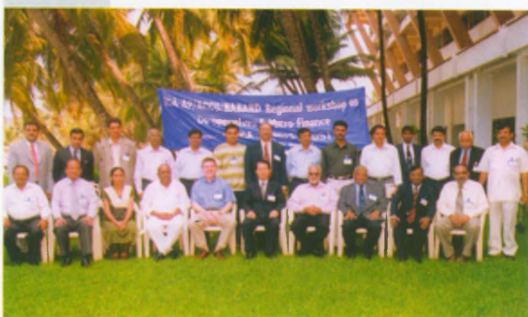
Participants at the Regional Workshop at Goa, India

An overview of co-operative credit and banking sector in majority of the developing countries of the Asia-Pacific Region shows that while credit unions have achieved appreciable success in the sphere of micro-finance, other co-operatives, by and large, appear to be perhaps the last entrants in internalizing innovative micro-finance programmes.