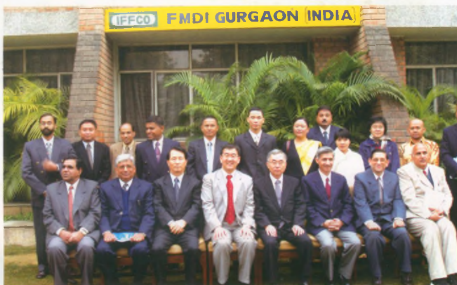
Participants of the course at a photo session