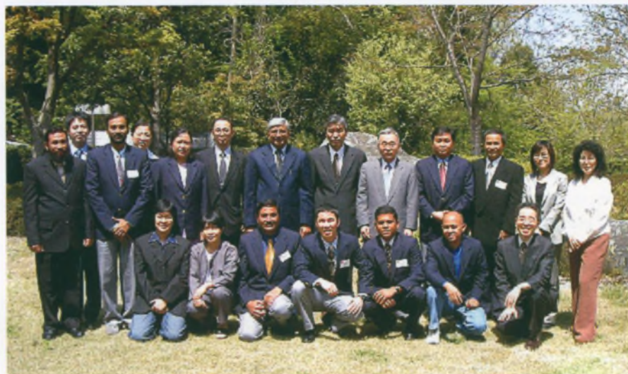
Participants of the course at the closing ceremony at IDACA, Japan.

and experience gained from this training, in their respective countries.