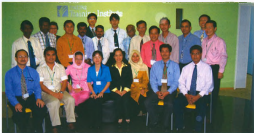
The participants of the workshop at the NTUC Fair Price

The workshop was divided into three types of sessions, class room lectures, study visits and presentations. In the classroom session, participants learned the knowledge and skill of managing consumer co-operatives. Next day, they visited NTUC Fairprice stores and its competitors and they were exposed to the severe