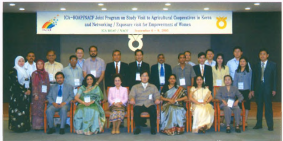
The delegates at a photo opportunity

The participants visited to Hanoramart Chain Store Division, Agriculture Co-ops including meeting with Women Association in the co-op and Kyoyang Agricultural Marketing Complex and Agricultural Co-operative College.