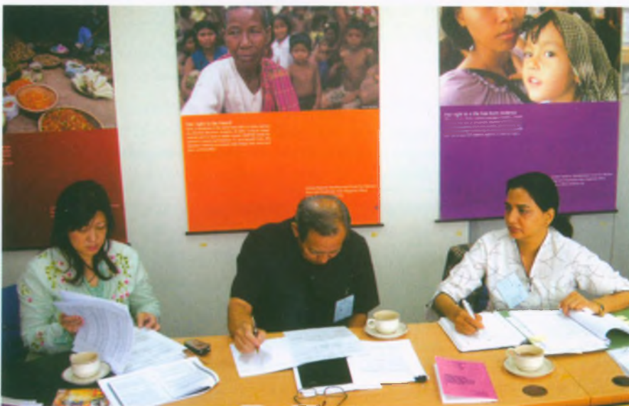
The team members working on strategies