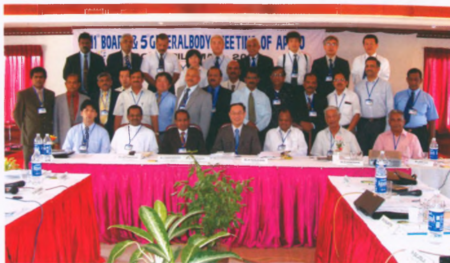
Delegates with the board members posed for a photograph after the meetings