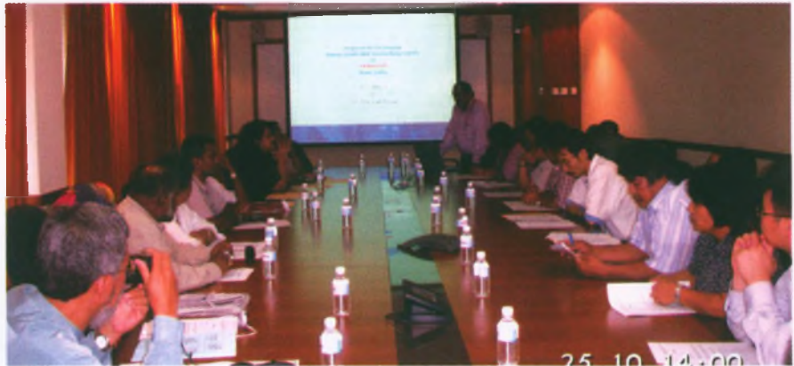
Delegates at the seminar intently watching a presentation

Co-operatives, which have always looked upon social responsibility as one of its key objectives, need to re-evaluate policies and practices on governance and social responsibility in the context of current thinking. It would help the co-operatives in the region to become more competitive in open market and help strengthen relevance of ICA's role in serving its members rightfully. The International Standardization Organization (ISO) has also launched an extensive effort to establish an ISO Advisory