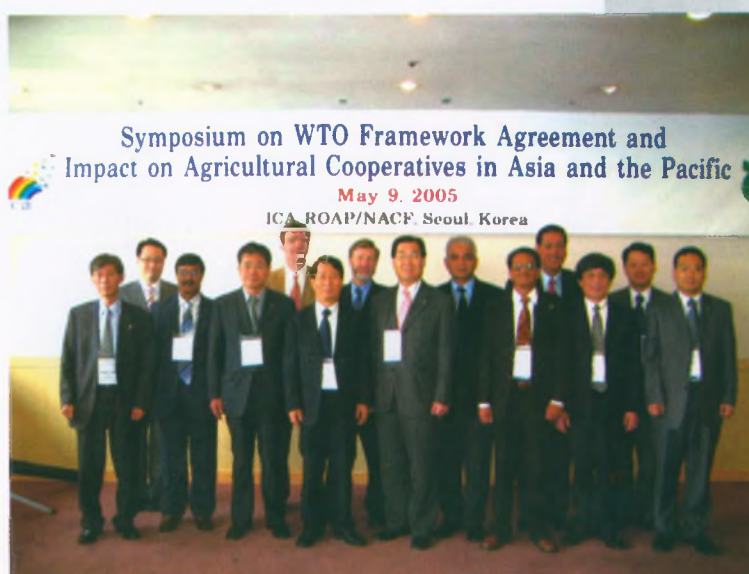
Delegates at the WTO Symposium

Both positive and negative implications for co-operatives were discussed, like increased export