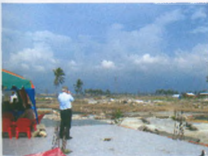
A scene from Nias