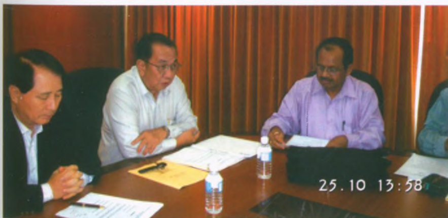
The Regional Director, ICA-AP, Chair and Vice-Chairs of HRD Committee at the seminar