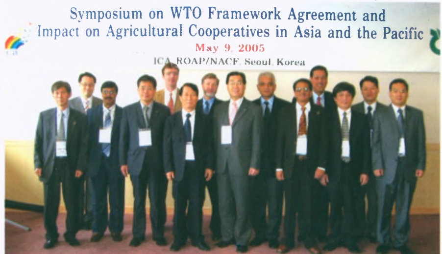
Delegates at the symposium

Both positive and negative implications for co-operatives were