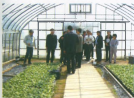
Participants in a Green House in Shimane prefecture