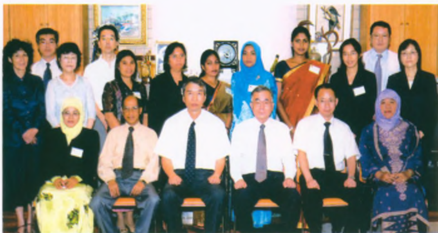
Participants of the 5th ICA/Japan Women Leaders Training Course

Course. The Course was organised and held by the ICA at the IDACA premises from 4th to 28th September 2005. The 10-day component of Comparative Field Study Visits was held in Malaysia from 25th August to 3rd September in collaboration with the National Co-operative Organization of Malaysia (ANGKASA). The program is funded by the Government of Japan in the Ministry of Agriculture, Forestry and Fisheries (MAFF).