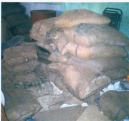
Damaged stock of a consumer co-operative in Tamil Nadu