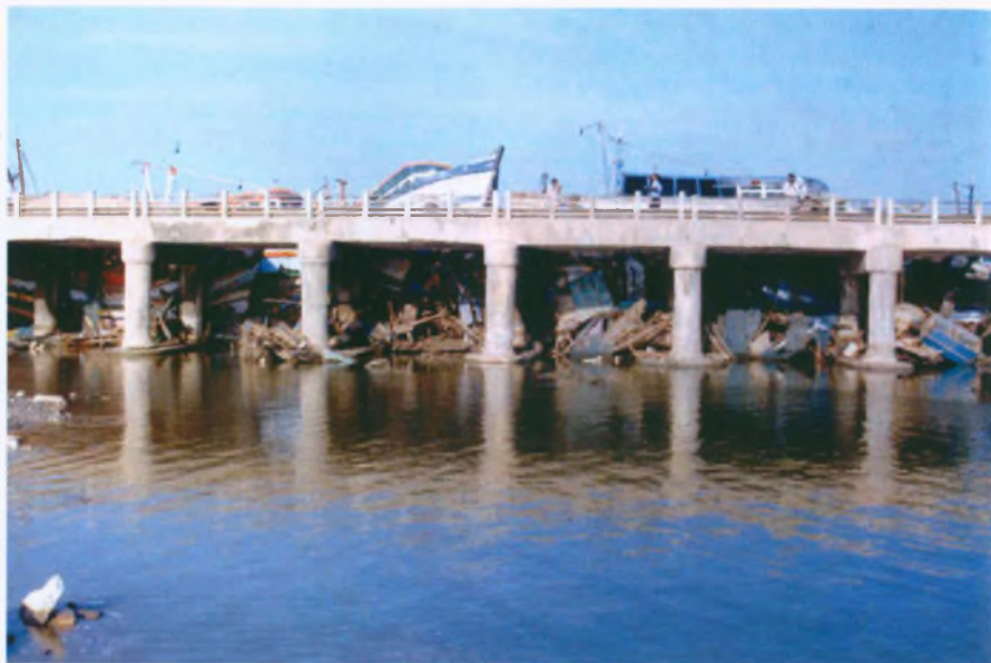
Fishing boats piled up under a bridge in Nagapattinam