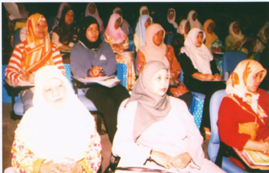
Participants at te Rural Women's day

and, would subsequently match them up with the appropriate government assistance.