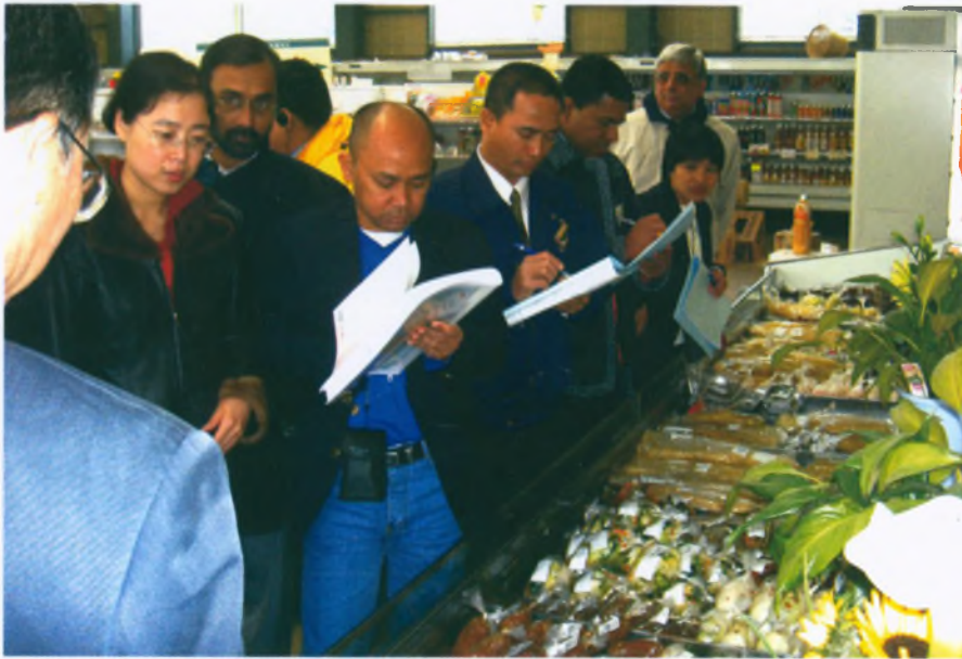
Participants at a Farmers' Direct Sale Shop in Iwate prefecture

to the participants on successful completion of the training course. He has noted the various comments and suggestions made by the participants in the evaluation report and said that these comments encouraged the staff of IDACA and himself personally and will enable the IDACA to improve this course in the future.