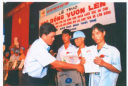
Representative of Saigon Co-op offers school bags and books for the pupils in orange-agent victim families

After the blood donation, a solemn meeting was held with the participation of more than 300 representatives from other co-operatives in other fields in HCMC and representatives of Saigon Co-op management and staff. At the meeting, the message from the Union of International Co-operatives was read. Also at the meeting, other