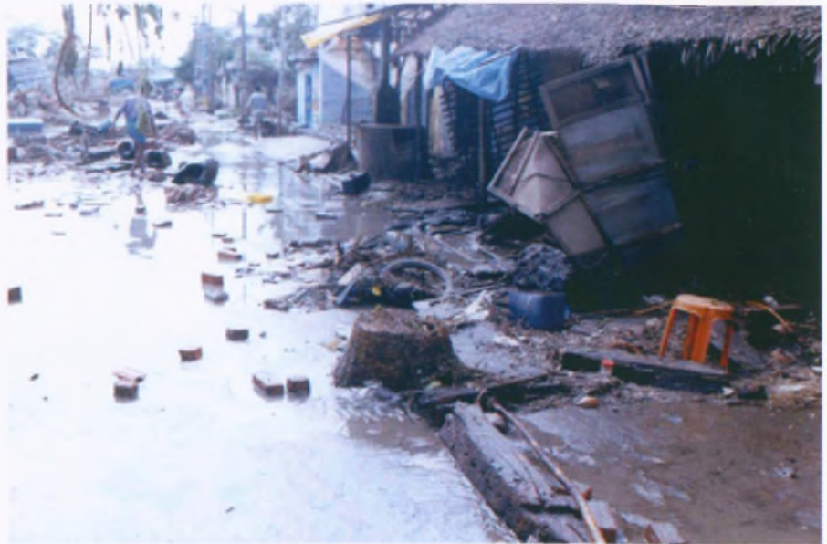
Damaged houses in Tamil Nadu, India

Temporary shelters, drinking water, safe defecation and sanitation and road reconstruction were the top priorities of the Tamil Nadu State Government and it has really done