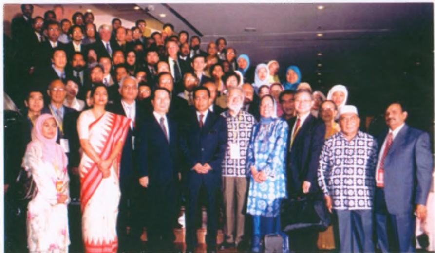
The delegates of the Dialogue

Co-operative policy must also identify co-operatives as capable of providing services in the areas that are otherwise remained outside the mainstream national development channels.