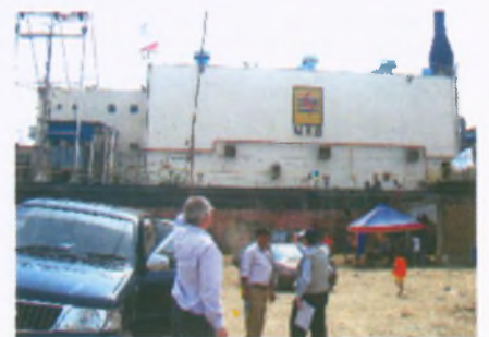
A ship washed away on the road several kilometers from sea in Aceh

The President has requested all collaborating donor agencies for their urgent support and instructed