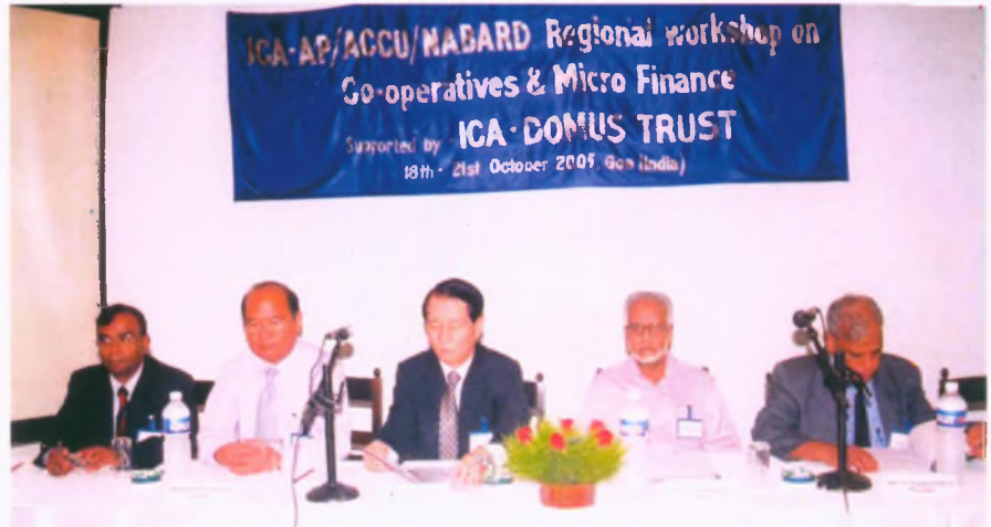
Distinguished delegates at the dias

In line with the theme of the International Day of Co-operatives "Micro Finance is our Business! Co-operating out of Poverty", this regional workshop on co-operatives and micro-finance, organized by the International Co-operative Alliance in partnership with Asian Confederation of Credit Unions (ACCU) and the National Bank for Agriculture and Rural Development (NABARD) of India, aimed at discussing important