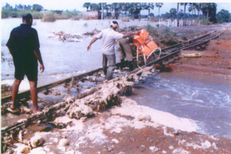
This what is left of a railway track