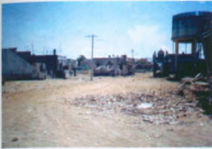
Temporary shelters provided to the victims

co-operatives in doing their daily transactions and businesses. Government has announced the concessions to be given on purchase of boats, nets, equipments at the individual level but there is no immediate plan to reconstruct the infrastructure of co-operatives.