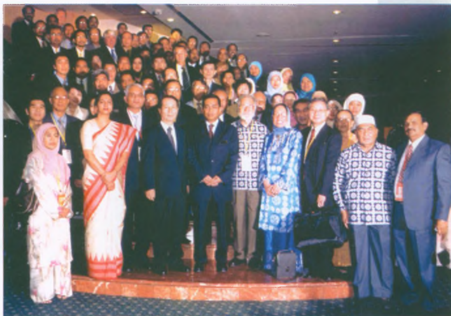
Participants of the Co-operative-Government Dialogue in Malaysia

Co-operatives belong to resource deficient segments of the society. The co-operative policy of the government must lay special stress on protection of the vulnerable target groups, women, youths and refugees through co-operative action.