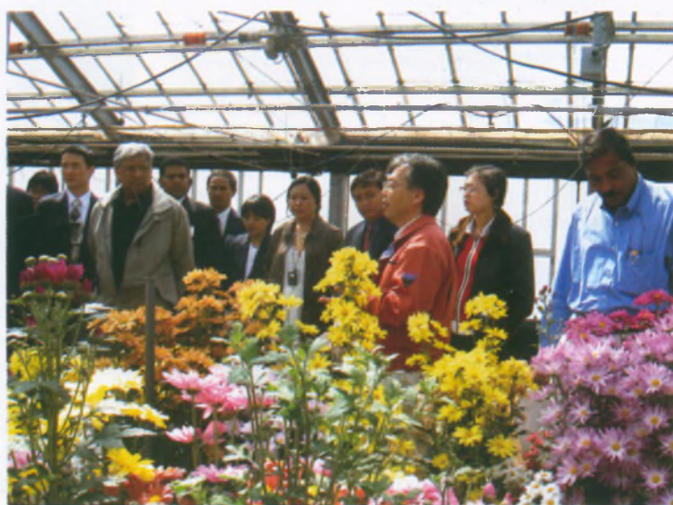
Participants visited a farmer's Green House in Japan

Certificates of Participation from the ICA as well as from the IDACA were awarded to the participants during the concluding session.