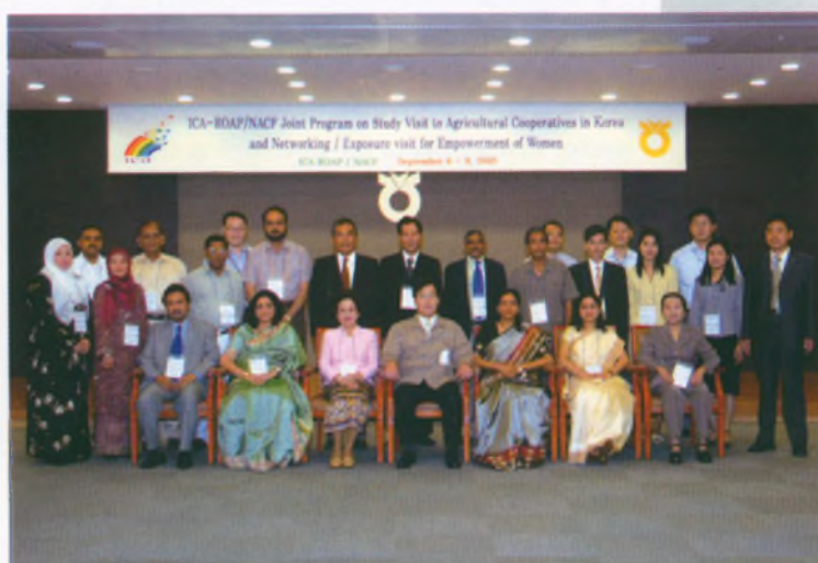
Participants of the study visit programme in Korea

The information sharing during the exposure visits to successful co-operatives, focused upon co-operative endeavour to promote women's