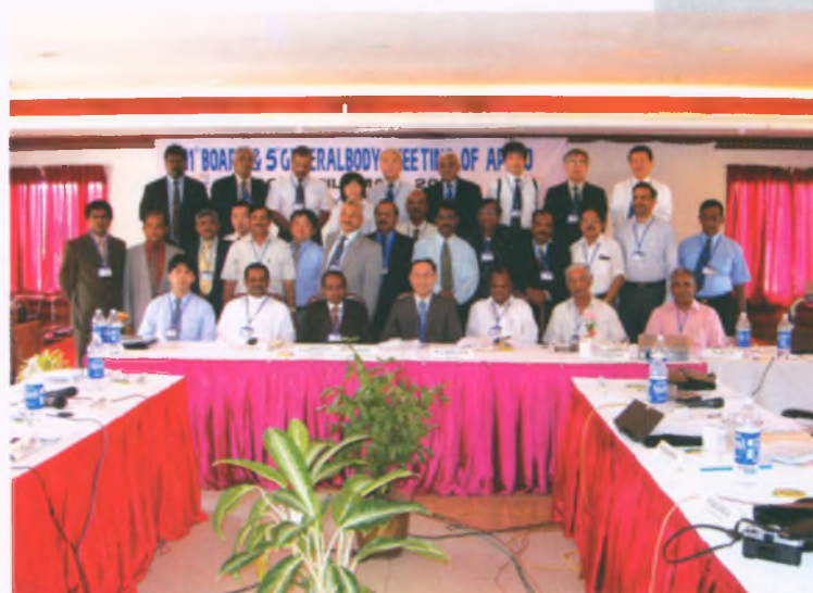
At the APHCO meeting in Tellicherry, Kerala, India

Approval was granted by the General Body to admit two new members from Sri Lanka. They are (1) Colombo Co-operative Hospital, and (2) Nuwara-Eliya Multi-purpose Co-operative Society Ltd.