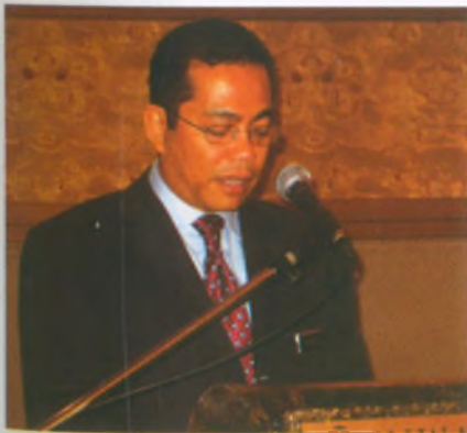
Hon. Minister of Entrepreneur and Co-operative Development Yang Berhormat Dato Mohd. Khaled bin Nordin speaking at the Dialogue.

The Government should recognize co-operatives as unique entities with a blend of economic and social responsibility in the light of ICIS of ICA and recommendation 193 of ILO and as a catalyst alongside the public and private sectors in the national development plan.