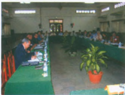
The workshop in progress