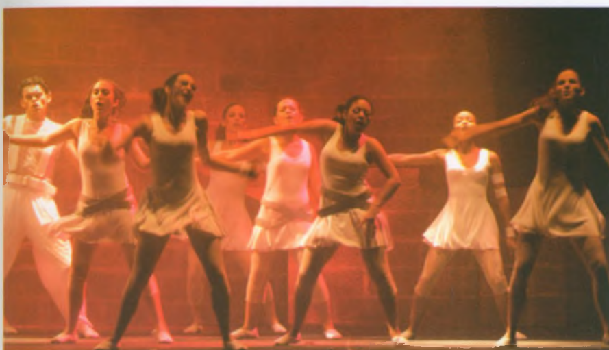
Young boys and girls performing at the welcome reception in Cartagena