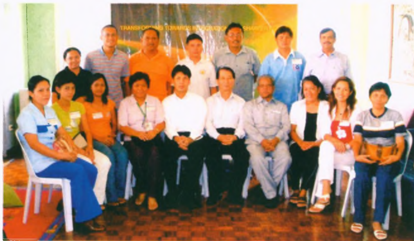
Participants of the workshop in Cebu, Phillipines

A similar workshop was organized in Manila, Philippines on 24-25 November 2005. Here also 13 participants from Manila and nearby provinces participated. NATCCO hosted this event.