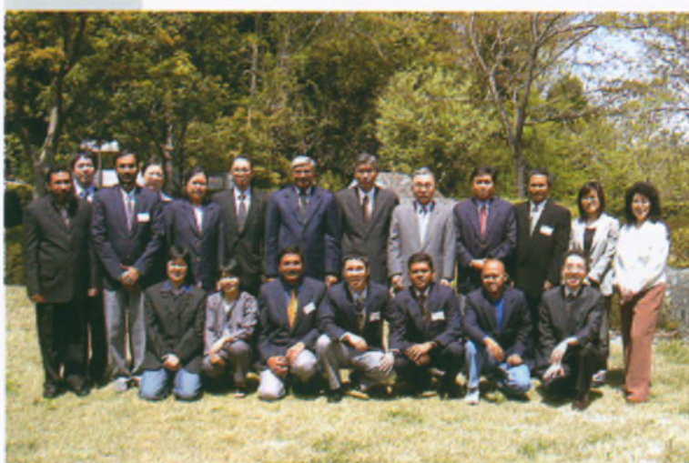
Participants of the course at a photo opp at IDACA