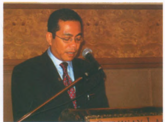
Hon. Minister of Entrepreneur and Co-operative Development Yang Berhormat Dato Mohd. Khaled bin Nordin speaking at the Dialogue

Good governance has to be ensured by adopting a clear mission and vision statement coupled with