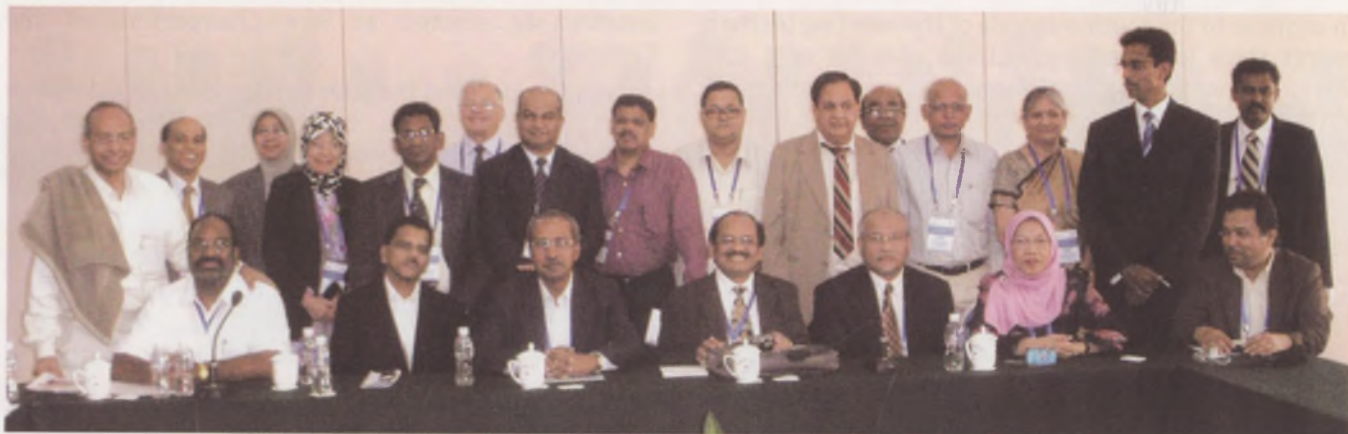
Participants of the HRD Committee Meeting