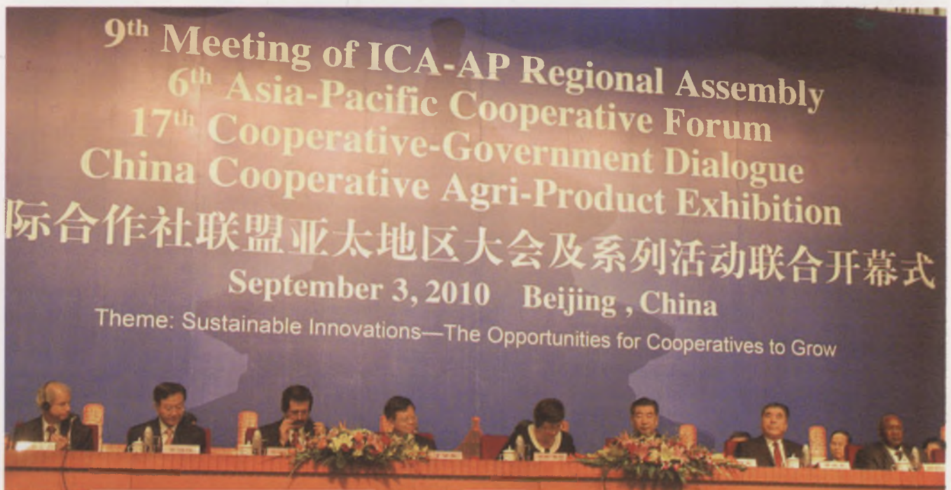
His Excellency Liangyu HUI, Vice Premier of Peoples Republic of China and Dame Pauline Green, ICA President at the joint opening

The 9th Meeting of the ICA-AP Regional Assembly was held at BICC, Beijing (China) on 5th September. 283 participants from 22 countries attended the Regional Assembly.