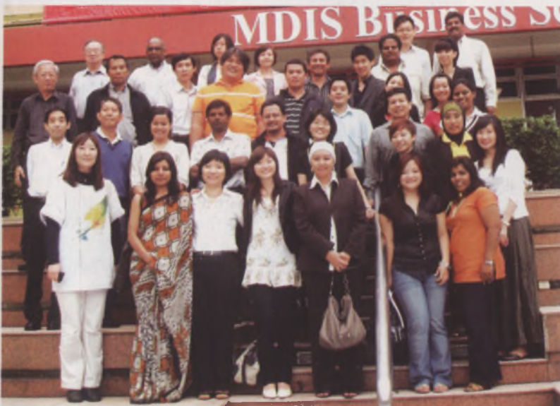
The Group of Co-operative Leaders at the Business Seminar