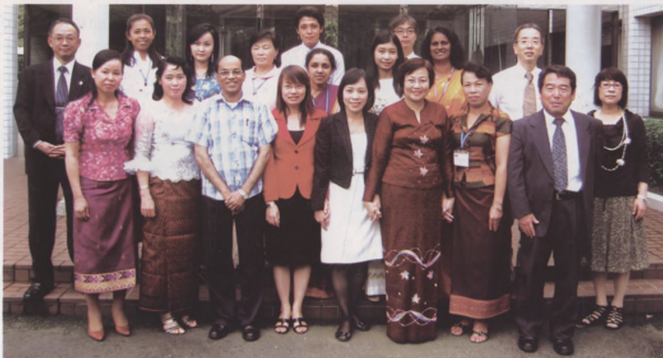
5th Training course-The Participants

classroom work and study visits to agricultural co-operatives in Kanagawa and Nara Prefectures of Japan. Lecture-cum-practical field study visits assignments were combined to impart necessary knowledge to the participants on the working of women's associations and the general activities of agricultural co-operatives in Japan. The part-II of the program - field study visits - was held in Vietnam from 8th to 16th October in collaboration with the Vietnam Co-operative Alliance [VCA], a member organization of ICA.