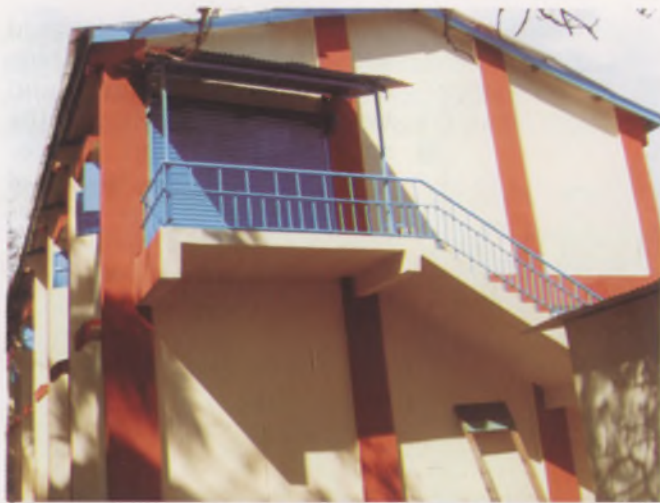
Post cyclone physical reconstruction of co-operative in Myanmar

wrath of the disaster. In all 259 members of these Co-operatives died and 8544 were rendered homeless. The ICA, in response to its call to global Co-operative fraternity, received a generous support from its following member Co-operatives for the revival of most affected and marginalized Co-operatives in Myanmar: