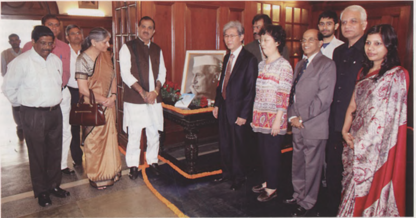
Homage to Pt. Jawahar Lal Nehru at Nehru Memorial

1960 in New Delhi. The National Co-operative Union of India played an important role in facilitating and supporting the establishment of the International Co-operative Alliance in the Asia region. The then Prime Minister of India Pandit Jawahar Lal Nehru had been a great supporter of the co-operative movement in India. The Indian co-operative movement celebrates a national co-operative week every year starting from 14th November, the birthday of Pandit Nehru.