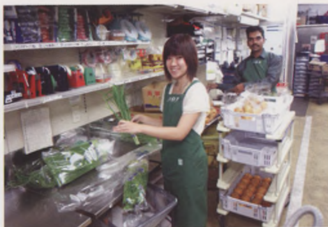
The Coop Store

The participants learnt about store operation, product policy, quality assurance, sales promotion, staff training, direct transaction with farmers (Sanchoke) and member's involvement in business of