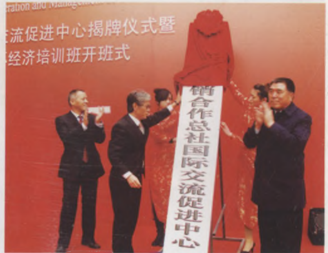
Inauguration of ICECC

An International Cooperative Exchange Center of China