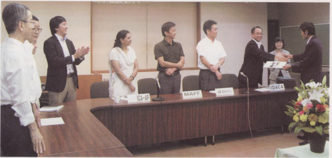
Award of certificates to the participants

products and methods of rural development. The objective of the project is to train human resources for organising farmers and strengthening marketing activities of co-operatives/farmer's organisations.