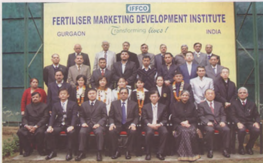
ICA-Japan Training Course participants

The 4th Training Course on Enhancement of Farmers' Income and Poverty Reduction through Co-operatives was held in India/Iran/Japan from 7th January to 17th April in collaboration with IFFCO in India, CURACI/ ICC in Iran and JA ZENCHU/ IDACA in Japan. Twelve participants from ten countries are attending the Training Course. The focus of the Course is on strengthening of farm guidance method, joint collection, shipment, safety and improvement in quality of farm products aimed at increasing farmers' income as a new development for the training course.