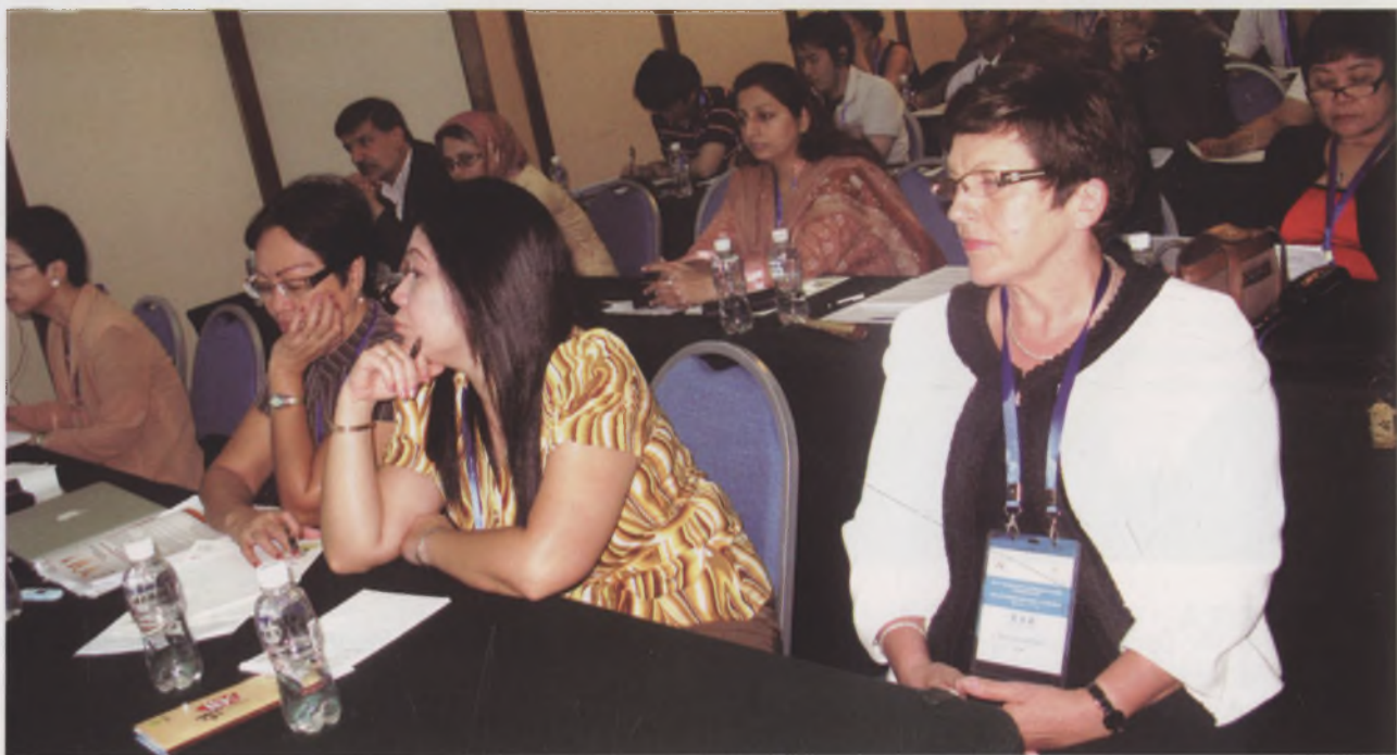
Dame Pauline Green, ICA President with the participants at the forum

The 6th Regional Women and Youth Forum was held at BICC in Beijing on 2nd September. The theme of the Forum was "Co-operatives: The Sector for Empowerment of Women and Youth". A total of 40 co-operators from ten countries attended the Forum.