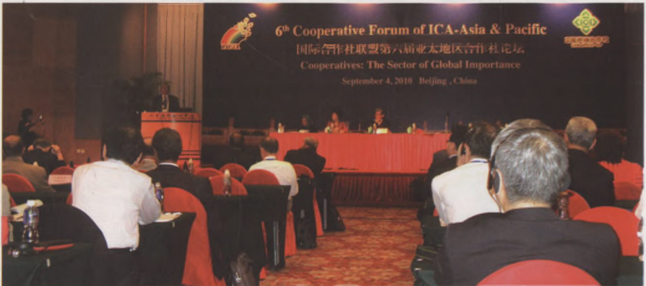
Co-op Forum in progress

The 6th Asia-Pacific Coop Forum was held along with the ICA-AP Regional Assembly on 4th September at BICC in Beijing. The Theme of the Coop Forum was :