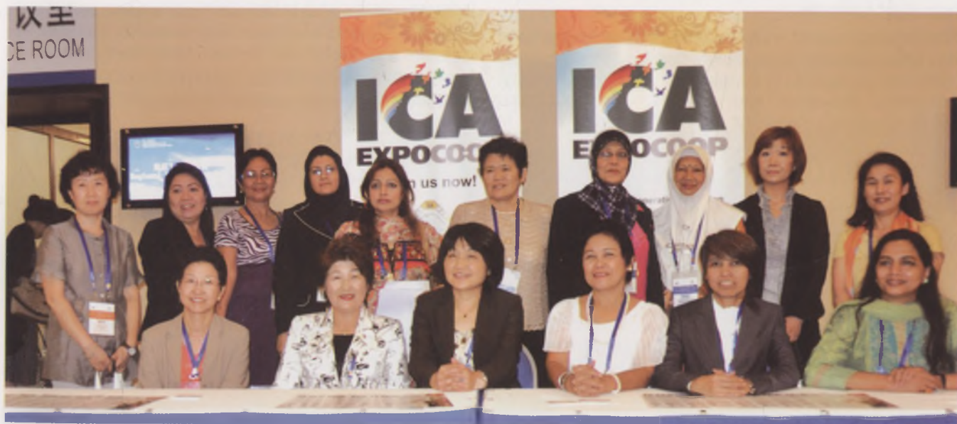
Participant at the RWC Meeting