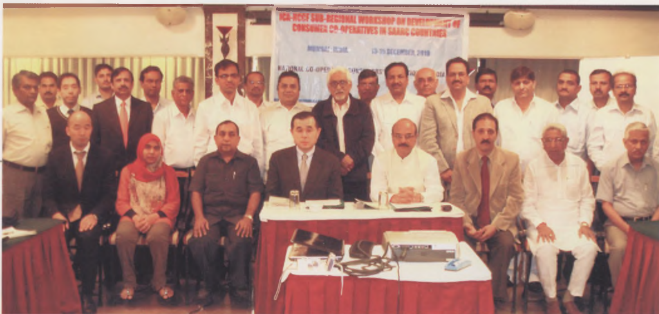
Participants and delegates with Chairman, NCCF