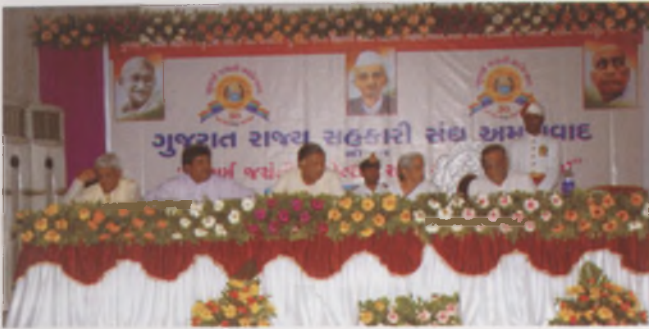
Coop Leaders at the Opening

On completion of 50 years, the Gujarat State Co-operative Union celebrated Golden Jubilee and State level Co-operative convention at Adalaj, Dist. Gandhinagar on 27th June 2010, which was inaugurated by Hon'ble Governor of Gujarat, Dr. Smt. Kamlaji.