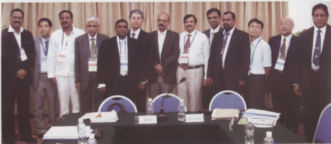
Participants at the meeting

The 44th meeting of ICA Committee on Consumer Cooperation was held at BICC in Beijing on 2nd September. 16 participants from five countries (India, Japan, Korea, Malaysia, and Sri Lanka) attended the meeting. In addition, eight observers from Sri Lanka also attended the meeting.