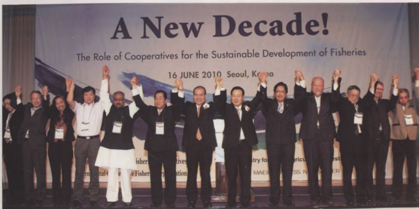
Participant at the Symposium

ICFO and NFFC jointly hosted an International Symposium on fisheries and fisheries co-operatives on 16 June, 2010.