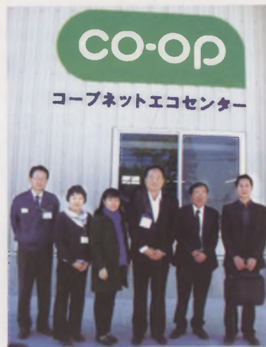
Participants at the coop store

ii) ICA Training Program for managers of consumer coops in Japan was held on 29 Oct to 14 November, 2010. 3 Managers of consumer co-ops one from Singapore and two Vietnam were invited. They learnt about store operation, challenges faced Co-op Kobe, quality assurance, staff education, analysis of feedback from members and members' satisfaction and member's