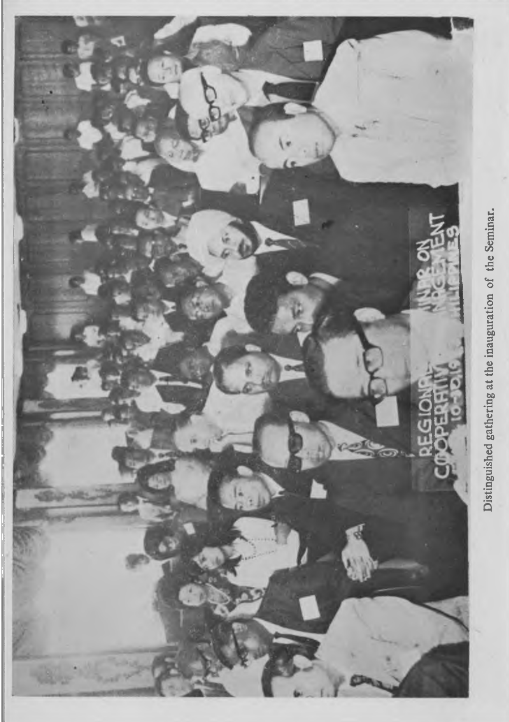
Distinguished gathering at the inauguration of the Seminar.