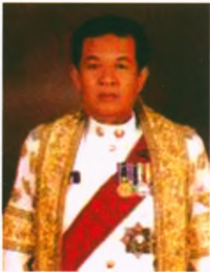
MR. WAN MUHAMAD NOOR MATHA Minsiter of Agriculture

MR. WAN MUHAMAD NOOR MATHA , the Minister of Agriculture and Cooperatives was born May 11, 1944. His Educational qualifications include a B.Ed., Bachelor of Education (Social Science) Chulalongkorn University in 1969 and in 1974 he did his M.Ed., Master of Education (Administration) Chulalongkorn University.