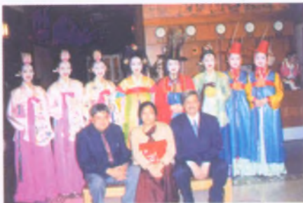
Some of the delegates with artists who presented a cultural programme

The seminar was supported technically and financially by DiD of Canada, while NACF and Agricultural Co-operative College of Korea extended local organizational and logistic support.