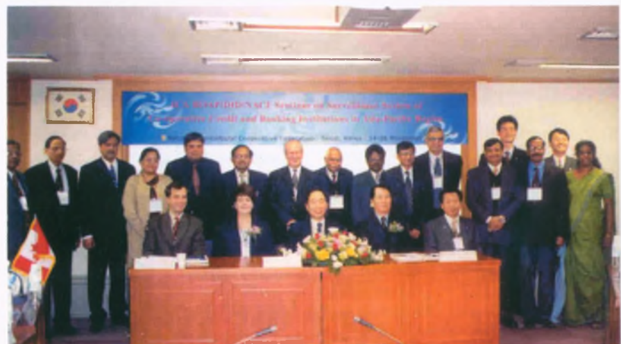
A group photo of the participants