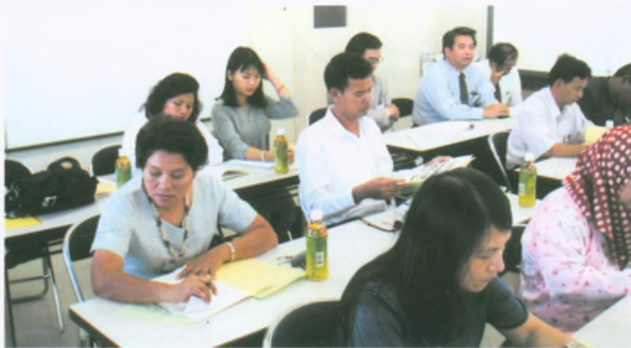
Participants attending the training course

In association with its member organisation in Japan, the Central Union of Agricultural Co-operatives of Japan (JA-Zenchu) and IDACA, we have organised the 2nd ICA-Japan Training Course for "Strengthening Women's Agricultural Co-operatives in Rural Areas and Improvement of Farm Management and Rural Life" in Thailand and Japan, from 29 August to 4 October 2002. Eight participants - two each from Indonesia, Malaysia, Thailand and Vietnam, attended the training course, funded by the Government of Japan in the Ministry of Agriculture, Forestry and Fisheries (MAFF).