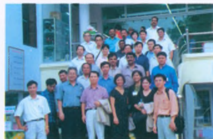
The delegates attending the consumer committee and the youth meetings, visited a supermarket operated by Vietnam Co-operative Alliance.

After the meeting, many of the delegates joined in a study visit to Saigon Co-operative in Ho Chi Minh City, where they observed and appreciated the working of Saigon Co-operative, which is the Federation of consumer co-operatives in Ho-Chi Minh City and Saigon province.