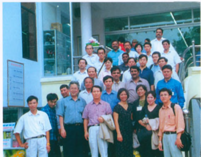
Delegates visited the VCA supermarket in Hanoi