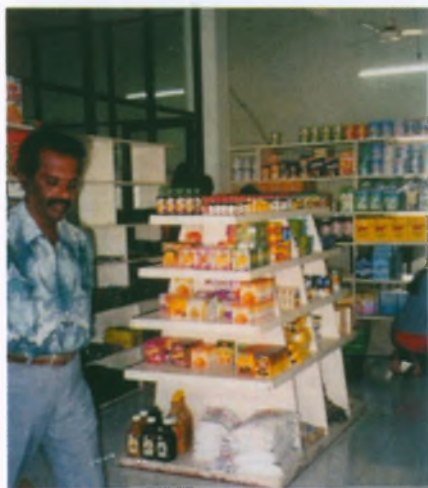
Co-op Supermarket display