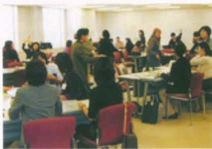
Another view of the Forum

On October 10, the Japan Joint Committee (JJC) held the 3rd Annual Co-op Women's Forum, in response to an appeal by the ICA Regional Office for Asia and the Pacific to organise such activities. 90 women representatives from different prefectures of Japan, along with some men from agricultural, fisheries and consumer co-op sectors, exchanged information and views on the activities of women in the co-operative sector. The Japanese co-operatives held such joint meetings in 1998 and again in 2000.