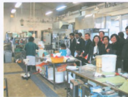
Course participants at a field visit to Kagoshima co-op

the training programmes. They prepared a total of 237 project proposals on topical subjects.