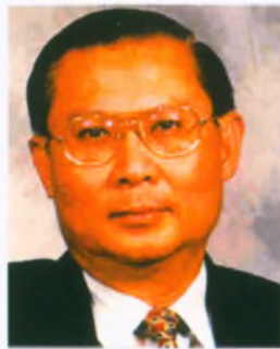
Chairman, NTUC Income

The total premium income for 2001 was 2.6 billion Singapore dollars. A