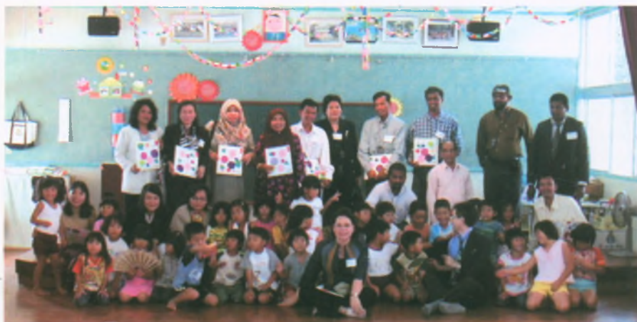
Participants during a field visit

The 10-day comparative field study visits, which was a component of the course, was held in Thailand from 29 August to 8 September 2002 in collaboration with the Co-operative Leagues of Thailand (CLT) and the Co-operative Promotion Department (CPD), Government of Thailand.