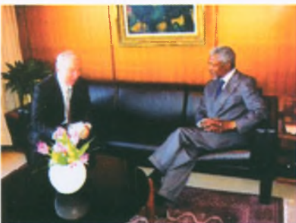
Kofi Annan, UN Secretary General with ICA President