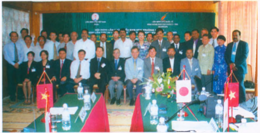
The delegates of the 35th meeting posed for a group photo