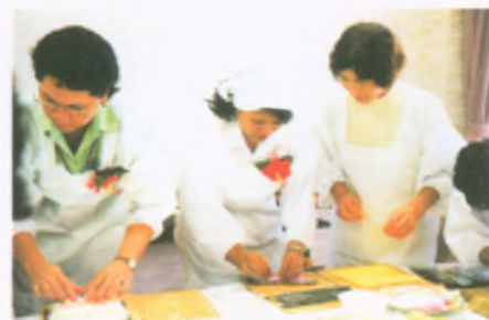
Women trainees visited social facilities in Thailand