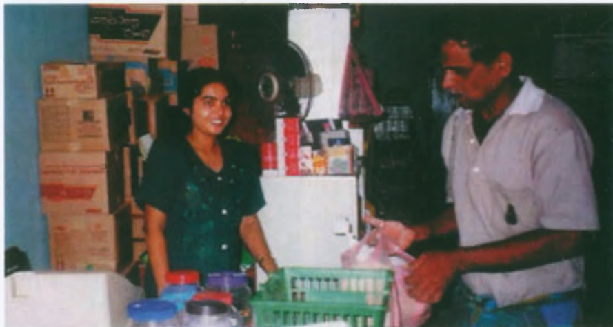
A view of a simple consumer co-op store in Sri Lanka

Most of the co-op stores at present in Sri Lanka are small stores of about