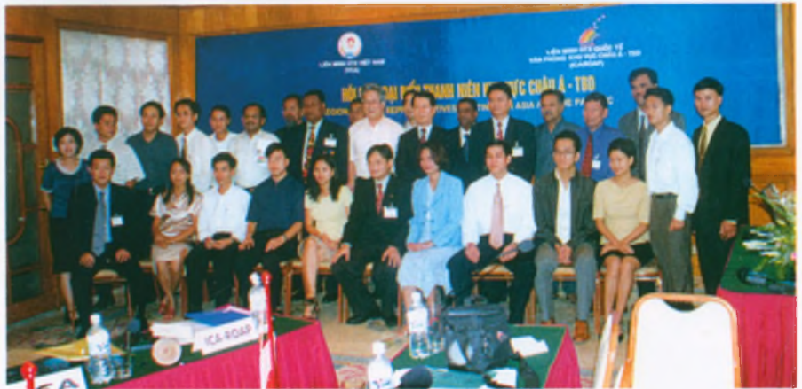
The youth posed for a photograph with the elders