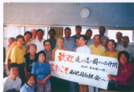
Old person's Han group meets in a co-op hospital every third Thursday of the month. The delegates visited them.