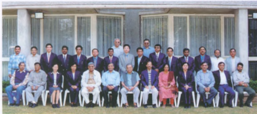
Participants of the course with Dr. V. Kurien, eminent co-operator and chairman of National Co-operative Dairy Federation of India, at IRMA, Anand.