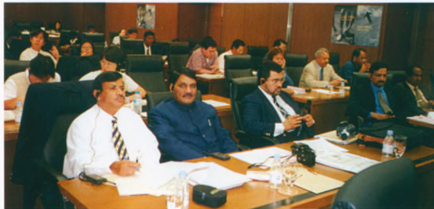
The APHCO Seminar in progress