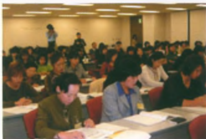
Forum in progress

At the forum, representatives participated in panel as well as in group discussions.