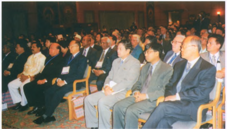
Delegates at the Co-operative Ministers' Conference