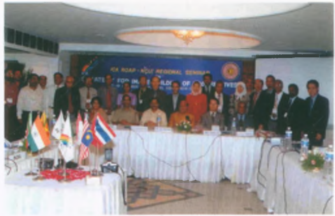
The delegates at a photo opportunity