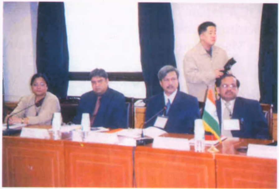
Delegates intently participating at the seminar