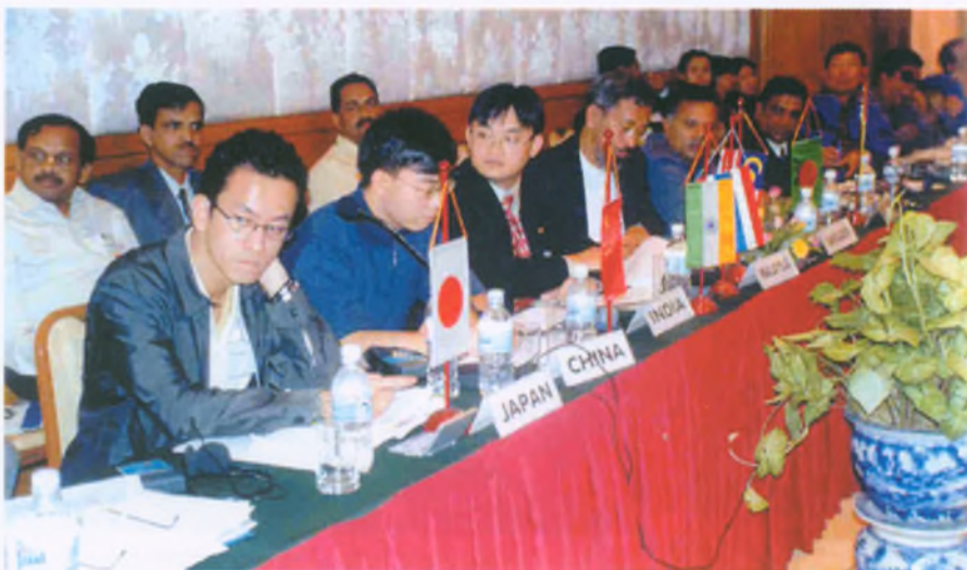
Delegates attending the consumer committee and youth meetings in Vietnam

Five delegates from Japan, Thailand, Philippines, China and Vietnam and 24 observers participated at this meeting. While making country presentations, the delegates mentioned that they are very eager to have more and more networking amongst themselves and emphasized