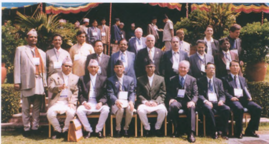
Delegates had a group photo with the Prime Minister of Nepal, ICA President and Vice President in the front row.