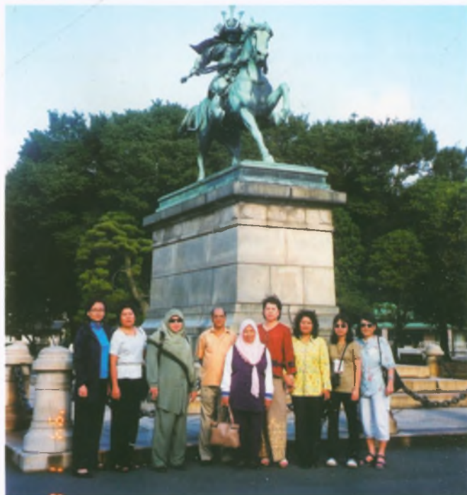
Delegates in Thailand during study visits

prepared brief reports on the experiences gained by them. An end-of-the-course evaluation session was also held.