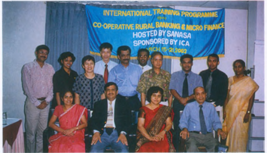
Participants posed for a photograph

Eleven (11) participants from six countries - India, Korea, Nepal, the Philippines, Singapore and Sri Lanka participated programme. Three observers from Ireland, Scotland, and England also attended the training programme.