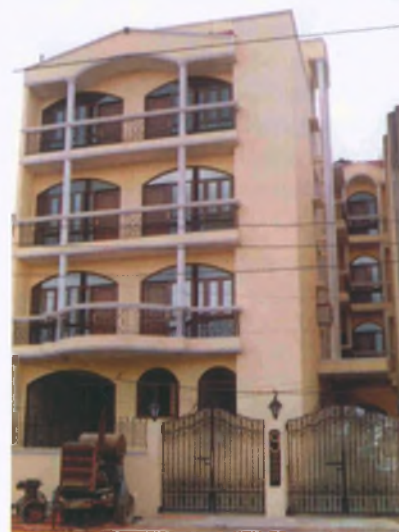
The new premises of ICA Regional Office for Asia and the Pacific

There is a proposal to upgrade our CIRC to World Bank Depository Library or Regional Library in the current year, which will strengthen the collection on development reports, provide free public access to member countries to the World Bank's published information and make the information Center more digital with access to CD's and Videos etc.