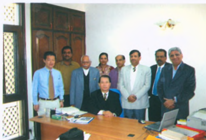
ICA ROAP staff during 2002