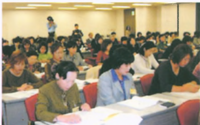
A view of the delegates at the National Women's Forum organised by the JCCU during the year.

Apart from this activity, the Regional Women's Committee Office bearers met a couple of times in Malaysia to plan and organise the 3rd Asia-Pacific Regional Women's Conference and the 3rd meeting of the Committee, to be held in Cebu, Philippines, during February, 2003.