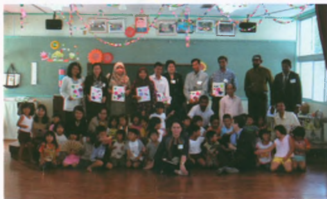
Delegates posed for group photo in Kagoshima.

Field study visits were arranged to agricultural co-operatives and women's associations in Chiba, Kanagawa and Kagoshima Prefectures of Japan. Lecture-cum-practical field study assignments were combined to impart necessary knowledge to the participants on the working of women's associations and the general activities of agricultural co-operatives in Japan. The participants also held group discussions and