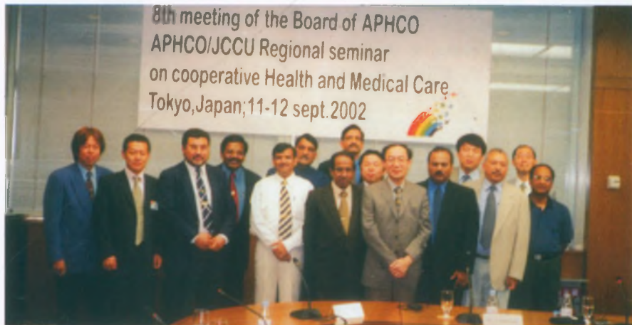
APHCO board members poses for a group photo

After the board meeting, a Regional Seminar on Co-operative Health and