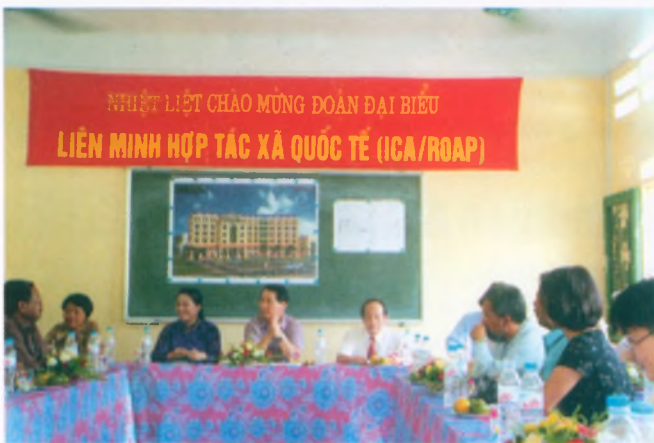
The delegates also visited a primary university co-operative in Hanoi.