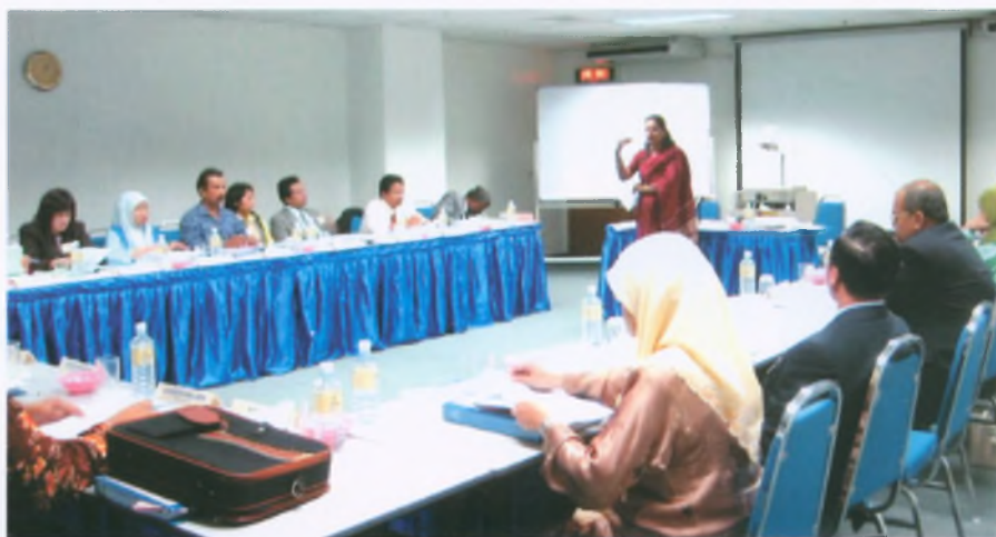
The training session in progress

The first ICA/ILO Coopnet Trainers' Training Programme for Leadership Development for Women was held in Kuala Lumpur, Malaysia from 21-26 October, 2002.