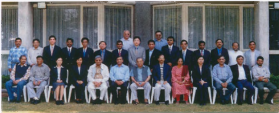
Participants of the course at the end of training at IRMA, with Dr. V. Kurien, Chairman, IRMA and National Co-op Dairy Federation (centre)

Management Leadership Development Module at the Institute of Rural Management [IRMA] at Anand, from January 20 - February 23, 2002; and the Wrap-Up Sessions held in New Delhi (February 23-24).