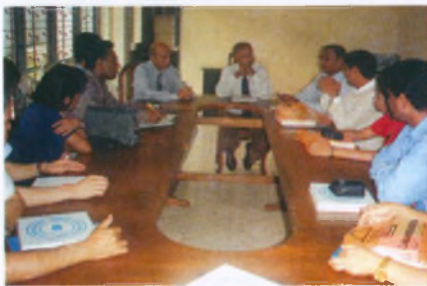
A view of the training session

Officer, spoke to the participants representing the ICA Regional Office for Asia and the Pacific. Participants visited various places in and around Colombo for study visits, practical training and sight-seeing. On the last day of the programme, an evaluation was conducted and participants gave suggestions to improve the programme in future.