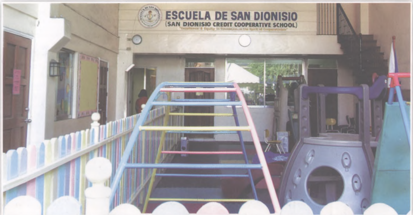
The School run by the co-op