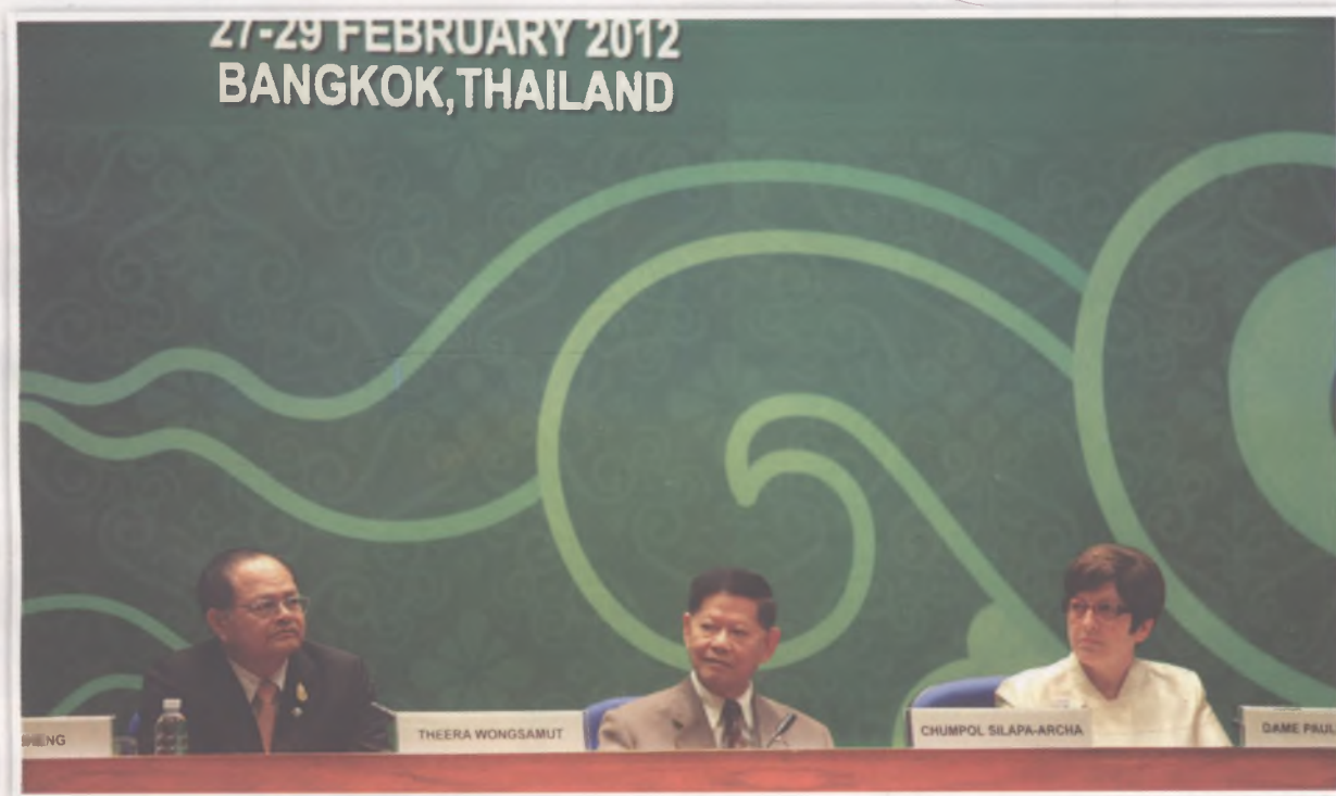
ICA President Dame Pauline Green with H E Chumpol Silpa Archa the Deputy Prime Minister of Thailand