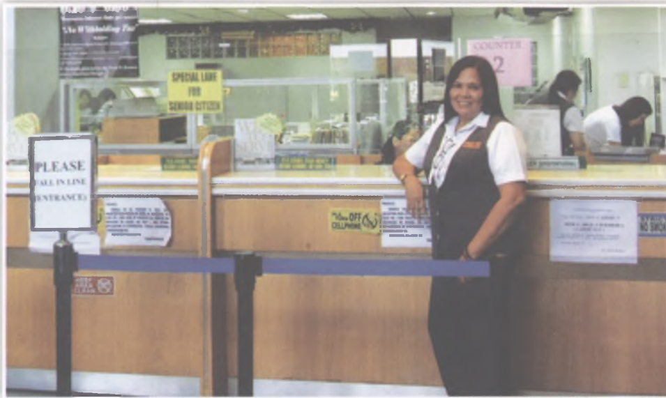
The Credit Co-op counter