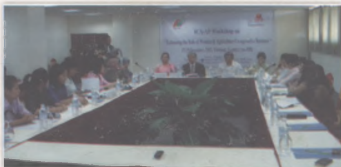
Workshop in progress

The ICA-Asia and Pacific Workshop on “Enhancing the Role of Women in Agriculture Co-operative Business” was held from 17-19 December, 2012 in Vientiane City, Lao PDR in collaboration with Ministry of Agriculture and Forestry, Government of Lao PDR. Six participants from four countries namely China, India, Indonesia and Malaysia attended the workshop along with participants from MAF, Lao.