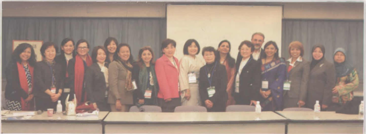
Delegates at the Forum

"Women in Co-operatives Build a Secured Society"