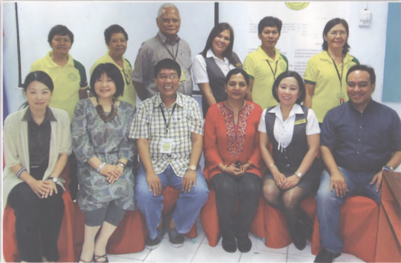
The Chairperson and CEO of the San Dionisio Credit Co-operative with ICA RWC during the visit