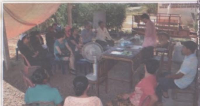
Participants with the farmers

The participants also visited Organic Vegetable Production Group and Nikone Handicraft Centre.