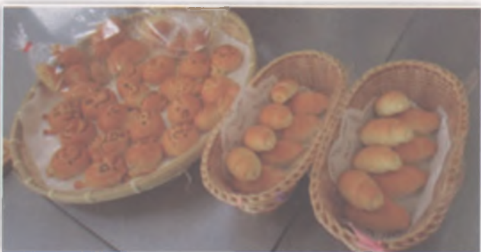
Sweet and cute bread

The infrastructure for the workshop is subsidised by the government and the group uses it's own resources as well. They pay 13% commission to JA for using JA Direct Farmers Market outlet. The annual turnover is US$ 400,000 or Japanese Yen 400 million.