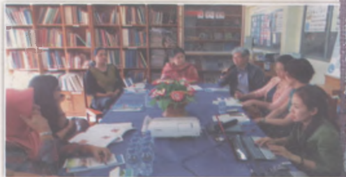
With Lao Women Union

After the workshop, participants went on study visit to Lao Women Union and met Chairperson of the Union.