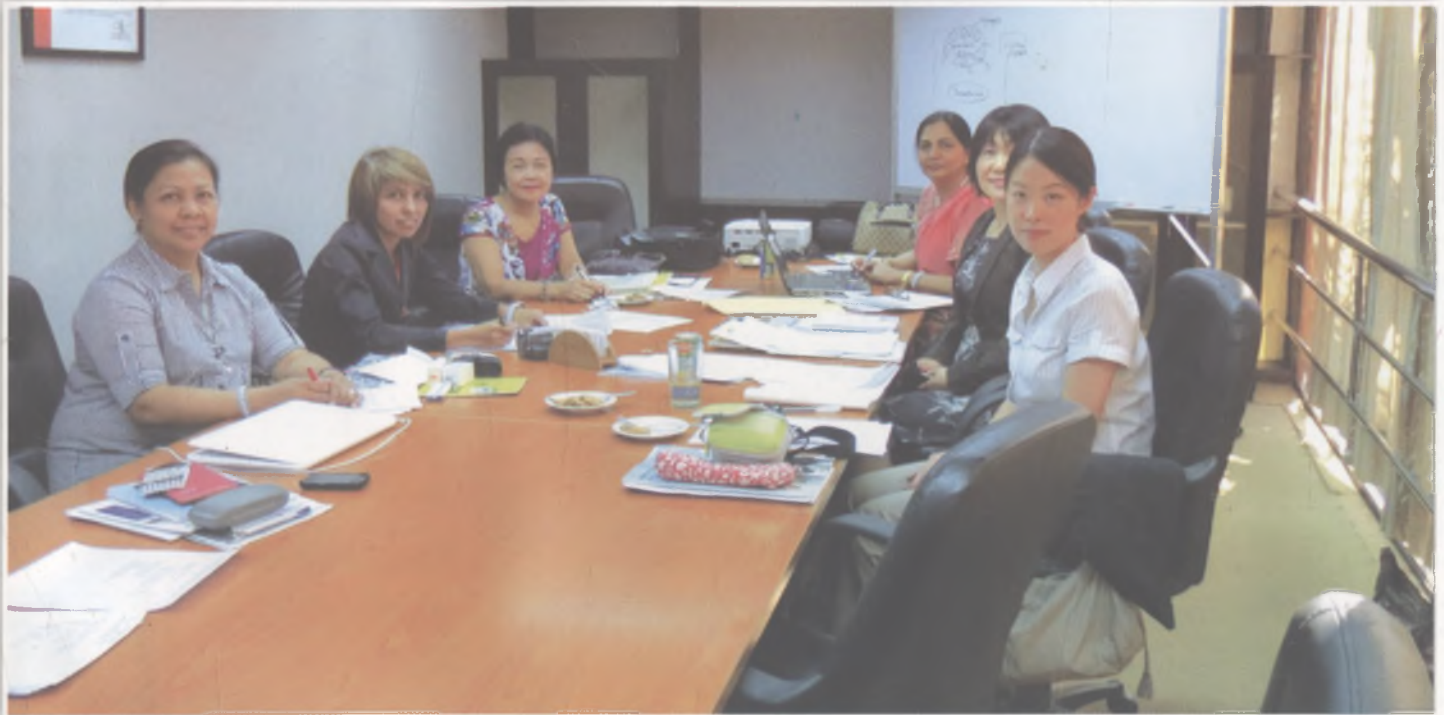
Meeting in progress