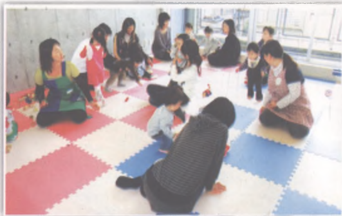
A very busy "Parents and kids club"

easy without worries" "Kids love warm atmosphere of the center" "Service charge is very reasonable" Relaxing atmosphere is kept in the office thanks to the kids. Childcare center is one of the attractions for part time workers and successfully retains female workers.