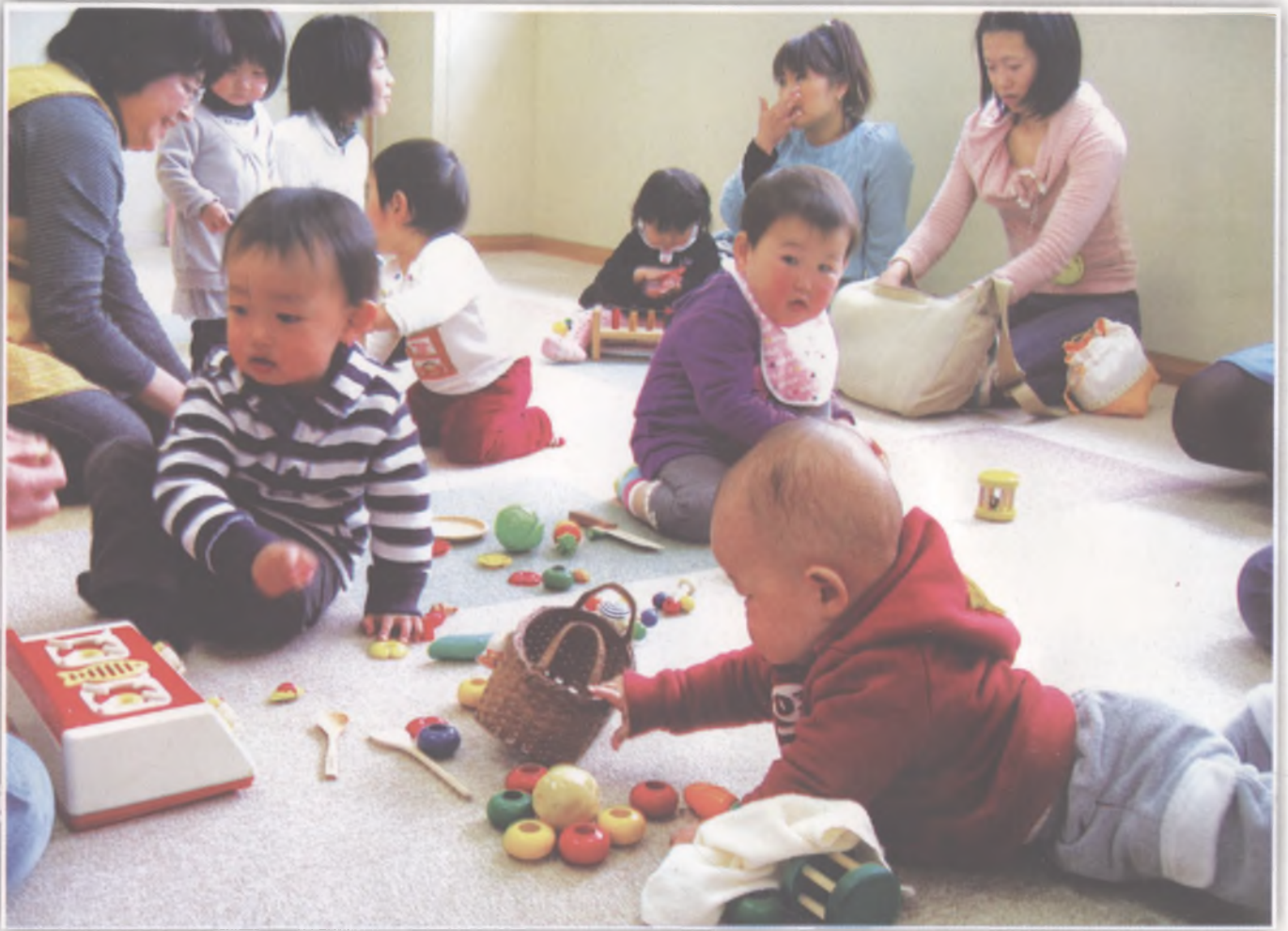
Children are playing in a Child Care Centre