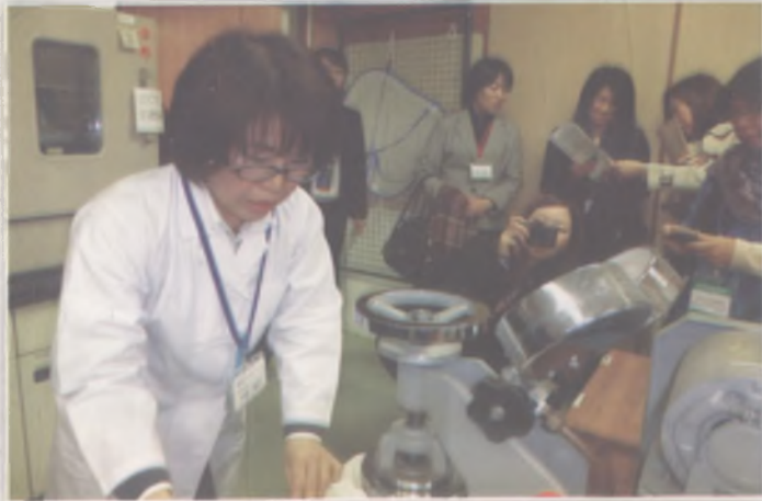
The R&D Centre