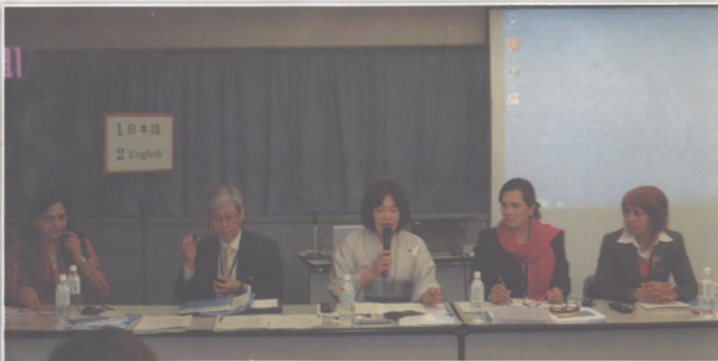
Meeting in progress