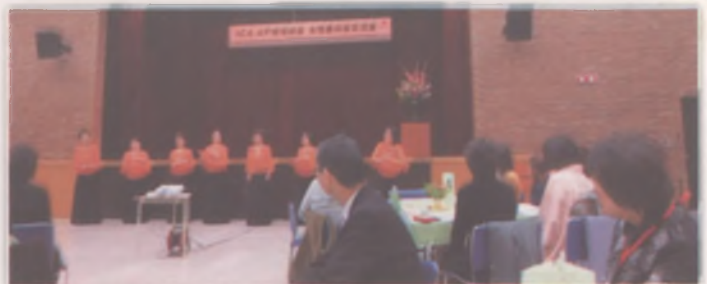
Japanese delegates singing at the opening of the Exchange Program

The participants also visited "Seer", Co-op Department Store for shopping.