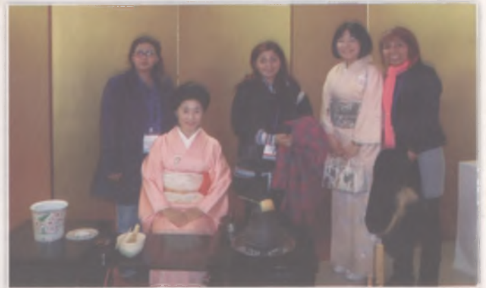
Japanese Tea Ceremony

After the initial introductory session, the participants moved to visit the Consumer Co-operative Kobe Inspection Laboratory.