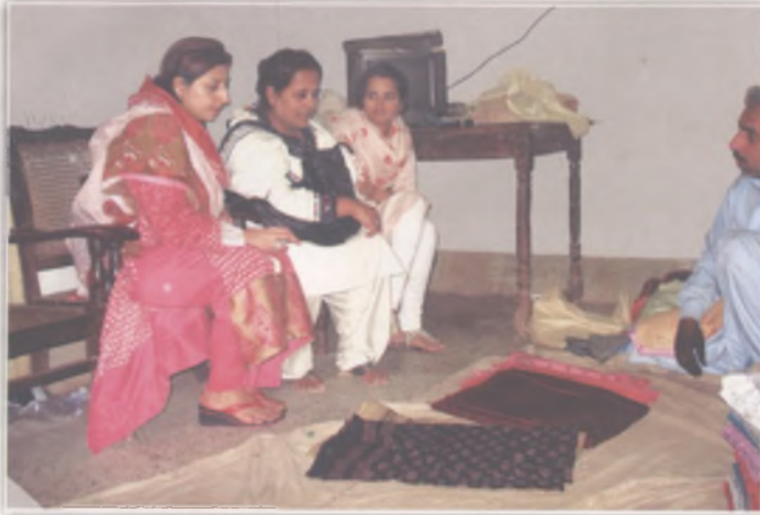
An artisan showing his creations to buyers

Historically, economic participation of women in Pakistan had been constrained by lack of access to education, credit, training, market linkages, linkages among researchers, planners, policy makers and the financial sectors. We at KCHSU recognise that access to credit alone is not the solution of women's economic problems but to create women entrepreneurs may help to a great extent. About 60% of poor women run cottage industries from homes as they do cloth printing, embroidery work and stitching. These items are sold in nearby markets.