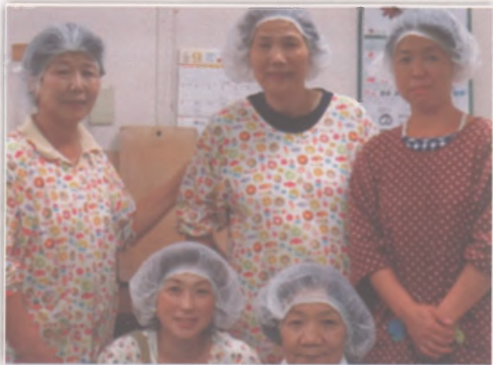
Some members of the Women Food Processing Group