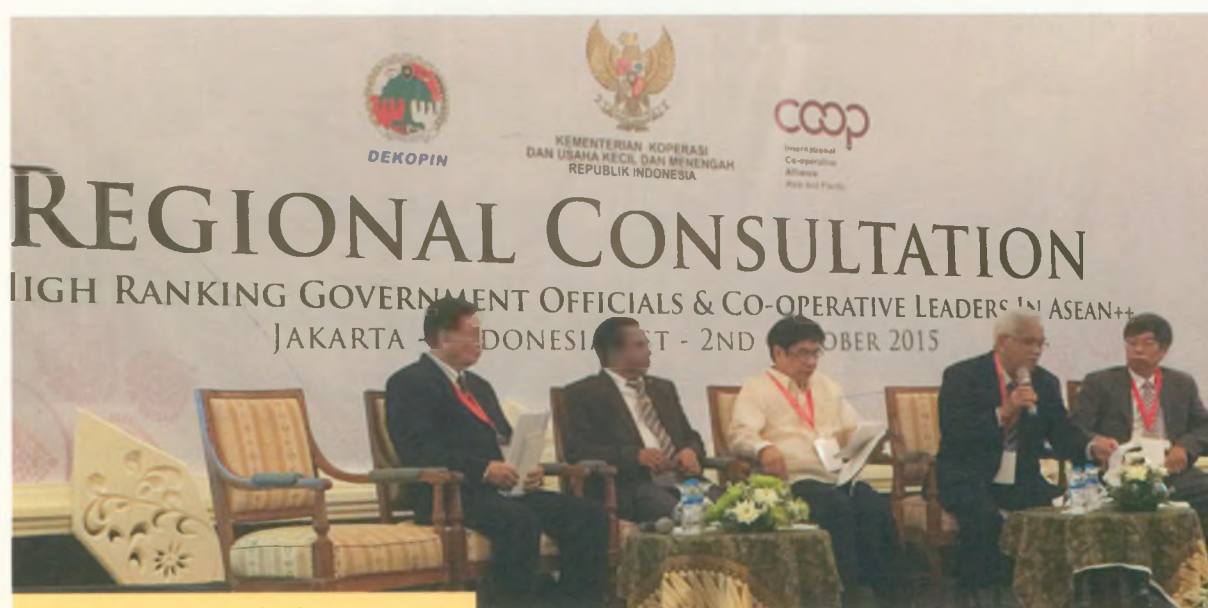
Jakarta Consultation in progress