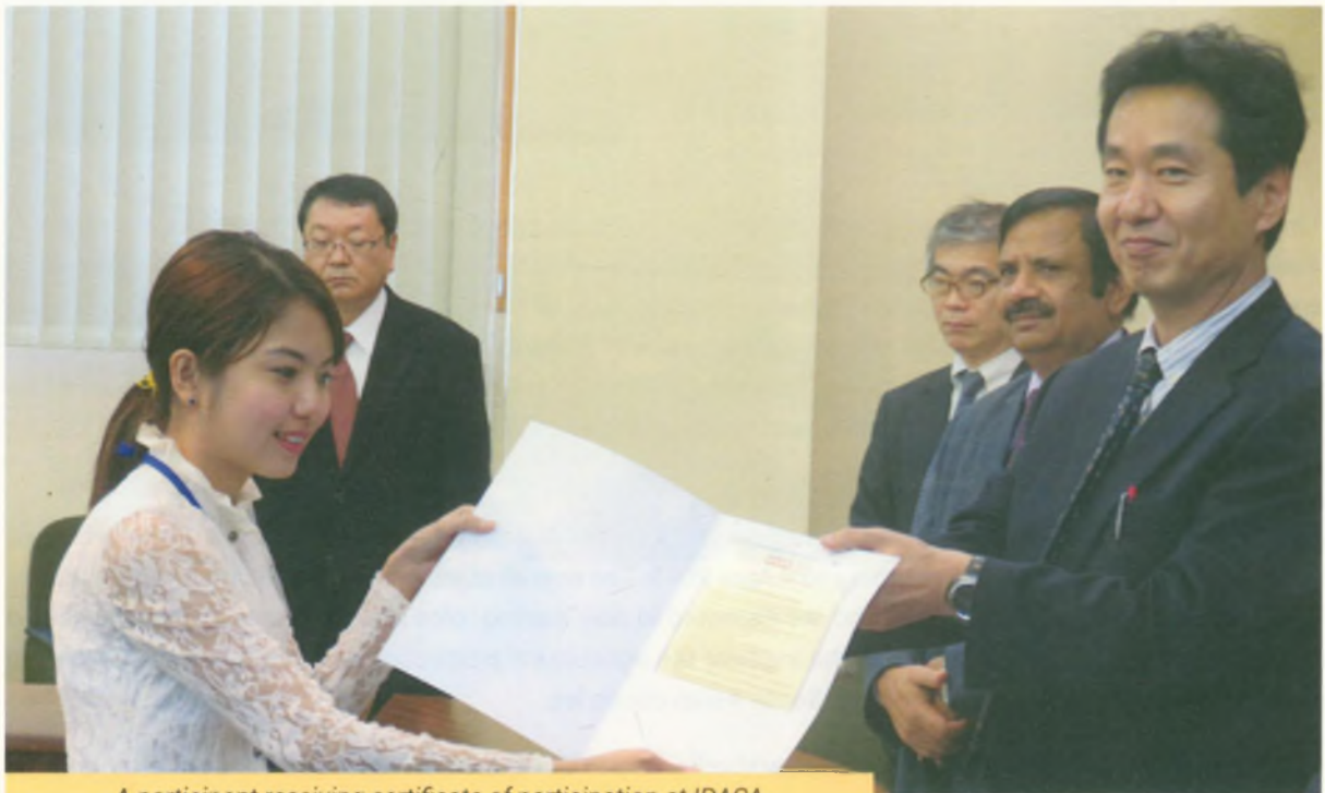
A participant receiving certificate of participation at IDACA.

The ICA-Japan Training Project Follow-up was held in Indonesia and Myanmar from 8 to 20 February. The purpose was to assess the impact and effects of the past training courses held since 2013. In particular, to see how Action Plans drafted by the participants have been implemented upon return. The follow-up study was conducted through a questionnaire, exchange of views and ideas with ex-participants and site visits to some of the co-operatives where the former participants were working. The team held one-on-one meeting with the participants to discuss how the learning from the training was being used and implemented by them in the field and the problems faced by them in the course of implementation. The team also held meetings with the heads of sponsoring organizations for a briefing about the objectives of the follow-up program and their opinion on its usefulness. The report of the follow-up visits has been submitted to MAFF, Government of Japan.