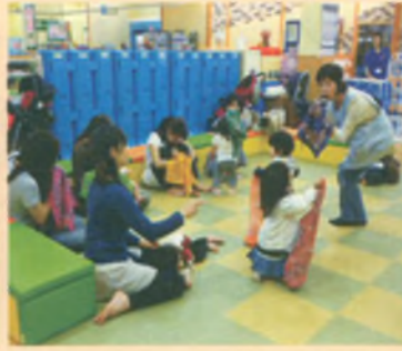
Member's room at Miyagi COOP