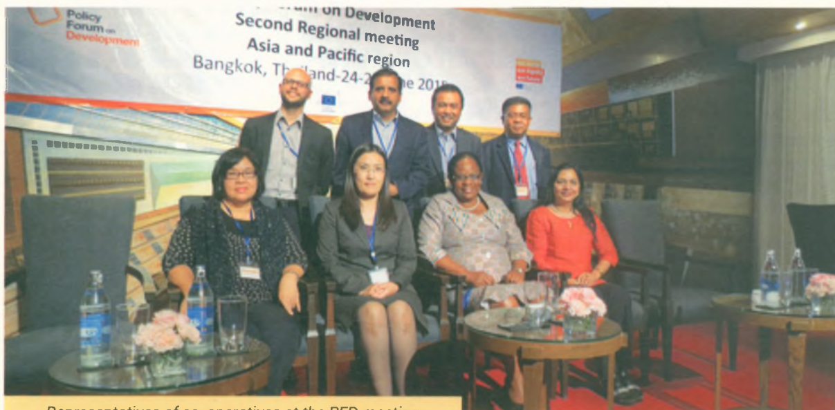
Representatives of co-operatives at the PFD meeting

comprise of 17 universal set of goals and 169 targets and indicators. In order to make the SDGs inclusive the UN has been undertaking the largest consultation program in its history to gauge opinions on form, process of implementation and funding. In a similar vein, donors, such as the EU have been providing platform for dialogue on the proper implementation and monitoring of SDGs in order to ensure the common objectives of eradicating poverty, reducing inequalities, providing dignity for all and developing in a sustainable way are achieved.