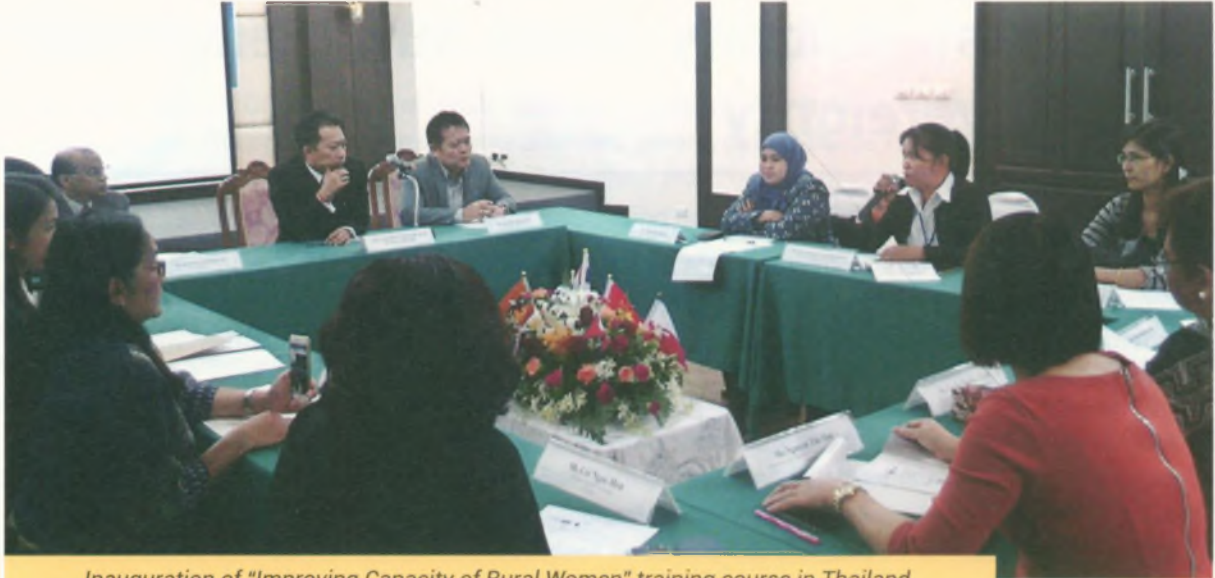
Inauguration of "Improving Capacity of Rural Women" training course in Thailand.

The ICA-Japan Training Project Follow-up was held in Indonesia and Myanmar from 8 to 20 February. The purpose was to assess the impact and effects of the past training courses held since 2013. In particular, to see how Action Plans drafted by the participants have been implemented upon return. The follow-up study was conducted through a questionnaire, exchange of views and ideas with ex-participants and site visits to some of the co-operatives where the former participants were working. The team held one-on-one meeting with the participants to discuss how the learning from the training was being used and implemented by them in the field and the problems faced by them in the course of implementation. The team also held meetings with the heads of sponsoring organizations for a briefing about the objectives of the follow-up program and their opinion on its usefulness. The report of the follow-up visits has been submitted to MAFF, Government of Japan.