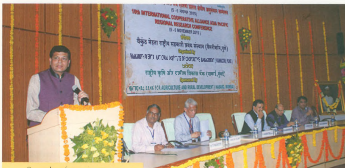
Research conference in progress