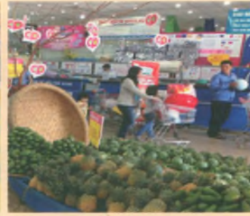
Local products at co-op Mart

Train staff to improve their communication skill and customer service: focus on three actions to deliver strong and clear message: