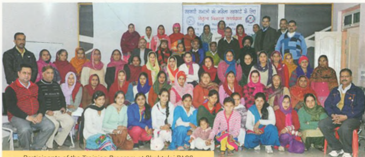
Participants of the Training Program at Shahtalai PACS

The IFFCO Foundation in India initiated a project in 2014 to impart leadership training to 100 women cooperative members in India and create a pool of trained women leaders to actively participate in the management of cooperatives. The Foundation approached ICA-AP to provide technical support in design and implementation of the training program as ICA-AP had developed a training manual on the subject and organized leadership training for women co-operators in the region.