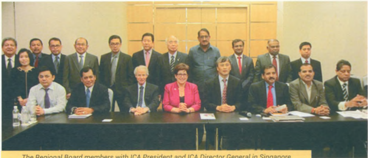
The Regional Board members with ICA President and ICA Director General in Singapore