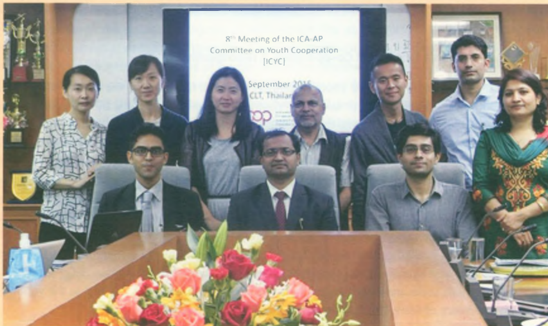
Participants at the 8 th Meeting of the ICA-AP Committee on Youth Cooperation