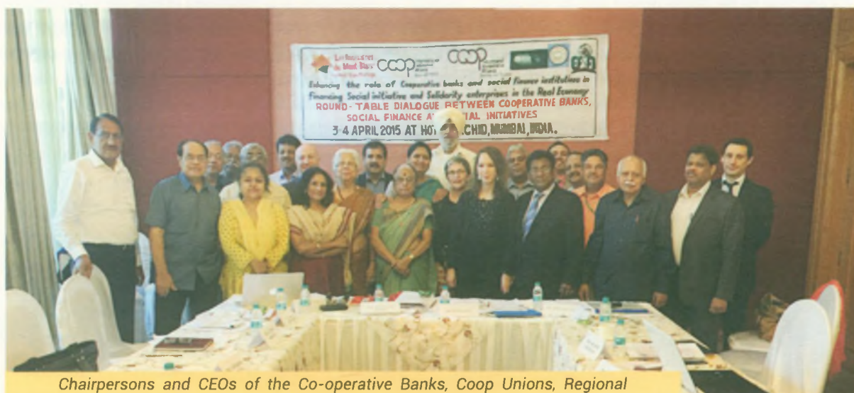
Chairpersons and CEOs of the Co-operative Banks, Coop Unions, Regional Director of ICA-AP and other participants at the round table

Mumbai, India was the venue for the two-day round table dialogue (RTD) held on the role of co-operative banks and social finance institutions in promoting and financing social initiatives and social and solidarity enterprises (SSEs). The RTD was organized under the aegis of the ICA-AP, National Federation of State Co-operative Banks, Eco Foundation for Sustainable Alternatives, the Mont-Blanc Meeting- International Forum of the Social and Solidarity Economy Entrepreneurs, the International Co-operative Banks Association and the International Association of Investors in the Social Economy. In attendance at the meeting were over 30 representatives from State and Urban Co-operative Banks, National Federation of Urban co-operative Banks, National Co-operative Agriculture & Rural Development Banks' Federation, National Bank for Agriculture and Rural Development, UNDP, National Co-operative Union of India, Anupamma Pariwar Group, SEWA, IFFCO Foundation, and subject matter experts.