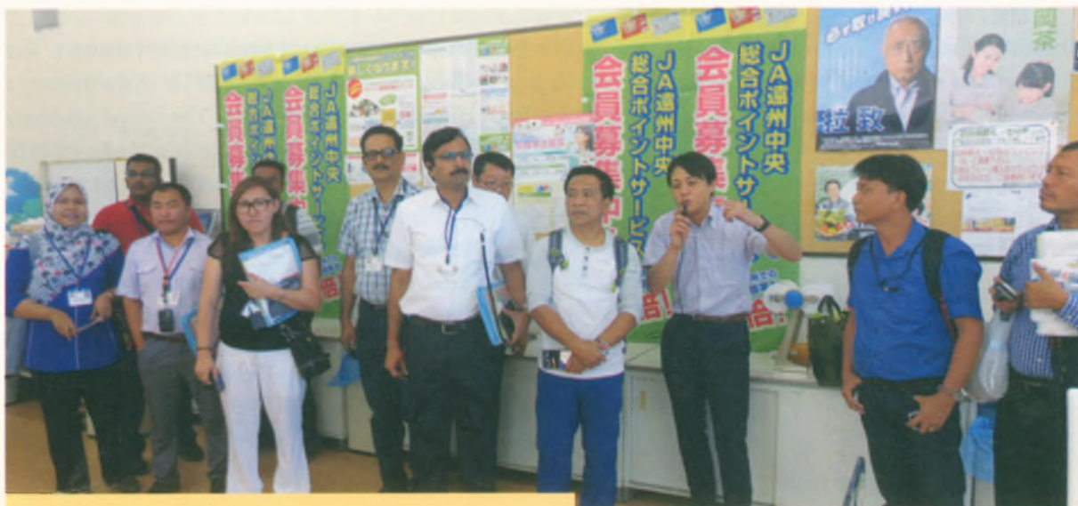
Trainees at an agricultural product shop in Japan

The 2 nd Training Course on Fostering Leaders to Reinforce Business Development of Agricultural Co-operatives was held in Japan in collaboration with IDACA, Japan from 15 July to 8 August. The objective of the training course was to review improvement of business for its reinforcement including credit business, farm guidance and economic businesses.