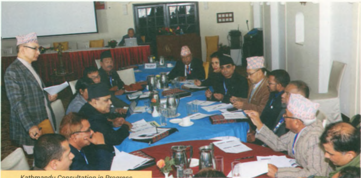
Kathmandu Consultation in Progress