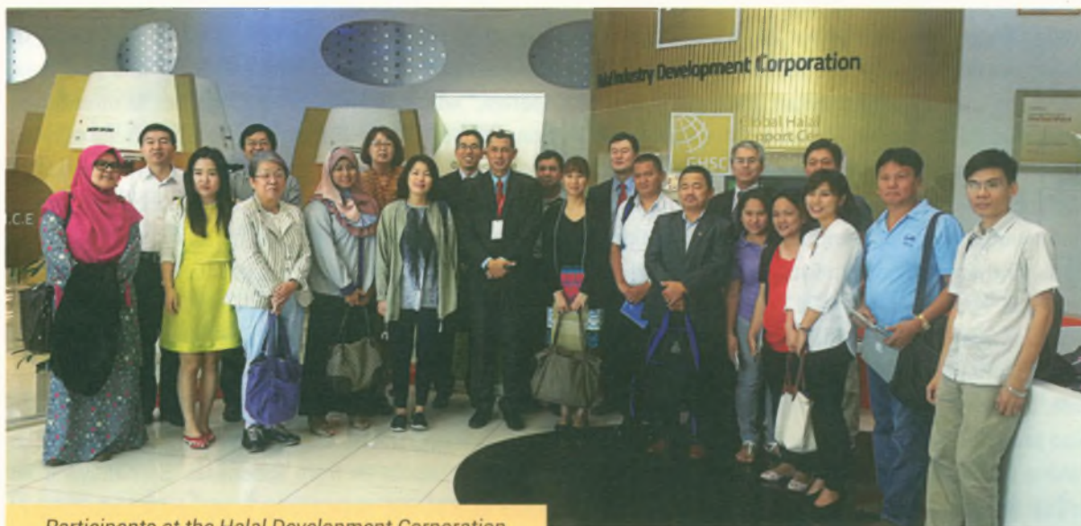
Participants at the Halal Development Corporation