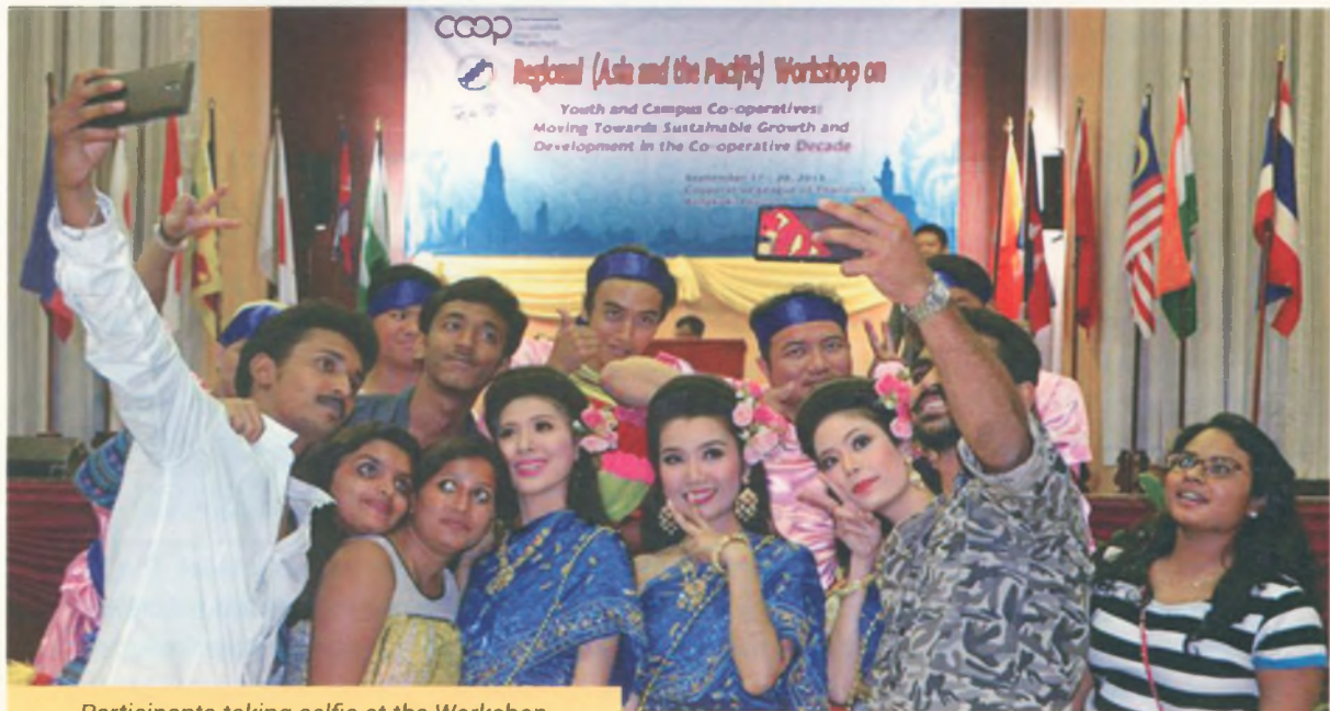
Participants taking selfie at the Workshop