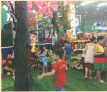
Member's room at co.opmart Tuy Hoa