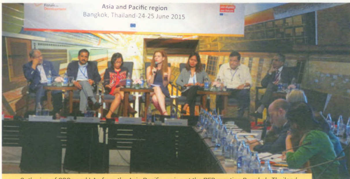
Gathering of CSOs and LAs from the Asia Pacific region at the PFD meeting Bangkok, Thailand.

The Policy Forum on Development (PFD) under the auspices of the European Commission (EC) brings together civil society organizations (CSOs), local authorities (LAs) and private sector representatives from different parts of the world to dialogue on global development issues and contributes to EU development policies and programs. The gathering of CSOs and LAs from the Asia Pacific region took place in Bangkok on June 24 and 25. The backdrop of the gathering was to provide space for collective planning among CSOs, LAs and private sector to influence the agenda in the Sustainable Development Goals (SDGs) negotiations; reinforce commitment to Asia Pacific's needs for Development Justice, and come up with policy recommendations on the how the EU can build and implement a just and transformative agenda for Asia Pacific.