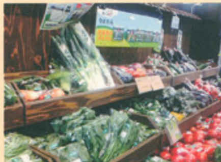
Megumino in Miyagi COOP

Promote Vietnamese Agricultural products: Similar to Sanchoku and Megumino in Japan, we provide an outlet to local farmers to showcase their products. We offer large shelves and clearly indicate the province from which the product is coming. We believe this offers the consumer quality and safe products and boosts the local economy.