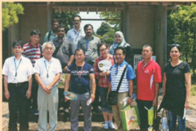
Participants at the field visit.

This training course was well designed and coordinated by ICA-AP and IDACA with good lecture topics and knowledgeable resource persons. The training programme was well balanced with classroom lectures and field visits to Japanese agricultural cooperatives facilities and farming activities. We were amazed to see the facility, technology and system adopted by JA to support the farmer members.