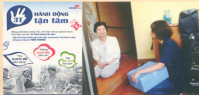
Co-op Mart's" Commitment of Dedicated actions "Dedicated delivery staffs at Miyagi COOP

The training provided us an opportunity to understand each other and to share ideas. We were welcomed wherever we went, by management and by our Japanese friends. Thank you!