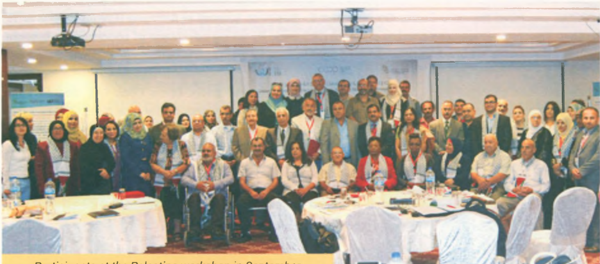
Participants at the Palestine workshop in September