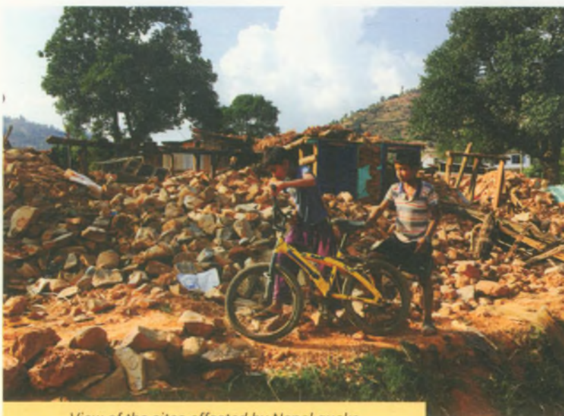
View of the sites affected by Nepal quake

The soft-loan of USD 70,000 was provided to 7 primary co-operatives/unions in dire need as well as to the co-operative based portal after the assessment. The grant of USD 30,000 was provided to 10 co-operatives to repair chilling vat, collection centres, processing centres, cold stores, service centres, co-operative building etc. The main objective of NACCFL is to support agricultural co-operative members in Dolakha, Sindhupal