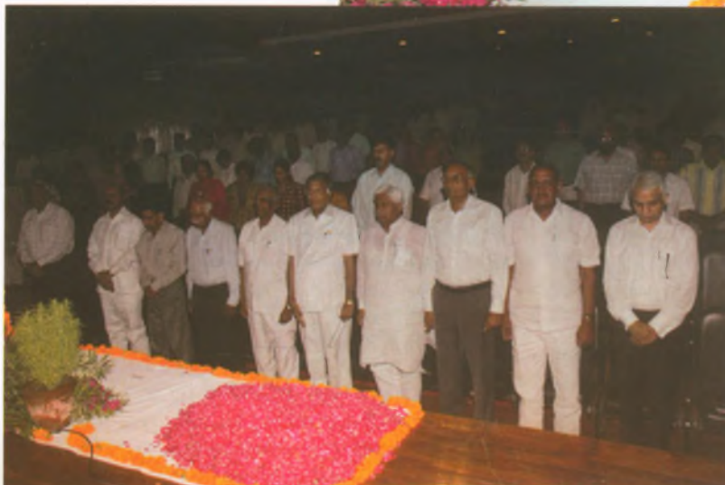
A view of the mourning silence observed by the leaders of Indian cooperative movement