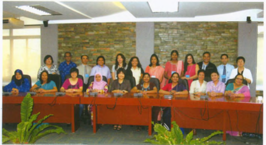
Participants of the Workshop in Manila, Philippines