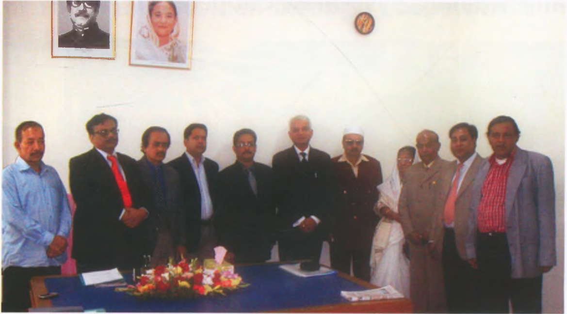
Members of the Board of Management of BJSU with the DRD, ICA-AP