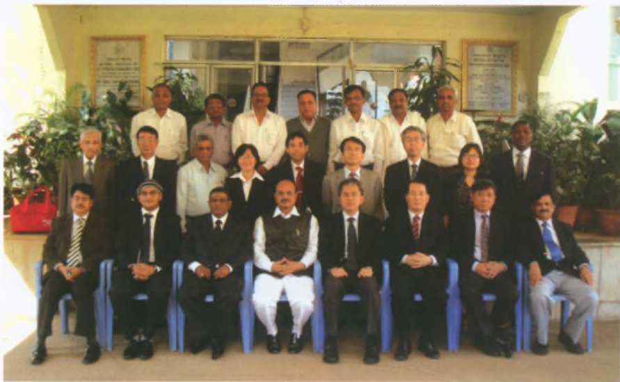
Group photo of the members of ICA-AP Consumer Committee and the delegates of the seminar

The 43rd meeting of ICA Committee on Consumer Cooperatives for Asia-Pacific was held on 9th December 2009 at Vaikunth Mehta National Institute of Cooperative Management (VAMNICOM), Pune, India. 28 participants from Japan, India, Korea, Myanmar, Singapore, Sri Lanka and Vietnam, attended the meeting. The meeting was hosted by the National Consumer Cooperative Federation of India (NCCF).