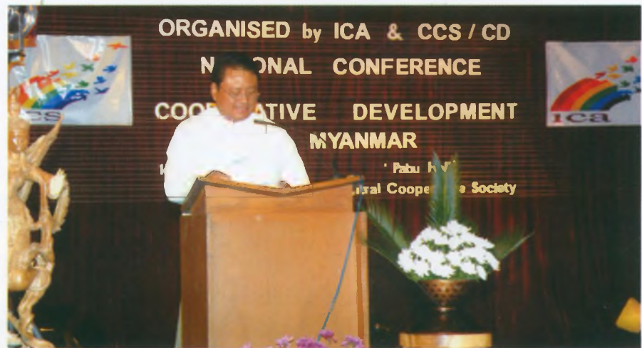
Chairman of CCS addressing the Conference on Coop. Development in Myanmar

1. There is a great need of an enabling policy environment on cooperatives in Myanmar. The Government should come out with a clear long term policy on cooperatives. The policy should focus on the relevance of cooperative ventures in the inclusive growth of economy for a sustainable economic development. 2. The cooperative law of Myanmar should be made simpler and more clear wherever required and be reviewed in the context of global economic recession. The regulatory features of the law may be made more pronounced and facilitative. The law on cooperatives must clearly mention the roles and responsibilities of various tiers of cooperatives together with effective gov-