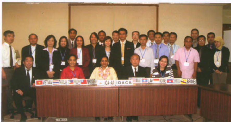
Group photo of the participants of the programme