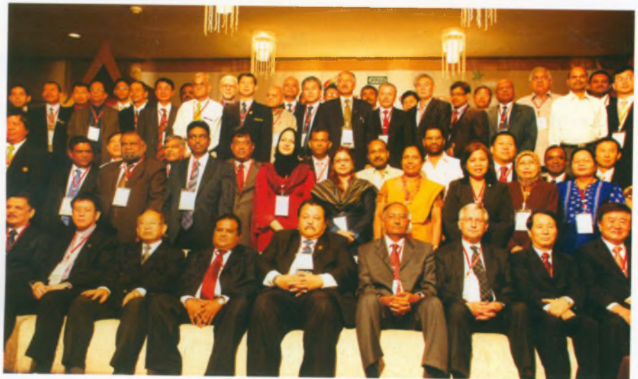
Group photo of the distinguished delegates at the Conference

Cooperatives were established to defend ordinary citizens economically against rising monopolies, to include them in the economy by achieving economies of scale, and to have some