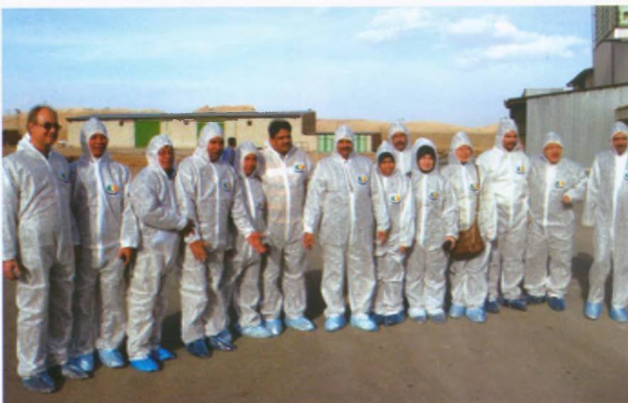
Participants of the training course at a poultry farm during study visit in Iran

Typeset & printed at Diamond Offset, HS-14, Kailash Colony Market, New Delhi-110048. Phone: +91-9811172786, +91-11-29232836 E-mail : amin_zaidi@yahoo.com