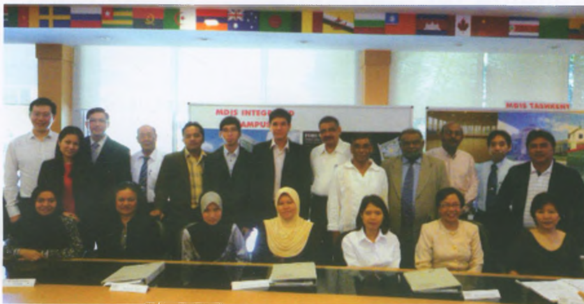
The participants of ICA-SNCF Business Seminar in Singapore

The 1st ICA-SNCF Business Seminar for Cooperative Leaders was held on 23-24 October 2009 in Singapore. The main objective of this seminar was to provide cooperative leaders, especially from ASEAN countries, with an insight of competitive cooperative business that will catapult their careers even on this global economic crisis and forge and foster camaraderie and integration with the different cooperatives within Asia and the Pacific region. Hosted by Singapore National Co-operative Federation (SNCF), 18 co-operative leaders from 8 countries (India, Indonesia, Malaysia, Myanmar, Philippines, Singapore, Sri Lanka and Vietnam) participated in the two-day seminar.