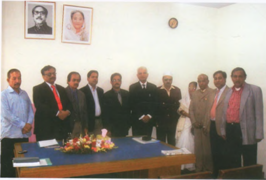
Members of the Board of Management of BJSU with the DRD, ICA-AP