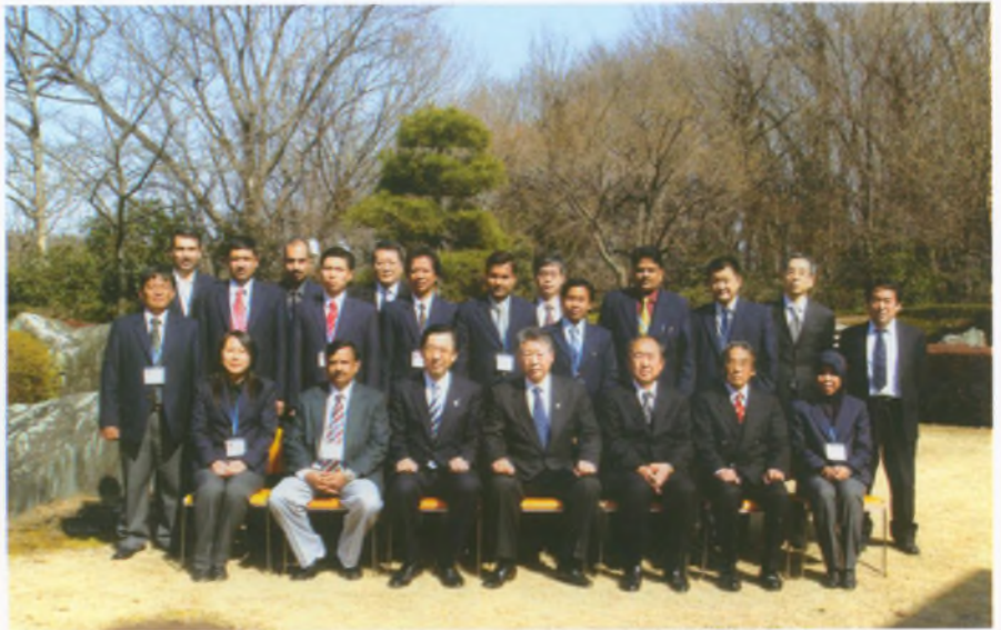
Participants of the 3rd Training Course at IDACA, Japan