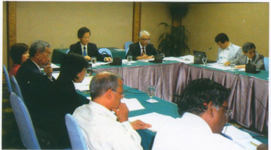
First meeting of the Office Bearers of ICA-AP University/Campus Coop Committee