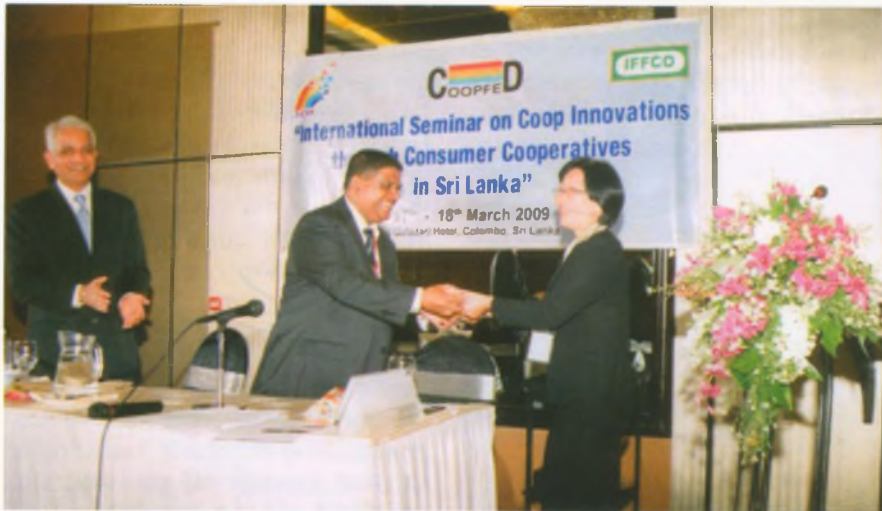
Participants being awarded at the Seminar