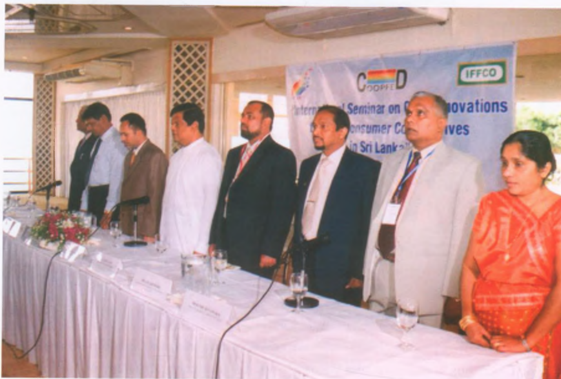
VIPs of the Cooperative Movement of Sri Lanka reciting the cooperative song of Sri Lanka at the inauguration of the Seminar

An "International Seminar on Coop Innovations through Consumer Cooperatives" was organized in Sri Lanka on 17th March 2009 at Hotel Galadari, Colombo. The Seminar was jointly organized by IFFCO, India and Coopfed, Sri Lanka. It was attended by the leaders and managers of co-operatives and senior officials from the Co-operative Ministry and Office of Commissioner of Co-operatives.