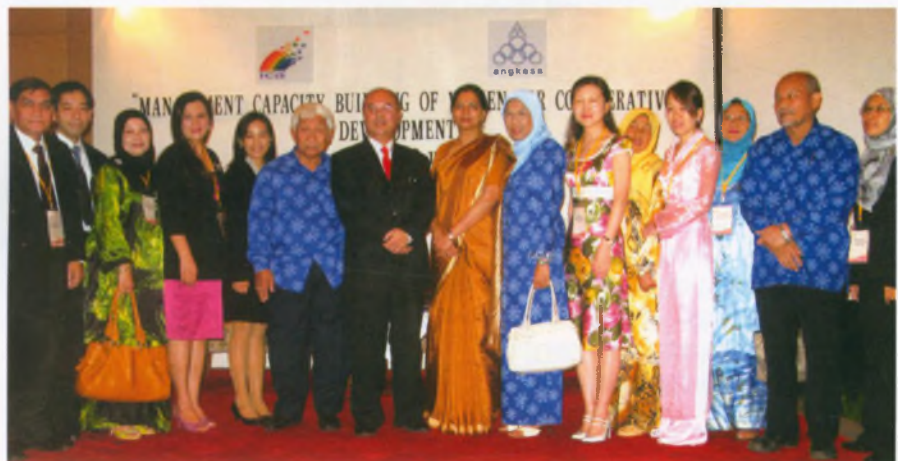
Participants and guests of the training program in Malaysia

This programme aimed at assisting the cooperative movement of Malaysia to review the status of gender integration and women’s