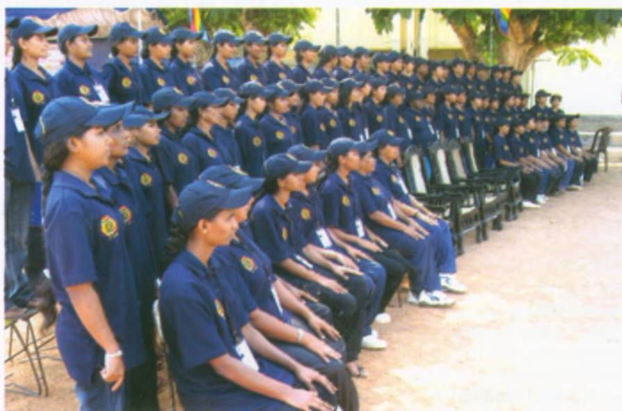
Participants of the Matara Women Group

Mental development, spiritual counselling, sports, recreation, nature, knowledge building, yoga, time management, conflict management, stress management, ethnic harmony, peace building, human rights, business planning, strategic development, project planning and project budgeting and institutional capacity development were a few of the subjects taken up in the camps. The participation in the camps was found to be very effective and empowering.