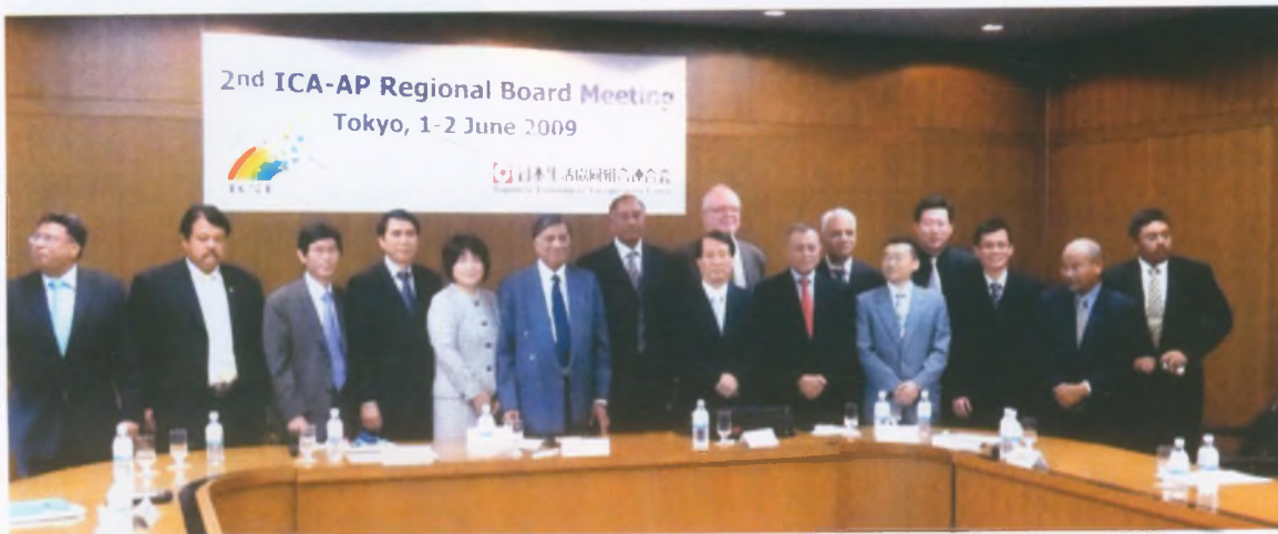
Group photo of the distinguished participants at the ICA AP Regional Board meeting in Tokyo, Japan