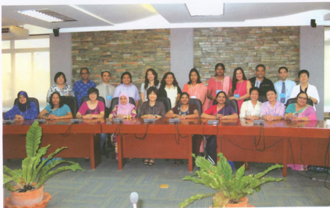
Participants of the Workshop in Manila, Philippines

The ICA-AP organized a workshop on “Enhancing the Role of Women in Co-operative Business” for women and men cooperative leaders of the region from 8-10 September 2009 in Manila, Philippines. The consultations during the workshop focused upon cooperative endeavor to promote women’s interests for gender mainstreaming in