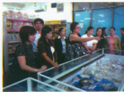
Participants at a Coop Consumer Store