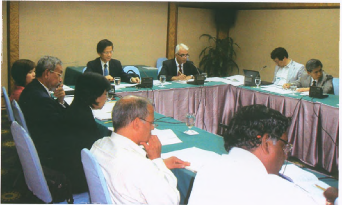
First meeting of the Office Bearers of ICA-AP University/Campus Coop Committee in Bangkok, Thailand

The 1st ICA Asia Pacific University/Campus Cooperative Committee meeting was held in Bangkok on 13th July 2009. Fifteen representatives from various countries who participated expressed their concept of developing university/campus coops in their respective countries.