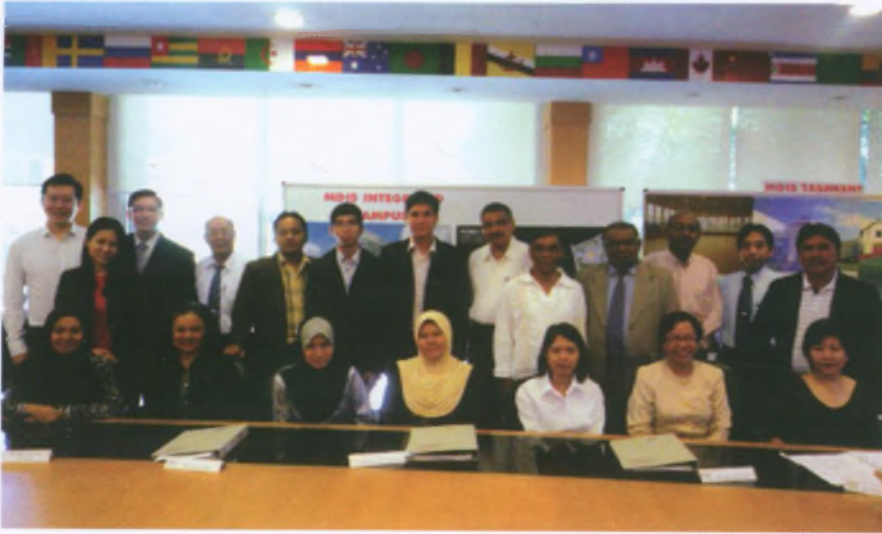
The participants of first ICA-SNCF Business Seminar in Singapore

The 1st ICA-SNCF Business Seminar for Cooperative Leaders was held on 23-24 October 2009 in Singapore. The main objective of this seminar was to provide cooperative leaders, especially from ASEAN countries, with an insight of competitive cooperative business that will catapult their careers even on this global economic crisis and forge and foster camaraderie and integration with the different cooperatives within Asia and the Pacific region. Hosted by Singapore National Co-operative Federation (SNCF), 18 co-operative leaders from 8 countries (India, Indonesia, Malaysia, Myanmar, Philippines, Singapore, Sri Lanka and Vietnam) participated in the two-day seminar.