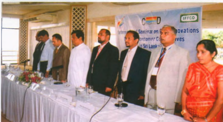
Distinguished delegates at the inauguration of the Seminar