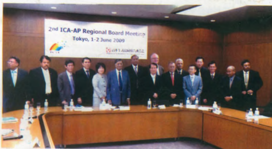
Group photo of the participants at ICA-AP Regional Board Meeting in Tokyo