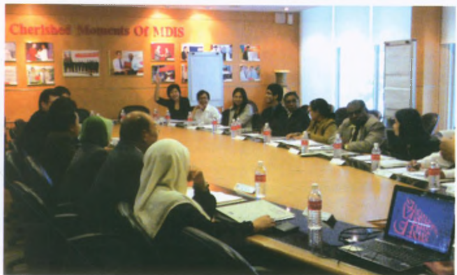
The ICA-SNCF Business Seminar in progress

As a result of the seminar, participants shared the necessity of business collaboration across the region and the ICA-AP was requested to fulfill its role in developing business collaboration among co-operatives.