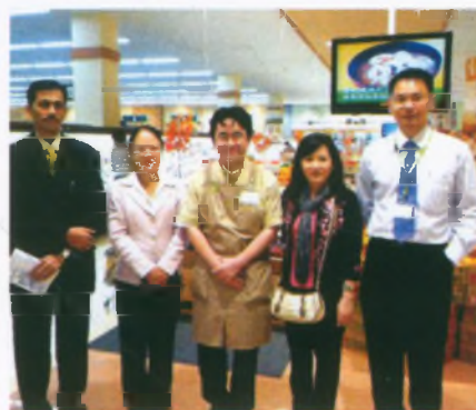
Managers of consumer co-ops at the Miyagi course 2009

India and Philippines learnt about history & basic values of Miyagi Co-op, present situation of Miyagi Co-op business and direction, planning & opening of co-op stores, sales promotion, merchandising strategy, purchasing policy and buyer education, home delivery business, member’s involvement in business.