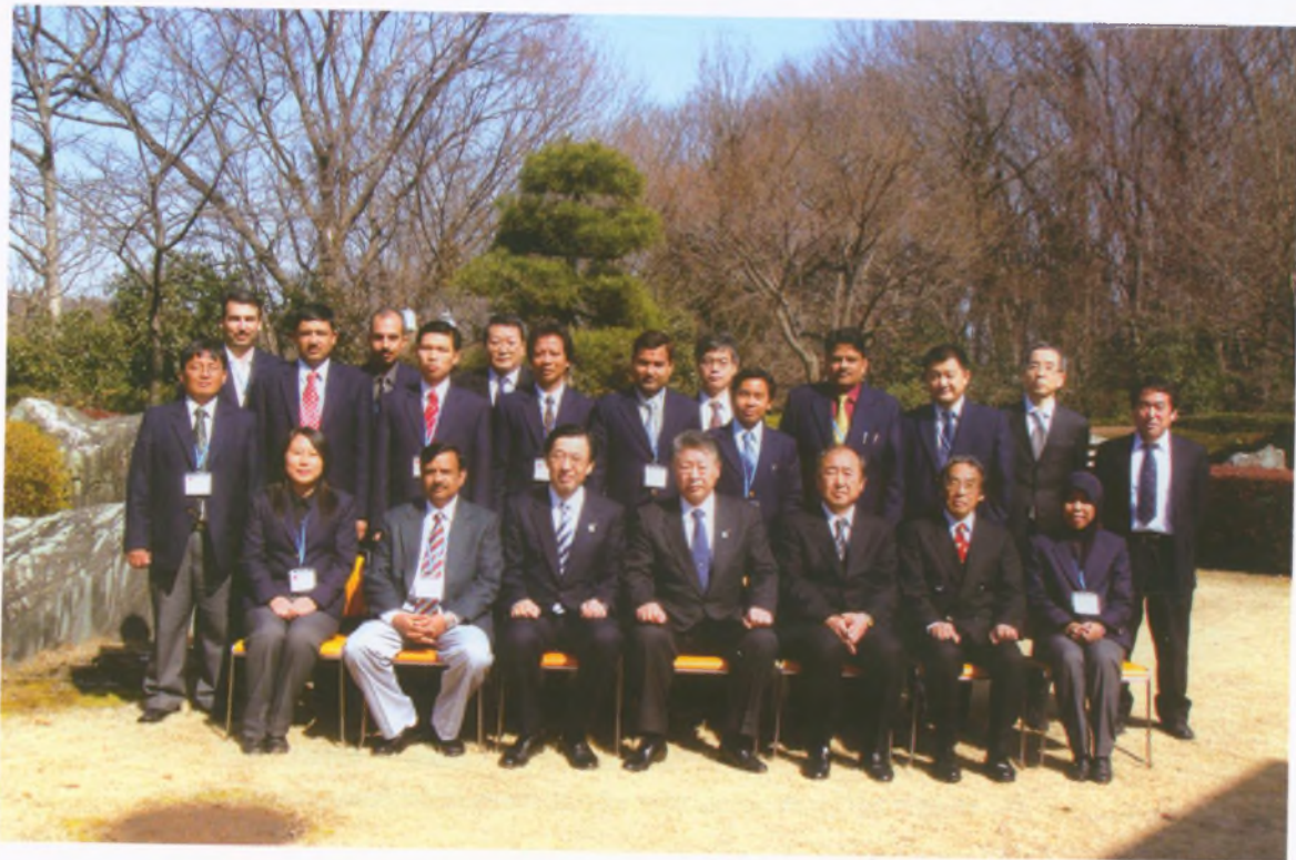
Participants of the Training course with the officials of IDACA and President JA-Zenchu

The 3rd Training course on “Enhancement of Farmers’ Income and Poverty Reduction through Cooperatives” was held from 07th December 2008 to 18th April 2009, with a focus on strengthening of farm guidance method, joint collection, marketing, safety and improvement of quality of farm products. The training programme was implemented by the ICA-AP in collaboration with IFFCO/FMDI, Gurgaon, Institute of Rural Management (IRMA), Anand (Gujarat), India, IDACA, Tokyo (Japan) and ICA’s member-organizations in India, Iran and Japan.