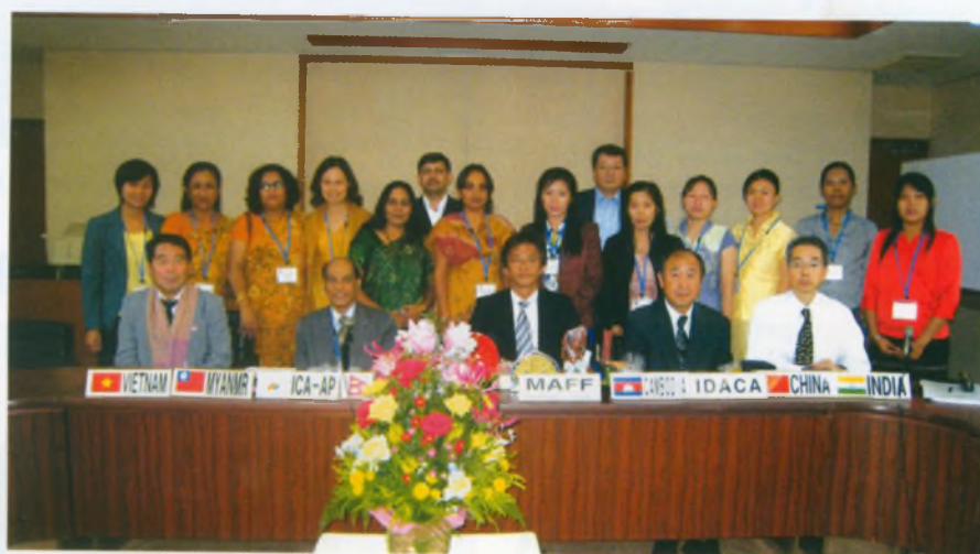
Group photo of the participants of the training course

Part-II of the program held at IDACA from 30th August to 25th September 2009 included extensive classroom work and study visits to agricultural cooperatives in Saitama and Aomori Prefectures of Japan. Lecture-cum-practical field study visits assignments