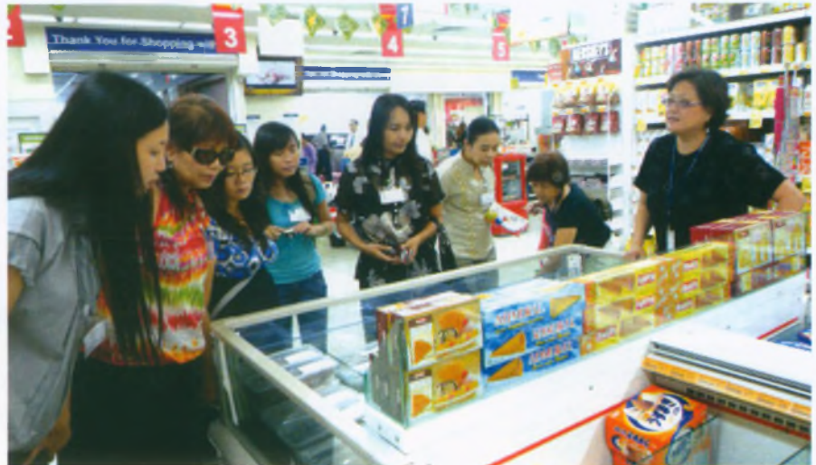
Participants of the Regional Workshop at a study visit