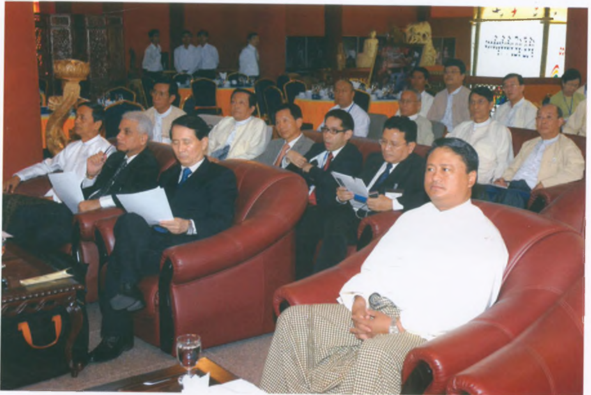
Technical session in progress - Chairman CCS, Myanmar seen with galaxy of Resource Persons for the Conference

The Conference on Cooperative Development in Myanmar was held on 16 & 17 June 2009 at Yangon. The Conference was organized by ICA Asia Pacific in collaboration with the Central Cooperative Society, Myanmar with the objective of "garnering policy support from the Government of Myanmar for promoting co-operatives as an alternative of significance".