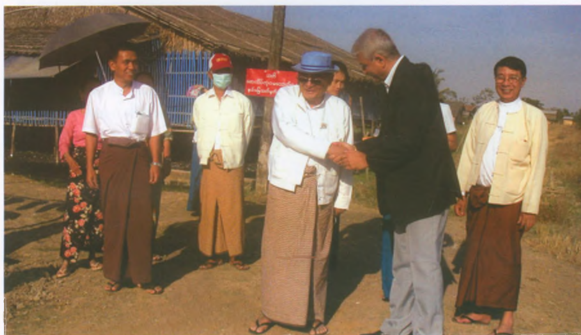
Chairman of the disaster affected Cooperative near Yangon, Myanmar welcoming DRD, ICA-AP at the reconstructed poultry shed

The disaster that struck Myanmar on 2 and 3 May 2008 in the form of cyclonic winds and rainfall killed 150,000 persons and displaced over 2 million populations. 395 co-operatives in southern and south-eastern Myanmar faced the wrath of the disaster. In all 259 members of these cooperatives died and 8544 were rendered homeless.