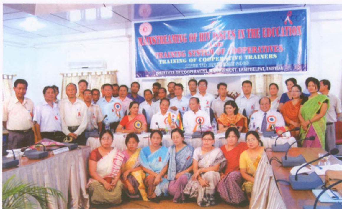
Participants of HIV/AIDS Awareness Workshop in Manipur, India

In 2004, ICA in collaboration with NCUI conducted a National workshop in India, for sensitization of the cooperative leaders, policy makers, directors and trainers on various aspects related to the spread of HIV/AIDS. In 2006-07, ICA AP with the support of DFID implemented a project in four states namely Uttar Pradesh, Bihar, Gujarat and Andhra Pradesh. ICA has also been implementing a project "Mainstreaming of HIV issues in the education and training system of cooperatives" in 11 States (Rajasthan, Chhattisgarh, Orissa, Karnataka, Maharashtra, Tamil Nadu, Manipur, Uttar Pradesh, Bihar, Gujarat and Andhra Pradesh) with focus on 7 states in the first phase initially and 4 states in the second phase and in totality it would reach out to 230 million people.