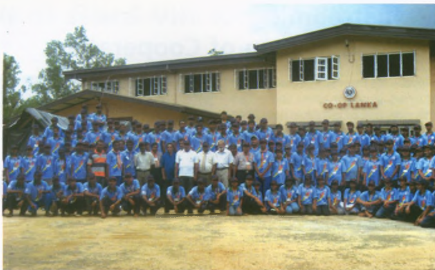
Participants at the Youth Camp in Sri Lanka

4. Base line survey: The survey was conducted successfully and critical information regarding the youth cooperative leadership was collected. The surveyors managed to collect data from the small groups as well as CBOs already engaged in MFI activities. The social mobilization participatory development approach, institutional