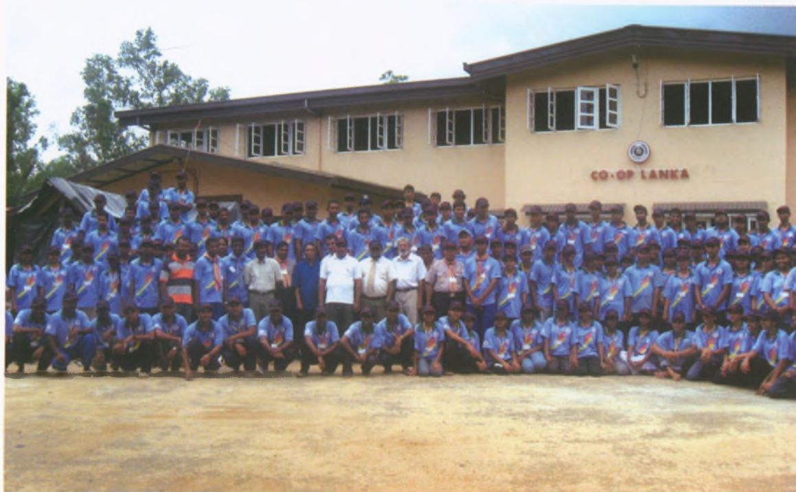
Group photo of the participants of the Youth Camp organised by the NCC, Sri Lanka

The National Co-operative Council of Sri Lanka implemented the project on Empowerment of Youth and Women through Cooperatives. The project was funded by IFFCO in the spirit of co-operation among co-operatives.