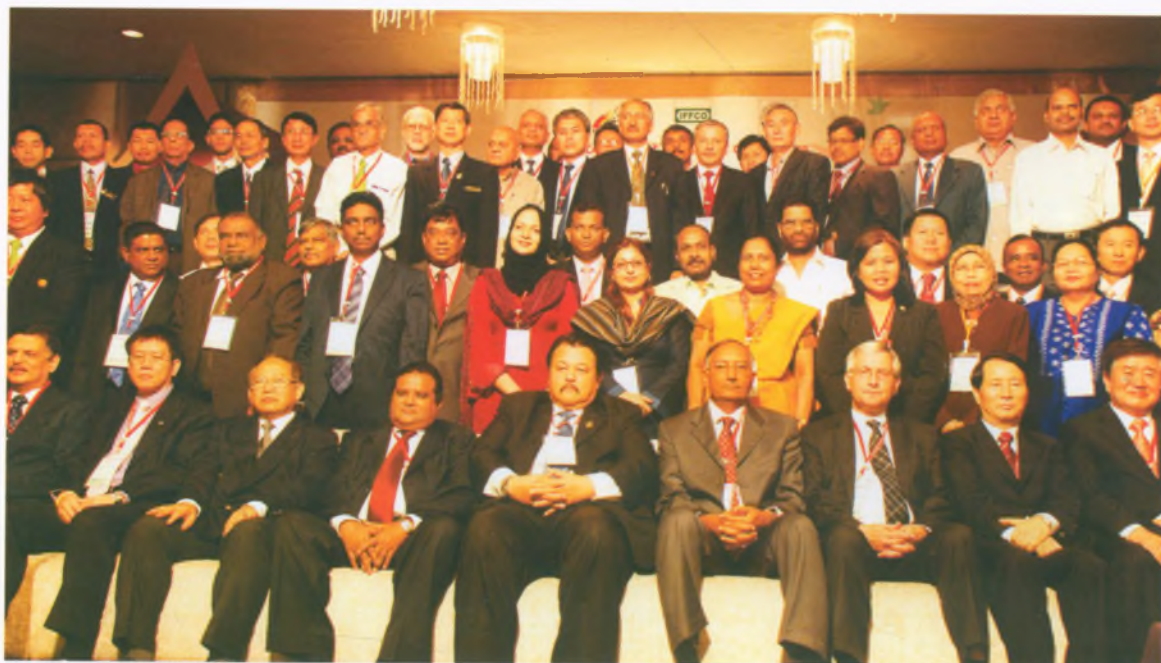
Group photo of the distinguished delegates at the Conference

The Conference on “Enhanced Role of Cooperatives in Recovery from the Economic Crisis” was organized by ICA Asia Pacific in collaboration with Cooperative League of Thailand and Indian Farmers Fertilizer Cooperative with the objective of creating a shared vision on the scope and role of cooperatives in the global economic crisis and devise a common strategy to reposition cooperatives as preferred form of enterprises.