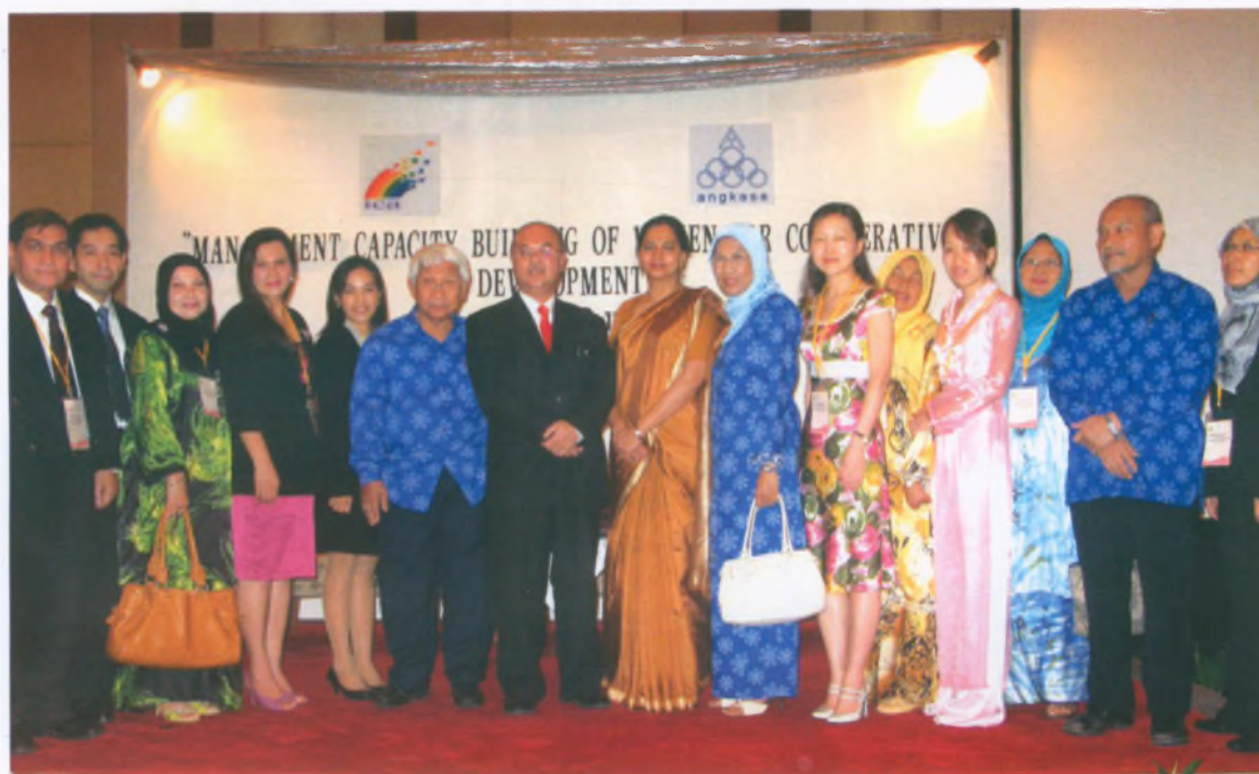
Participants and guests of the training program in Malaysia

Women development and gender mainstreaming in cooperatives is one of the priority areas of ICA. We are concerned about low and negligible participation of women at all levels of cooperatives in the region i.e. 30% at membership and 8% at leadership and decision-making. This is not a comfortable situation given the fact that 60-70% of farming and food production work is done by women.