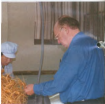
examines ginseng at a farm (above briefing.