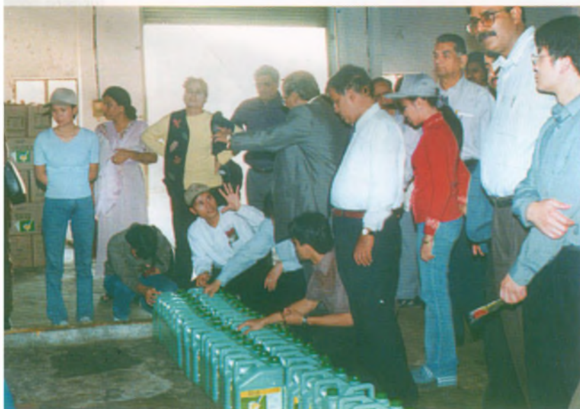
Participants visiting the Oilseed Producers Co-operative in Mehsana, Gujarat during the first phase of the programme

Part I of the Training Course held in India was preceded by the Home Country Assignments [HCAs]. The participants followed comprehensive field study visits from January 07 to February 28, 2001, in Malaysia, which was organised in close collaboration with the ICA Member-Organisations in Malaysia. The National Co-operative Organisation of Malaysia-ANGKASA, National Land Finance Co-operative Society Limited [NLFCSL], and the Co-operative College of Malaysia.