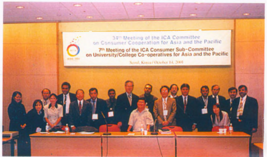
Members of the ICA Consumer Committee and the University Sub-Committee at a photo opportunity.

Vietnam Co-operative Alliance (VCA) offered to host the next meeting of the Committee and that of the University Sub-Committee on Consumer Co-