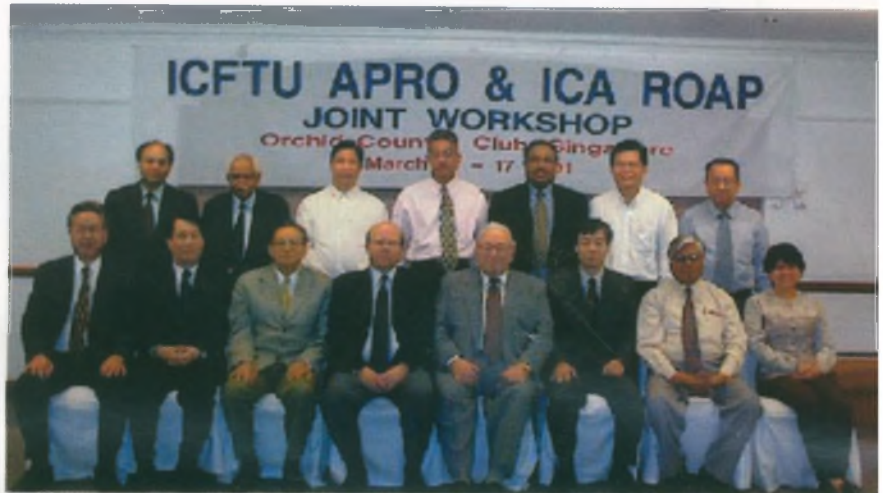
Participants of the workshop pose for a photo

The workshop agreed that the ILO revised Definition on Co-operatives should include co-operative values, autonomy, and sustainability in its contents so as to ensure its universal acceptance.