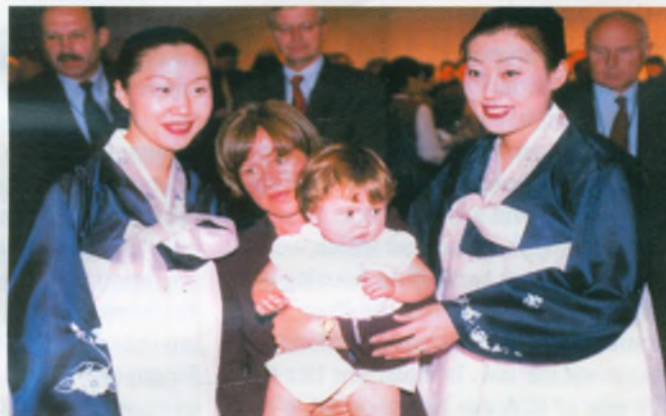
One of our youngest co-operators at last night's Welcome Reception for participants at the General Assembly.

CANAPRO in Colombia was formed in 1999 with 22,800 individual members and has since grown to 23,000. They solved the housing problems of 235 families associated with the urbanisation of Senderos de Casilla. They created a supermarket to serve members, built a training center for skill training programmes, and arranged post-graduate education