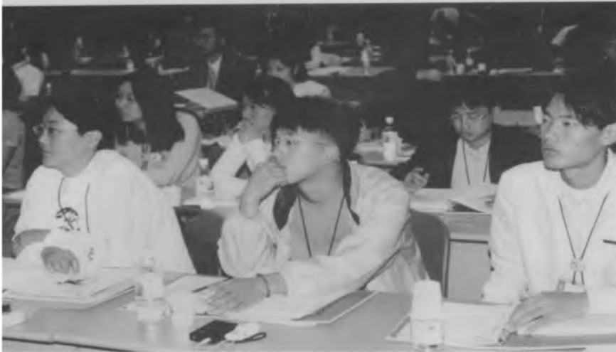
Delegates at the Youth Conference