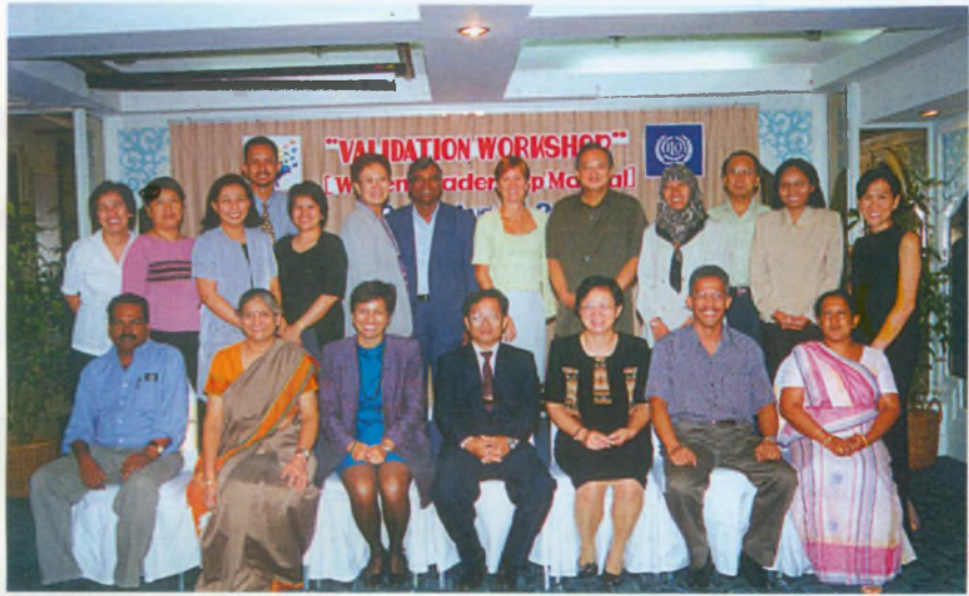
Participants at the Validation Workshop pose for a photograph

The final modified manual is expected to be ready by the end of the