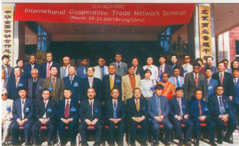
The Seminar participants