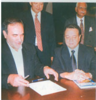
Minister Morteza Haji signs the Rio Declaration in the presence of Roberto Rigues, ICA President, Robby Tulus and B.D. Sharma looks on.

Important outcomes of these allied events were effectiveness of co-operatives as an instrument to promote dialogue among civilizations for world peace; need to examine the possibilities to set up co-operative common market; and creation of a steering Committee to promote women co-operatives in Iran. 59 participants from 12 countries and three international organizations attended Consultation.