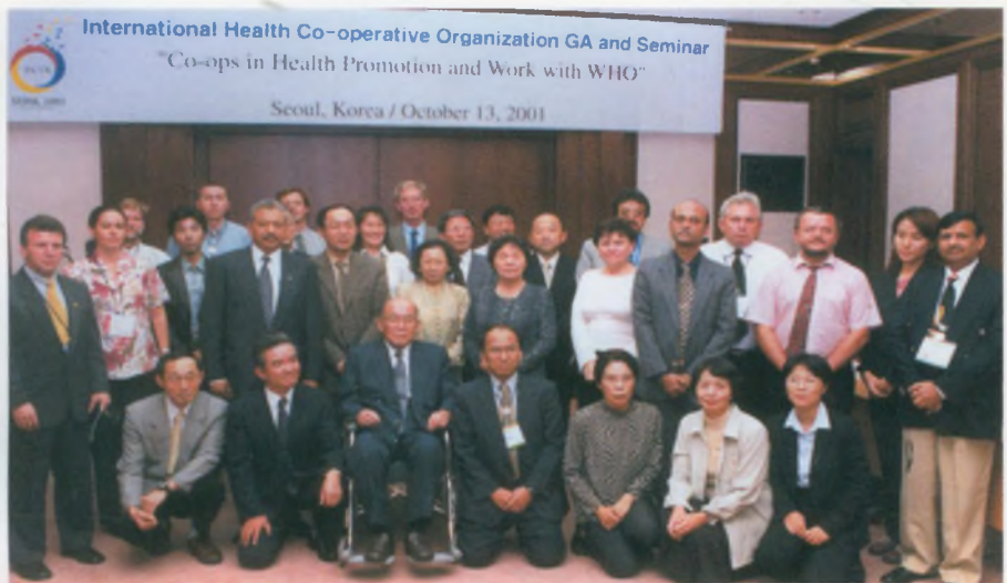
Members at two of the many meetings taking place this week

On the latter, TICA will encourage its membership all over the world to join BITS either as full/regular or associate members. BITS has been an advocate of the new paradigm of the tourist industry that promotes tourism image and activities not as an elitist phenomenon but as a more human, supporting, social and truly responsible activity.