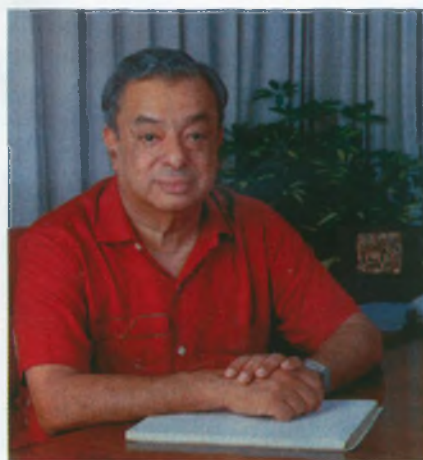
Dr. V. Kurien

Dr. Kurien has made an invaluable contribution to the dairy sector in India by helping to establish innovative and financially sustainable dairy co-operatives.