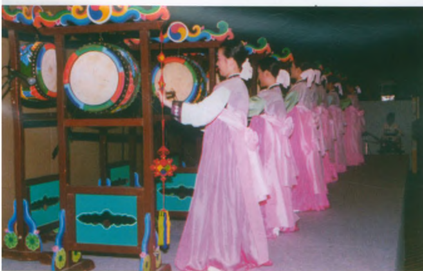
Inaugural Ceremony of the General Assembly