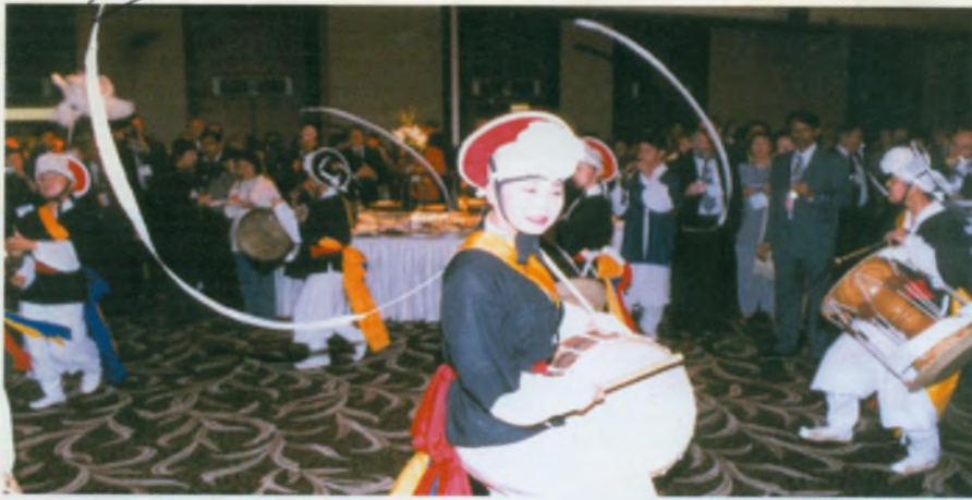
What a welcome! Guests enjoying the spectacular Welcome Reception last night for participants at the General Assembly