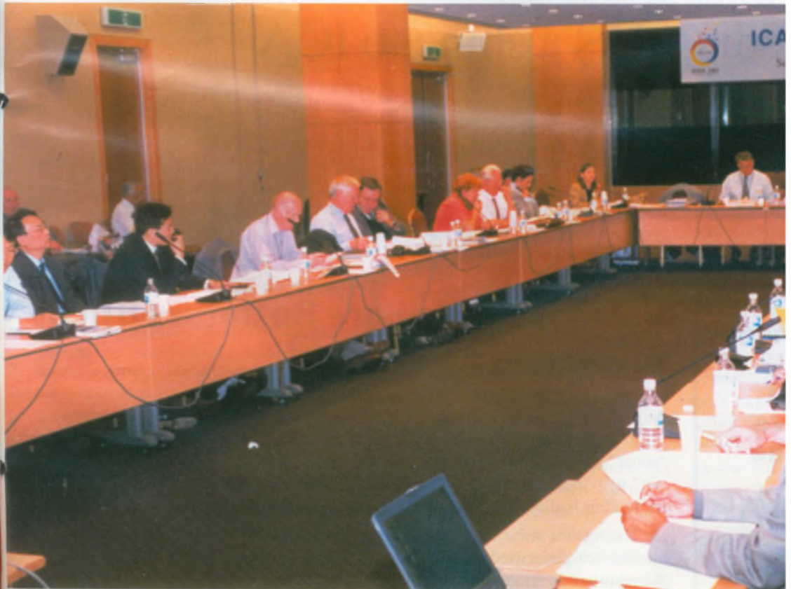
Members of the ICA Board meeting at the COEX Centre during the weekend