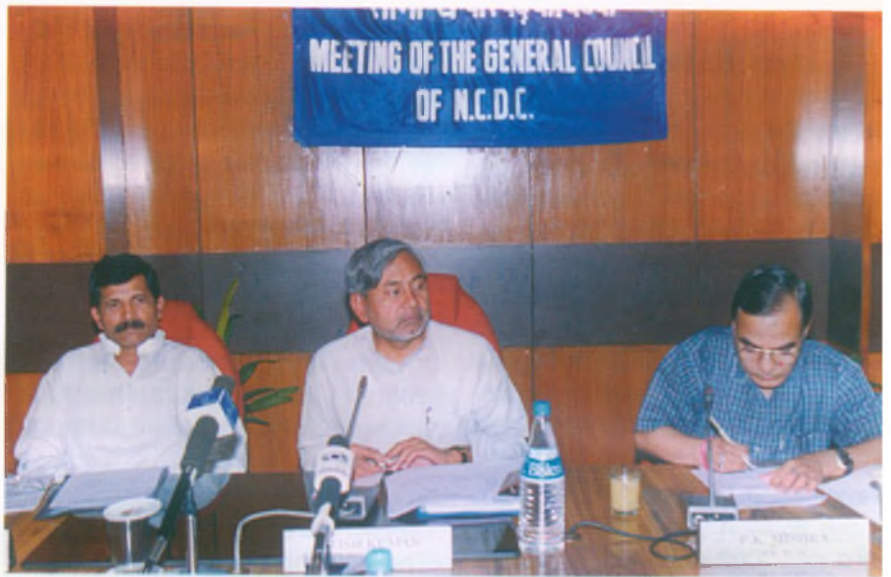
Mr. Nitish Kumar, Union Minister for Agriculture and Railways at the 52nd meeting of the Council. Mr. Shripad Y. Naik and Mr. P.K. Mishra are also seen in the picture.

NCDC has also requested the Ministry of Finance to allow it to avail of the facility of Rural Infrastructural Development Fund (RIDF), which will enable NCDC to lower its rate of interest for infrastructural projects. At