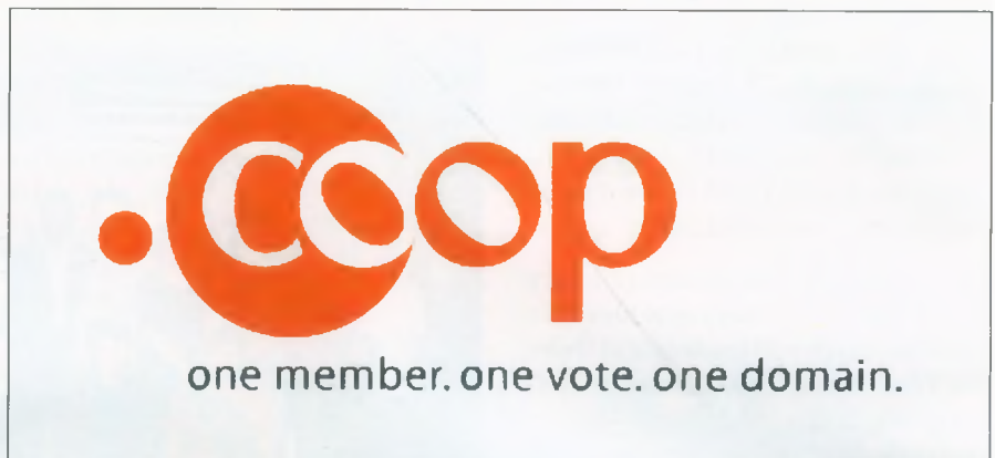
The new .coop logo

As of July 2001, ICA members have been pre-qualifying domain names