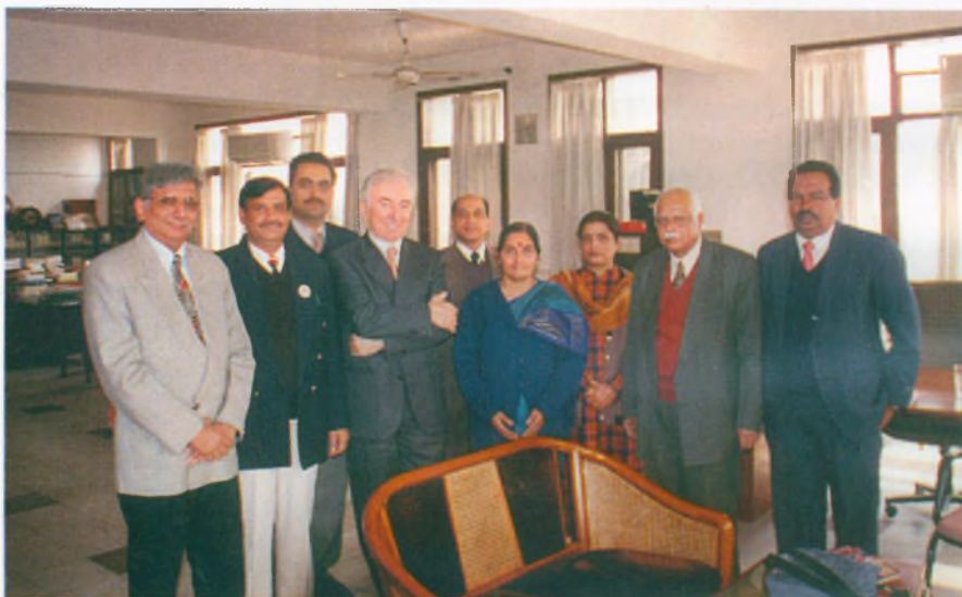
ICA President with the ICA ROAP staff

needs of membership in the context of globalisation. All ICA staff members should work towards the achievement of this visualization, both at the regional as well as the global levels. To make this happen, ICA has appointed a task force that is looking into various organizational, structural, financial and administrative pers-