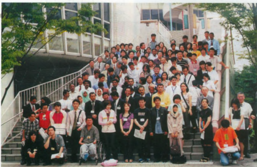
Asian youth in the forefront?

An evaluation on the last day, showed strong interest from young people to share and learn with other young people around the world. The participants unanimously agreed that the experiences they had gained from the two-days seminar will help them better contribute to their community work, and they requested that a web site be set-up to continue the dialogue. A set of recommendations will be submitted to the Asia-Pacific Standing Committee of the ICA to better implement youth integration in the region.