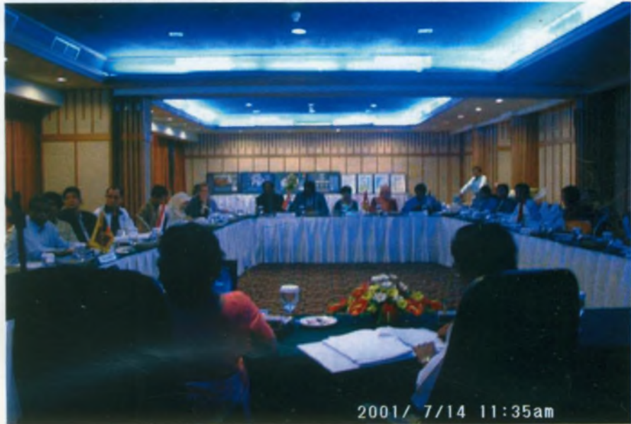
Member education workshop in progress

This year, the training programme is scheduled to be organized from 6-29 September, 2001.