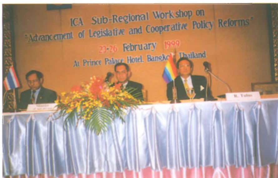
The Sub-regional Workshop in progress. Minister of Agriculture, Mr. Pangpol Adireksarn, seen in the middle.

Tel. : (65)358-2322 } effective Fax : (65)358-2292 } July '99.