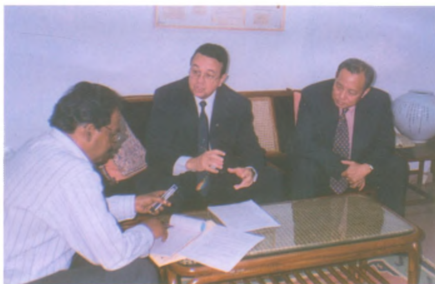
The ICA President being interviewed by the Editor.

A. It has been a fantastic example of co-operative solidarity. The fund which ICA set up in Geneva has attracted more than 140,000 Swiss francs in contributions - mostly from ICA members, but also from individual co-operators. Co-operatives in the United States and Canada have also made their own contributions. And our members have lobbied their governments - especially in Britain and the United States - in order to encourage them to make large scale contributions towards the rebuilding of the financial co-operatives in Kenya.