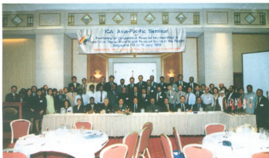
Participants of the Seminar pose for a photograph

credit and banking sector in selected countries of the region was presented, to undertake an objective analysis of trends in the sector during the post-crisis period.