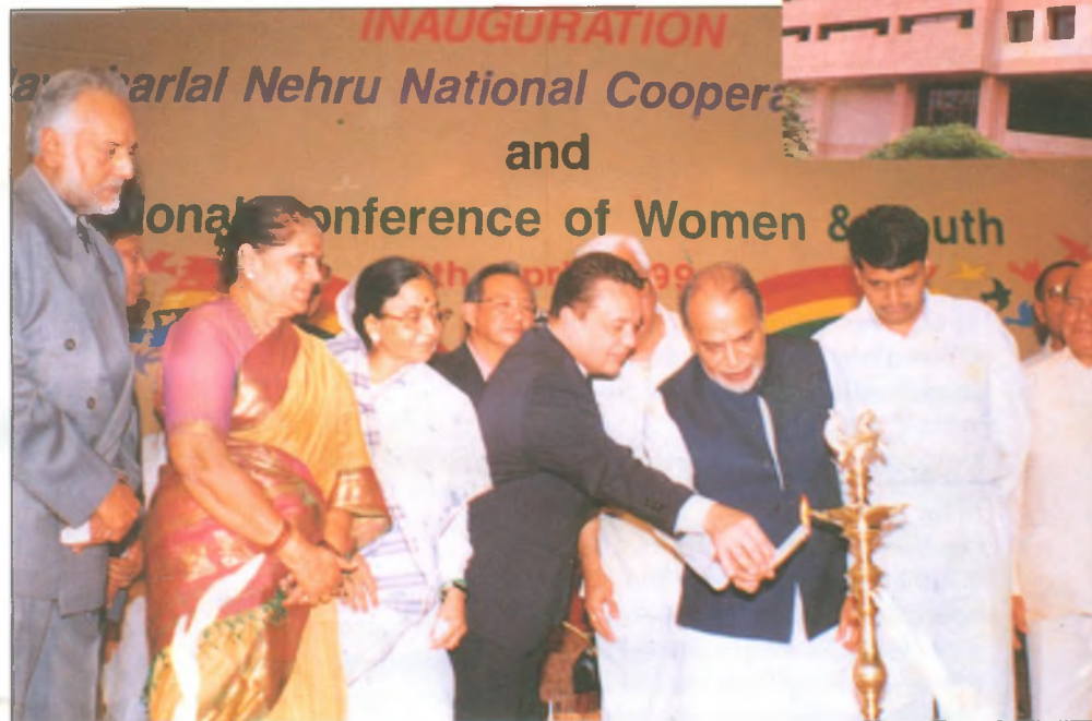
ICA President lighting the lamp in the presence of dignitaries