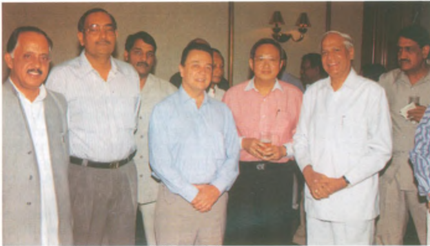
ICA President with a group of Indian co-operators at the welcome dinner organised in his honour by IFFCO, India.

Q. What are the results of your leadership initiative to have an organisational review of the board and membership?