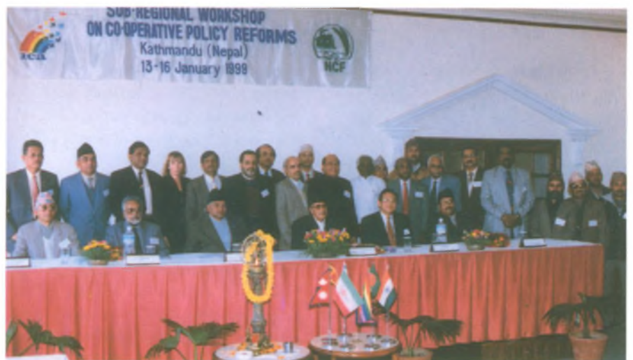
The delegates of the workshop pose for a photograph with the Prime Minister.

The workshop also felt that in order to build up competitiveness and to strengthen their identity, co-operatives must reform their governance and management systems and implement policies by eliciting greater involvement of members in economic participation and decision making process.