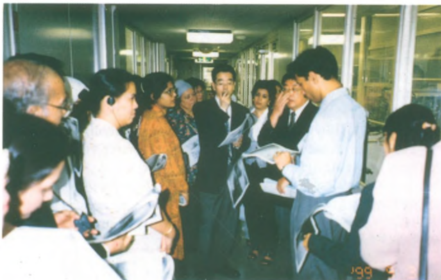
Conference delegates during their study visits in Iwate prefecture.

Some of the problems faced by rural women vis-à-vis their participation in co-operative activities identified by the conference were: widespread illiteracy among women in rural areas; multiple role of women and lack of time; inadequate nutrition, sanitation and safe drinking water; limited access to credit; stiff competition and marketing problems; lack of training and education opportunities; low representation of women in national co-operative bodies and in the process of decision-making; customs, traditions and superstitions; and lack of access to technology. The