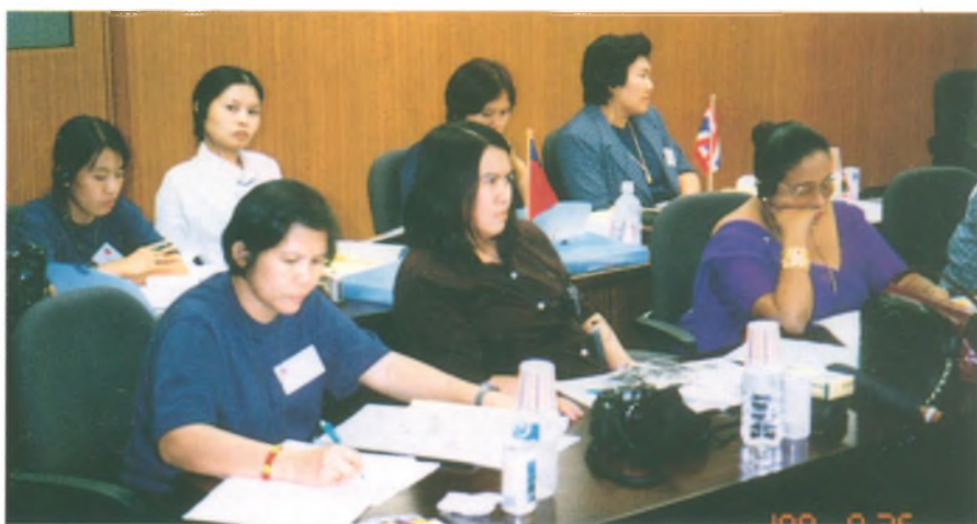
Participants of the 9th Training Course attending a teaching session

Besides classroom studies, the participants also visited Japanese primary agricultural co-operatives in Iwate prefecture and in and around Tokyo and observed the organisational structure and activities of Women's Associations.