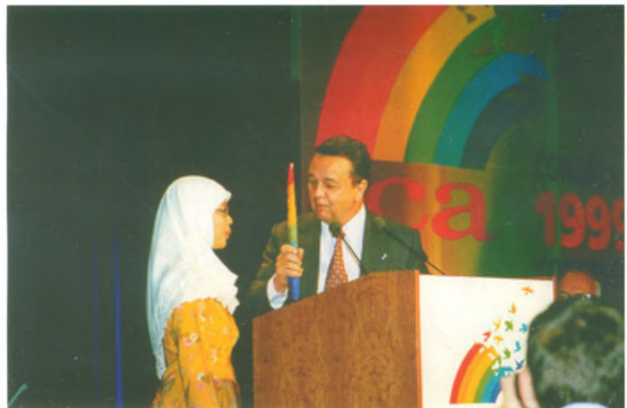
A youth delegate with the ICA President, Roberto Rodrigues

These activities and two sub-regional workshops held in Kathmandu and Bangkok during January and February, 1999 respectively were precursors to the Fifth Ministers' Conference.