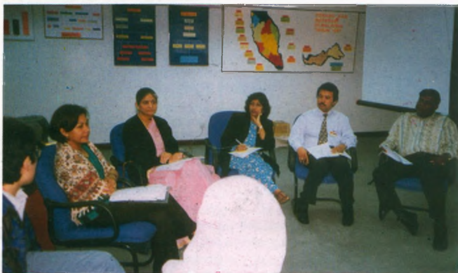
Participants at the workshop discussing on strategies for leadership training

A s a sequel to the 'Regional Conference on Women in Decision-Making in Co-ops' held in Philippines last year, the Gender Integration Project of the Regional Office launched a multi-pronged strategy to increase women's participation in co-operative leadership and decision-making by collaborating with the ILO Coopnet programme.