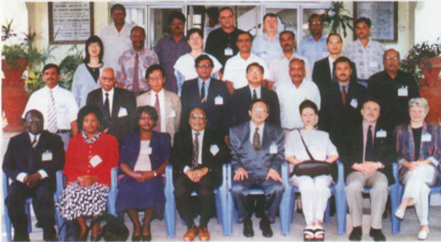
Participants at the seminar pose for a photograph

The ICA in collaboration with the National Co-operative Union of India held an International Seminar on "Value-based Professional Management in co-operatives" from 31 August to 11 September, 1998 in Pune, Western India.