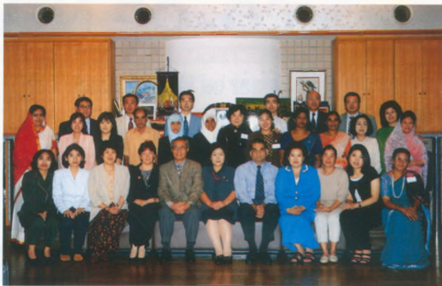
Asian women farm leaders pose for a photograph

The Conference was attended by 35 senior level women leaders representing 13 countries (i.e., Bangladesh, India, Indonesia, Japan, Korea, Laos,