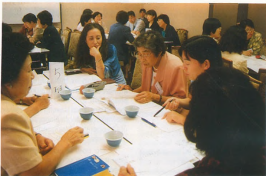
Group discussions in progress at the Forum

T hinking About Gender issues and Women's participation in Co-operatives was the theme of the Co-operative Women's Forum held in Tokyo during July 7-8, 1998.