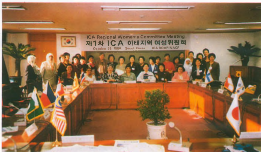
Members of the Committee pose for a photograph