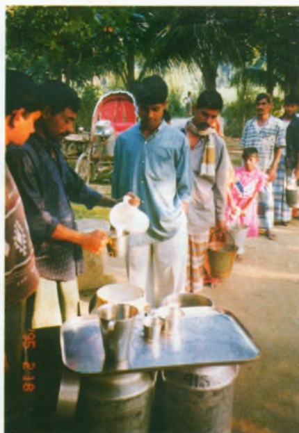
Milk collection at a MILKVITA Co-op

The success of MILKVITA is largely due to the development of milk-shed areas, incentives and development opportunities provided to the primary milk co-operatives, provision of extension and animal health-care services. Quick payments to dairy farmers, maintenance of a dairy development fund and free-supply of milk cans have also contributed to the success of MILKVITA. Besides