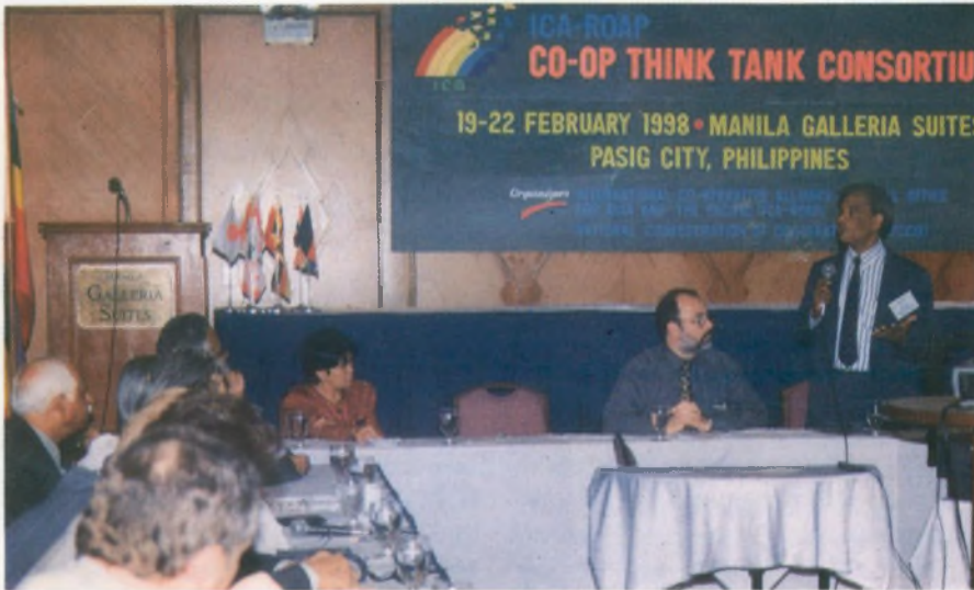
Co-op Think Tank Consortium in progress

Conceived in 1997 to provide a dialogue between the ICA regional members and the development partners on broad-based issues of common concern to the ICA ROAP, a Co-operative Think Tank Consortium was held in Manila from 18-23 February, 1998, co-sponsored by the National Confederation of Co-operatives (NATCCO), Philippines.