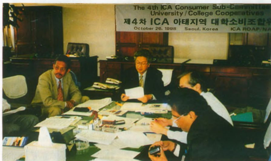
Some of the Sub-Committee members discussing future plans and programmes

Ten participants and 12 observers from 10 countries were present at the 4th meeting of the ICA Consumer Sub-committee on University Co-operatives, on October 25, 1998: Japan, Philippines, India, Singapore, Malaysia, Indonesia, Korea, Thailand, Bangladesh and Nepal. A new member, Forum