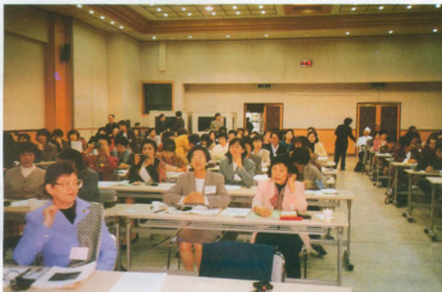
Some of the participants of the Global Forum

I would like to stress the need for each member organization to appoint a contact person in each of your organizations for ICA-ROAP and the Regional Women's