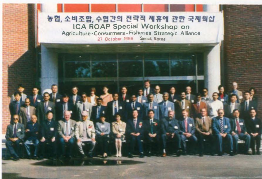
Participants of the Special workshop in front of the NACF Co-op College, Seoul

successful experiences in this region from the consumer sector, agricultural sector and fishery sector; and d) to promote ventures, international trade and technology transfer.