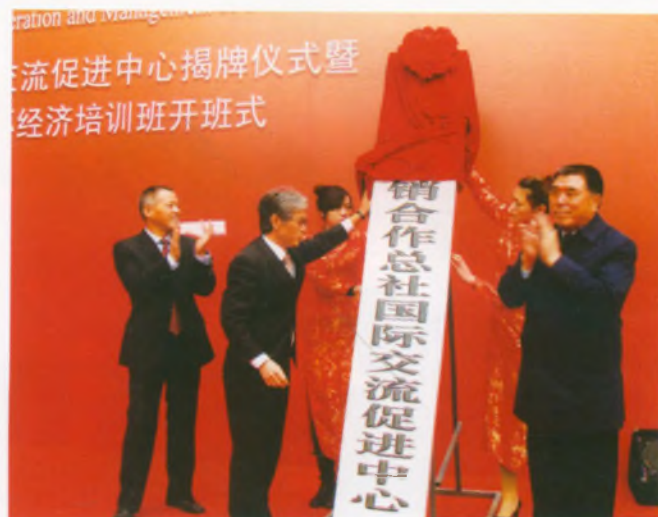
Inauguration of ICECC

An International Cooperative Exchange Center of China