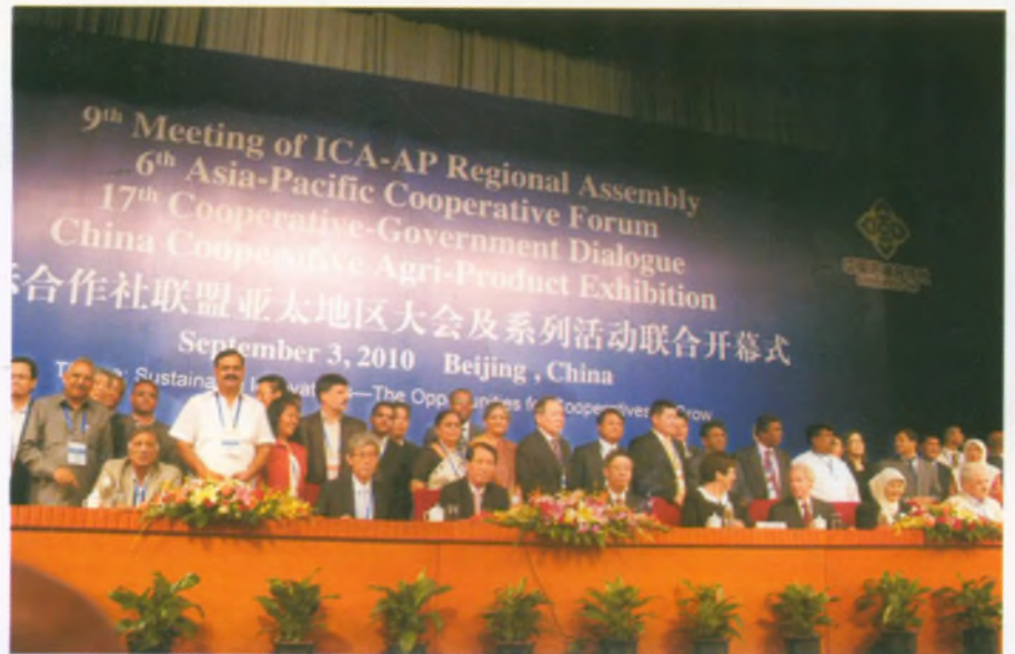
Group of delegates with ICA President and Director General

Regional Director of ICA-AP proposed a vote of thanks.