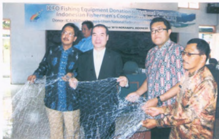
Members of ICFO and Indonesian Fishermen's Coops

The Co-op Connect Forum also organized a panel discussion on 'Cooperative Identity Through Brand Building' on 18th November 2010 on the occasion of 57th All India Co-operative Week celebrations.