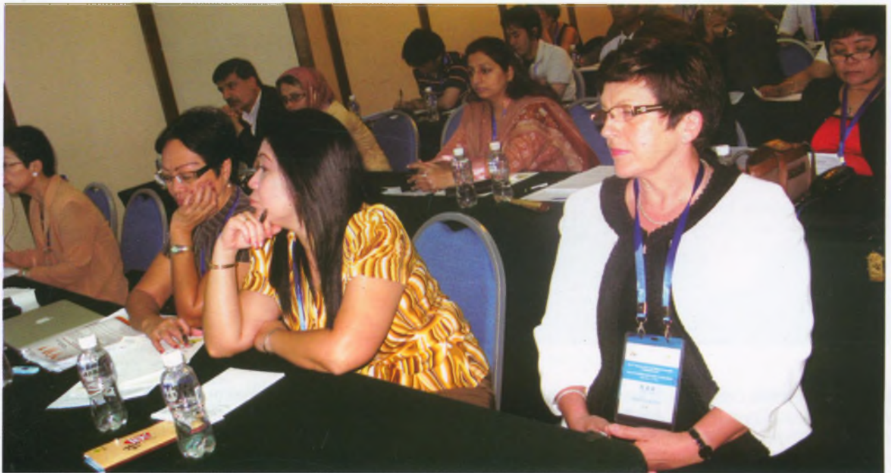
Dame Pauline Green, ICA President with the participants at the forum

The 6th Regional Women and Youth Forum was held at BICC in Beijing on 2nd September. The theme of the Forum was "Co-operatives: The Sector for Empowerment of Women and Youth". A total of 40 co-operators from ten countries attended the Forum.