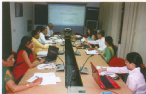
Training Session at progress