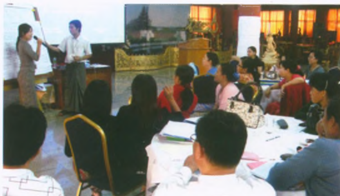
A Presentation by Participants