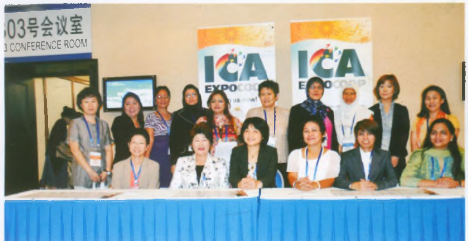
Participant at the RWC Meeting