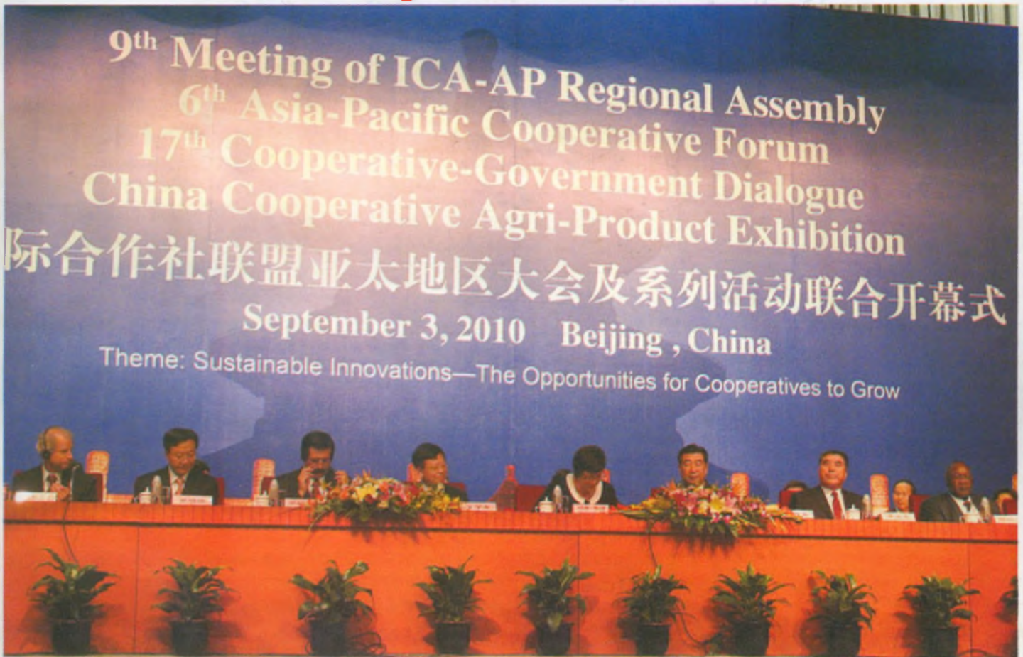
His Excellency Liangyu HUI, Vice Premier of Peoples Republic of China and Dame Pauline Green, ICA President at the joint opening