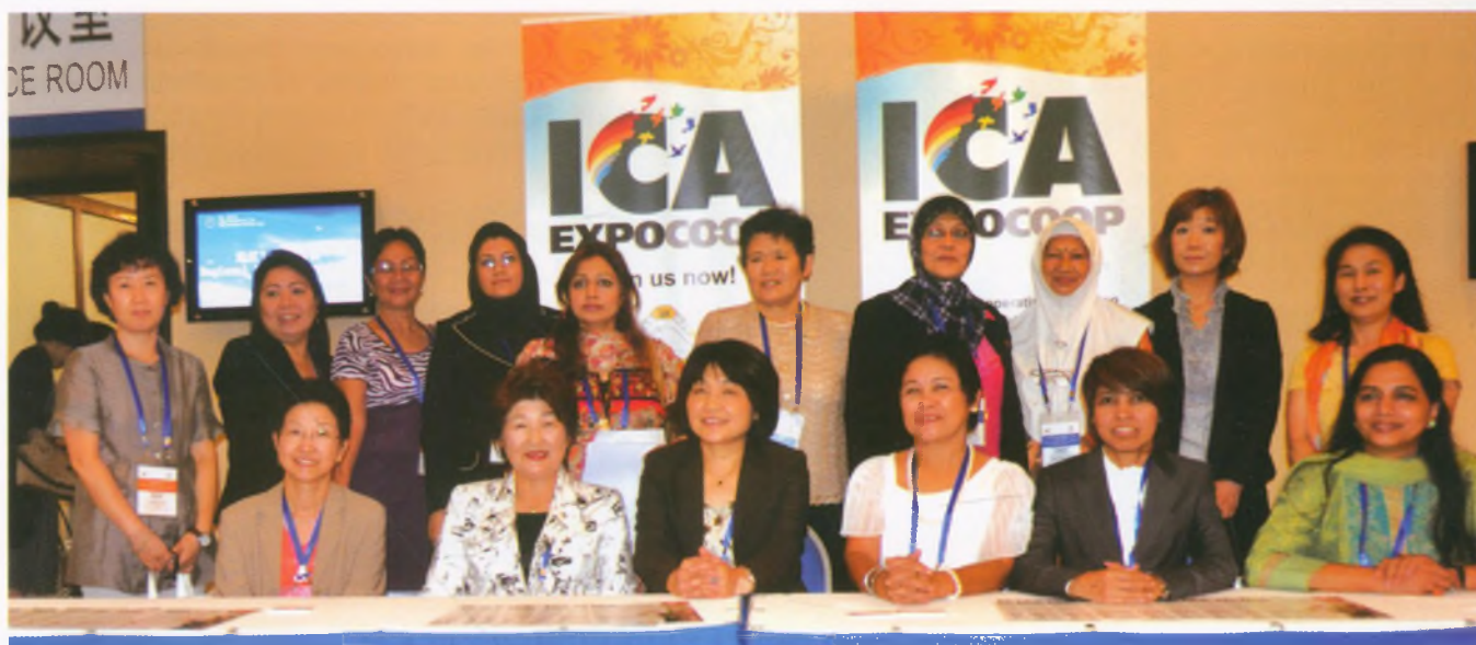
Participant at the RWC Meeting