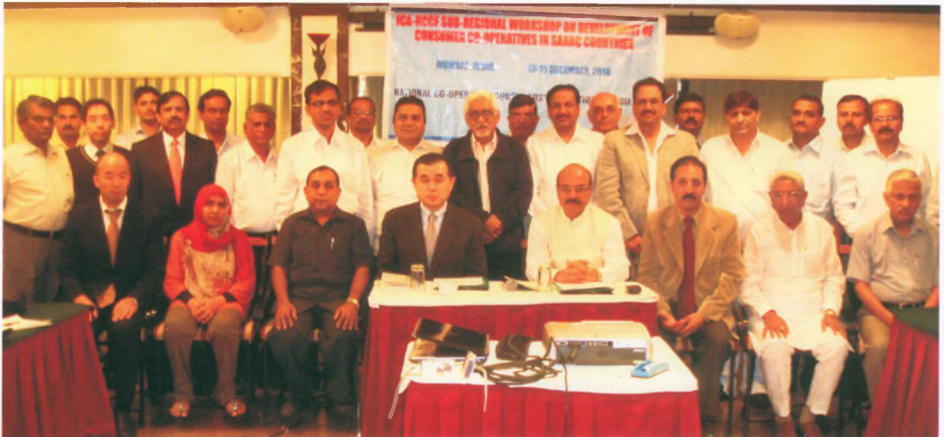
Participants and delegates with Chairman, NCCF