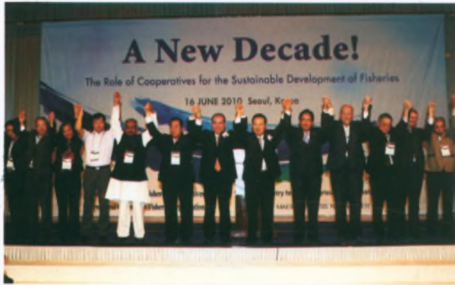
Participant at the Symposium

ICFO and NFFC jointly hosted an International Symposium on fisheries and fisheries co-operatives on 16 June, 2010.