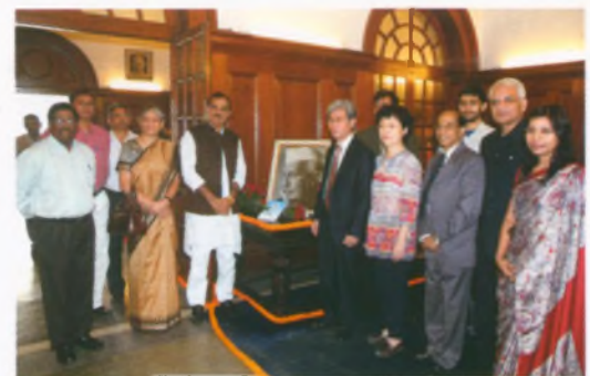
Homage to Pt. Jawahar Lal Nehru at Nehru Memorial

He also congratulated NCUI for setting a very timely theme for 57th Co-operative Week. Co-operatives certainly have an important role in mitigating the impact of climate change and can be instrumental in mobilizing the involvement of communities in reducing the global warming by adopting smart and demonstrative practices.