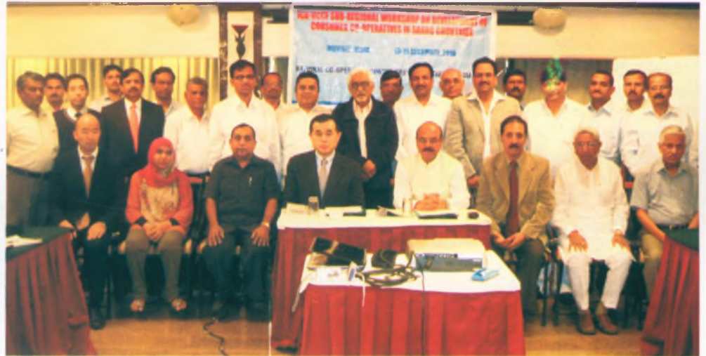
Participants and delegates with Chairman, NCCF