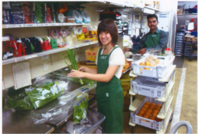
The Coop Store

The participants learnt about store operation, product policy, quality assurance, sales promotion, staff training, direct transaction with farmers (Sanchoke) and member's involvement in business of