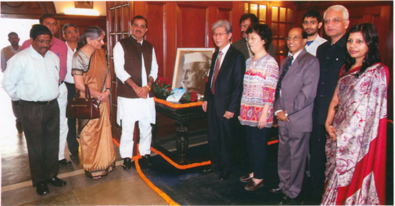
Homage to Pt. Jawahar Lal Nehru at Nehru Memorial

1960 in New Delhi. The National Co-operative Union of India played an important role in facilitating and supporting the establishment of the International Co-operative Alliance in the Asia region. The then Prime Minister of India Pandit Jawahar Lal Nehru had been a great supporter of the co-operative movement in India. The Indian co-operative movement celebrates a national co-operative week every year starting from 14th November, the birthday of Pandit Nehru.