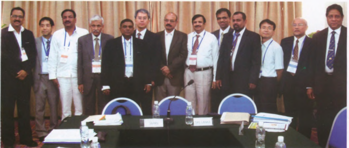
Participants at the meeting

The 44th meeting of ICA Committee on Consumer Cooperation was held at BICC in Beijing on 2nd September. 16 participants from five countries (India, Japan, Korea, Malaysia, and Sri Lanka) attended the meeting. In addition, eight observers from Sri Lanka also attended the meeting.