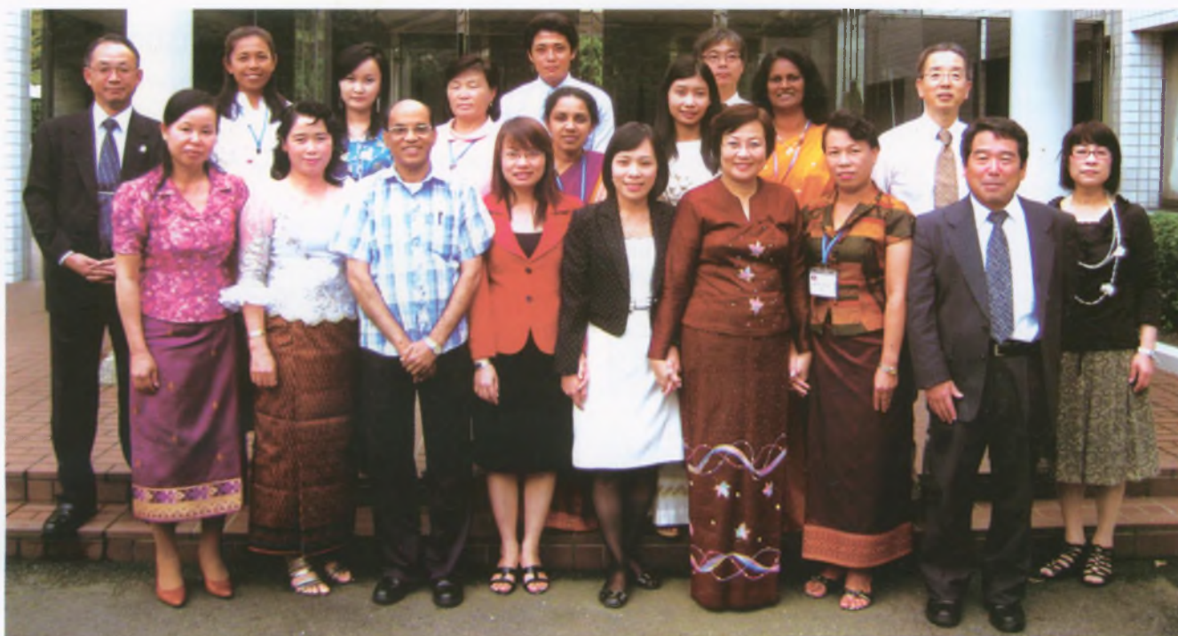
5th Training course-The Participants

classroom work and study visits to agricultural co-operatives in Kanagawa and Nara Prefectures of Japan. Lecture-cum-practical field study visits assignments were combined to impart necessary knowledge to the participants on the working of women's associations and the general activities of agricultural co-operatives in Japan. The part-II of the program - field study visits - was held in Vietnam from 8th to 16th October in collaboration with the Vietnam Co-operative Alliance [VCA], a member organization of ICA.