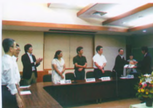
Award of certification to the participant

The 1st ICA-Japan Training Course for the fiscal year 2010 for Capacity Building for Marketing was held in Japan from 26th July to 19th August, 2010. 18 participants from 9 countries attended the training course.