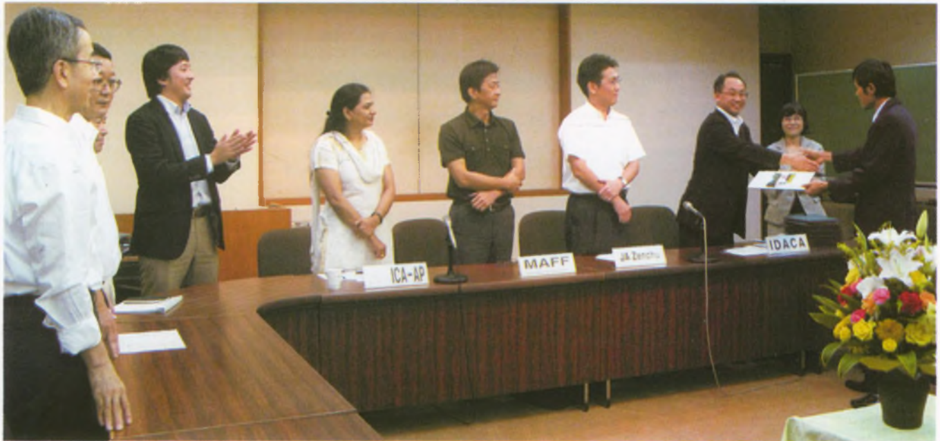
Award of certificates to the participants

products and methods of rural development. The objective of the project is to train human resources for organising farmers and strengthening marketing activities of co-operatives/farmer's organisations.