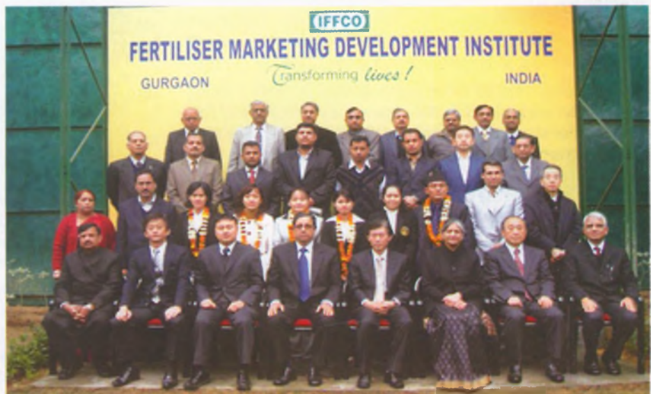
ICA-Japan Training Course participants

The 4th Training Course on Enhancement of Farmers' Income and Poverty Reduction through Co-operatives was held in India/Iran/Japan from 7th January to 17th April in collaboration with IFFCO in India, CURACI/ ICC in Iran and JA ZENCHU/ IDACA in Japan. Twelve participants from ten countries are attending the Training Course. The focus of the Course is on strengthening of farm guidance method, joint collection, shipment, safety and improvement in quality of farm products aimed at increasing farmers' income as a new development for the training course.