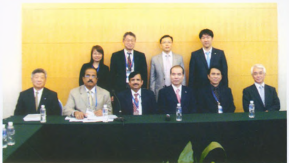
The Participants of the Meeting

After a brief discussion on the subject, among members, it was decided to postpone the revival of ICA Committee on Fisheries for Asia and the Pacific for the time being because members want to concentrate on the strengthening of International Cooperative Fisheries Organization (ICFO) first and they don't have enough funds to support both ICFO and ICA Committee on Fisheries for Asia and the Pacific at the same time.