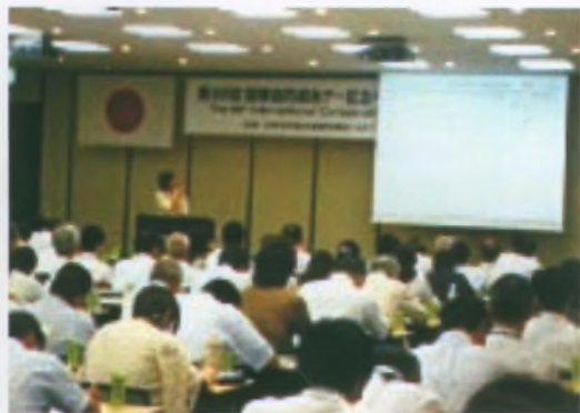
Participant at the celebration

This year the 88th commemoration was uniquely held on July 6, 2010 in Tokyo, Japan.