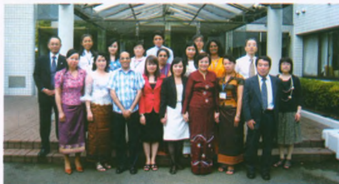
5th Training course-The Participants