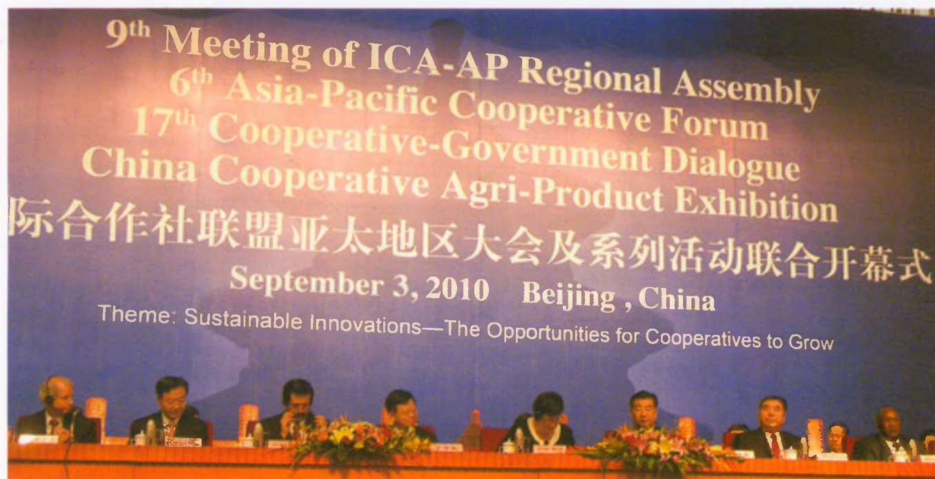
His Excellency Liangyu HUI, Vice Premier of Peoples Republic of China and Dame Pauline Green, ICA President at the joint opening

The 9th Meeting of the ICA-AP Regional Assembly was held at BICC, Beijing (China) on 5th September. 283 participants from 22 countries attended the Regional Assembly.