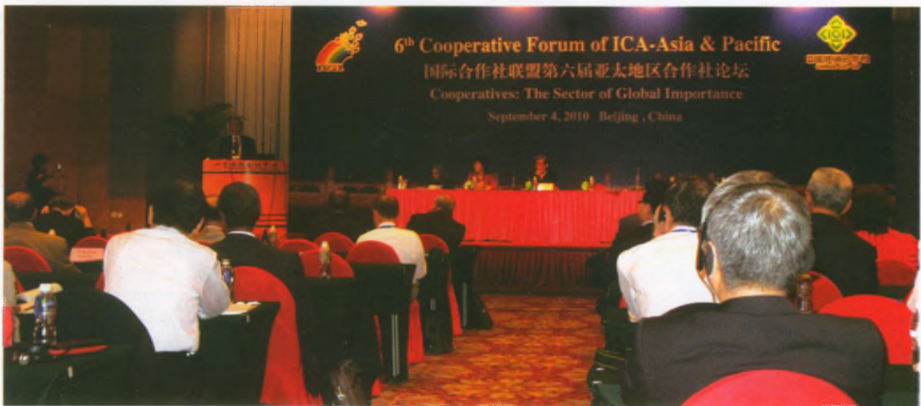
Co-op Forum in progress

The 6th Asia-Pacific Coop Forum was held along with the ICA-AP Regional Assembly on 4th September at BICC in Beijing. The Theme of the Coop Forum was :