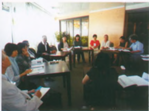
Participant at the programme

Regional Director of the ICA-AP, made a special speech on