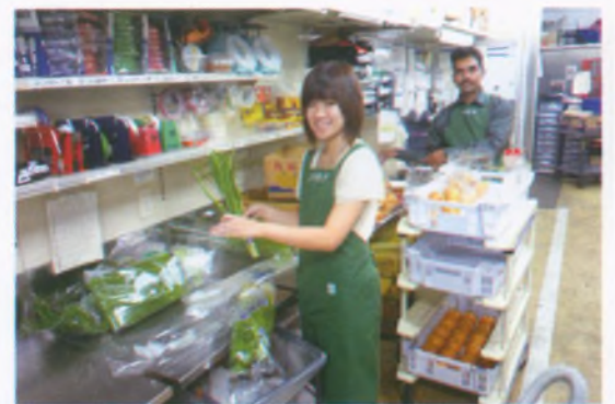
The Coop Store

They drew up plans to fight competition, to increase membership and sales, to improve the ways of sales promotion, to develop reliable and safe goods, and so on.