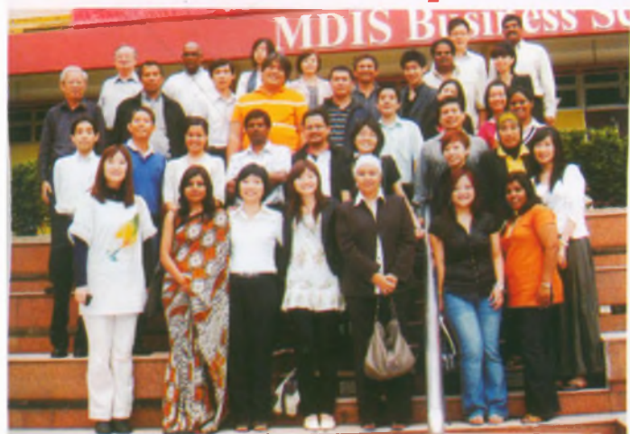
Cooperative Leaders at the Business Seminar

The 2nd ICA-SNCF Business Seminar for Co-operative Leaders was held on 20-22 October 2010 in Singapore. The main objective of this year’s seminar was to offer co-operative leaders, especially from ASEAN countries, a depth of understanding what Social Media is really all about and how it is changing the way we do business and offer fresh insight how to use Social Media to promote their products and services without having to spend too much time on it. Hosted by Singapore National Co-operative Federation (SNCF), 34 co-operative leaders from 6 countries (India, Indonesia, Malaysia, Philippines, Singapore and Vietnam) actively participated in the three-day seminar.