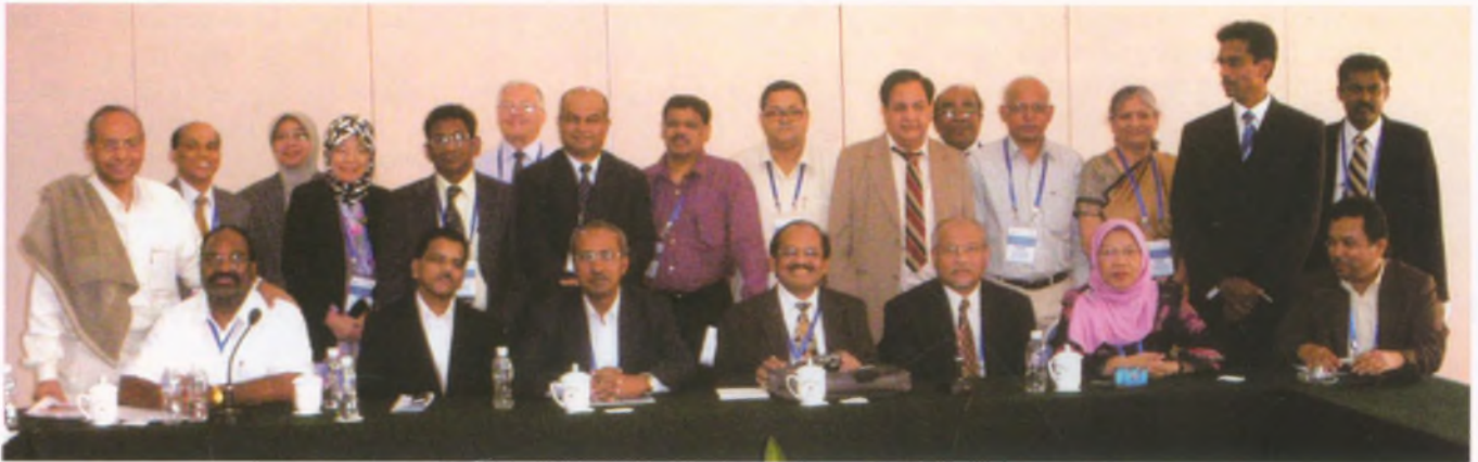
Participants of the HRD Committee Meeting