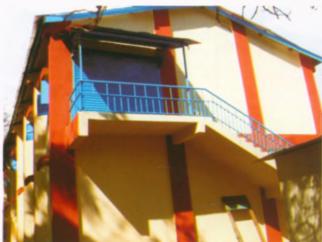
Post cyclone physical reconstruction of co-operative in Myanmar

wrath of the disaster. In all 259 members of these Co-operatives died and 8544 were rendered homeless. The ICA, in response to its call to global Co-operative fraternity, received a generous support from its following member Co-operatives for the revival of most affected and marginalized Co-operatives in Myanmar: