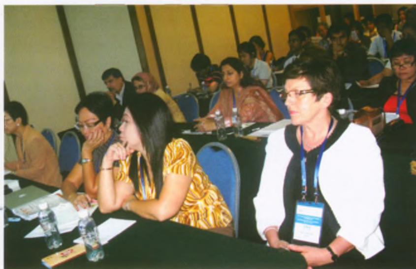
Dame Paulin Green, ICA President with the participants at the forum

The 6th International Co-operative Alliance Regional Women Forum was held on 2nd September, 2010 in Beijing, China in conjunction with ICA Regional Assembly and related events.