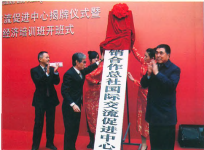
Inauguration of ICECC

unveiled the Sign Board of ICECC on the occasion. ICA/CHINA Training Course on "Operation and Management of Circular Economy Projects" was the first training programme to be held at the ICECC soon after its inauguration.