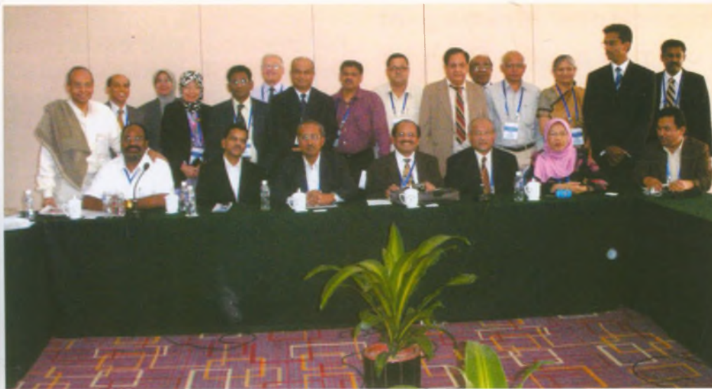
Participants of the HRD Committee Meeting

presence of the members and thanked them for coming to the meeting. He stressed the importance of Global HRD Networking ( www.hrd.coop ) developed and maintained by National Co-operative Union of India (NCUI) and Vaikunth Mehta National Institute of Co-operative Management (VMNICM) in collaboration with ICA.