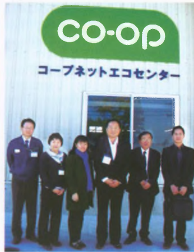
Participants at the coop store

ii) ICA Training Program for managers of consumer