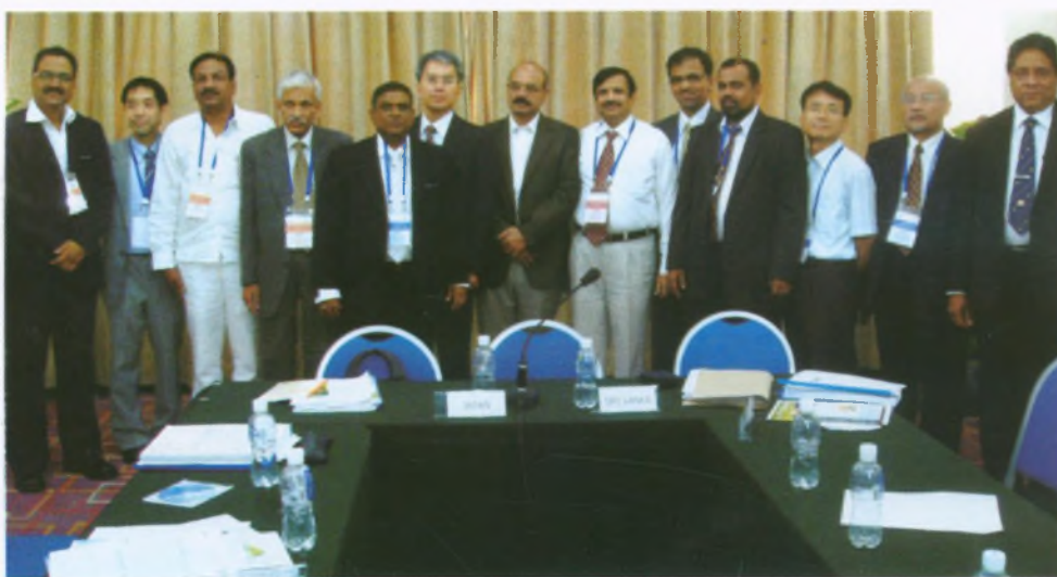
Participants at the meeting

The 44th meeting of the ICA Committee on Consumer Co-operation for Asia and the Pacific was held at Beijing International Convention Centre (BICC), Beijing, China on 2nd September 2010. 16 participants from five countries India, Japan, Korea, Malaysia, and Sri Lanka attended the meeting. In addition, 8 observers from Sri Lanka were also present.