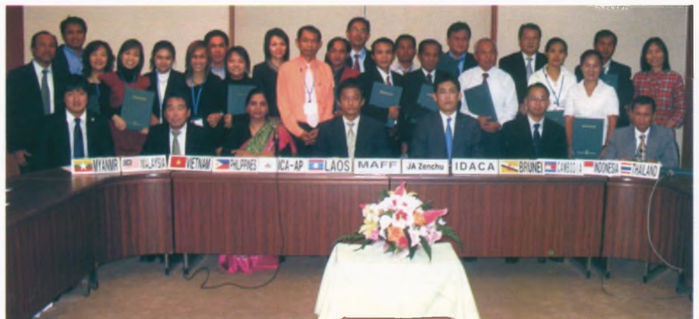
The participants with officials of ICA, MAFF, IDACA and JA-Zenchu

In this course, the participants visited to some co-operatives