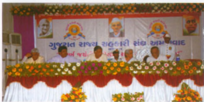
Coop Leaders at the Opening

On completion of 50 years, the Gujarat State Co-operative Union celebrated Golden Jubilee and State level Co-operative convention at Adalaj, Dist. Gandhinagar on 27th June 2010, which was inaugurated by Hon'ble Governor of Gujarat, Dr. Smt. Kamalaji.