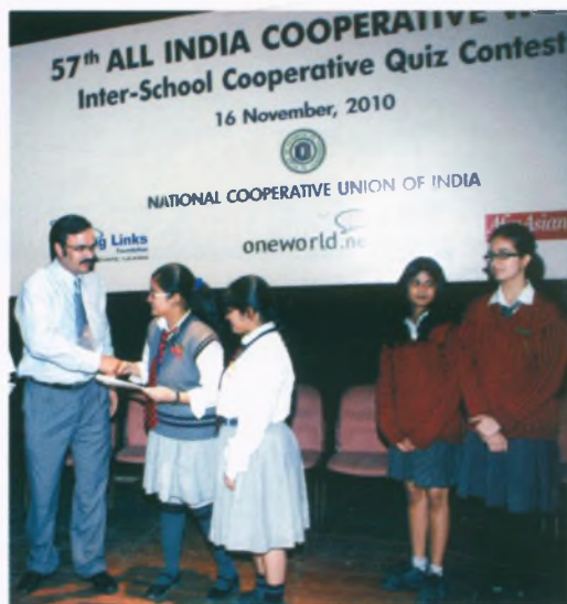
Prize to winners