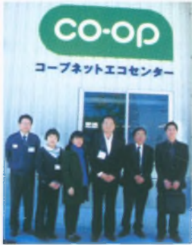
Participants at the coop store

ICA Training Program for managers of consumer co-ops in Japan was held on 29 Oct to 14 November, 2010.