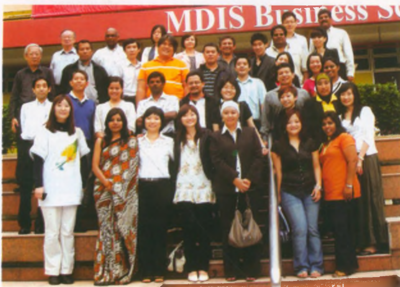
The Group of Co-operative Leaders at the Business Seminar