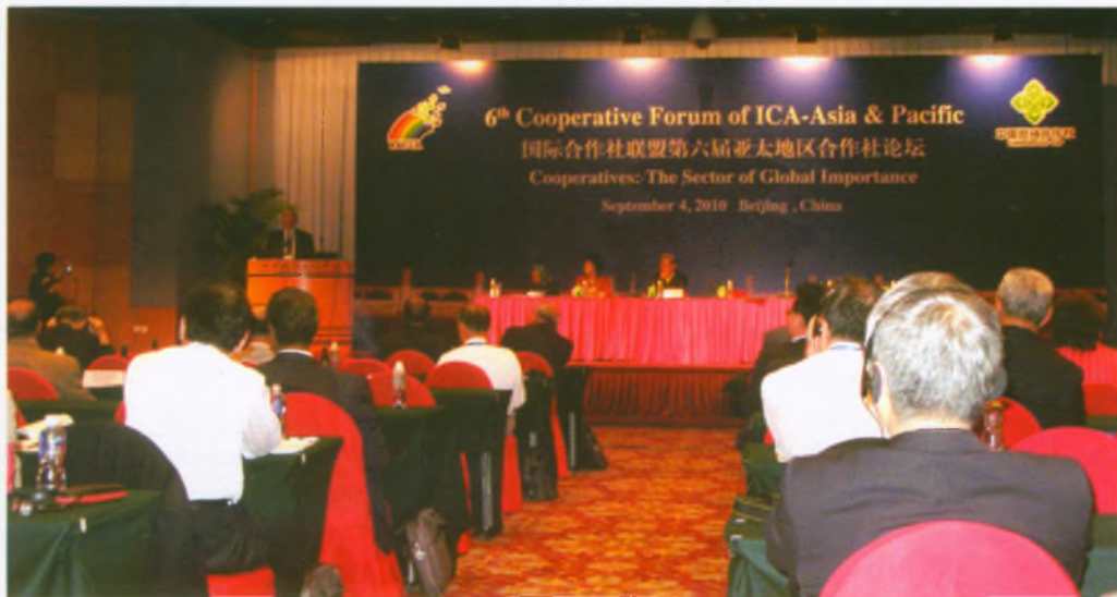
Co-op Forum in progress

The 6th Asia Pacific Co-op Forum took place along with the ICA Regional Assembly for Asia and Pacific on 4th September, 2010 in Beijing, China. The Theme of the Co-op Forum-2010 was "Co-operatives- The Sector of Global Importance".