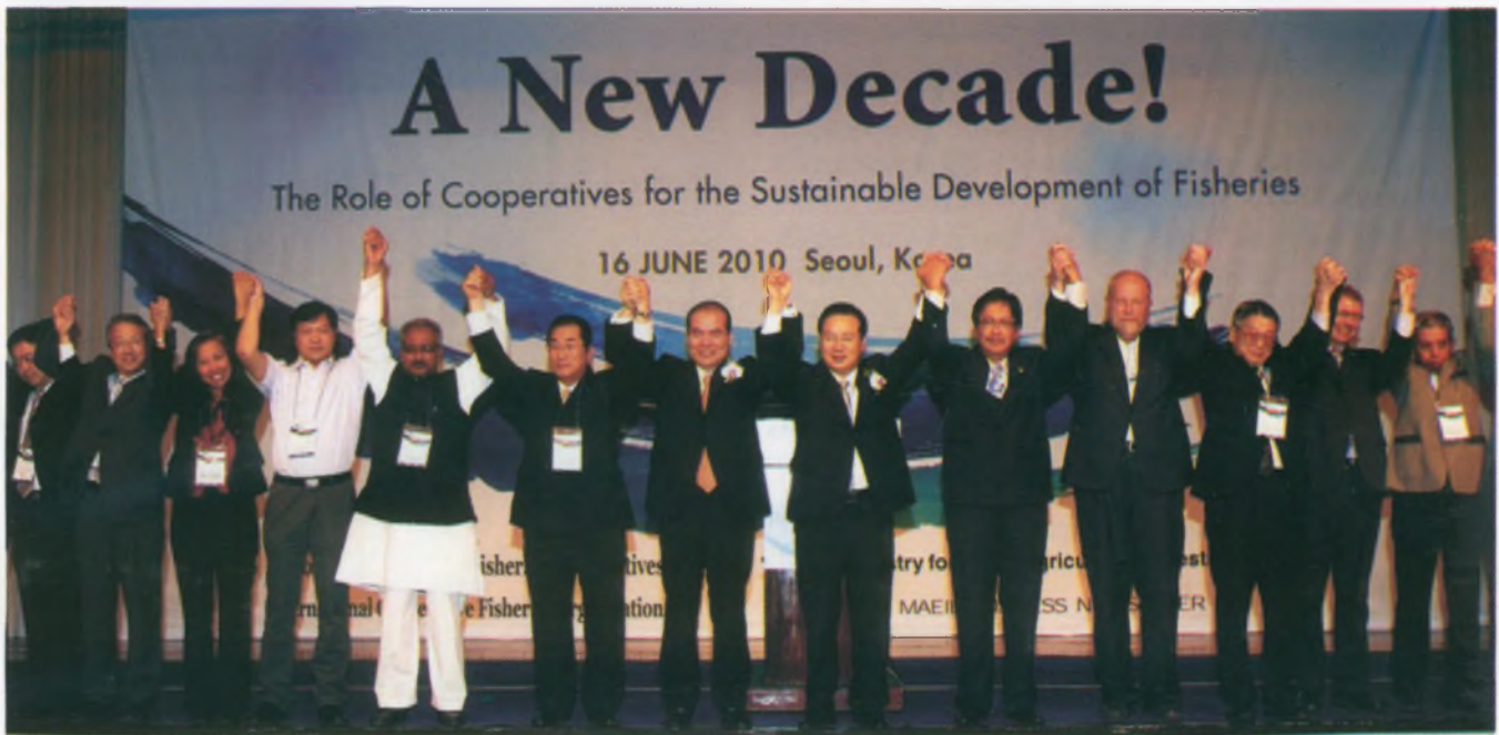
Participant at the Symposium

ICFO and NFFC jointly hosted an International Symposium on fisheries and fisheries co-operatives on 16 June, 2010.