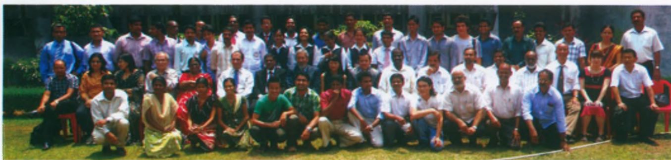
A group photo of the participants