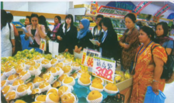
Women participants during co-op visit

The Ministry of Agriculture, Forestry and Fisheries (MAFF) of the Government of Japan and International Co-operative Alliance (ICA) agreed to jointly implement an umbrella Project on "Strengthening of Capacity Building in Developing Countries in Asia" for three years starting from 2011 which consists of three training courses one of which is being exclusively conducted for women.