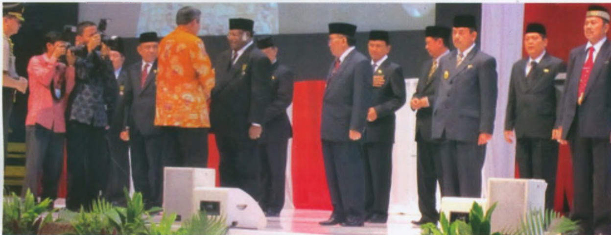
The President of Indonesia awarding the excellent cooperators

In the presence of the President of Indonesia, Dr. H. Susilo Bambang Yudhoyono and his Co-operative Minister, Dr. Syarifuddin Hasan, the 64th National Co-operative Day Celebrations in Indonesia was held on 12 July 2011 at the Jakarta Convention Centre. In his inaugural speech, His