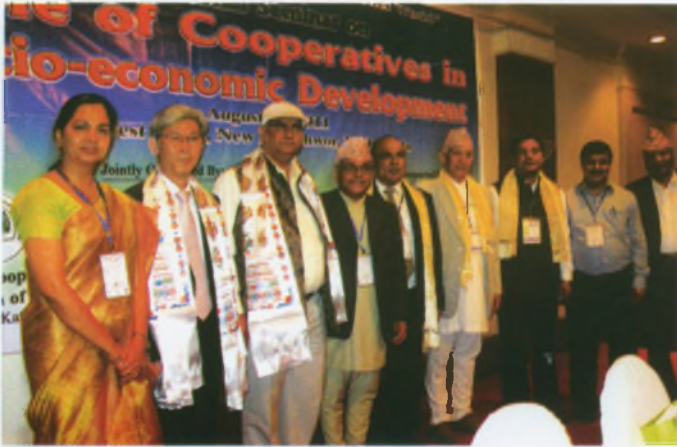
Honourable Minister, Mr. Yadav with delegates