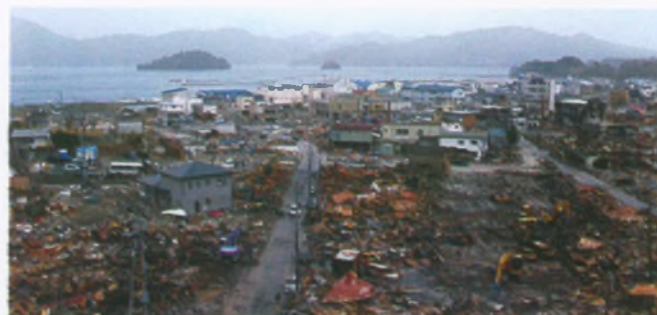
Once prosperous fishing town

A powerful tsunami has swept across a large area of northern Japan causing major damage, flooding towns and sweeping away buildings. It was triggered by a 8.9-magnitude earthquake on 11 March 2011. As reported by the media about 10,000 persons have died, thousands are reported to be missing and a large numbers are seriously injured. ICA and many ICA members have sent letters of condolences and support to ICA members in Japan. In addition, on 16 March the ICA launched an appeal to collect donations for its Japan Disaster Recovery Fund. A number of Japanese members have already established special funds for those that wish to support both the