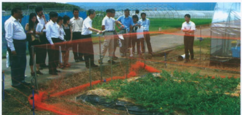
The Group of Participants at IDACA, Japan