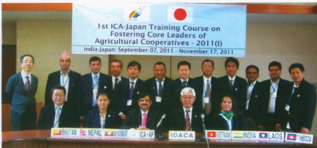
The Group of Participants at IDACA, Japan

Some of the key subjects covered during the training are - various aspects in the development of agricultural co-operatives in Japan, i.e. farm guidance, joint collection and shipment, business management method of agricultural co-operatives etc. Moreover, the participants are expected to finalize the action plans in Japan for improvement, based on the experience and the knowledge gained during the training course in India and Japan.