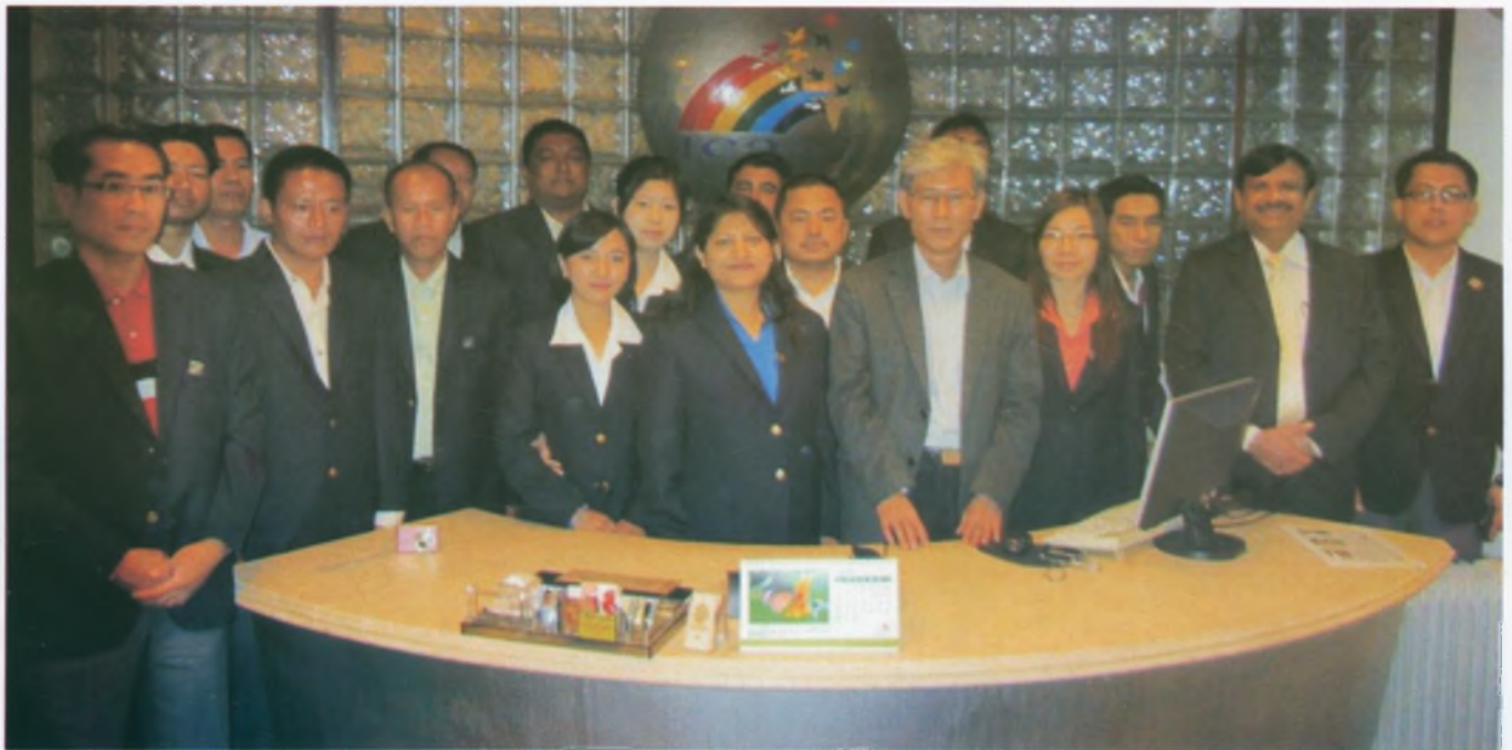
The participants at ICA-AP office