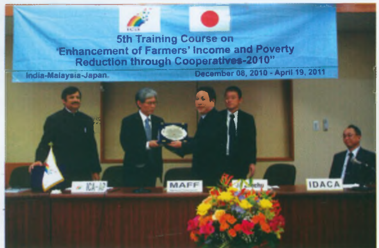
Award of certificate

12 participants from Cambodia, China, India, Lao PDR, Malaysia, Myanmar, Mongolia, Nepal, Sri Lanka, Thailand and Vietnam attended the training. The first part of the Indian segment of the training programme, IFFCO-FMDI Module on Review of Management of Agricultural Co-operatives in Asia was hosted by IFFCO and held in Farmers Management Development Institute at Gurgaon and second part on Project Management at Institute of Rural Management (IRMA), Anand (Gujarat), India, the third segment of comparative field study visits of Agriculture Co-operatives was hosted by National Co-