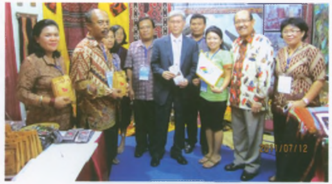
Delegates at the expo

A series of activities have been organised to celebrate the co-operative day like seminar, workshop, social service, race and tournament, pilgrimage and holy meditations, cultural night show, youth jamboree, international expo, talk show and speech, co-operative leaders meeting etc. The DEKOPIN invited international co-operative participations for International Expo as a part of their effort to support the International Year of Co-operatives in 2012.