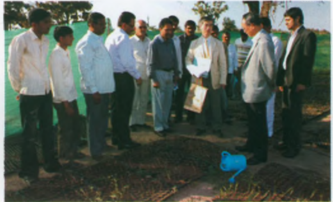
IDACA delegates during filed visit

The delegates also visited to some of the schools, colleges and institutions built and run by the Pravara Nagar sugar co-operative.