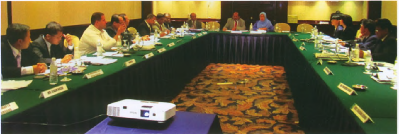
Meeting in progress

The 23rd meeting of the ICA Committee on Human Resource Development (HRD) for Asia and Pacific was held on 4th July in Selangor, Malaysia. It was hosted by the National Co-operative Organization of Malaysia (ANGKASA). 28 participants from seven countries, namely, China, India, Indonesia, Iran, Kuwait, Malaysia and Sri Lanka attended the meeting.