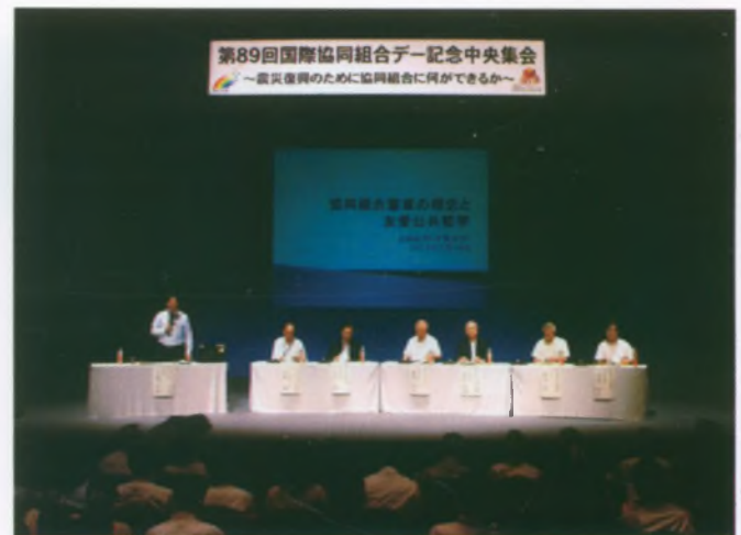
The delegates at the function

It was a successful gathering and all the speakers gave the attendees lots of food for thought.