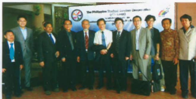
The Group of committee Members

The participants also enjoyed study visit to the consumer co-operatives of Centro Escolar University and the University of the Philippines.