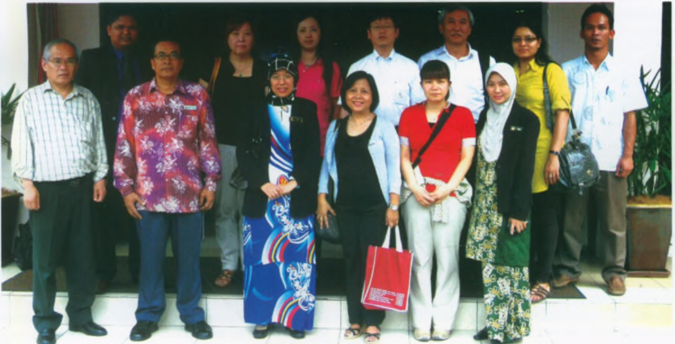
Office bearers with ANGKASA Staff

The Office Bearers discussed various management issues related to functioning of the Committee. During the meeting all the members exchanged their views, impressions and opinions about the functioning of the committee. A round table meeting with the Malaysian Co-operators also held after the committee meeting. This was attended by a representative from National Co-operative Commission of Malaysia to discuss their action plans & policy for next 5 years.