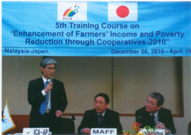
Concluding session At IDACA

operative Organization of Malaysia (ANGKASA) and final part was held at Institute for the Development of Agriculture Cooperation in Asia (IDACA), Tokyo in Japan. The participants were received by various ICA member-organizations in India, Malaysia and Japan during the course of study visits.