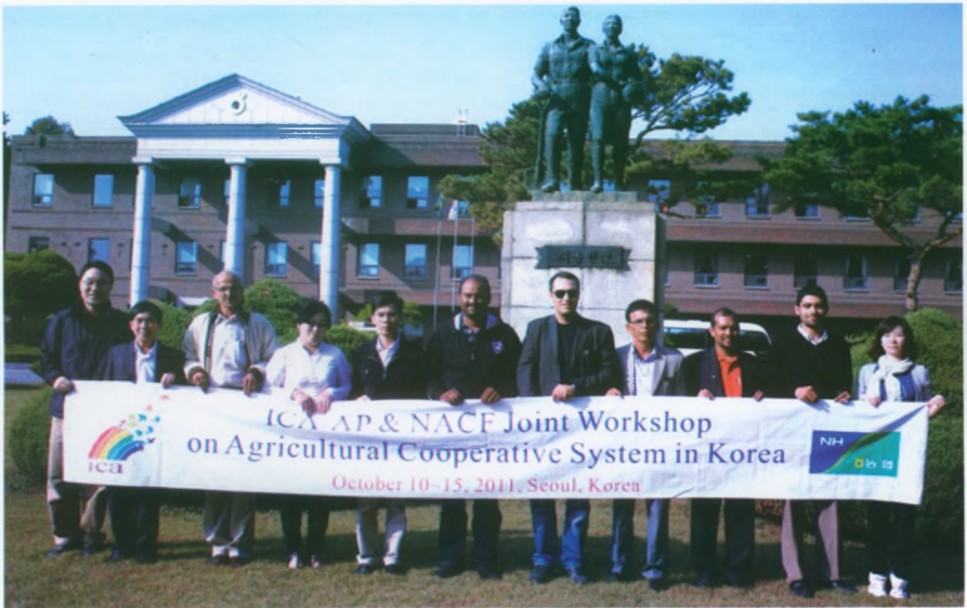
The Participants with ICA-AP and NACF staff

Agriculture is still the main stay of economy in Asia-Pacific region. In order to provide exposure to members to best practices in the field of agriculture and related co-operative business in the region, the ICA-AP in collaboration with member organisation, NACF in Korea, organises a workshop and study visit every year.