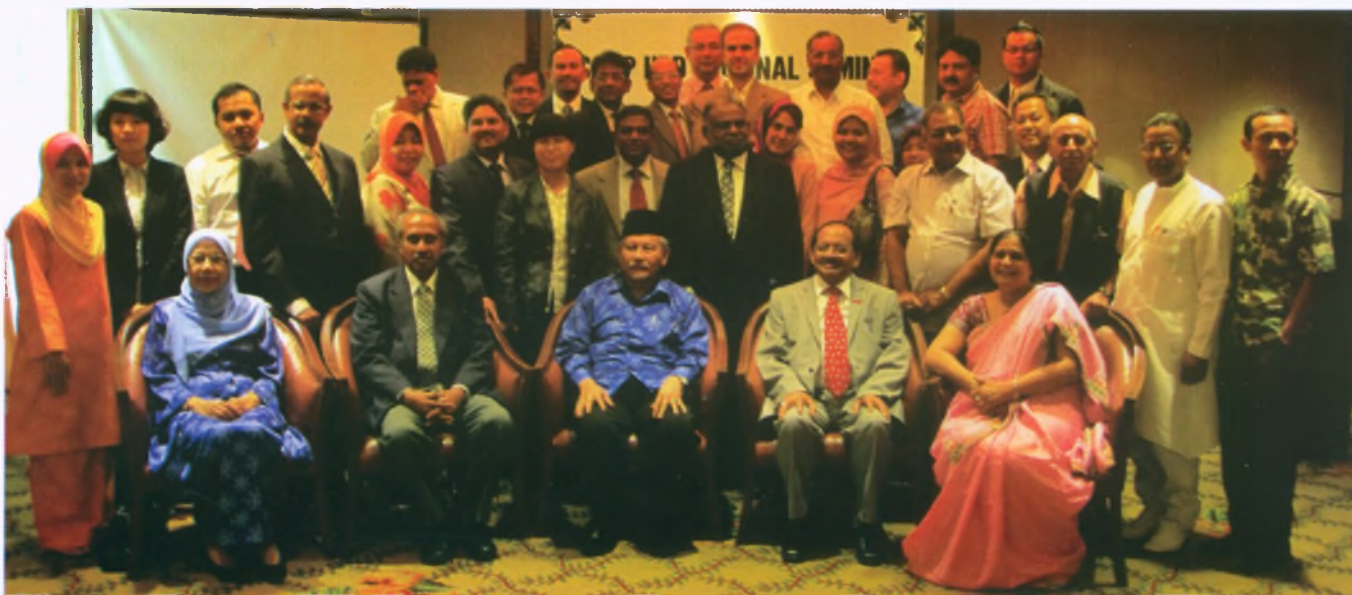
The participants with the Chairperson

A Regional Seminar on “Need and Importance of HRD in Co-operatives with special reference to Training of Board of Directors” was organized by the International Co-operative Alliance-Asia and Pacific (ICA-AP) in collaboration with the National Co-operative Organization of Malaysia (ANGKASA) on 4th and 5th July 2011 in Subang, Selangor, Malaysia.