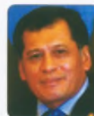
Mr. H.A.M. Nurdin Halid