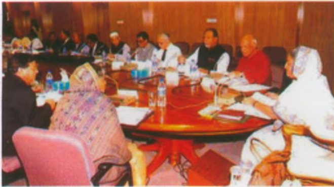
Meeting with the Prime Minister Sheikh Hasina

Cabinet approved the draft Co-operatives (Amendment) Bill, 2011, aiming to expedite the 'Vision 2021' as the present law is not capable enough to achieve the target.