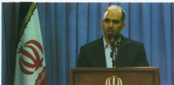
Managing Director addressing the meeting