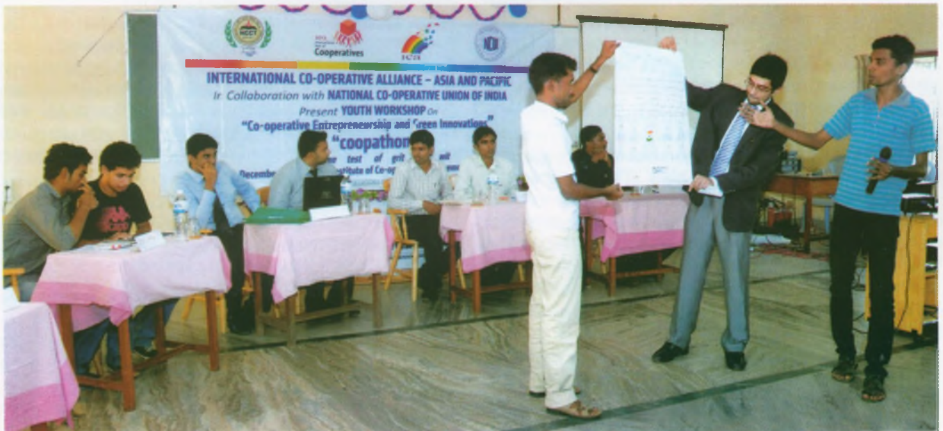
Workshop in progress

(NCUI), from 20th- 23rd December, 2011 in the backdrop of observation of 2011 as the UN International Year of Youth and the UN International Year of Co-operatives 2012.