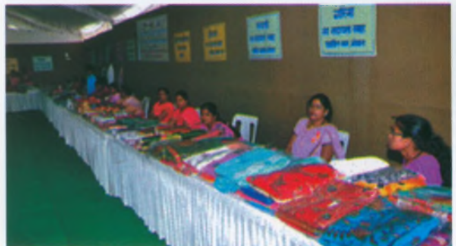
Members of SHGs seen with their products