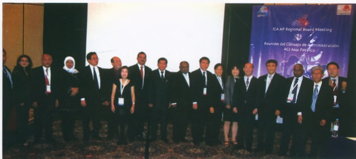
The Board Members