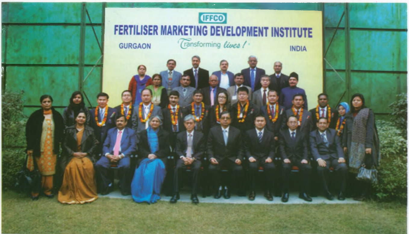
Participants and guests at FMDI, India