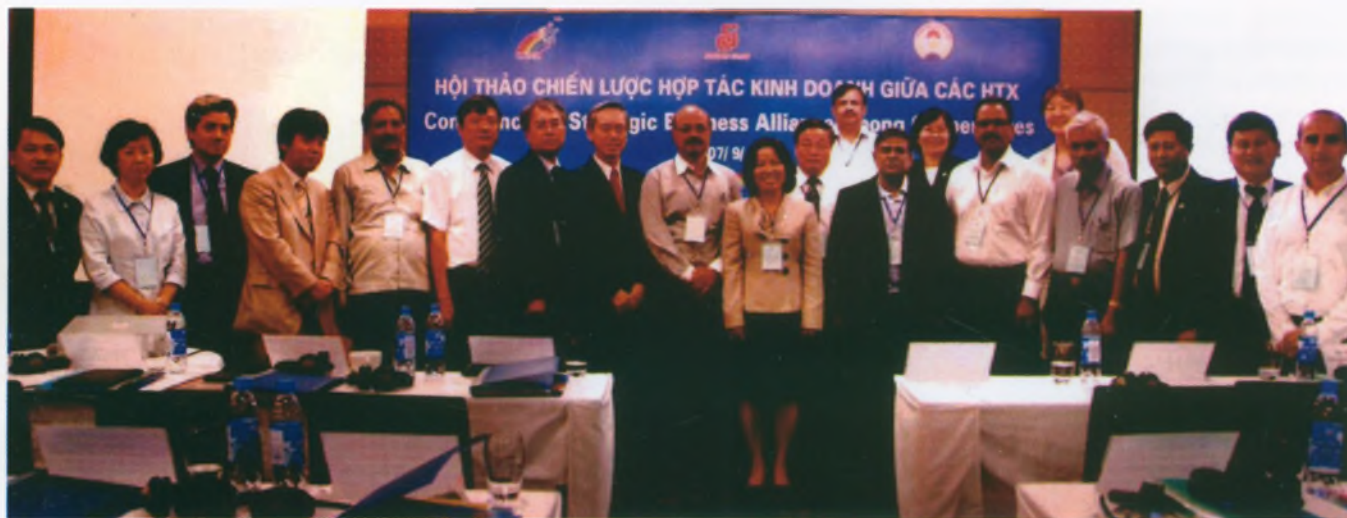
Participants of the conference