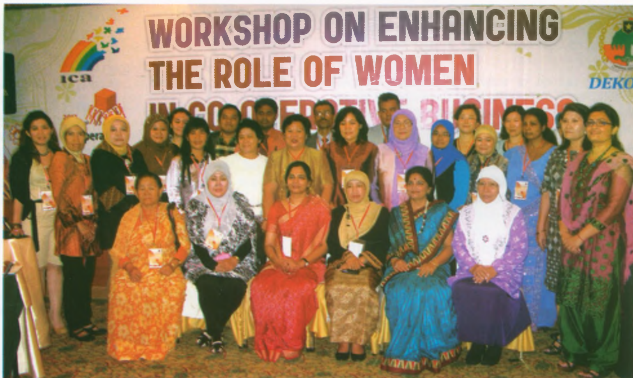
The participants of the workshop

Department and various cooperative attended the workshop to have an exposure of gender focused best practices in Indonesian co-operatives.