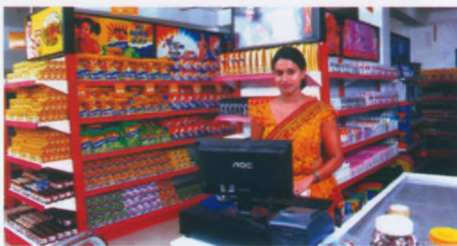
A Coop Store

As the pilot project, Sri Lanka Consumer Co-operative Societies Federation Ltd (Coopfed) of Sri Lanka had opened the largest Super Market at National Institute of Co-operative Development, Polgolla in the Central