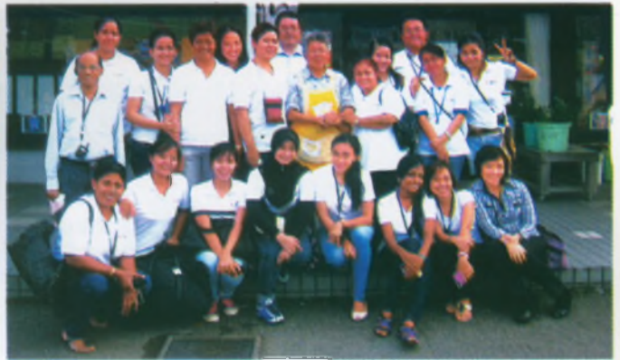
The participants at a co-operative in Japan

During the project period from 2011-2013, total 3 courses,