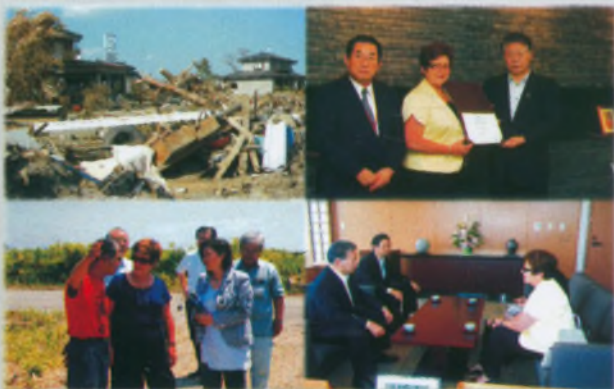
ICA president in Japan