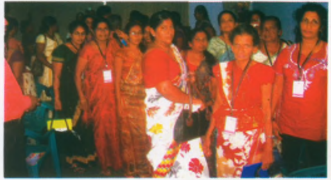
The participants of the training

The programme started with presentation of status paper on "Situation of co-operative movement and women's participation in Sri Lanka" by National Co-operative council of Sri Lanka and discussion on various aspects facilitated by resource persons. Dr. Chan Ho CHOI took keen interest in the training and conducted a session on contribution of women for the development of the society