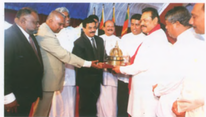
Hon'ble President with President and General Manager of NCC

Ministry of Co-operatives and Internal Trade, Department of Co-operative Development along with the National Co-operative Council of Sri Lanka made arrangements to implement several programmes to celebrate both the occasions.