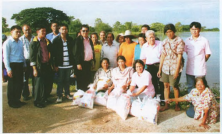
Some of the Victims with Disaster Relief Packages

The whole nation was devastated. However, 187 co-operatives societies were totally damaged and around 450,000 individual members were directly affected and remained in bad condition. To provide urgent relief to co-operative sector, CLT mobilised all fund and consumer goods from some of co-operative members in Bangkok area. They made the "Disaster Relief Packages" and gave away to the affected areas. All majority of the flood victims in the affected area had already been evacuated but they will wait for the water to go. For the long term rehabilitation program, CLT has launched the center as "CLT National Flood Relief Center" at CLT Central Office in Bangkok to provide emergency operation as a central point to help all co-operative members who were affected from floods, storm, and landslide. The main aims of the center are to act as a central point and communicate immediately with the floods victims in co-operative sector, providing and coordinating operational, and support needs of the co-operative members. It was also to assist in coordination and communication between donors and victims of the floods, storm, and landslide as emergency response and recovery operations. To achieve and provide relief to the flood victims in co-operative sector, CLT, which set up long term plan to relief and recovery of all victims in co-operatives sector are as follows: