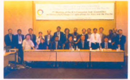
Consumer Committee meeting in Seoul