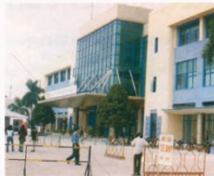
Venue of the International Co-op Trade Exhibition, Hanoi

As a follow-up, the Co-op Directory (Yellow Pages) prepared by ICA ROAP for feedback at the Seminar, is now fully operational. Please visit < www.directories.coop > and post information on your co-operatives and the products you would like to buy/sell.