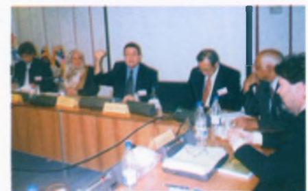
Another view of the Regional Consultation, Tehran

Thirty-seven participants representing Co-operatives engaged in travel and tourism in Malaysia, Singapore and the Philippines, including school co-operatives, participated in the seminar.