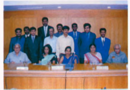
SANASA Development Bank Executives

The participants were also exposed to actual field situation through visits to co-operative banks in Lucknow.