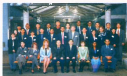
Trainees of 15th course with IDACA staff and resource persons