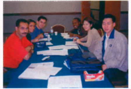
Youth delegates discussing co-op issues

National Women's Forums were held in 7 countries of the region, viz. India, Sri Lanka, Nepal, Malaysia, Singapore, Vietnam and Japan. This gives an impetus to persuade other member organizations and countries to hold such national forums.