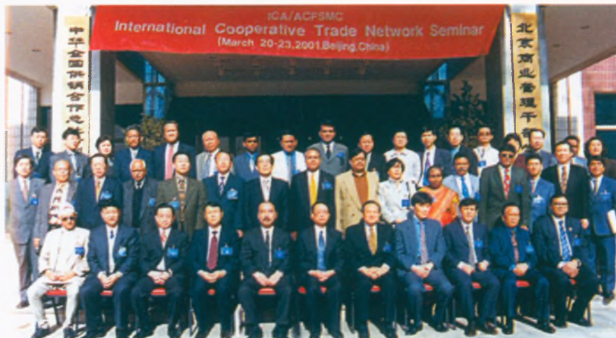
Participants of the ICTN Seminar, Beijing