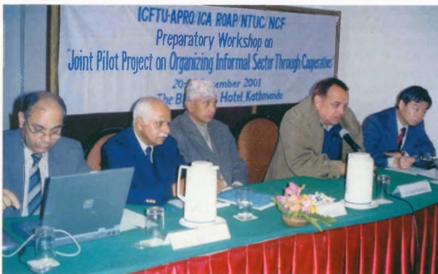
The workshop in progress.