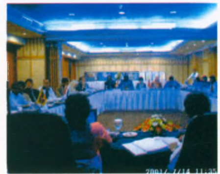
Distance Education Seminar, Jakarta

Thirty participants representing India, Indonesia, Malaysia, Sri Lanka, Thailand and Vietnam attended the regional workshop.