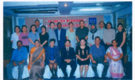
Delegates after validating the Leadership development manual