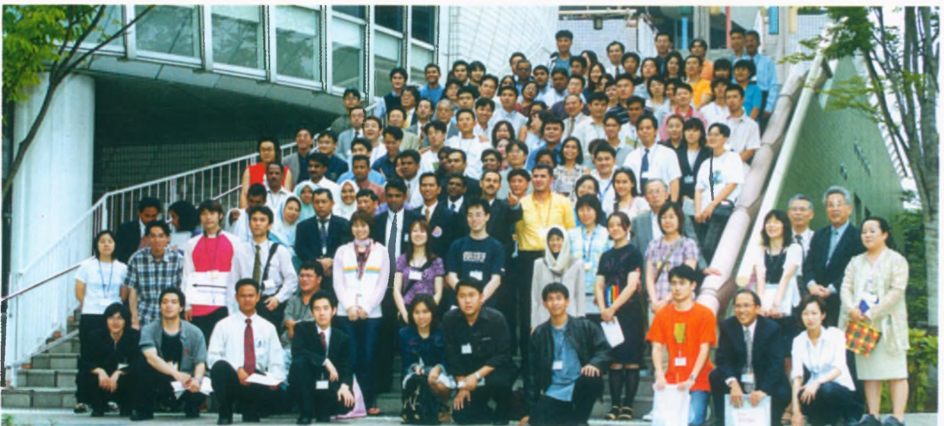
Youth seminar delegates got together for a photograph

On the last day, an evaluation was held and the youth unanimously agreed that the experiences they had gained from the two-day seminar will help them better-equip in their community work. The recommendations, agreed upon at the seminar will be submitted to the Asia-Pacific Standing Committee of the ICA for better implementation of youth integration in the region.