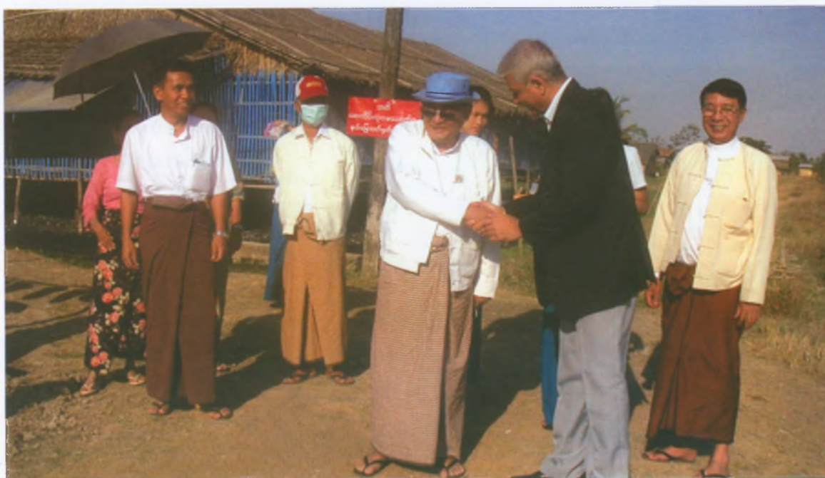
Chairman of the disaster affected Cooperative near Yangon, Myanmar welcoming DRD, ICA-AP at the reconstructed poultry shed

The disaster that struck Myanmar on 2 and 3 May 2008 in the form of cyclonic winds and rainfall killed 150,000 persons and displaced over 2 million populations. 395 co-operatives in southern and south-eastern Myanmar faced the wrath of the disaster. In all 259 members of these cooperatives died and 8544 were rendered homeless.