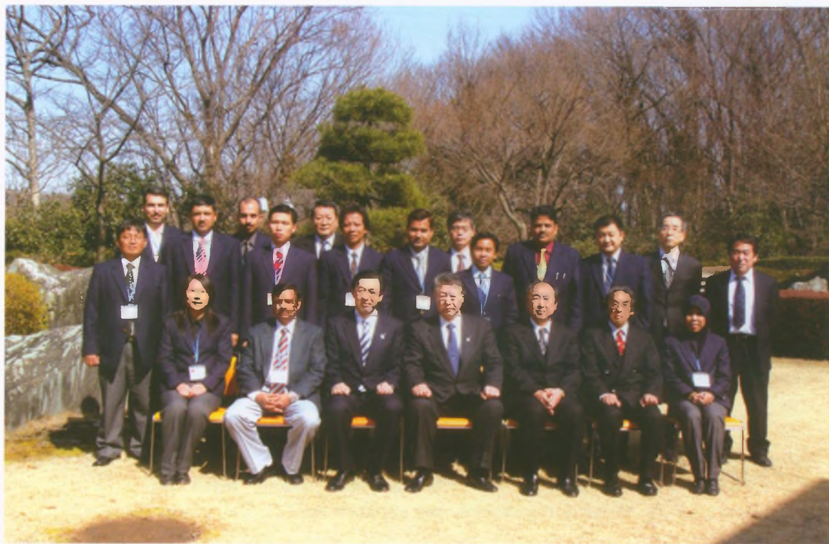
Participants of the Training course with the officials of IDACA and President JA-Zenchu

The 3rd Training course on “Enhancement of Farmers’ Income and Poverty Reduction through Cooperatives” was held from 07th December 2008 to 18th April 2009, with a focus on strengthening of farm guidance method, joint collection, marketing, safety and improvement of quality of farm products. The training programme was implemented by the ICA-AP in collaboration with IFFCO/FMDI, Gurgaon, Institute of Rural Management (IRMA), Anand (Gujarat), India, IDACA, Tokyo (Japan) and ICA’s member-organizations in India, Iran and Japan.