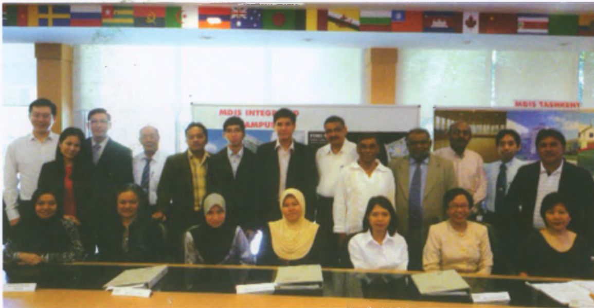
The participants of ICA-SNCF Business Seminar in Singapore

The 1st ICA-SNCF Business Seminar for Cooperative Leaders was held on 23-24 October 2009 in Singapore. The main objective of this seminar was to provide cooperative leaders, especially from ASEAN countries, with an insight of competitive cooperative business that will catapult their careers even on this global economic crisis and forge and foster camaraderie and integration with the different cooperatives within Asia and the Pacific region. Hosted by Singapore National Co-operative Federation (SNCF), 18 co-operative leaders from 8 countries (India, Indonesia, Malaysia, Myanmar, Philippines, Singapore, Sri Lanka and Vietnam) participated in the two-day seminar.