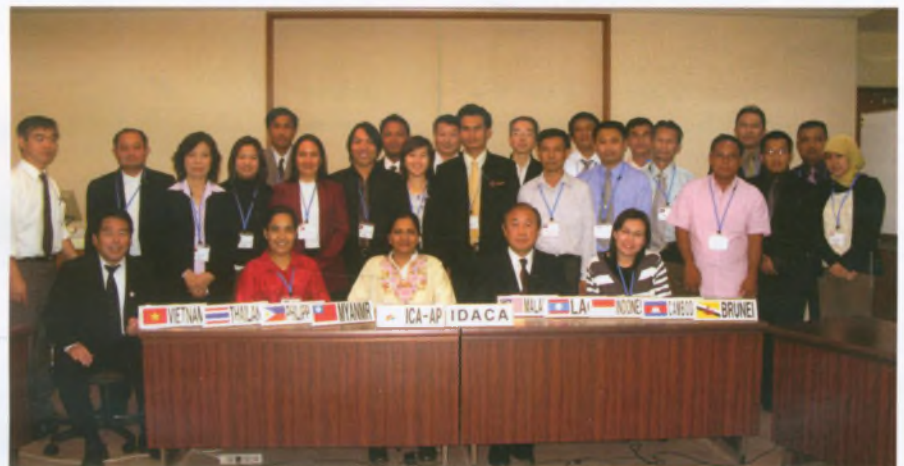
Group photo of the participants of the programme