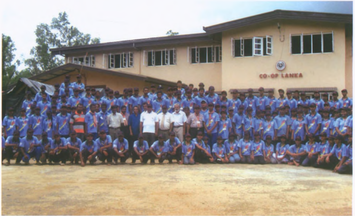
Group photo of the participants of the Youth Camp organised by the NCC, Sri Lanka

The National Co-operative Council of Sri Lanka implemented the project on Empowerment of Youth and Women through Cooperatives. The project was funded by IFFCO in the spirit of co-operation among co-operatives.