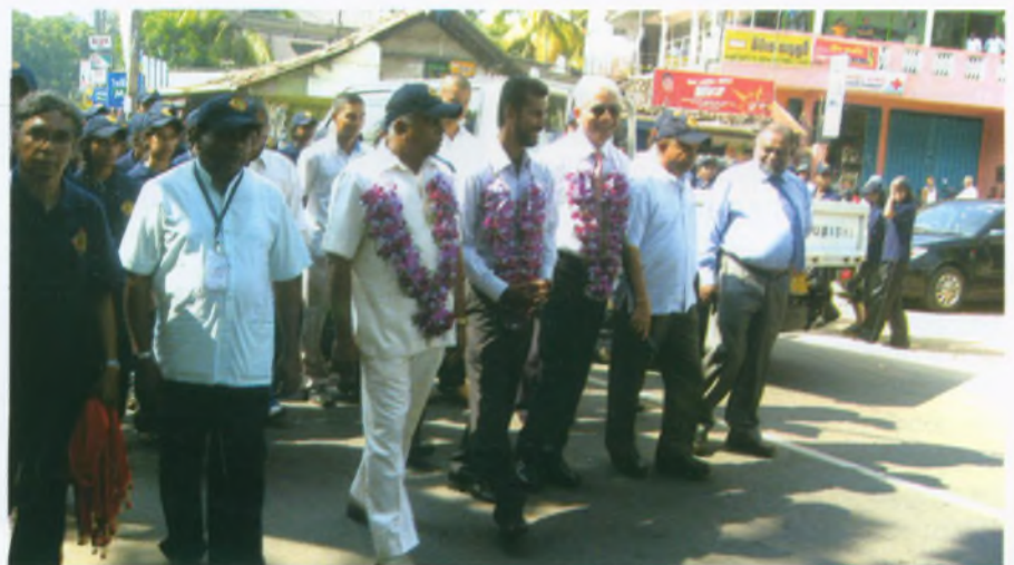
Procession to mark the launch of the project