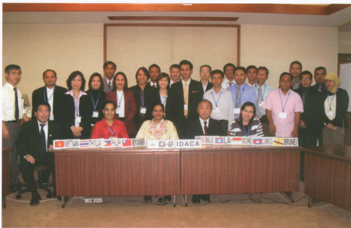
Group photo of the participants of the training course

The Training Course was held in IDACA, Japan from 02-27 November, 2009. A total of 22 participants (8 women and 14 men) from 9 ASEAN countries joined the course.