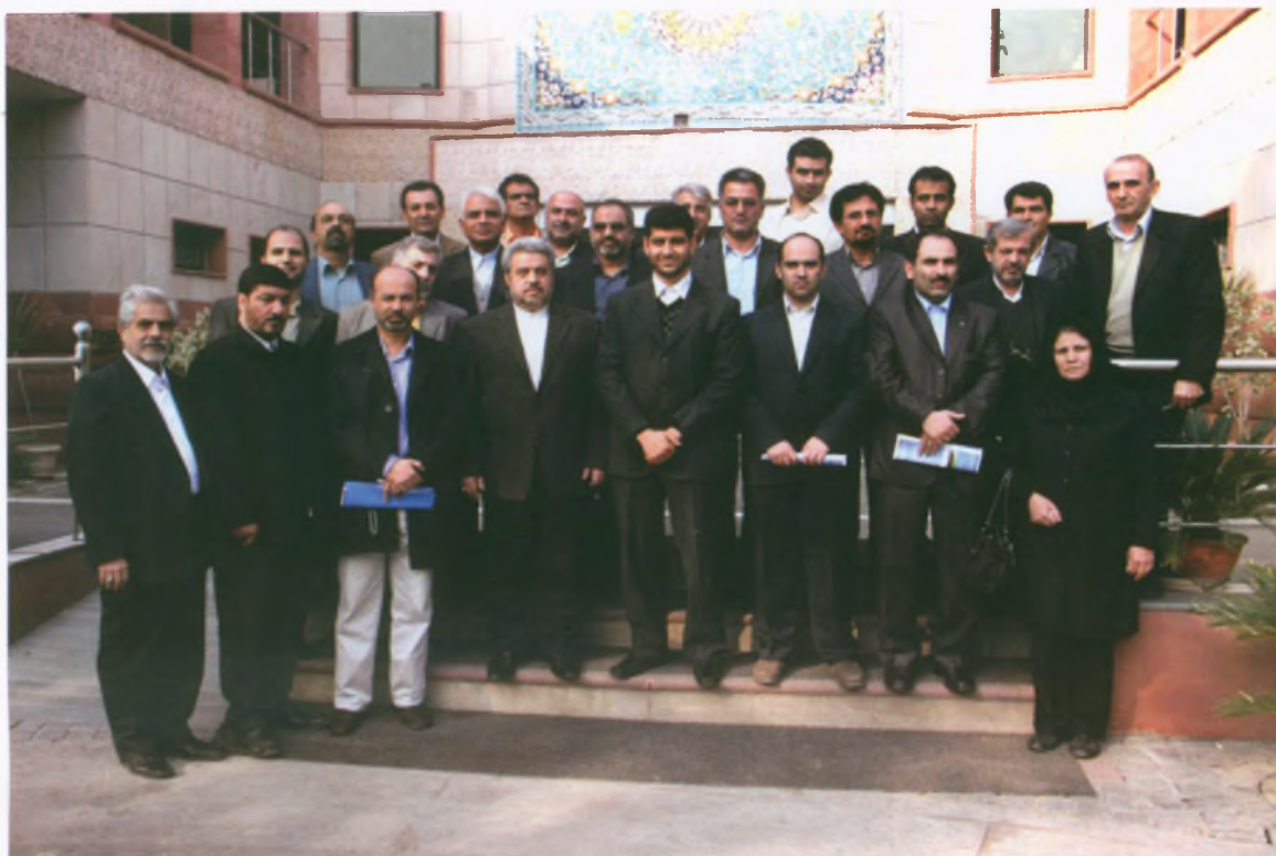
H.E. Dr. Hosseini Nia, Dy. Minister of Cooperatives, Iran, and members of the delegation with the Ambassador of Iran to India

D r Hosseini Nia, Deputy Minister of Cooperatives, Islamic Republic of Iran along with 20 officials of most successful cooperatives from Iran visited India from 4th to 11th January 2009. The main objective of the visit was to understand the collaboration between Government and Co-operative Movement for the development of cooperatives in India.