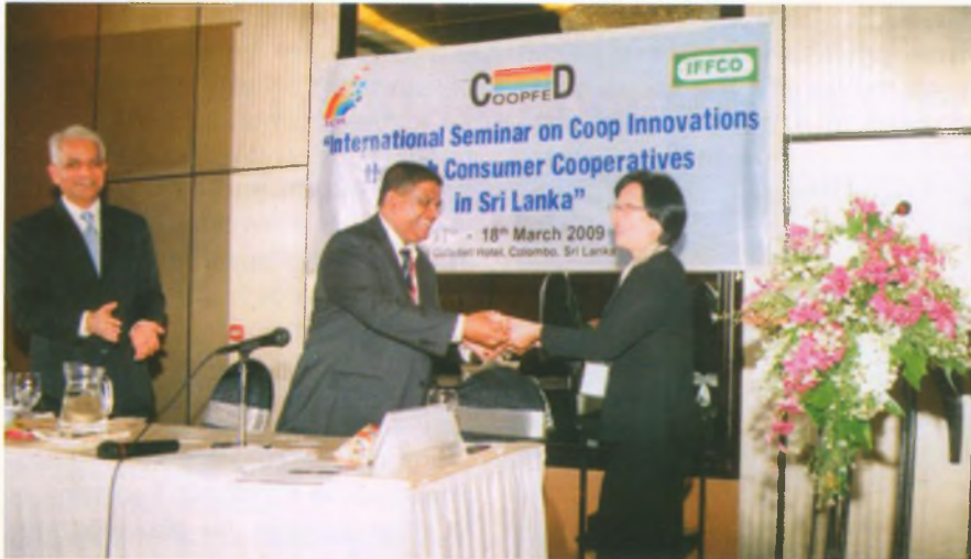
Participants being awarded at the Seminar

Case study of Developing Sri Lankan Cooperative movement