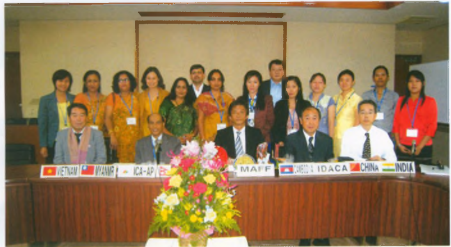
Group photo of the participants of the training course

Part-II of the program held at IDACA from 30th August to 25th September 2009 included extensive classroom work and study visits to agricultural cooperatives in Saitama and Aomori Prefectures of Japan. Lecture-cum-practical field study visits assignments