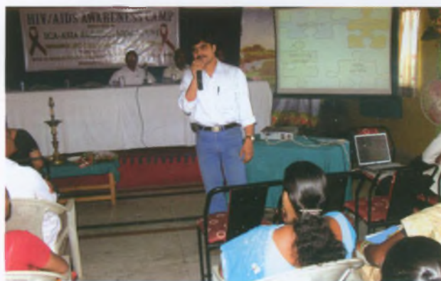
The AIDS/HIV Awareness camp in progress

The HIV/AIDS Awareness Camp for cooperative members were held in Orissa and Chattisgarh states of India in October, 2009. The one day camp was held on 8th October in Raipur and on 10th October in Berhampur respectively. The events were held in collaboration with UNDP,