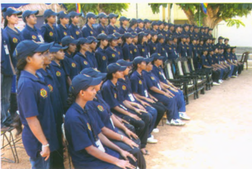
Participants of the Matara Women Group

Mental development, spiritual counselling, sports, recreation, nature, knowledge building, yoga, time management, conflict management, stress management, ethnic harmony, peace building, human rights, business planning, strategic development, project planning and project budgeting and institutional capacity development were a few of the subjects taken up in the camps. The participation in the camps was found to be very effective and empowering.