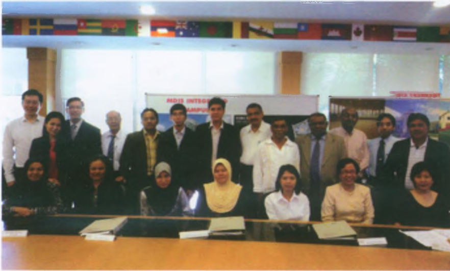
The participants of first ICA-SNCF Business Seminar in Singapore

The 1st ICA-SNCF Business Seminar for Cooperative Leaders was held on 23-24 October 2009 in Singapore. The main objective of this seminar was to provide cooperative leaders, especially from ASEAN countries, with an insight of competitive cooperative business that will catapult their careers even on this global economic crisis and forge and foster camaraderie and integration with the different cooperatives within Asia and the Pacific region. Hosted by Singapore National Co-operative Federation (SNCF), 18 co-operative leaders from 8 countries (India, Indonesia, Malaysia, Myanmar, Philippines, Singapore, Sri Lanka and Vietnam) participated in the two-day seminar.