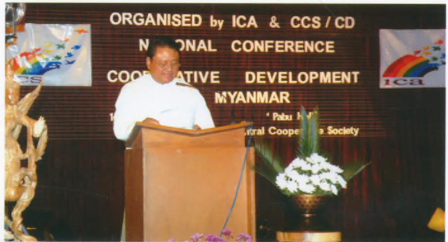
Chairman of CCS addressing the Conference on Coop. Development in Myanmar

ernance mechanism in the spirit of ICA's cooperative identity statement.