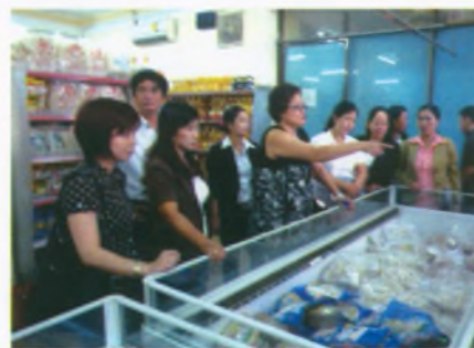
Participants at a Coop Consumer Store