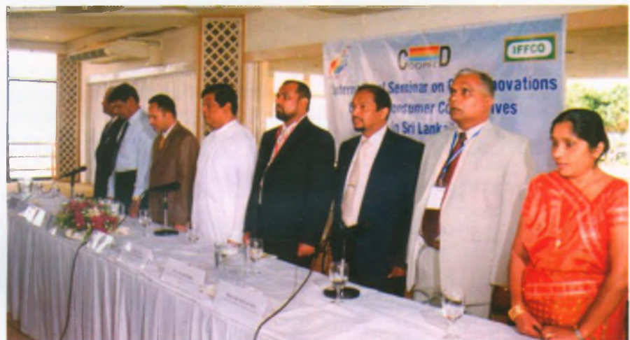
Distinguished delegates at the inauguration of the Seminar