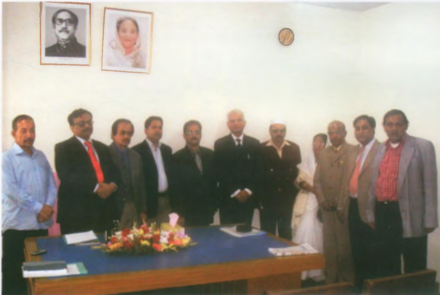
Members of the Board of Management of BJSU with the DRD, ICA-AP