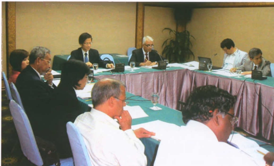
First meeting of the Office Bearers of ICA-AP University/Campus Coop Committee in Bangkok, Thailand

The 1st ICA Asia Pacific University/Campus Cooperative Committee meeting was held in Bangkok on 13th July 2009. Fifteen representatives from various countries who participated expressed their concept of developing university/campus coops in their respective countries.