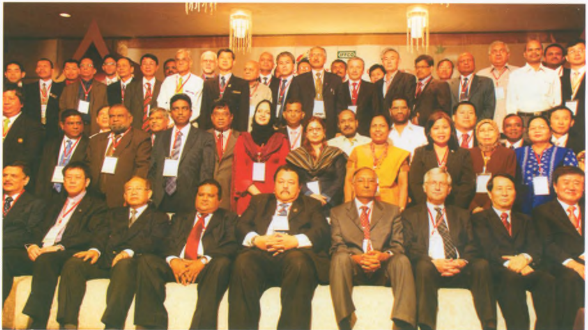
Group photo of the distinguished delegates at the Conference

The Conference on “Enhanced Role of Cooperatives in Recovery from the Economic Crisis” was organized by ICA Asia Pacific in collaboration with Cooperative League of Thailand and Indian Farmers Fertilizer Cooperative with the objective of creating a shared vision on the scope and role of cooperatives in the global economic crisis and devise a common strategy to reposition cooperatives as preferred form of enterprises.