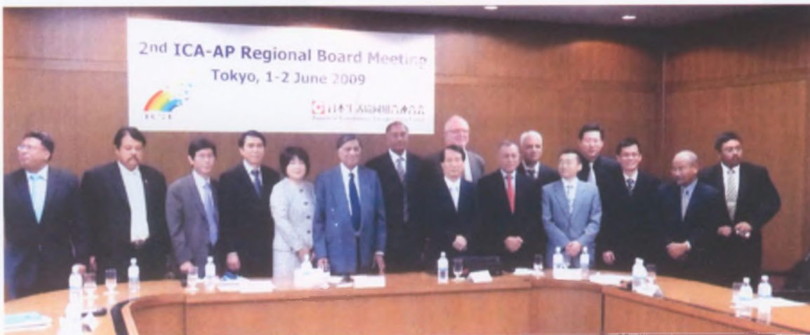
Group photo of the distinguished participants at the ICA AP Regional Board meeting in Tokyo, Japan