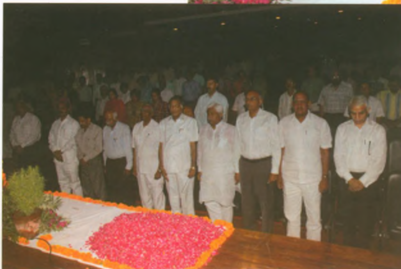
A view of the mourning silence observed by the leaders of Indian cooperative movement