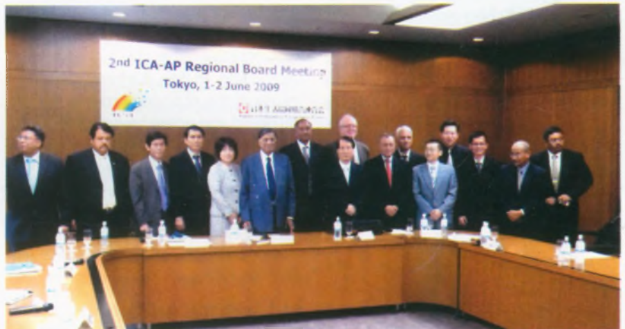
Group photo of the participants at ICA-AP Regional Board Meeting in Tokyo