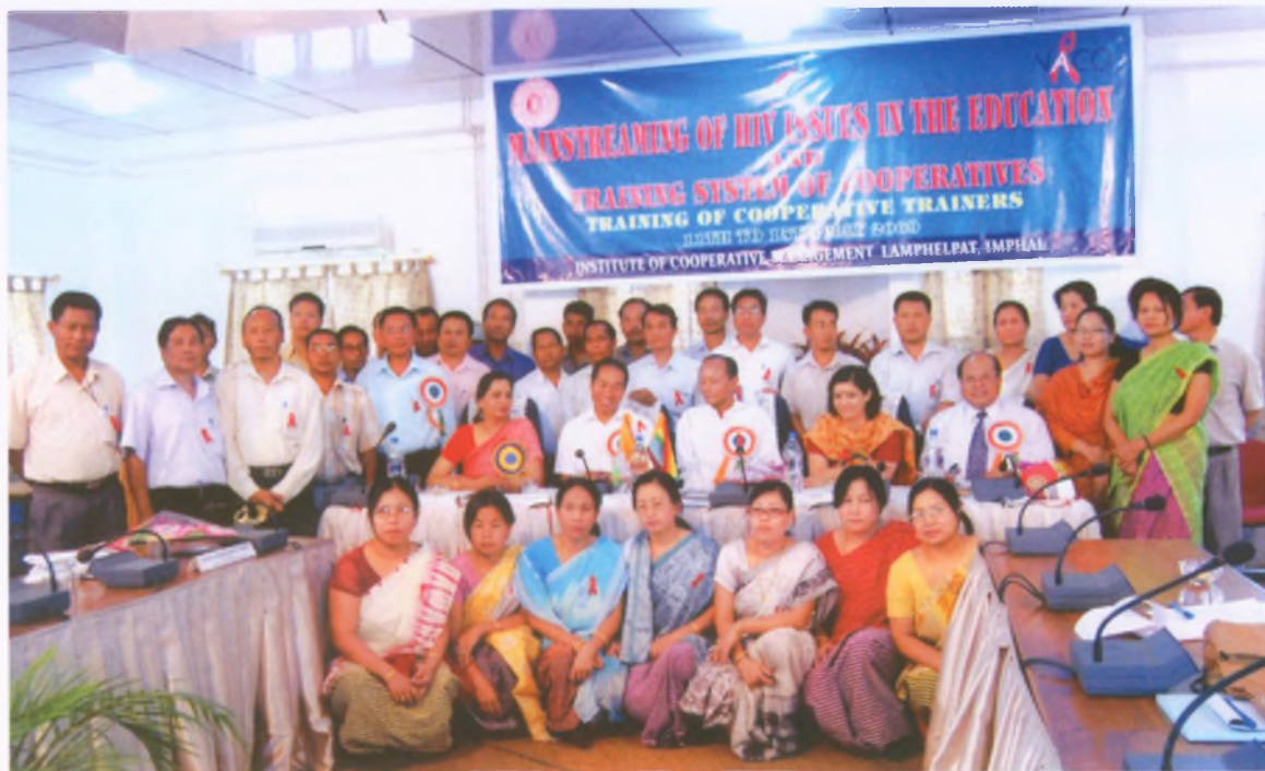
Participants of HIV/AIDS Awareness Workshop in Manipur, India

In 2004, ICA in collaboration with NCUI conducted a National workshop in India, for sensitization of the cooperative leaders, policy makers, directors and trainers on various aspects related to the spread of HIV/AIDS. In 2006-07, ICA AP with the support of DFID implemented a project in four states namely Uttar Pradesh, Bihar, Gujarat and Andhra Pradesh. ICA has also been implementing a project "Mainstreaming of HIV issues in the education and training system of cooperatives" in 11 States (Rajasthan, Chhattisgarh, Orissa, Karnataka, Maharashtra, Tamil Nadu, Manipur, Uttar Pradesh, Bihar, Gujarat and Andhra Pradesh) with focus on 7 states in the first phase initially and 4 states in the second phase and in totality it would reach out to 230 million people.