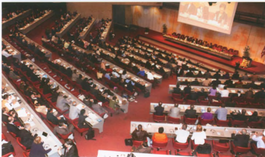
A view of the ICA General Assembly 2009

The ICA General Assembly 2009 brought together nearly 800 delegates on 19-20 November 2009 at the Geneva International Conference Centre (CICG) in Geneva, Switzerland. The highlights included: