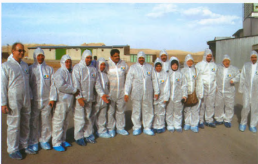
Participants of the training course at a poultry farm during study visit in Iran

Typeset & printed at Diamond Offset, HS-14, Kailash Colony Market, New Delhi-110048. Phone: +91-9811172786, +91-11-29232836 E-mail : amin_zaidi@yahoo.com