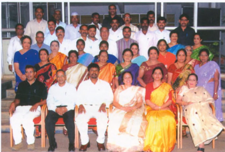
Participants of the sensitisation workshop at Bangalore

The first phase (January 2009-July 09) of the project is under implementation and has three critical components - sensitization workshops, namely Uttar Pradesh, Bihar, Gujarat and Andhra Pradesh. Currently, ICA is implementing a project "Mainstreaming of HIV issues in the education and training system of