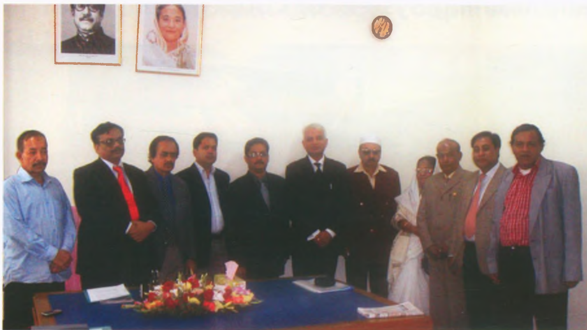
Members of the Board of Management of BJSU with the DRD, ICA-AP