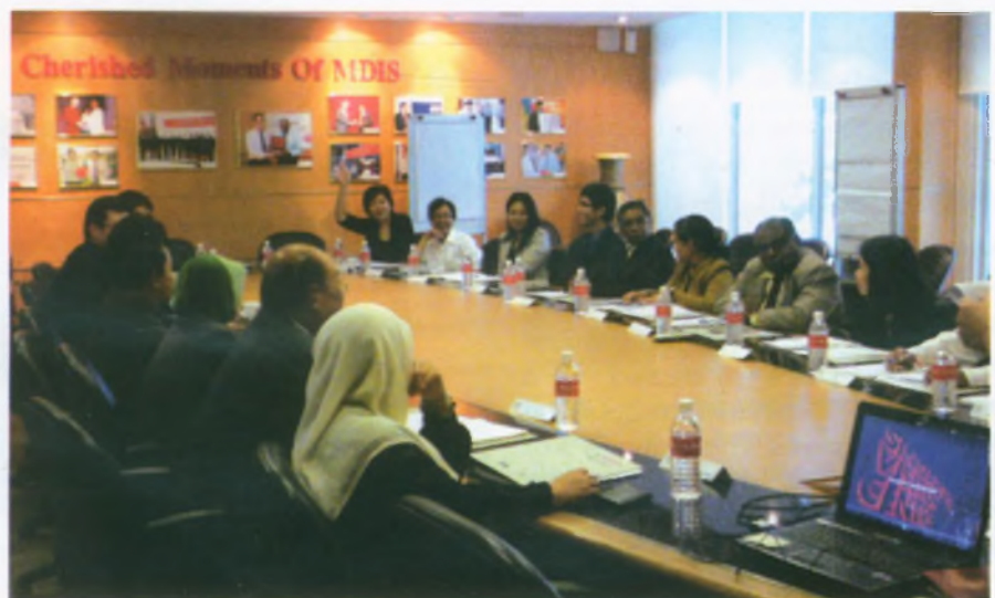
The ICA-SNCF Business Seminar in progress

As a result of the seminar, participants shared the necessity of business collaboration across the region and the ICA-AP was requested to fulfill its role in developing business collaboration among co-operatives.