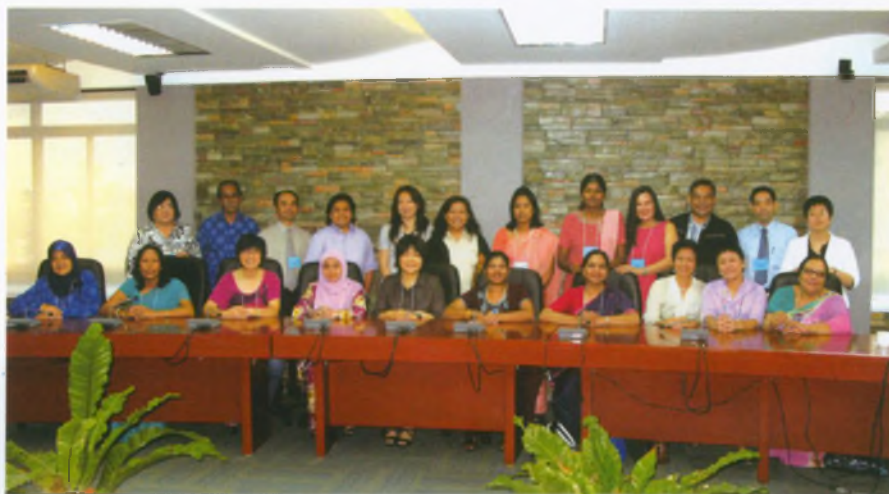
Participants of the Workshop in Manila, Philippines