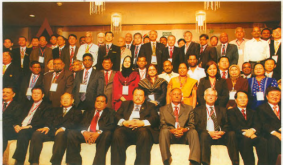
Group photo of the distinguished delegates at the Conference

Cooperatives were established to defend ordinary citizens economically against rising monopolies, to include them in the economy by achieving economies of scale, and to have some