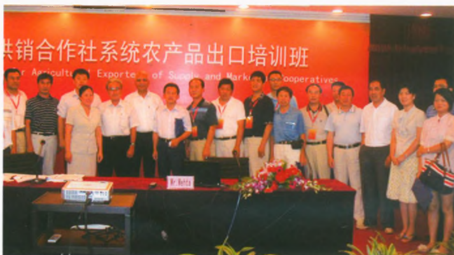
Participants of the seminar in Beijing