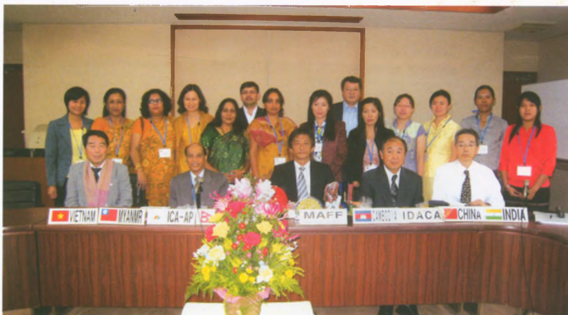
Group photo of the participants of the training course

The ICA-AP in collaboration with the JA-ZENCHU [Central Union of Agricultural Cooperatives of Japan] and the Institute for the Development of Agricultural Cooperation in Asia [IDACA] held the 4th Training Course on "Promotion of Sustainable Enterprises for Rural Women" from 20-25, September 2009 in Vietnam and Japan.