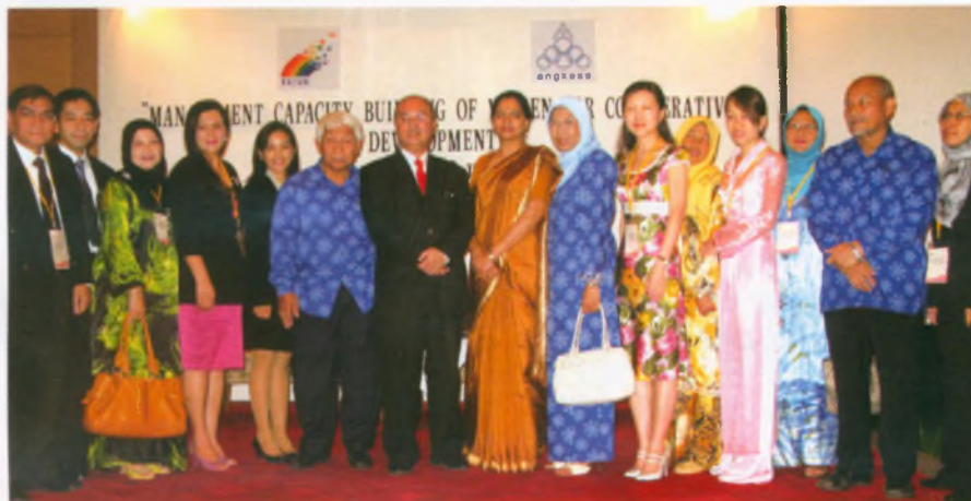
Participants and guests of the training program in Malaysia

This year the programme was organized for the cooperative movement of Malaysia in Kuala Lumpur from 28 June to 3 July, 2009. This programme aimed at assisting the cooperative movement of Malaysia to review the status of gender integration and women’s