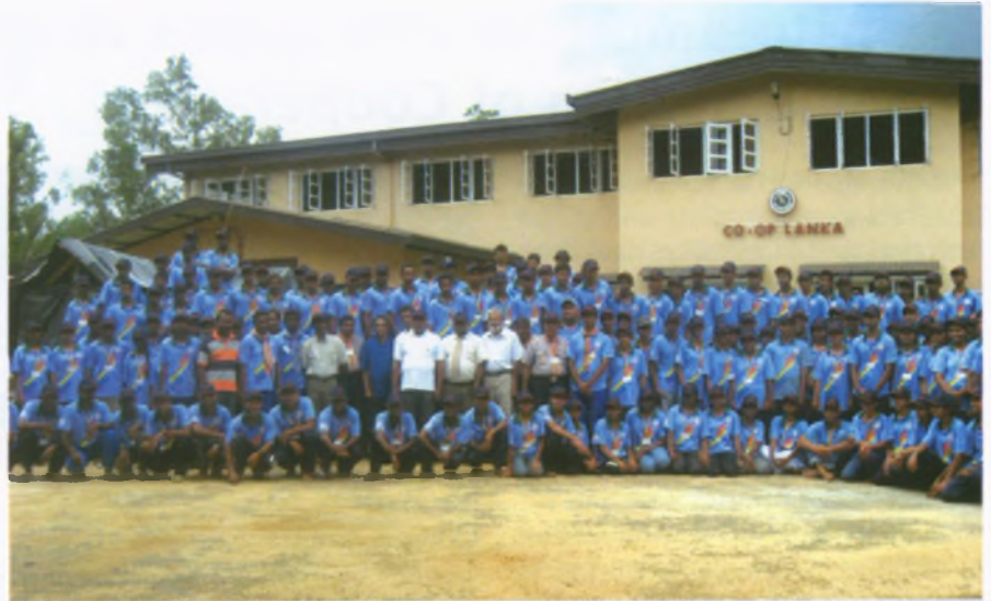
Participants at the Youth Camp in Sri Lanka

4. Base line survey: The survey was conducted successfully and critical information regarding the youth cooperative leadership was collected. The surveyors managed to collect data from the small groups as well as CBOs already engaged in MFI activities. The social mobilization participatory development approach, institutional