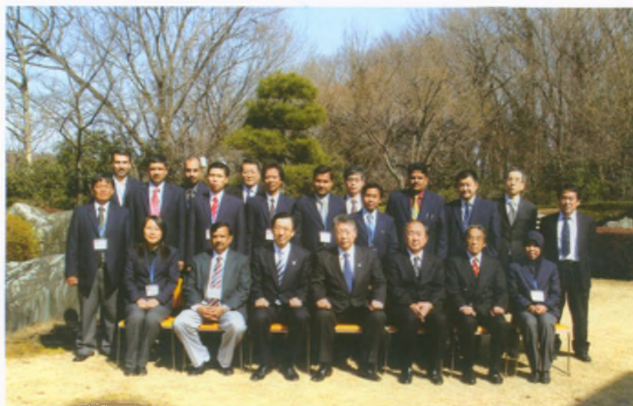
Participants of the 3rd Training Course at IDACA, Japan