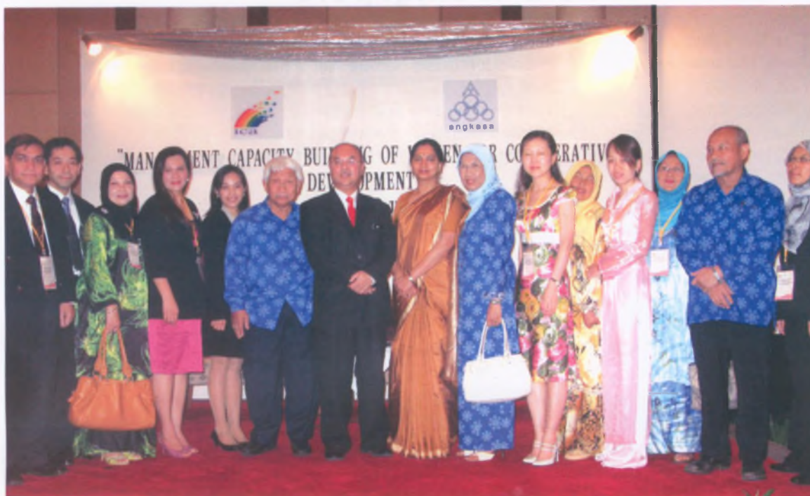
Participants and guests of the training program in Malaysia

Women development and gender mainstreaming in cooperatives is one of the priority areas of ICA. We are concerned about low and negligible participation of women at all levels of cooperatives in the region i.e. 30% at membership and 8% at leadership and decision-making. This is not a comfortable situation given the fact that 60-70% of farming and food production work is done by women.