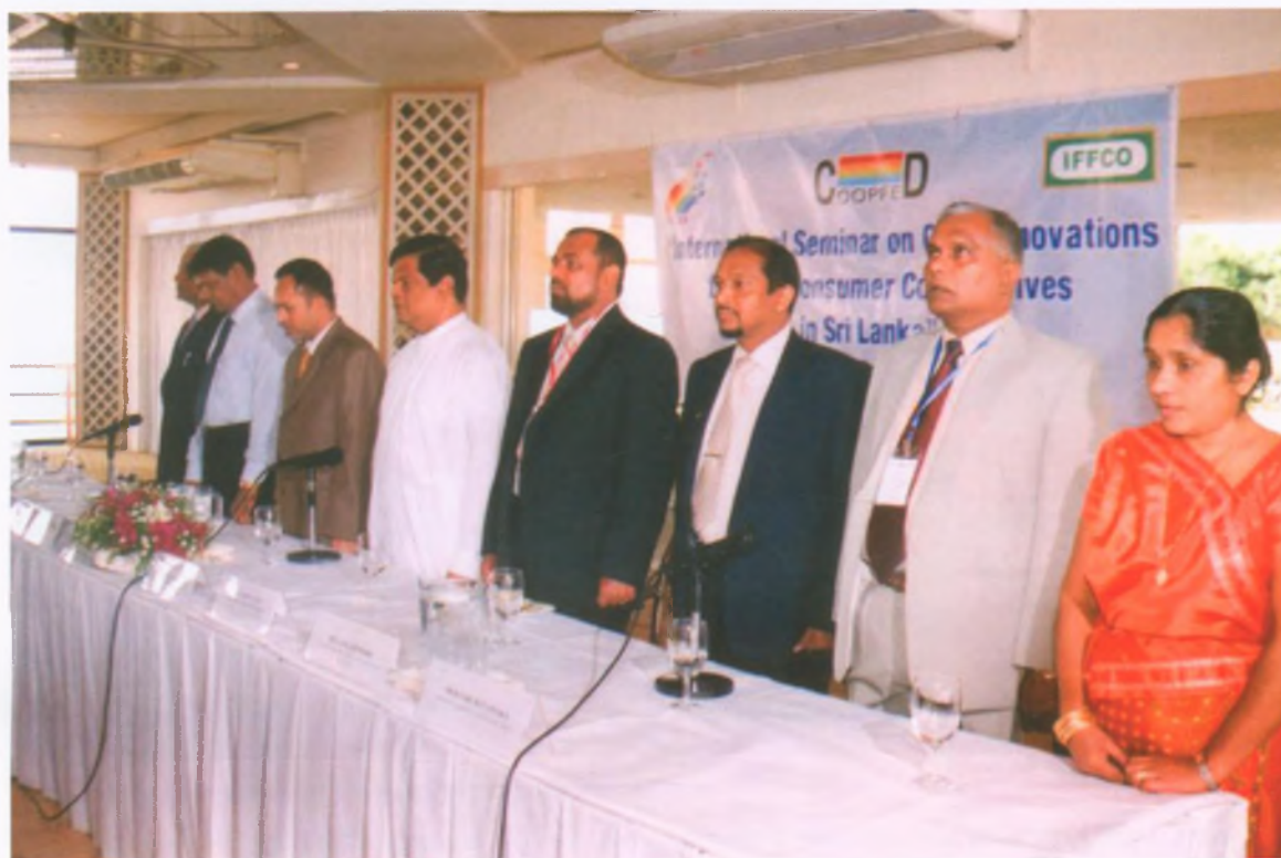
VIPs of the Cooperative Movement of Sri Lanka reciting the cooperative song of Sri Lanka at the inauguration of the Seminar

An "International Seminar on Coop Innovations through Consumer Cooperatives" was organized in Sri Lanka on 17th March 2009 at Hotel Galadari, Colombo. The Seminar was jointly organized by IFFCO, India and Coopfed, Sri Lanka. It was attended by the leaders and managers of co-operatives and senior officials from the Co-operative Ministry and Office of Commissioner of Co-operatives.