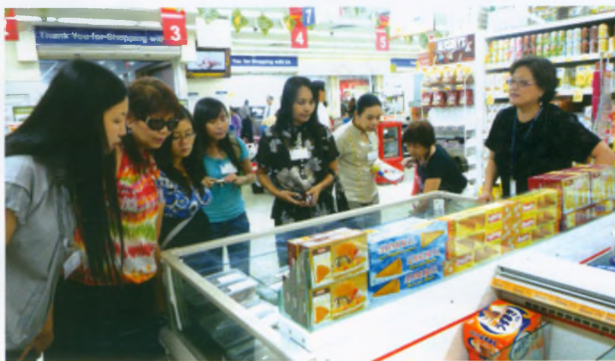
Participants of the Regional Workshop at a study visit