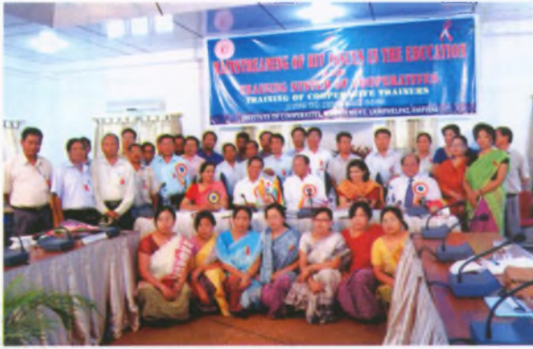
Group photo of the participants.

Manipur Aids Control Society cooperated to decide on the resource persons for the training programme.