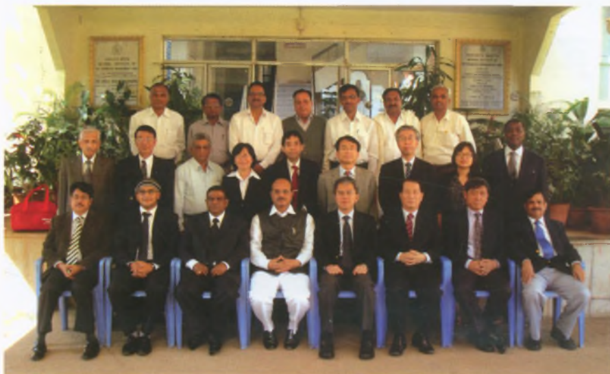
Group photo of the members of ICA-AP Consumer Committee and the delegates of the seminar

The 43rd meeting of ICA Committee on Consumer Cooperatives for Asia-Pacific was held on 9th December 2009 at Vaikunth Mehta National Institute of Cooperative Management (VAMNICOM), Pune, India. 28 participants from Japan, India, Korea, Myanmar, Singapore, Sri Lanka and Vietnam, attended the meeting. The meeting was hosted by the National Consumer Cooperative Federation of India (NCCF).