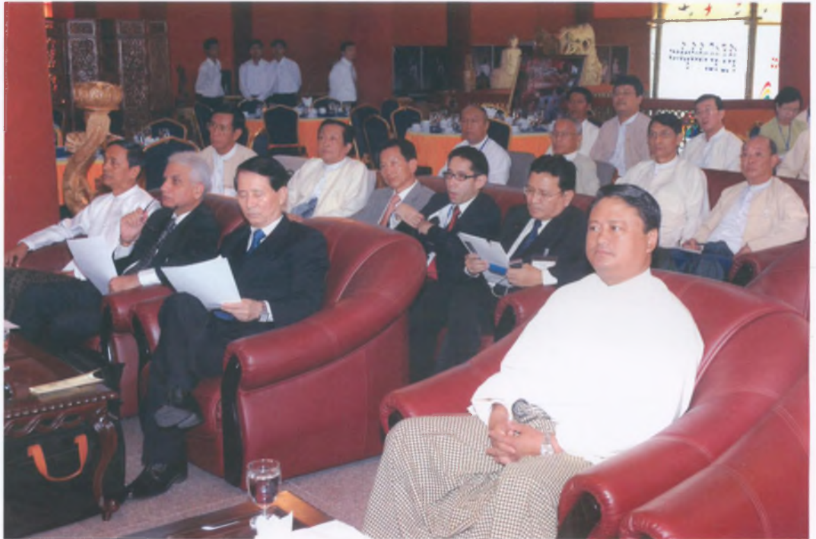
Technical session in progress - Chairman CCS, Myanmar seen with galaxy of Resource Persons for the Conference

The Conference on Cooperative Development in Myanmar was held on 16 & 17 June 2009 at Yangon. The Conference was organized by ICA Asia Pacific in collaboration with the Central Cooperative Society, Myanmar with the objective of "garnering policy support from the Government of Myanmar for promoting co-operatives as an alternative of significance".