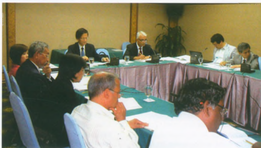
First meeting of the Office Bearers of ICA-AP University/Campus Coop Committee