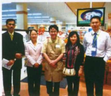
Managers of consumer co-ops at the Tokyo course 2009

India and Philippines learnt about history & basic values of Miyagi Co-op, present situation of Miyagi Co-op business and direction, planning & opening of co-op stores, sales promotion, merchandising strategy, purchasing policy and buyer education, home delivery business, member’s involvement in business.