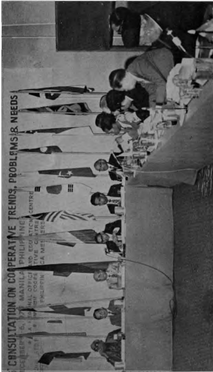
A view of the Experts' Consultation on the "Trends, Problems and Changing Needs of the Cooperative Movements and the Role of the ICA in this regard" held by the ROEC in Manila in December 1975.